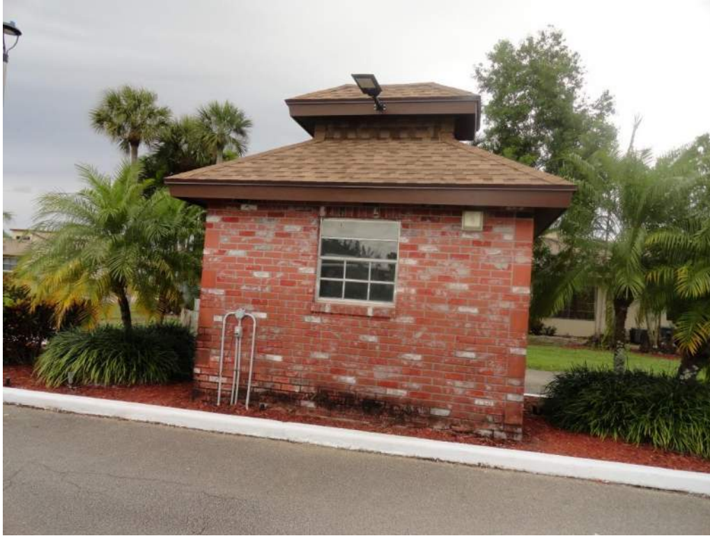
5. Roof Geometry – Left Elevation – Hip