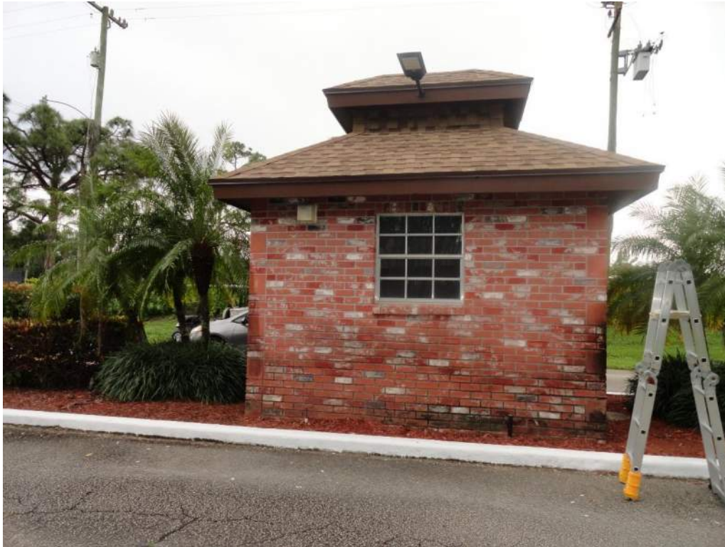
5. Roof Geometry – Right Elevation – Hip