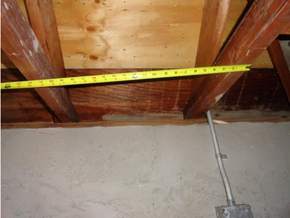
3. Roof Deck Attachment – Trusses at 24" O. C. Max.