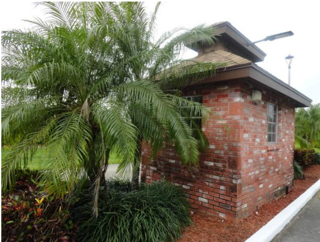
5. Roof Geometry – Front Elevation – Non-Hip