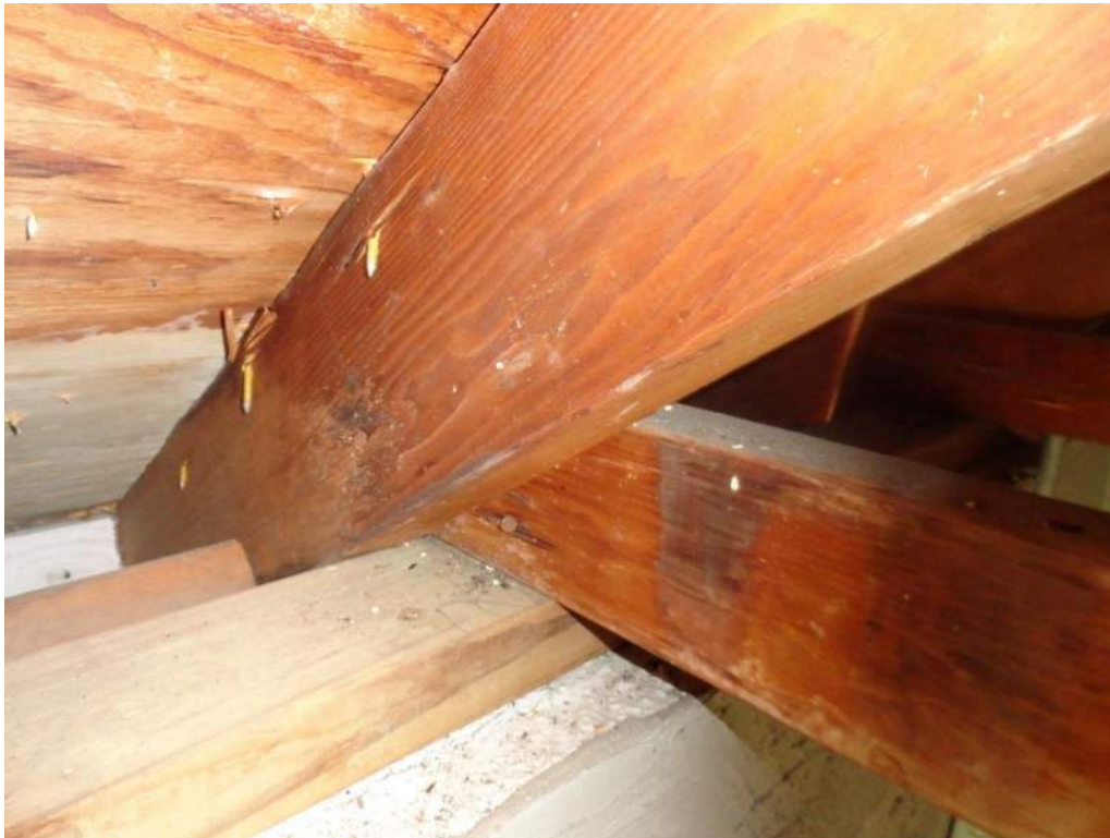
4. Roof to Wall Attachment – Toe Nails – Nails Driven at an Angle into the Top Plate