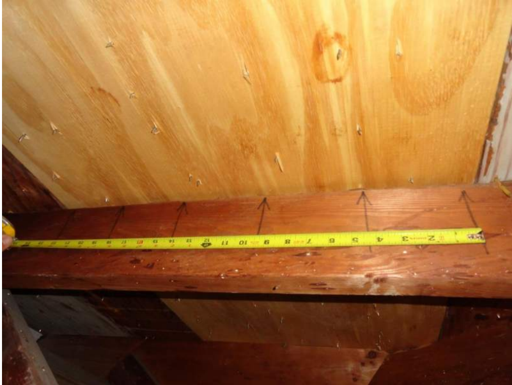
3. Roof Deck Attachment – Fasteners at 6" O. C. Max. In the Field