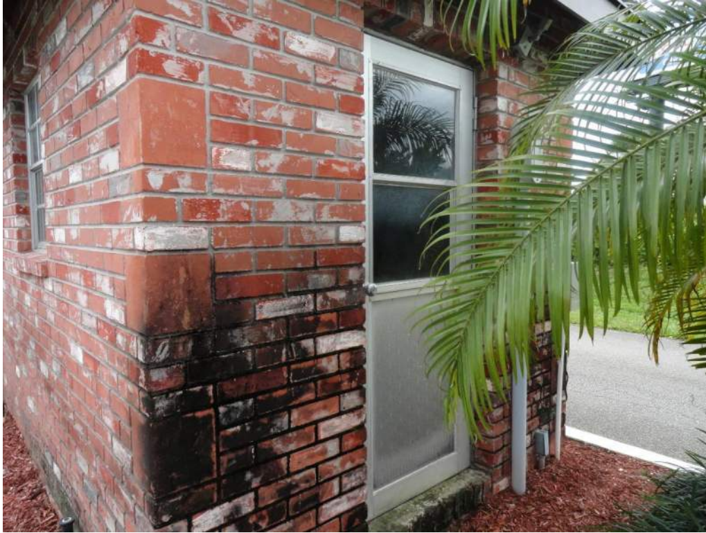
7. Opening Protection – Unprotected Unrated Glazed Entry Door