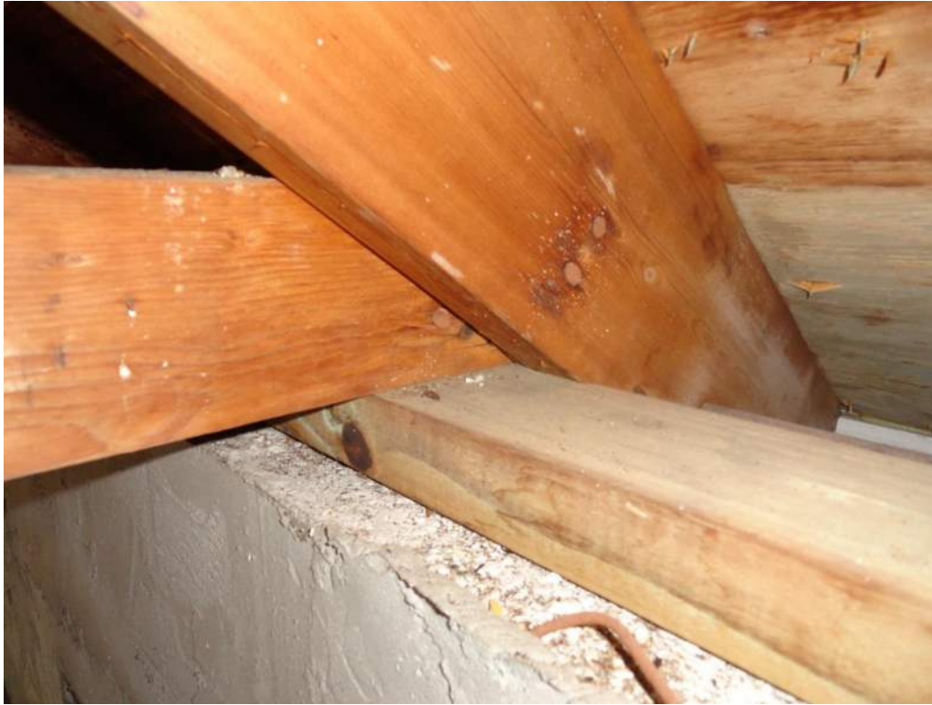
4. Roof to Wall Attachment – Toe Nails – Nails Driven at an Angle into the Top Plate