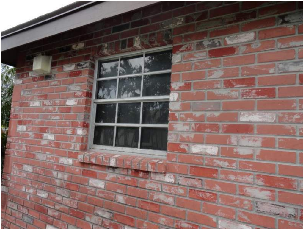
7. Opening Protection – Unprotected Unrated Windows