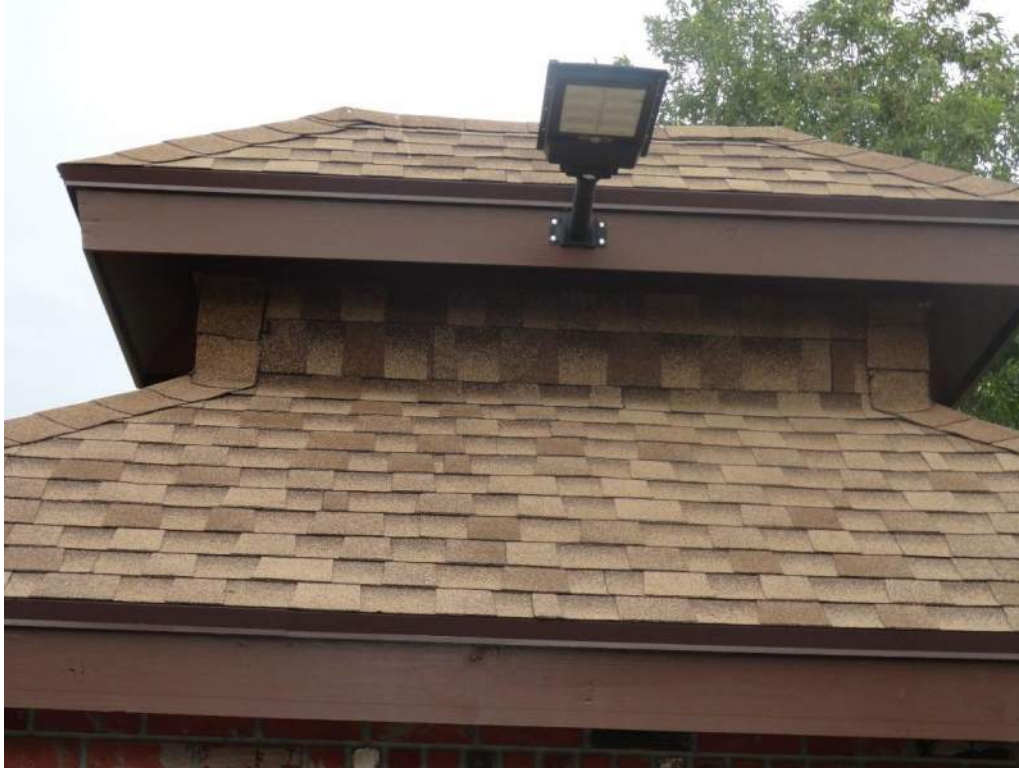
2. Roof Covering – Asphalt Shingles