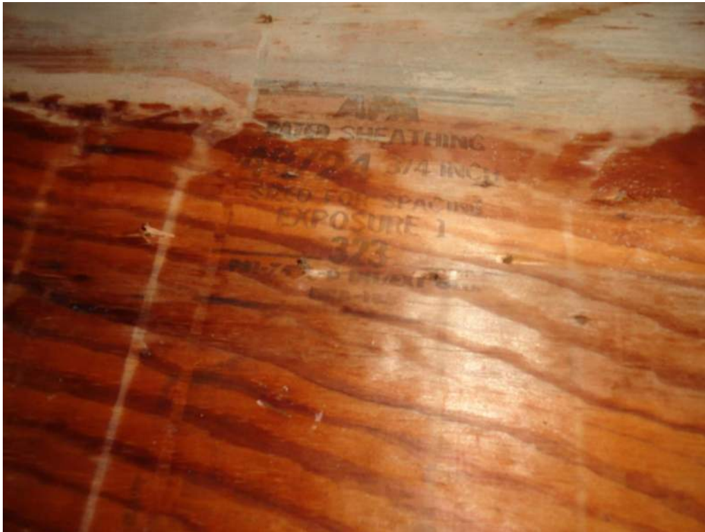
3. Roof Deck Attachment – 3/4" Plywood