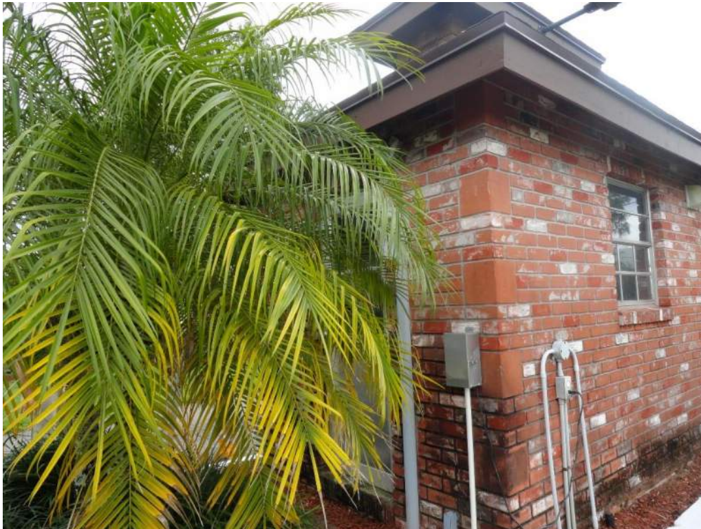
5. Roof Geometry – Rear Elevation – Hip