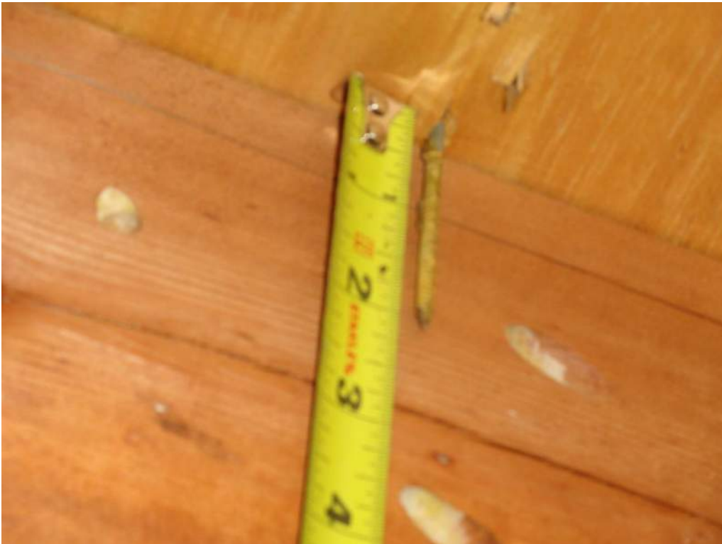
3. Roof Deck Attachment – 8d Nails