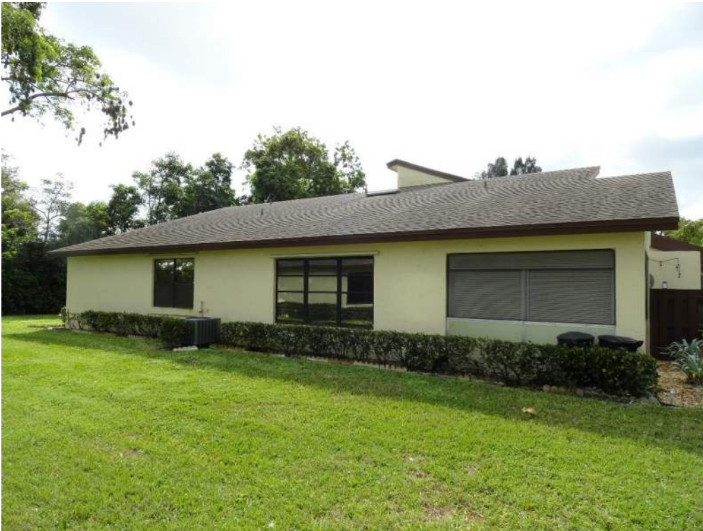
5. Roof Geometry – Left Elevation – Non-Hip