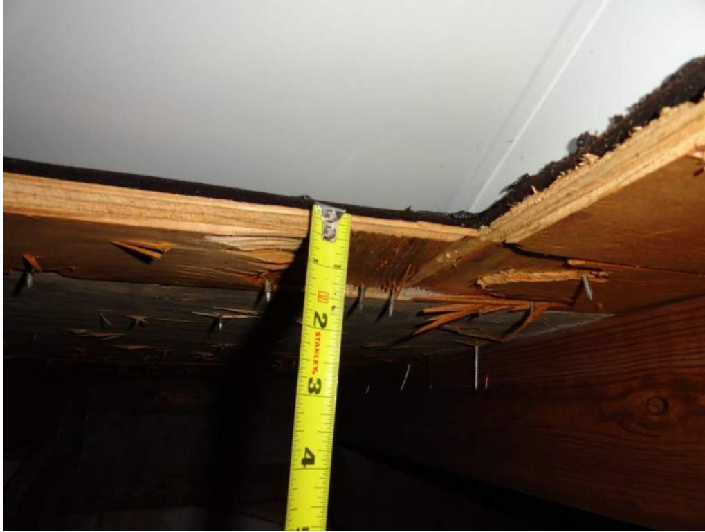
3. Roof Deck Attachment – 5/8" Plywood