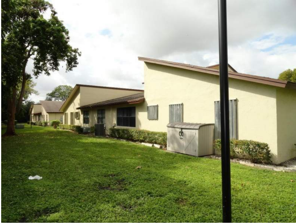
5. Roof Geometry – Rear Elevation – Non-Hip