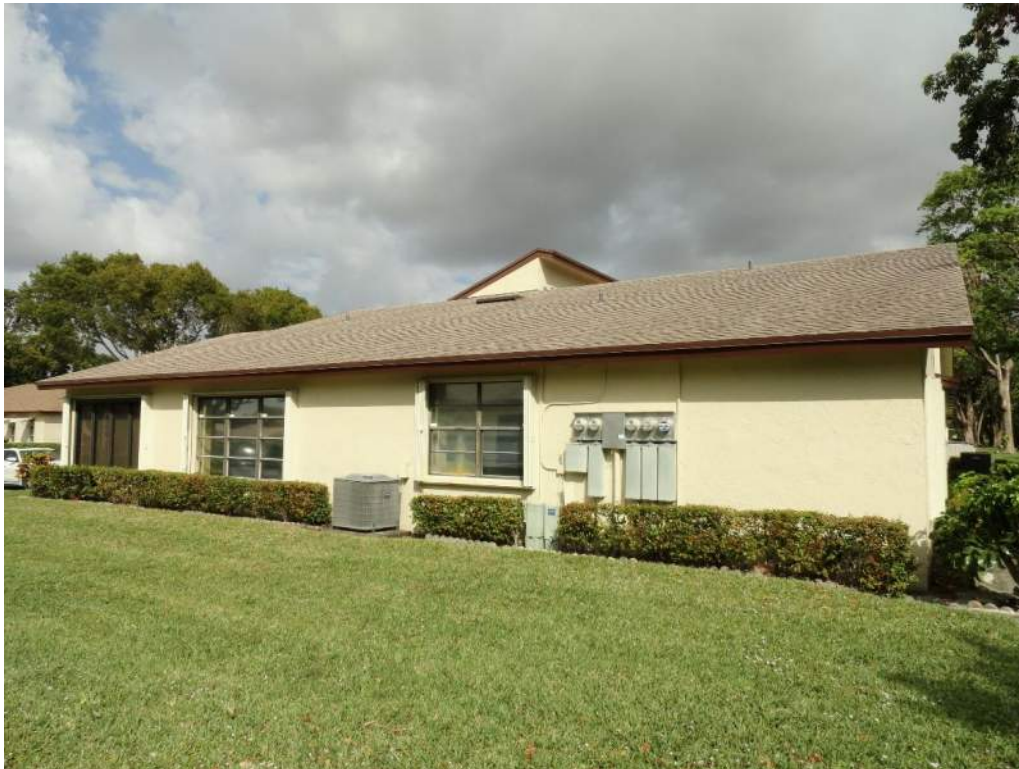
5. Roof Geometry – Right Elevation – Non-Hip