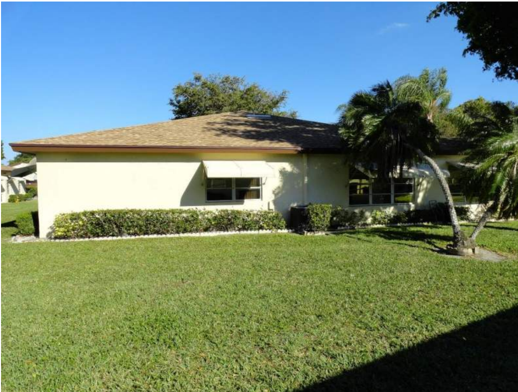
5. Roof Geometry – Left Elevation – Hip