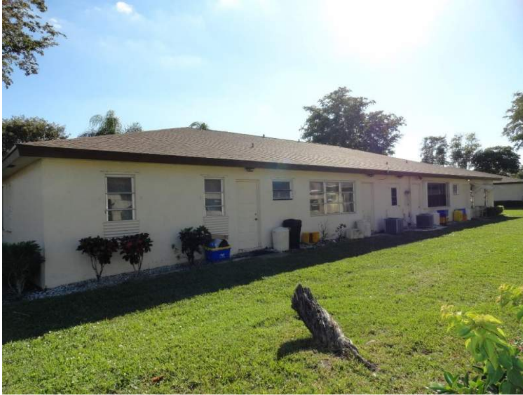
5. Roof Geometry – Rear Elevation – Hip