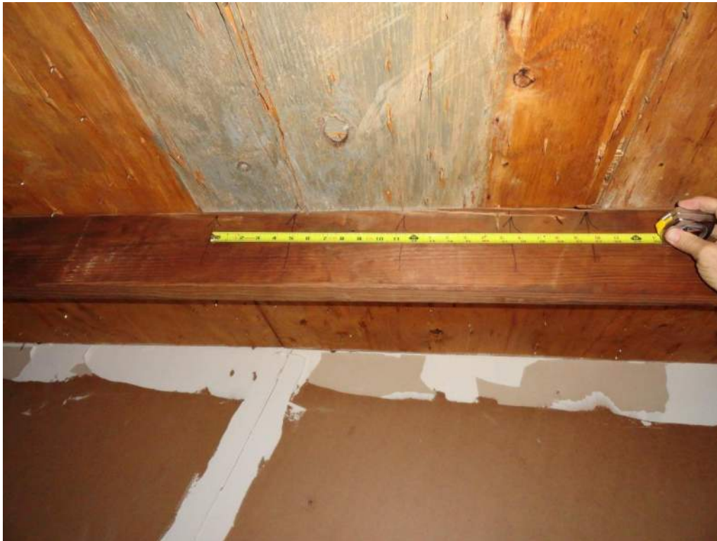
3. Roof Deck Attachment – Fasteners at 6" O. C. Max. In the Field