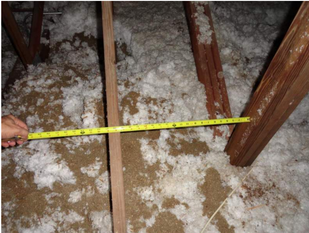
3. Roof Deck Attachment – Trusses at 24" O. C. Max.