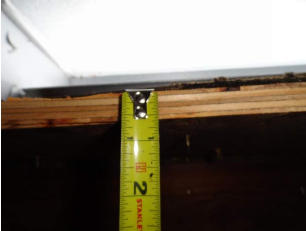
3. Roof Deck Attachment – 5/8" Plywood