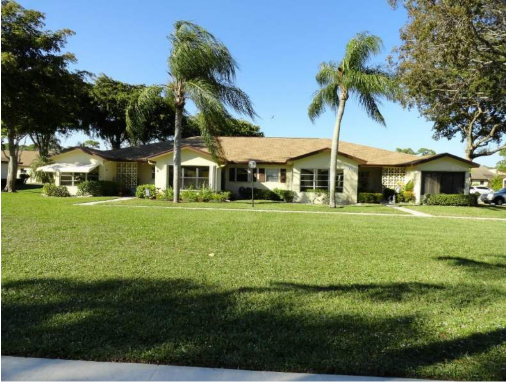
5. Roof Geometry – Front Elevation – Non-Hip