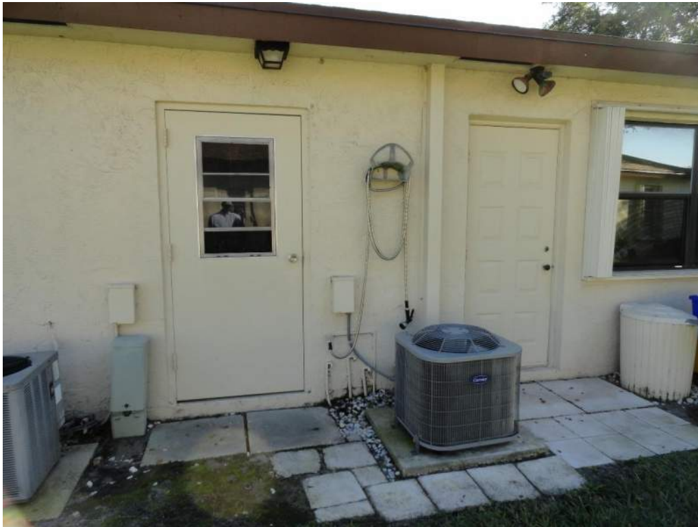
7. Opening Protection – Unprotected Unrated Unglazed Entry Door