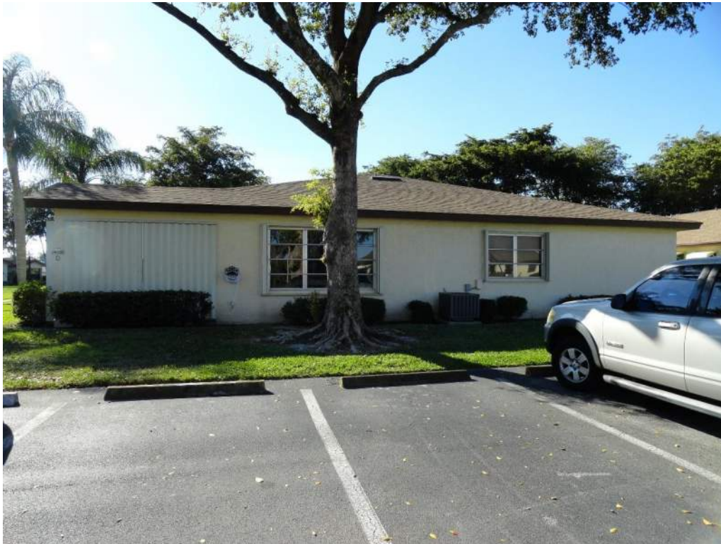
5. Roof Geometry – Right Elevation – Hip