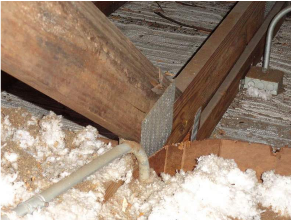
4. Roof to Wall Attachment – Single Wraps – Steel Straps w/ 1 Nail Min. at Back