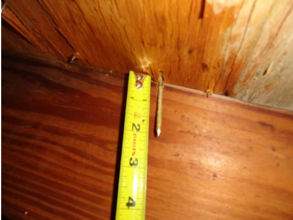
3. Roof Deck Attachment – 8d Nails