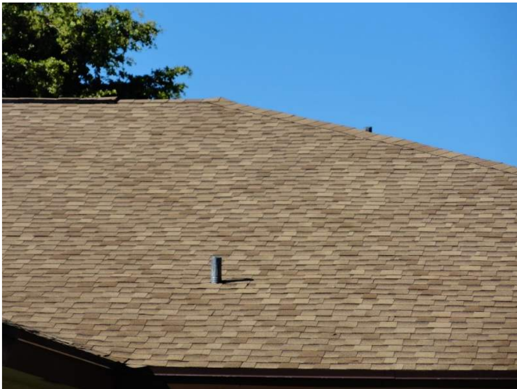
2. Roof Covering – Asphalt Shingles