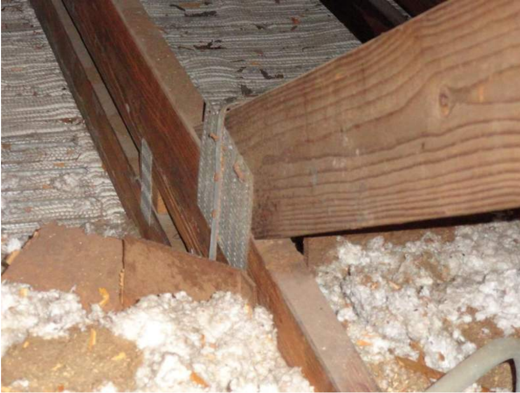
4. Roof to Wall Attachment – Single Wraps – Steel Straps w/ 2 Nails Min. at Face