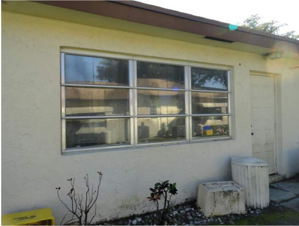
7. Opening Protection – Unprotected Unrated Windows