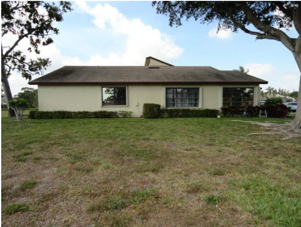
5. Roof Geometry – Left Elevation – Non-Hip