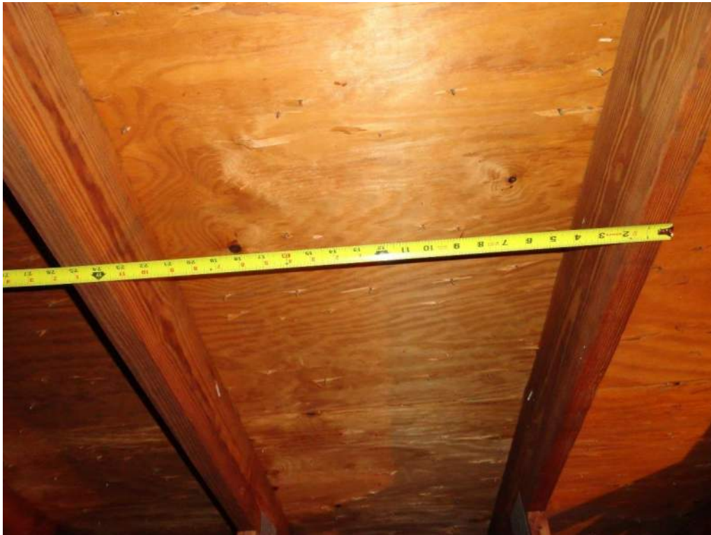
3. Roof Deck Attachment – Trusses at 24" O. C. Max.