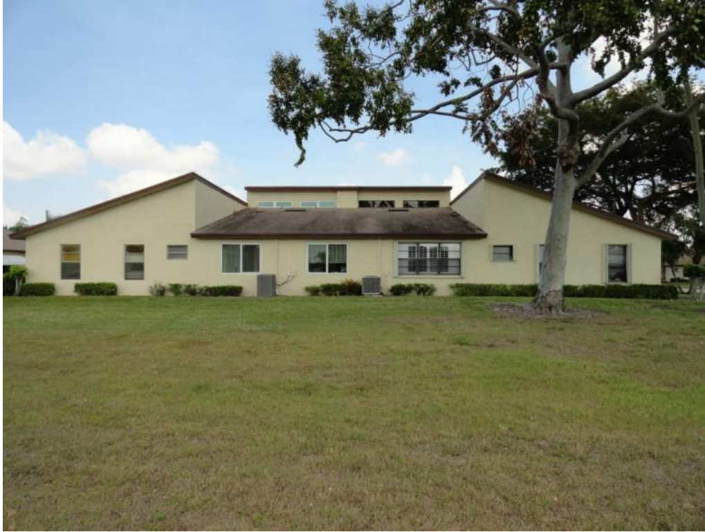
5. Roof Geometry – Rear Elevation – Non-Hip