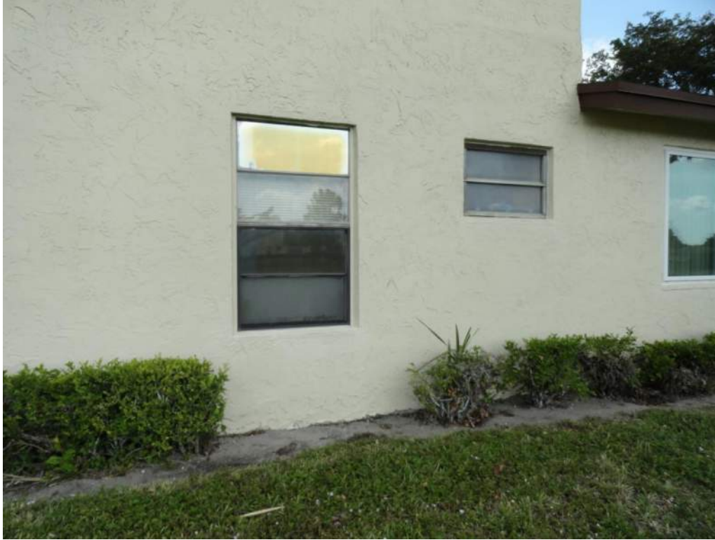
7. Opening Protection – Unrated Unprotected Windows