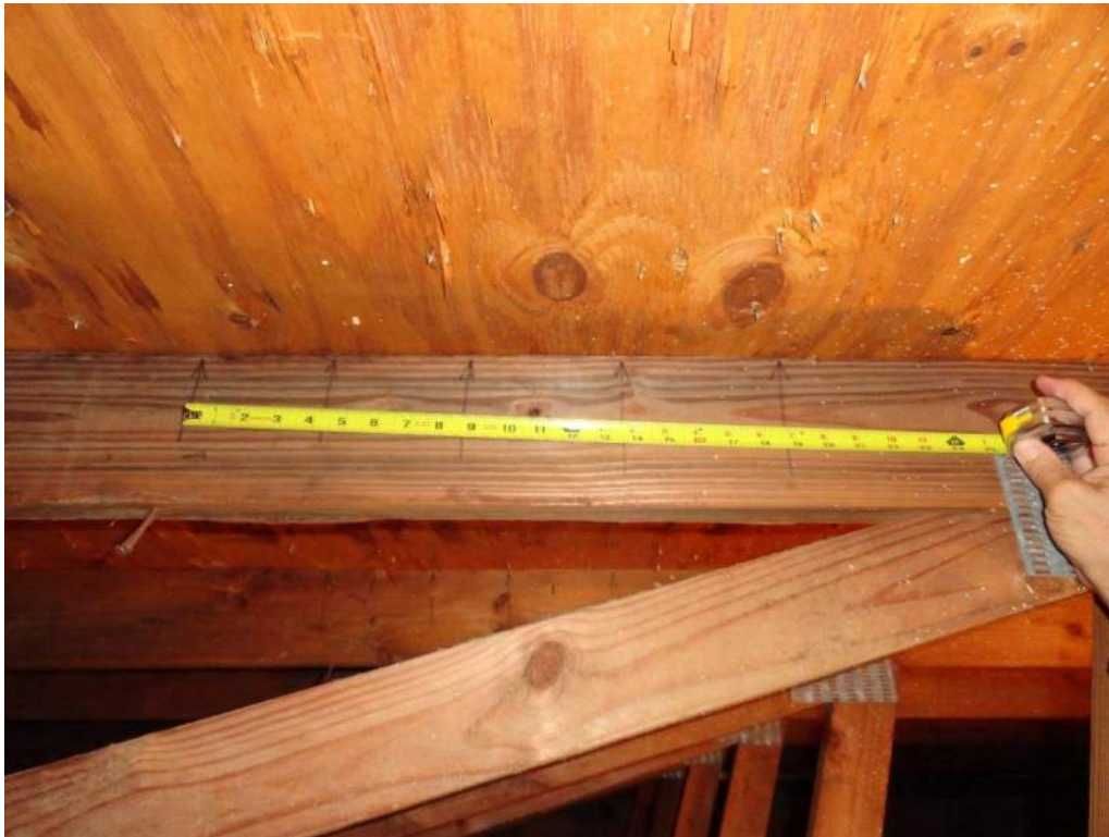
3. Roof Deck Attachment – Fasteners at 6" O. C. Max. In the Field