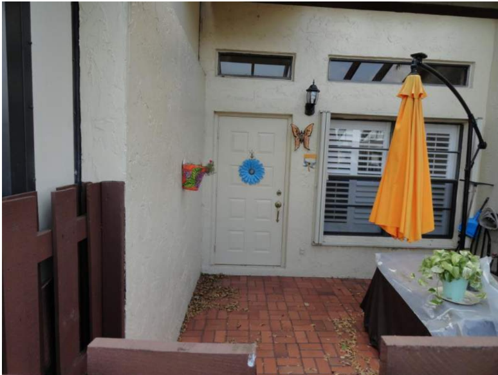
7. Opening Protection – Unprotected Unrated Unglazed Entry Door