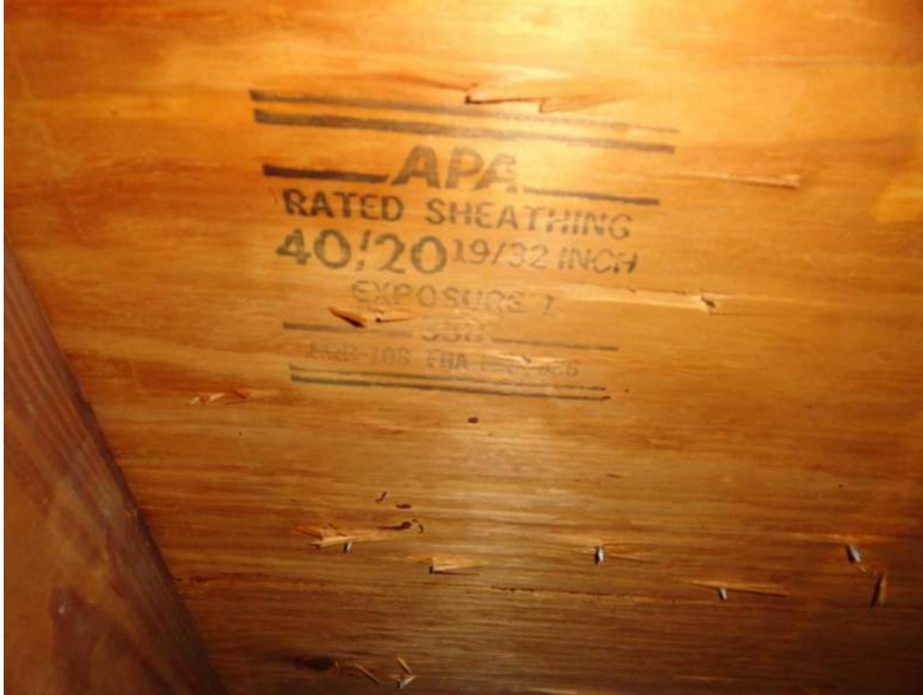
3. Roof Deck Attachment – 19/32" Plywood