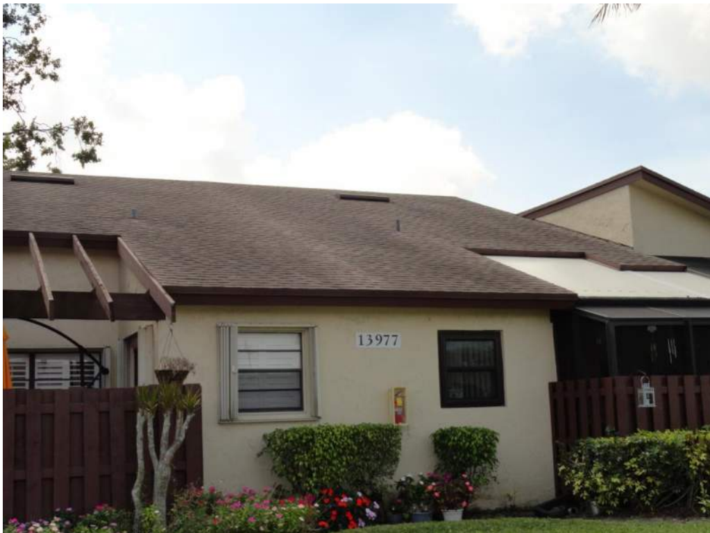
2. Roof Covering – Asphalt Shingles