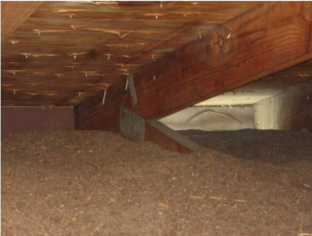
4. Roof to Wall Attachment – Single Wraps – Steel Straps w/ 1 Nail Min. at Back