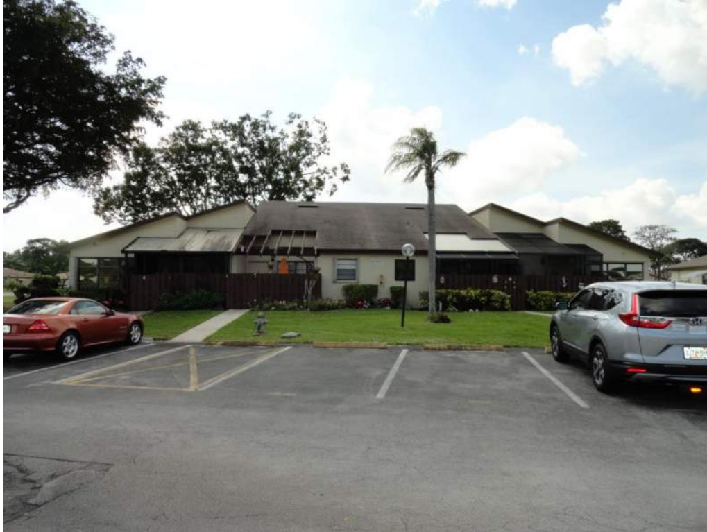
5. Roof Geometry – Front Elevation – Non-Hip