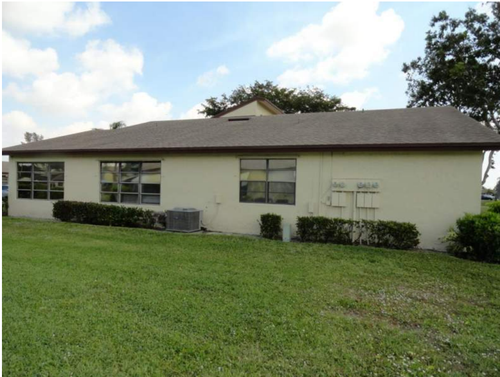
5. Roof Geometry – Right Elevation – Non-Hip