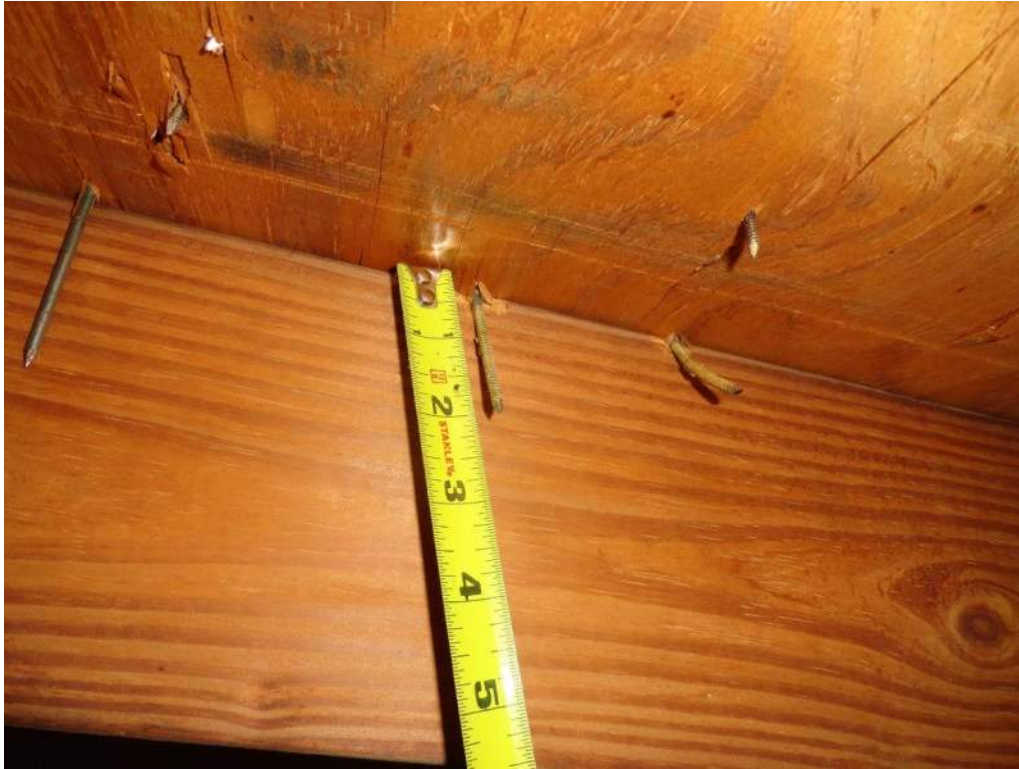
3. Roof Deck Attachment – 8d Nails