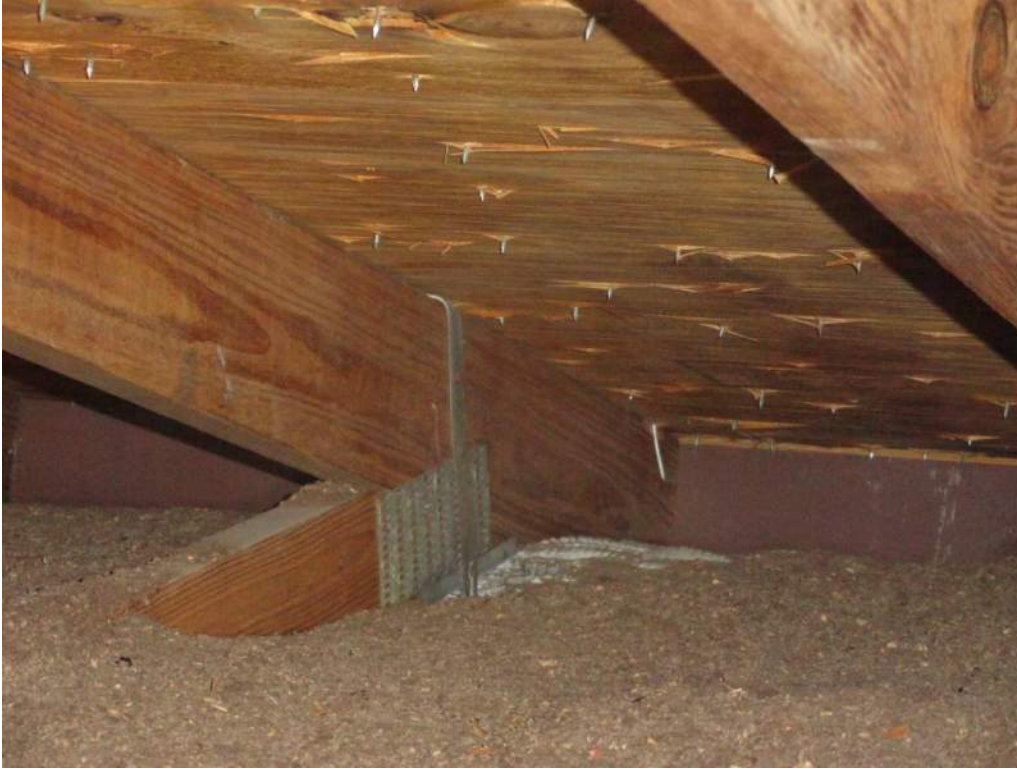
4. Roof to Wall Attachment – Single Wraps – Steel Straps w/ 2 Nails Min. at Face