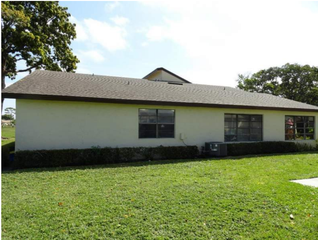
5. Roof Geometry – Left Elevation – Non-Hip