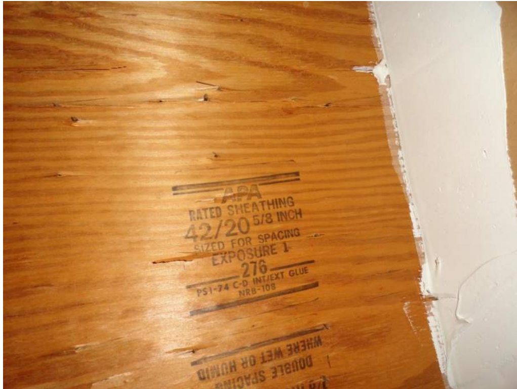
3. Roof Deck Attachment – 5/8" Plywood