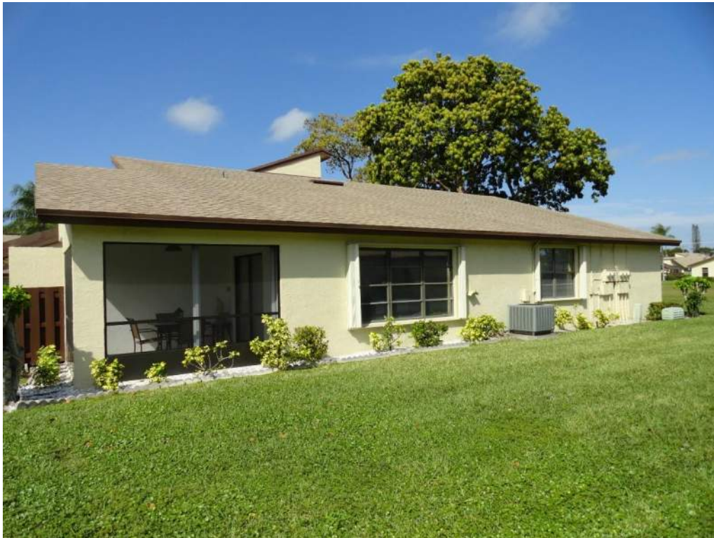
5. Roof Geometry – Right Elevation – Non-Hip