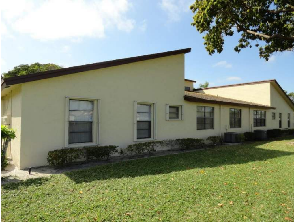
5. Roof Geometry – Rear Elevation – Non-Hip