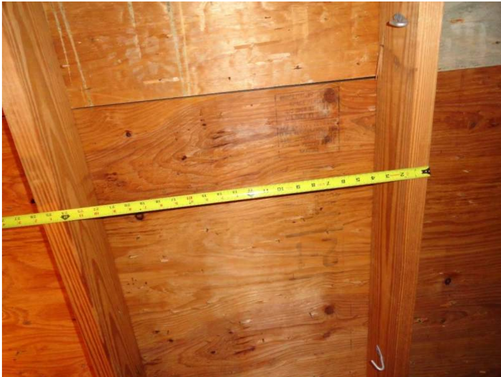
3. Roof Deck Attachment – Trusses at 24" O. C. Max.