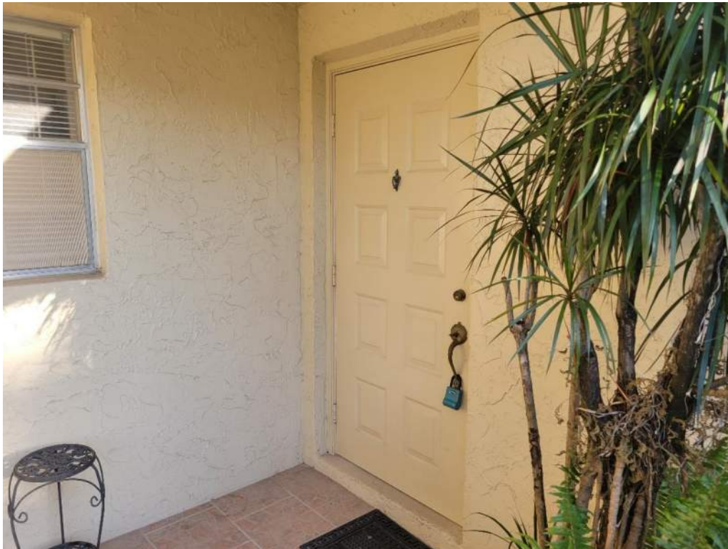
7. Opening Protection – Unprotected Unrated Unglazed Entry Door