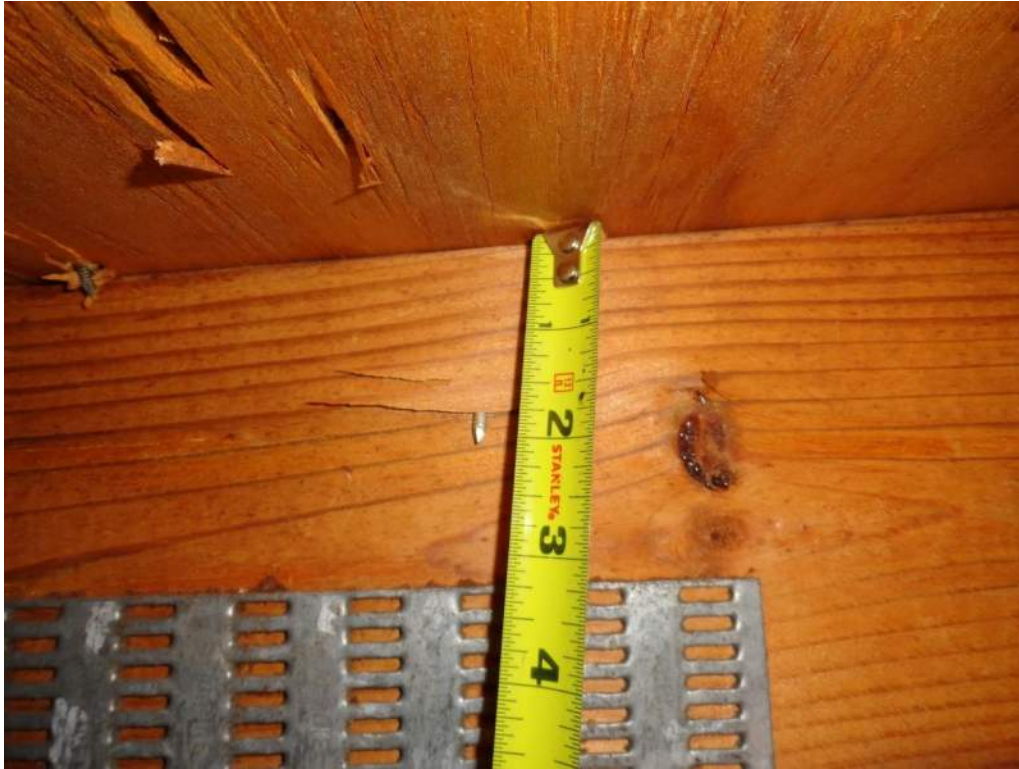
3. Roof Deck Attachment – 8d Nails