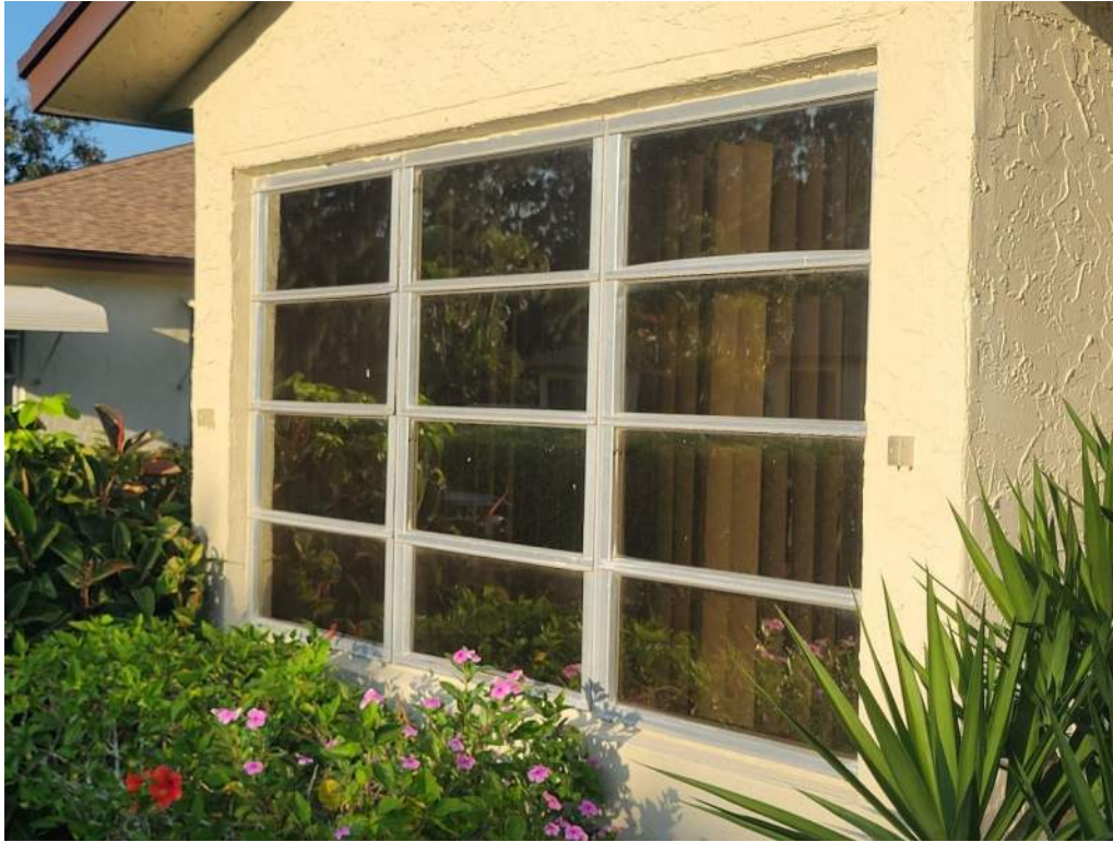
7. Opening Protection – Unrated Unprotected Windows