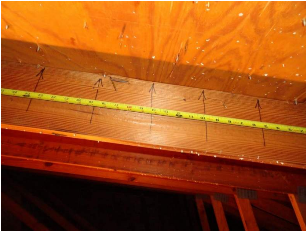
3. Roof Deck Attachment – Fasteners at 6" O. C. Max. In the Field