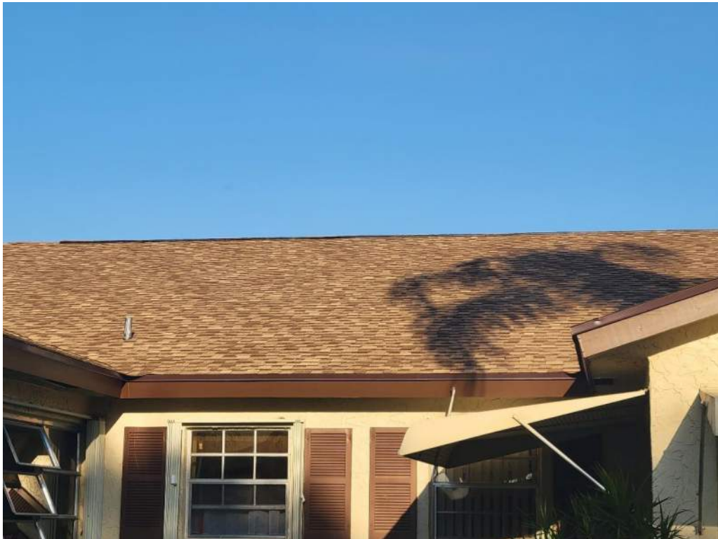
2. Roof Covering – Asphalt Shingles