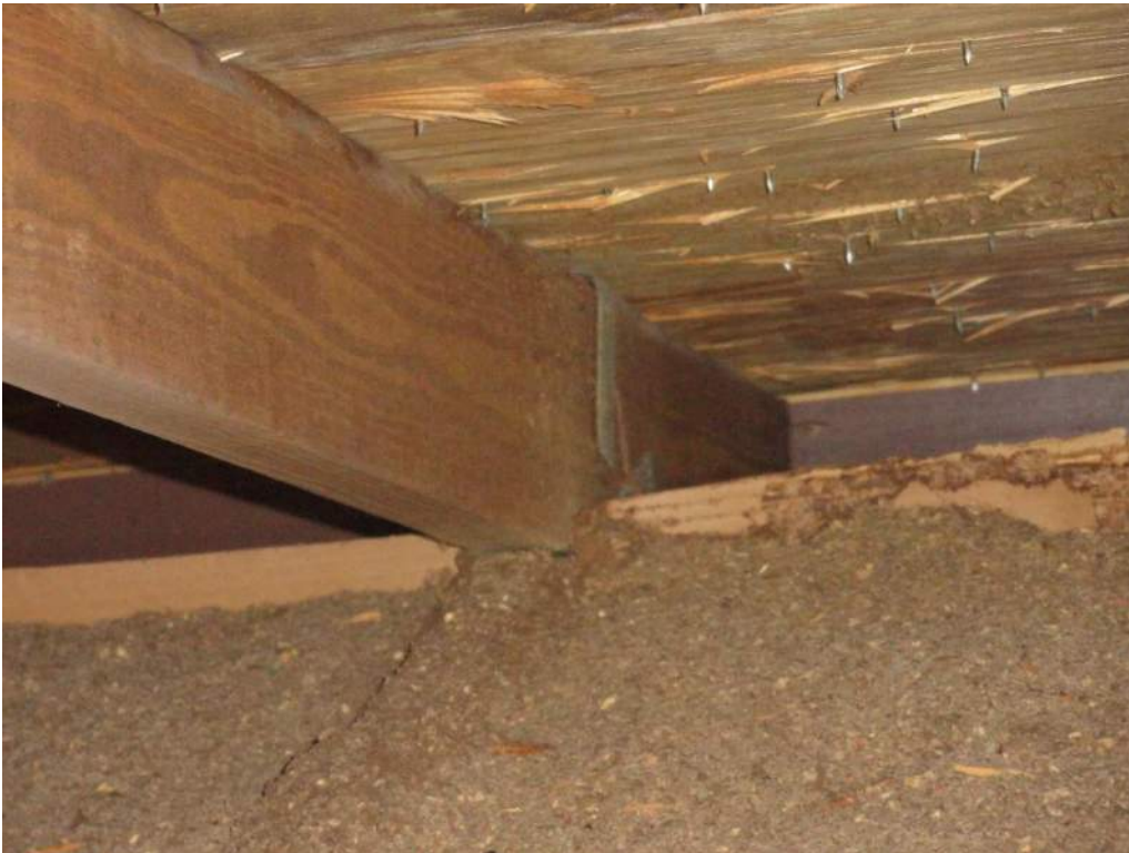
4. Roof to Wall Attachment – Single Wraps – Steel Straps w/ 1 Nail Min. at Back