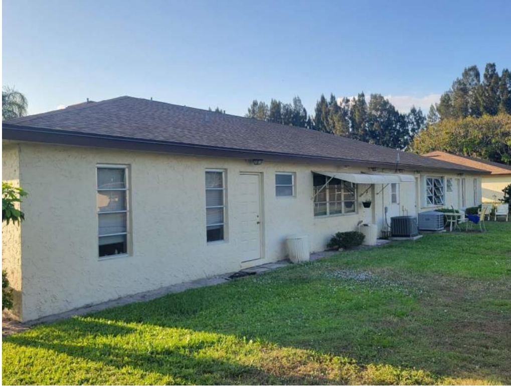
5. Roof Geometry – Rear Elevation – Hip