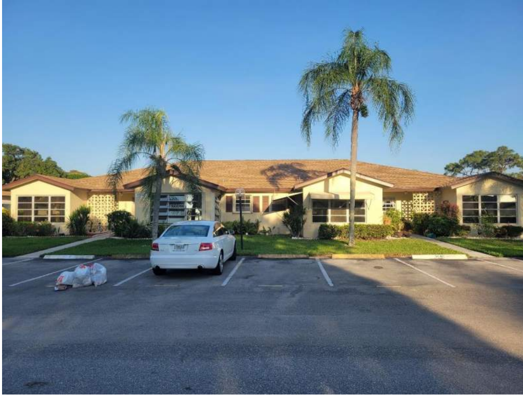
5. Roof Geometry – Front Elevation – Non-Hip