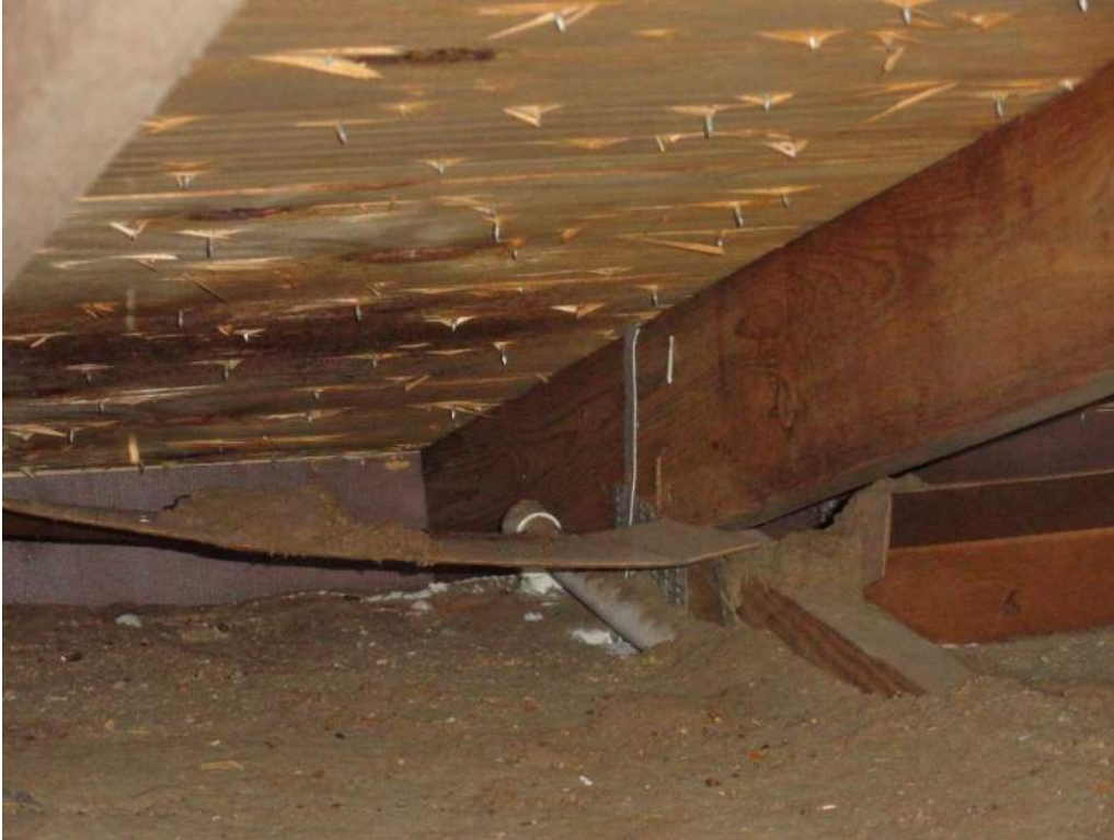
4. Roof to Wall Attachment – Single Wraps – Steel Straps w/ 2 Nails Min. at Face