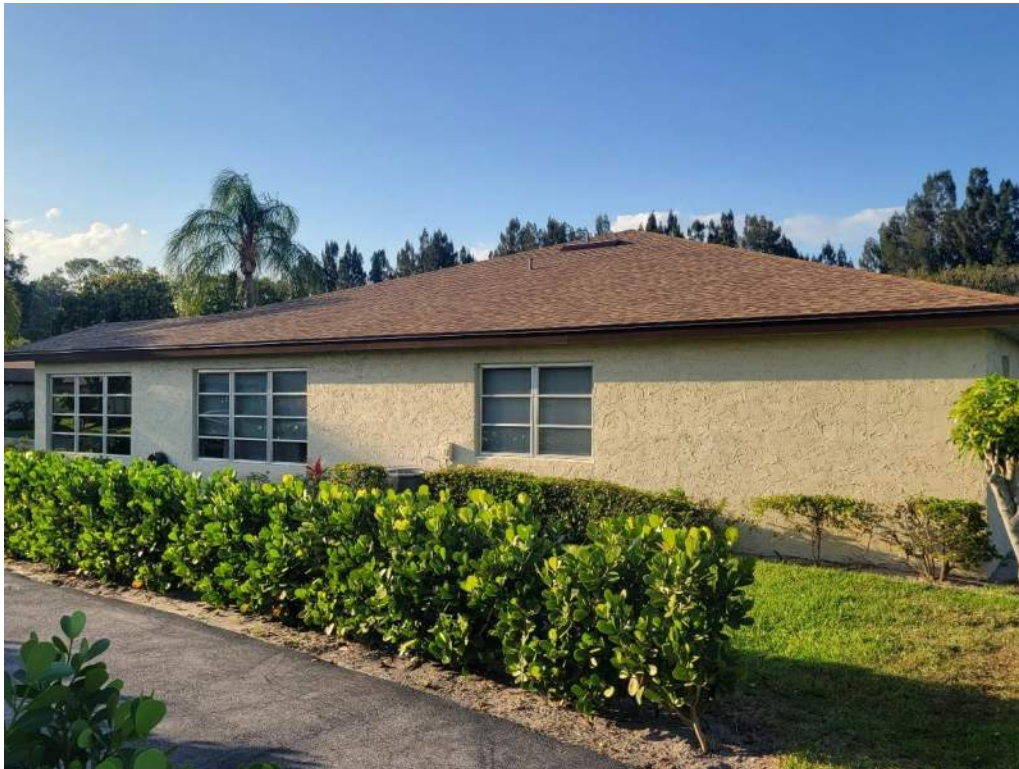
5. Roof Geometry – Right Elevation – Hip