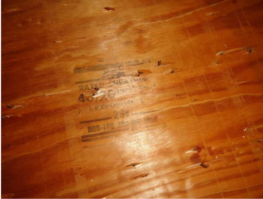
3. Roof Deck Attachment – 19/32" Plywood