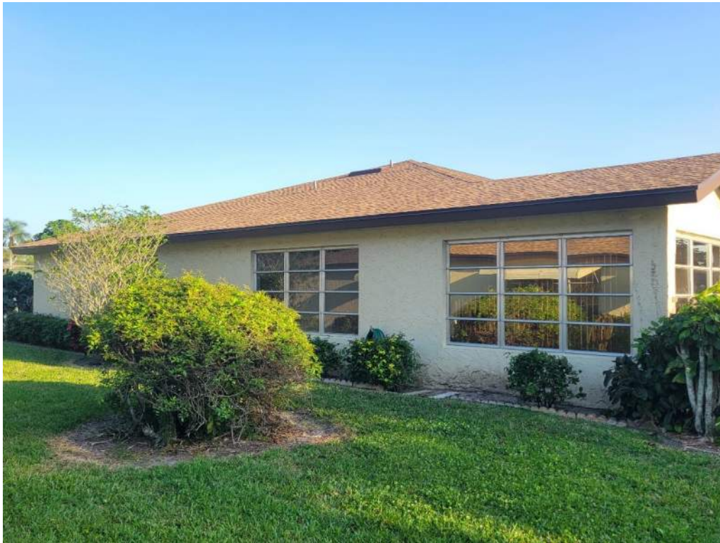
5. Roof Geometry – Left Elevation – Hip