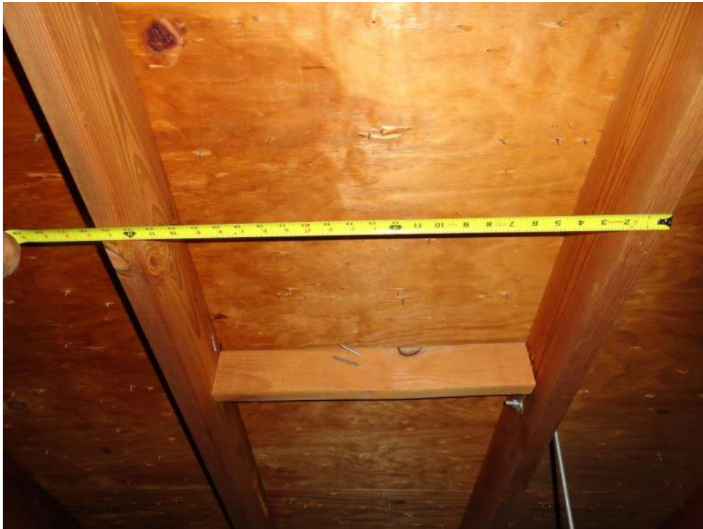
3. Roof Deck Attachment – Trusses at 24” O. C. Max.