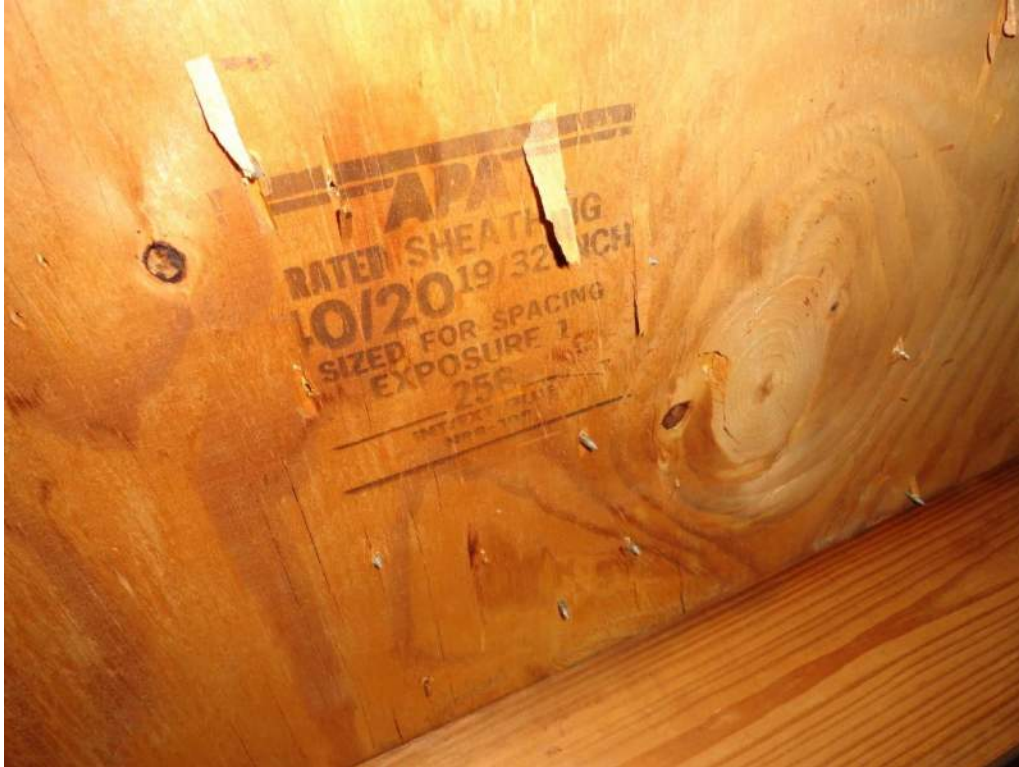
3. Roof Deck Attachment – 19/32” Plywood