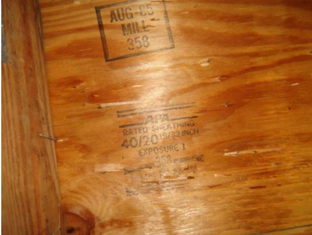
3. Roof Deck Attachment – 19/32" Plywood