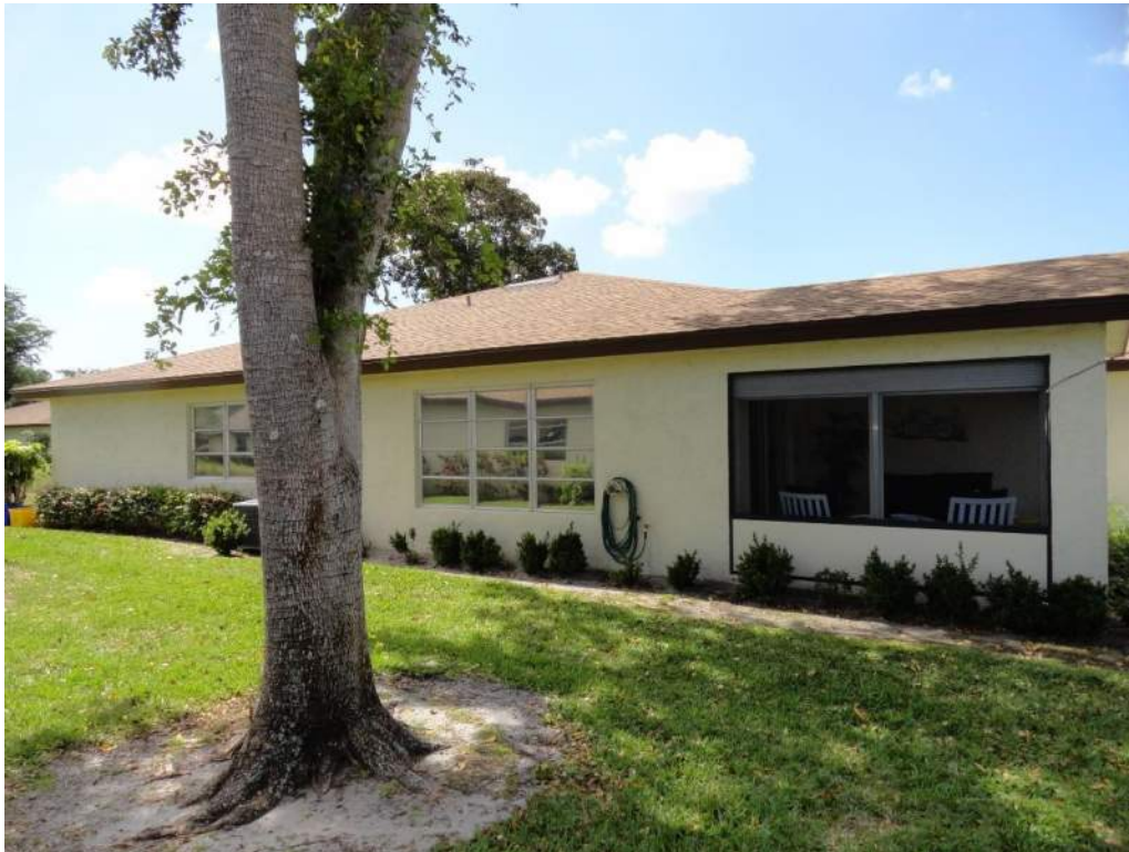
5. Roof Geometry – Left Elevation – Hip