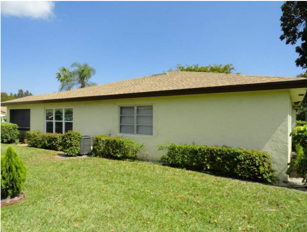
5. Roof Geometry – Right Elevation – Hip