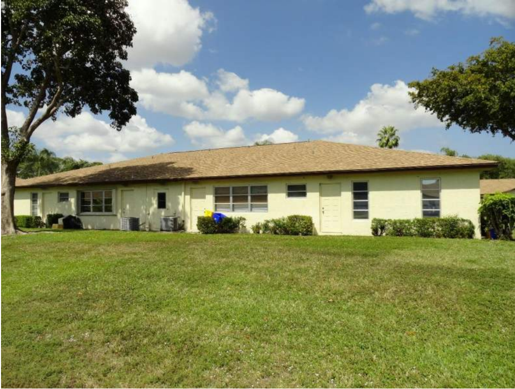
5. Roof Geometry – Rear Elevation – Hip