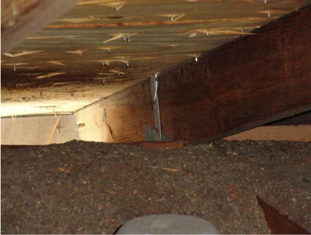
4. Roof to Wall Attachment – Single Wraps – Steel Straps w/ 2 Nails Min. at Face