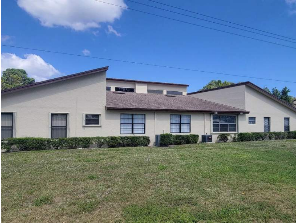
5. Roof Geometry – Rear Elevation – Hip