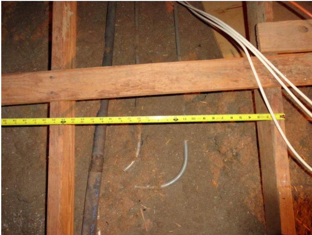
3. Roof Deck Attachment – Trusses at 24" O. C. Max.