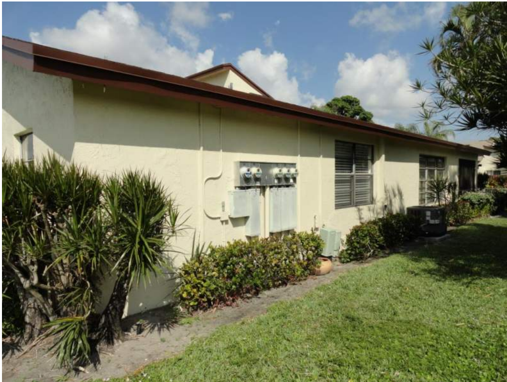
5. Roof Geometry – Left Elevation – Hip