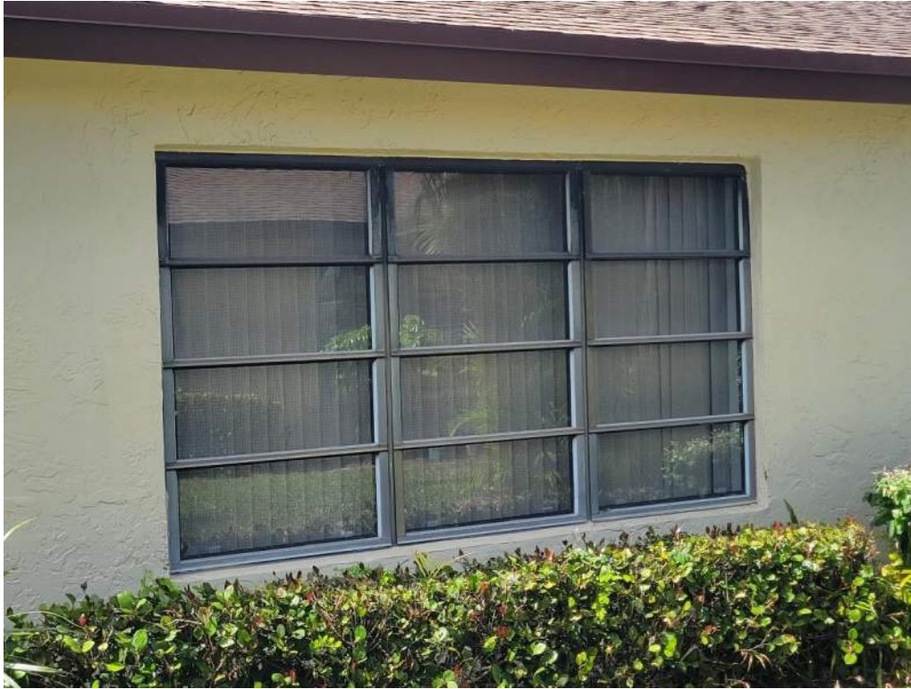
7. Opening Protection – Unrated Unprotected Windows