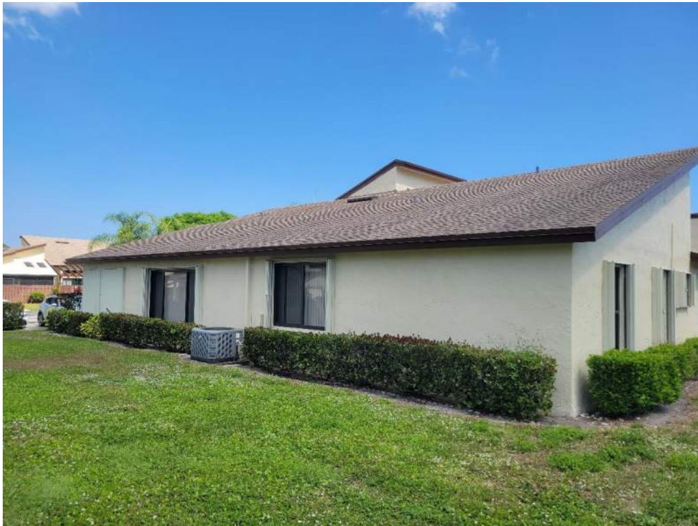
5. Roof Geometry – Right Elevation – Hip