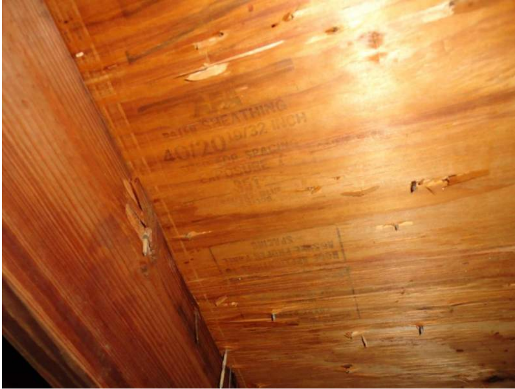
3. Roof Deck Attachment – 19/32" Plywood