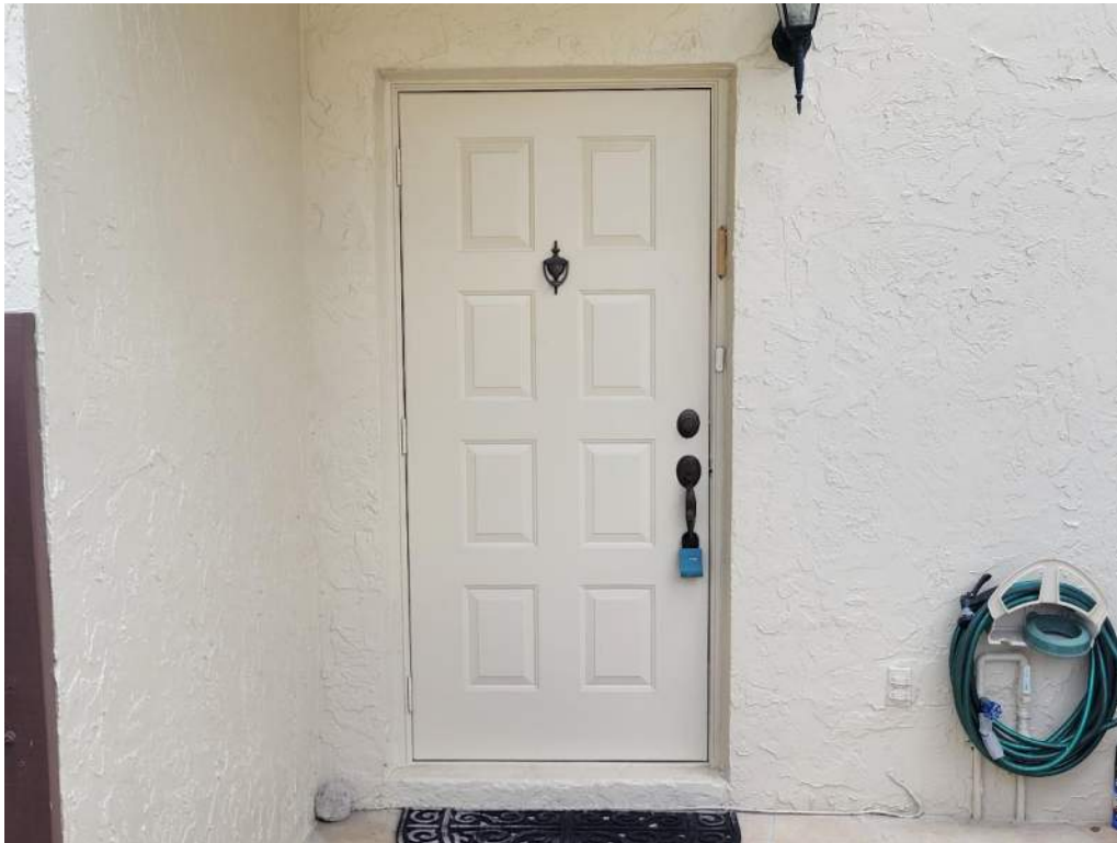
7. Opening Protection – Unprotected Unrated Unglazed Entry Door