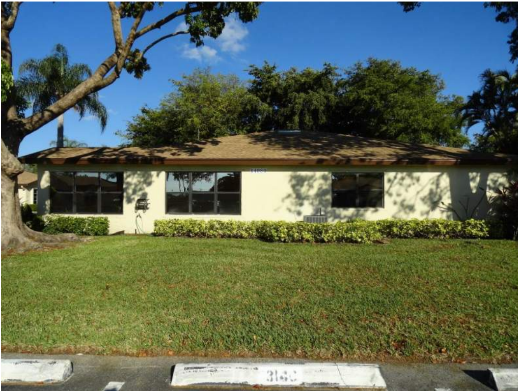
5. Roof Geometry – Right Elevation – Hip