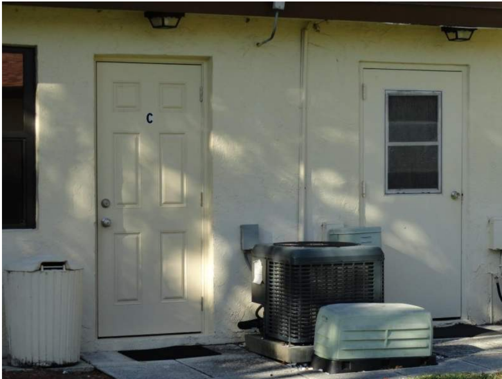
7. Opening Protection – Unprotected Unrated Unglazed Entry Door