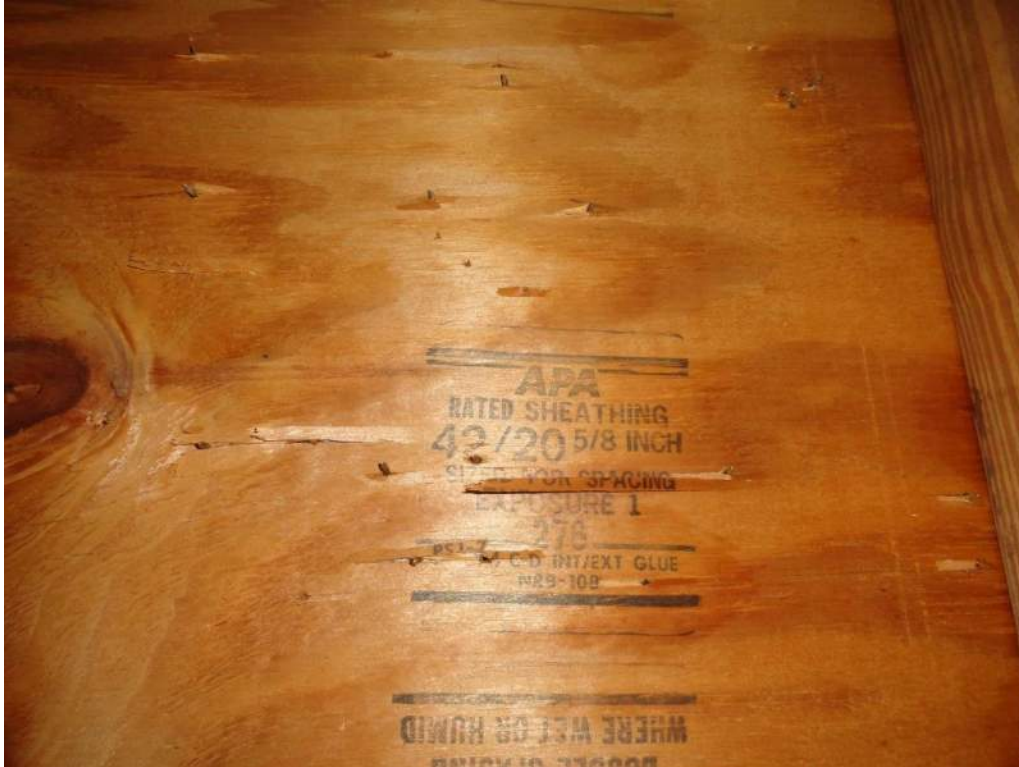
3. Roof Deck Attachment – 5/8" Plywood