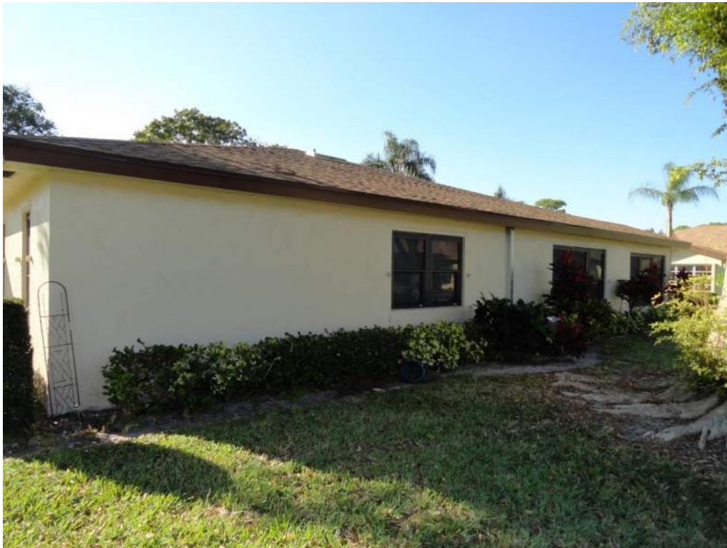
5. Roof Geometry – Left Elevation – Hip