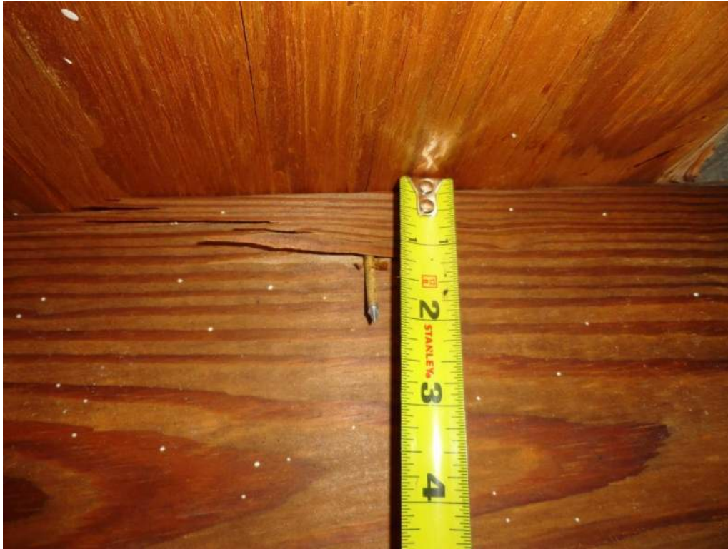
3. Roof Deck Attachment – 8d Nails