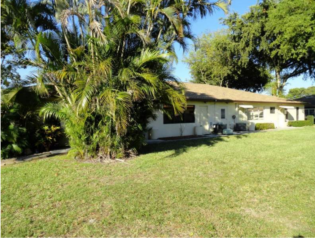
5. Roof Geometry – Rear Elevation – Hip