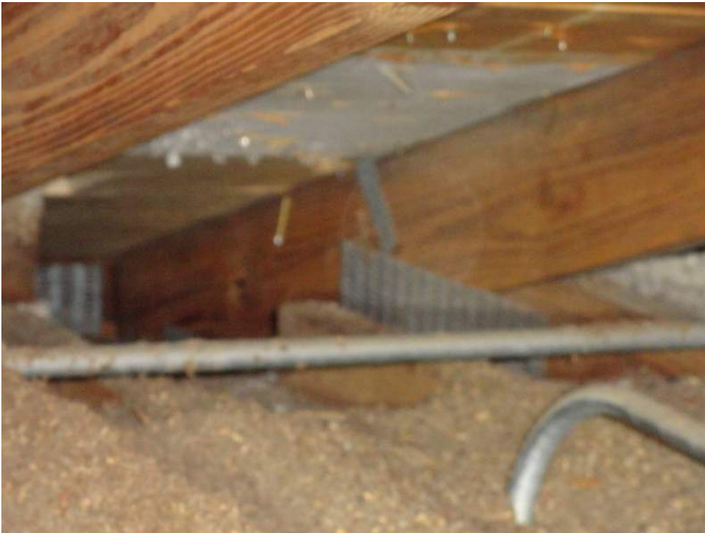
4. Roof to Wall Attachment – Single Wraps – Steel Straps w/ 1 Nail Min. at Back