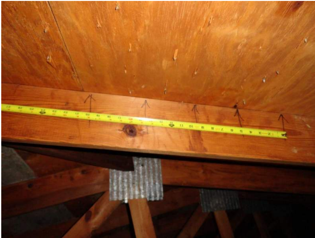
3. Roof Deck Attachment – Fasteners at 6" O. C. Max. In the Field