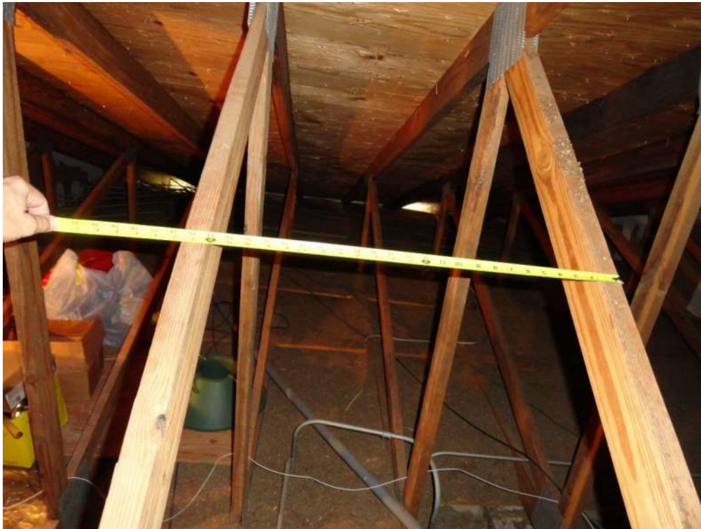
3. Roof Deck Attachment – Trusses at 24" O. C. Max.