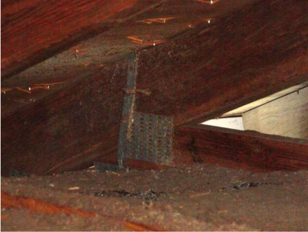
4. Roof to Wall Attachment – Single Wraps – Steel Straps w/ 2 Nails Min. at Face