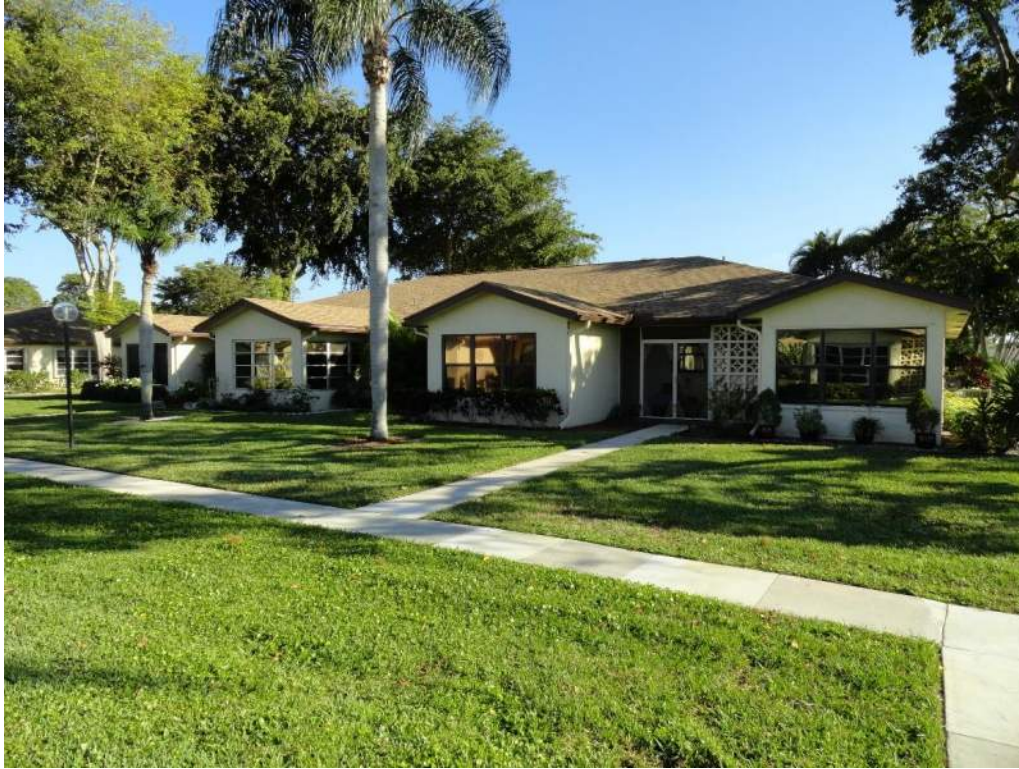
5. Roof Geometry – Front Elevation – Non-Hip