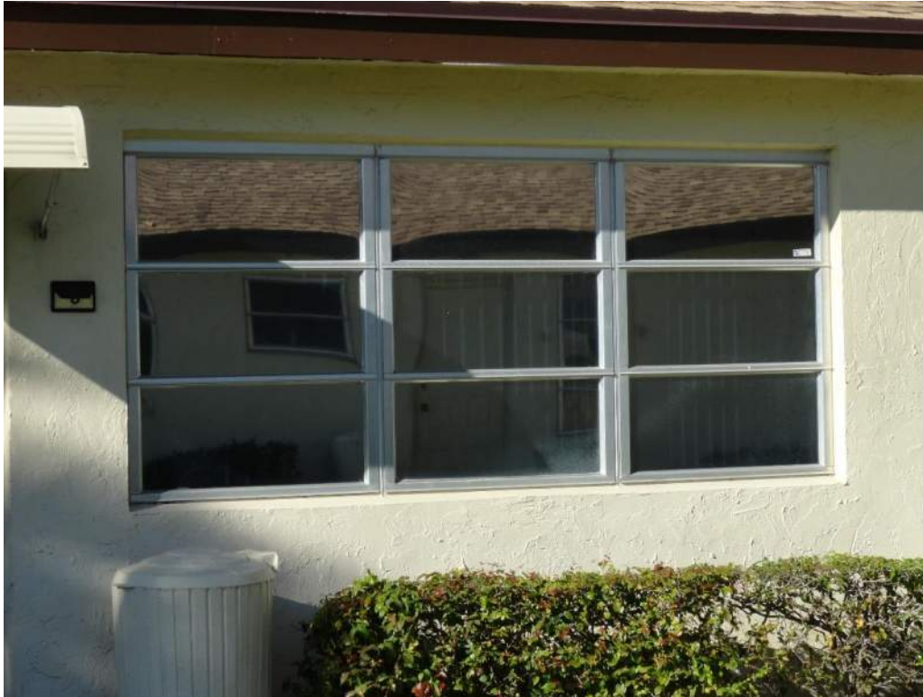
7. Opening Protection – Unrated Unprotected Windows