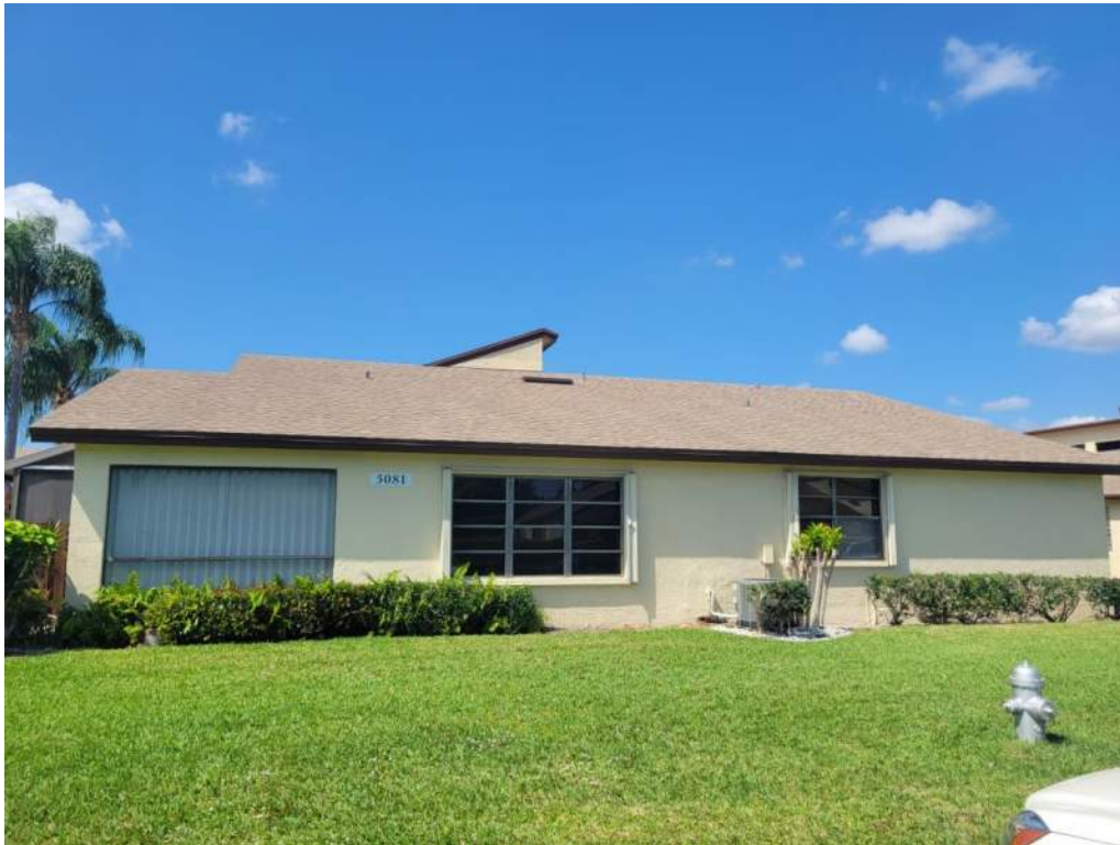
5. Roof Geometry – Right Elevation – Non-Hip