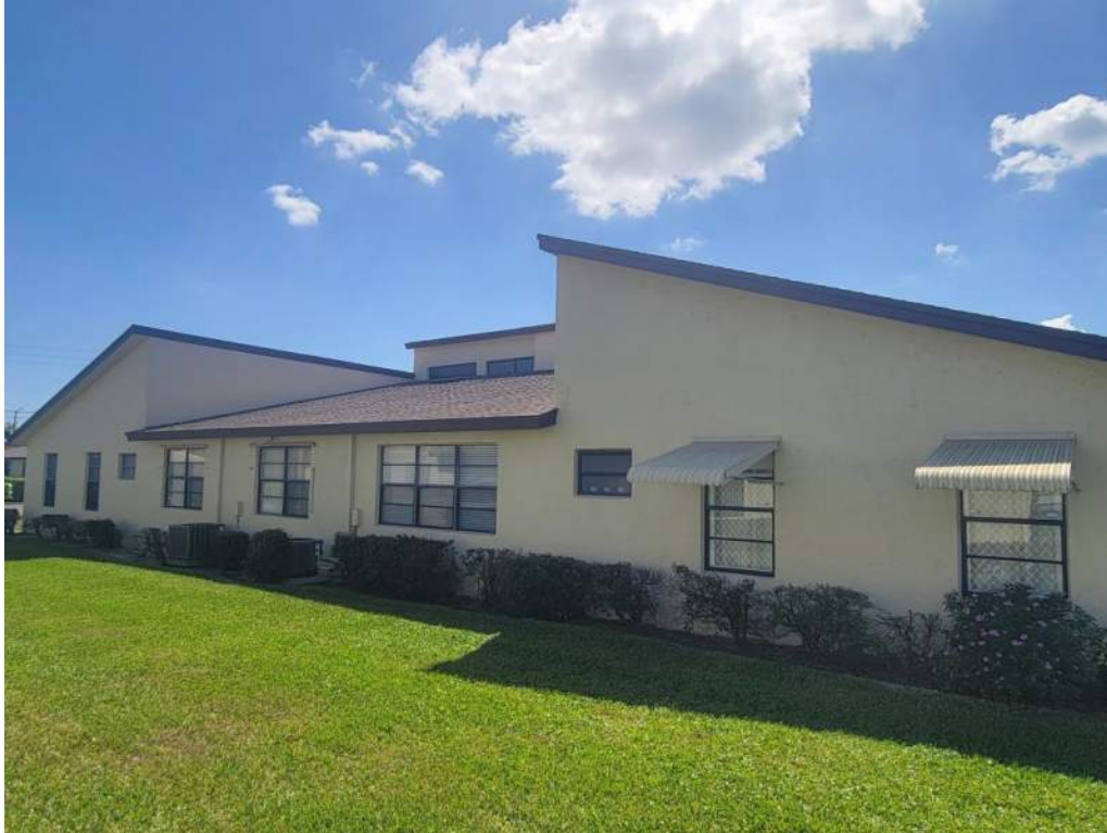
5. Roof Geometry – Rear Elevation – Non-Hip