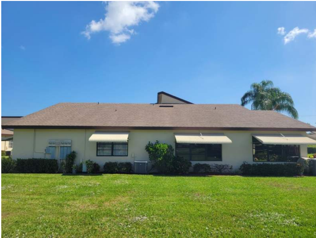
5. Roof Geometry – Left Elevation – Non-Hip