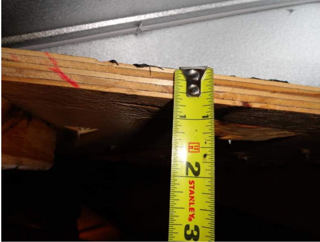
3. Roof Deck Attachment – 5/8" Plywood