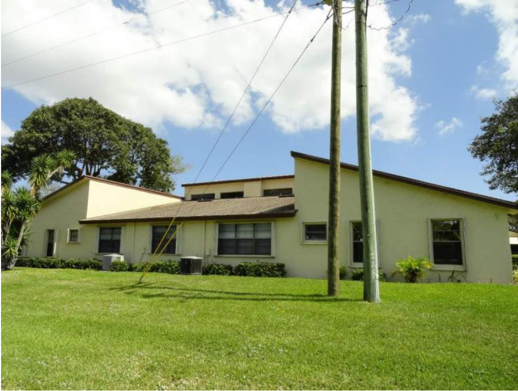
5. Roof Geometry – Rear Elevation – Non-Hip