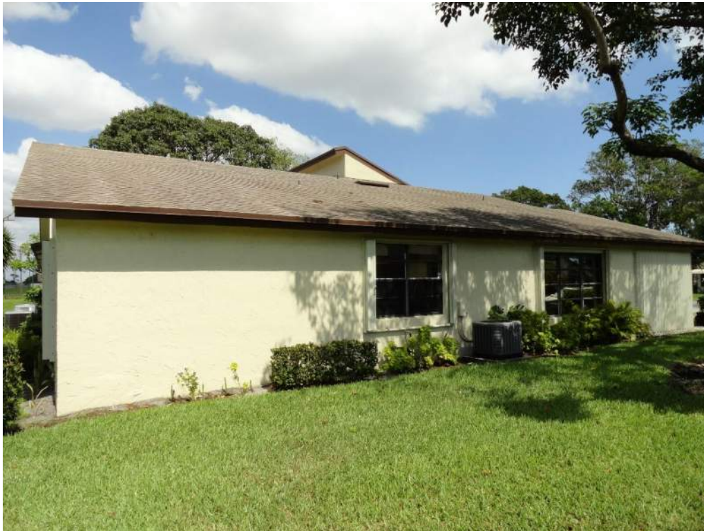
5. Roof Geometry – Left Elevation – Non-Hip