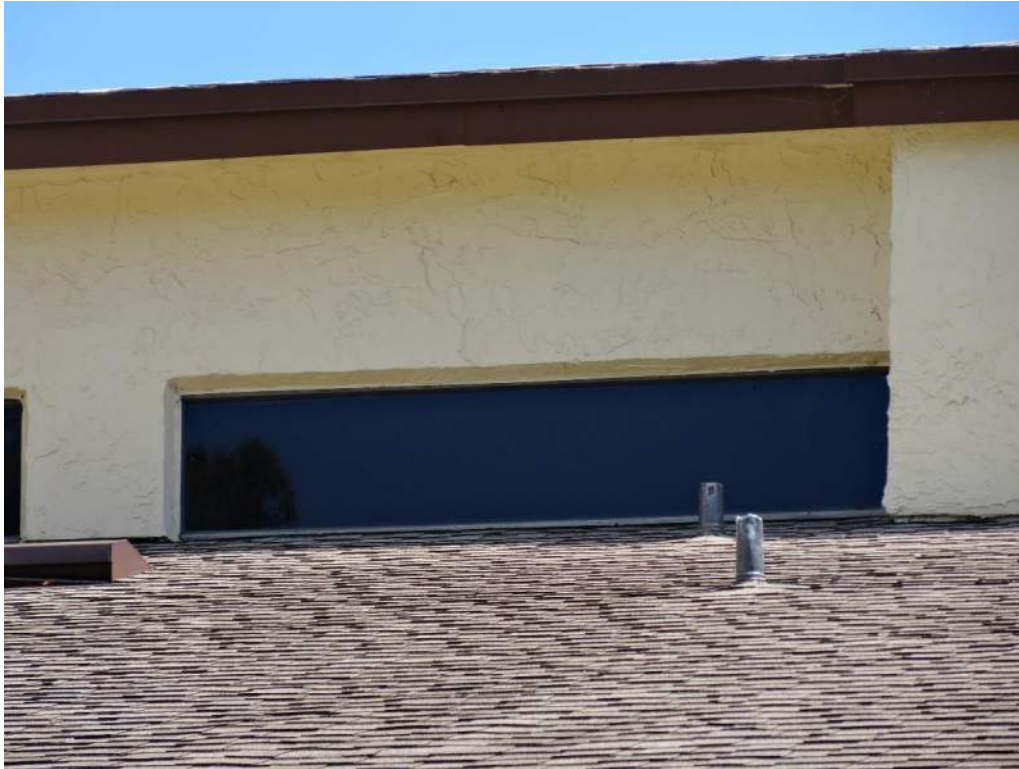
7. Opening Protection – Unprotected Unrated Windows