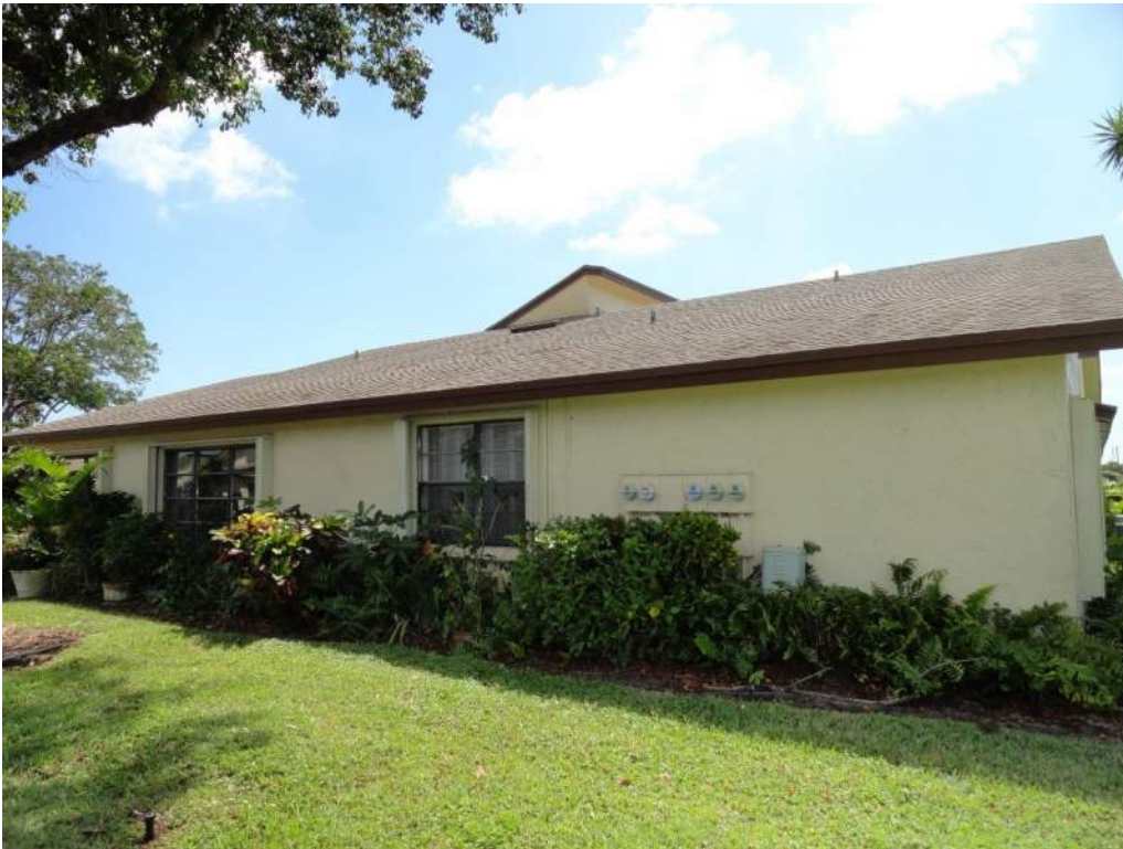
5. Roof Geometry – Right Elevation – Non-Hip