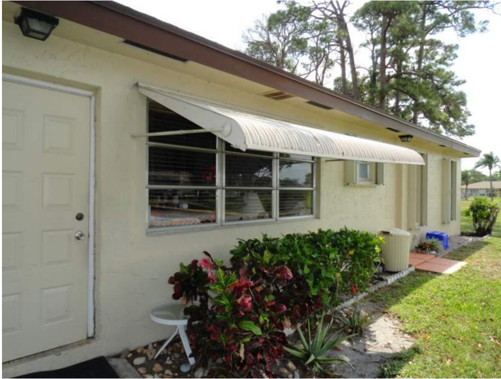
7. Opening Protection – Unrated Windows Protected w/ Untested Shutters