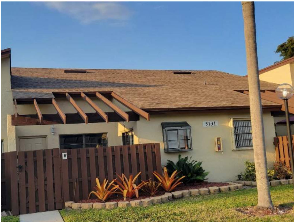
2. Roof Covering – Asphalt Shingles