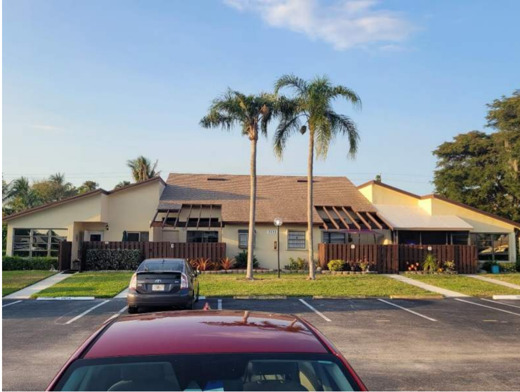
5. Roof Geometry – Front Elevation – Non-Hip