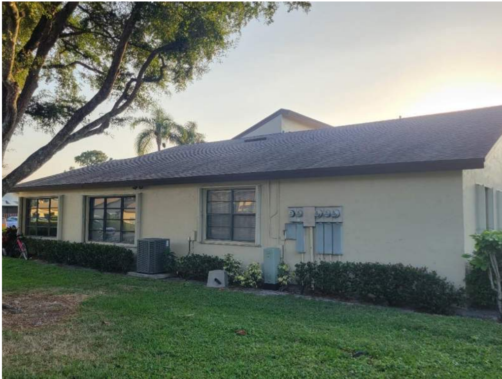
5. Roof Geometry – Right Elevation – Non-Hip