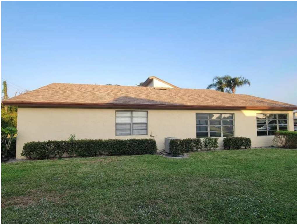
5. Roof Geometry – Left Elevation – Non-Hip