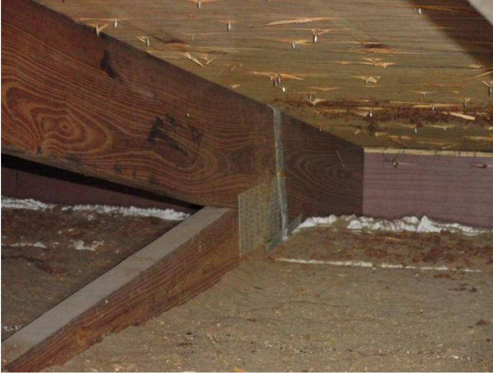
4. Roof to Wall Attachment – Single Wraps – Steel Straps w/ 3 Nails Min. at Face