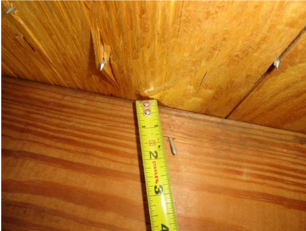
3. Roof Deck Attachment – 8d Ring Shank Nails