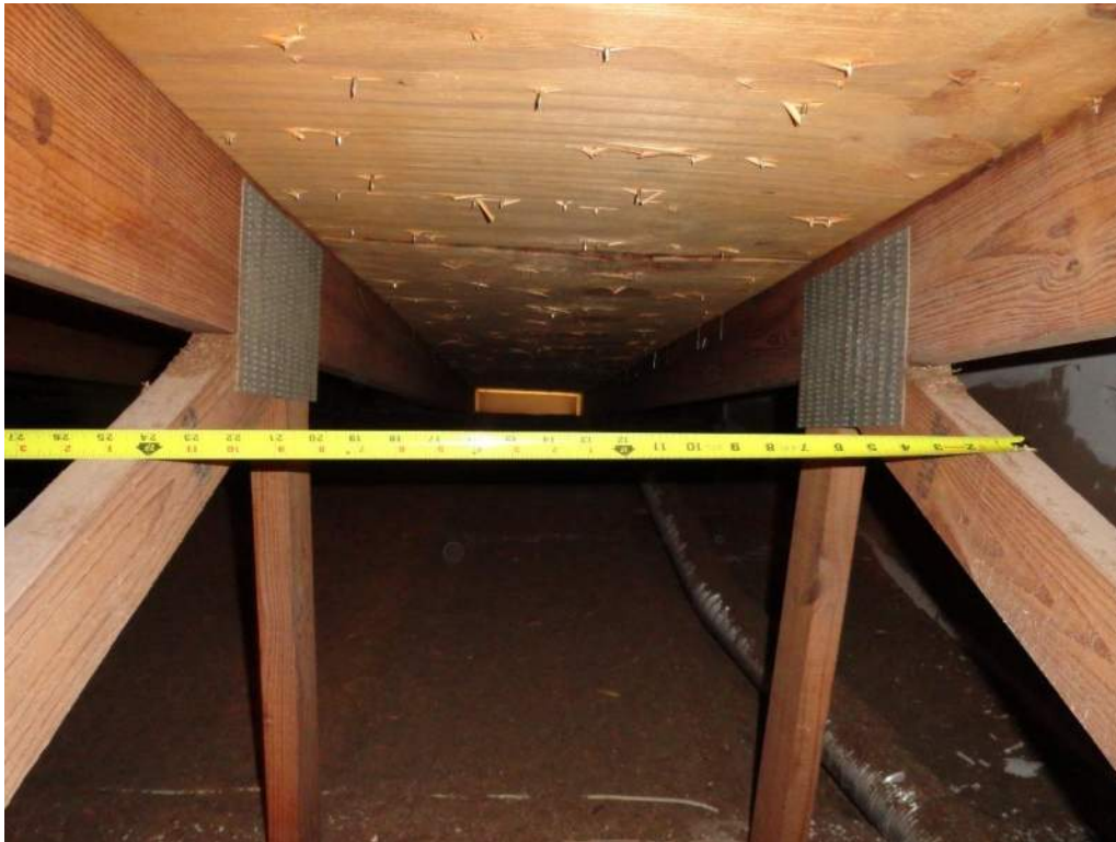
3. Roof Deck Attachment – Trusses at 24" O. C. Max.