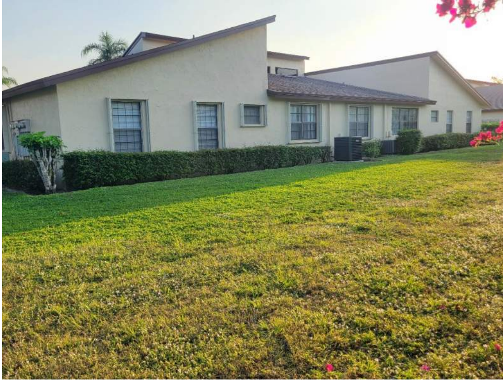
5. Roof Geometry – Rear Elevation – Non-Hip