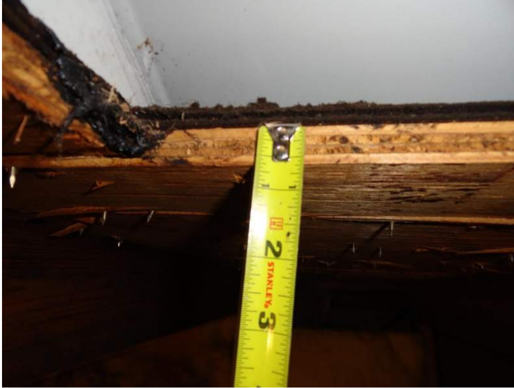
3. Roof Deck Attachment – 19/32" Plywood