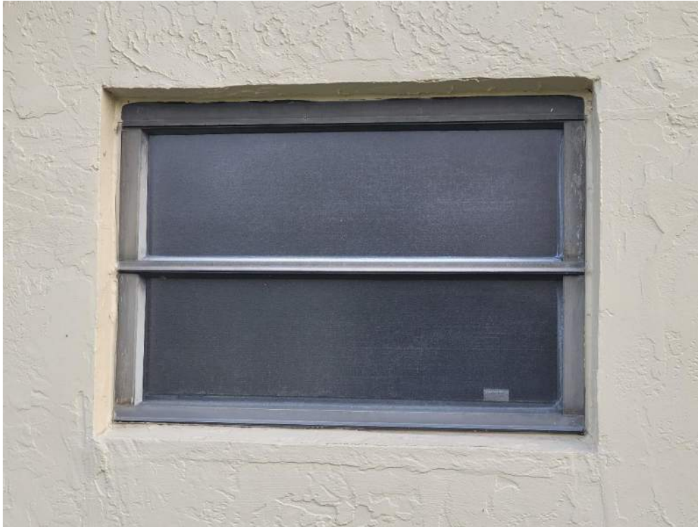
7. Opening Protection – Unrated Unprotected Windows