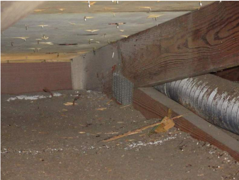
4. Roof to Wall Attachment – Single Wraps – Steel Straps w/ 1 Nail Min. at Back