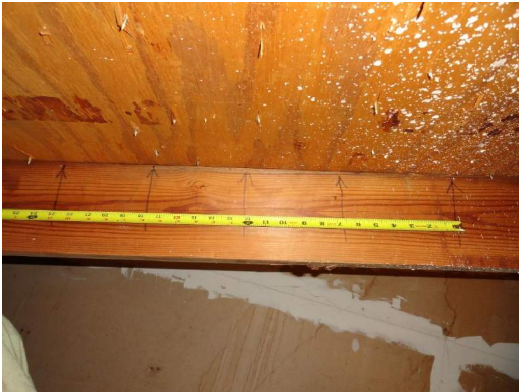
3. Roof Deck Attachment – Fasteners at 6" O. C. Max. In the Field