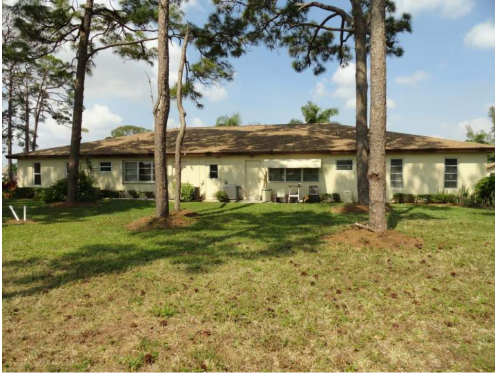
5. Roof Geometry – Rear Elevation – Hip