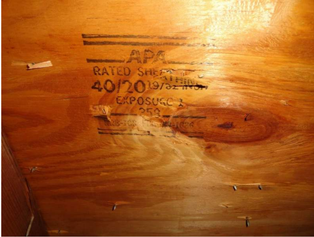
3. Roof Deck Attachment – 19/32" Plywood