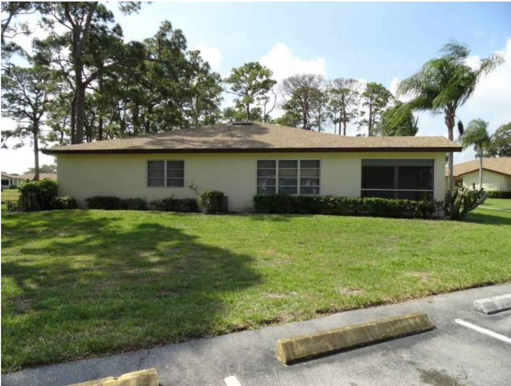
5. Roof Geometry – Left Elevation – Hip