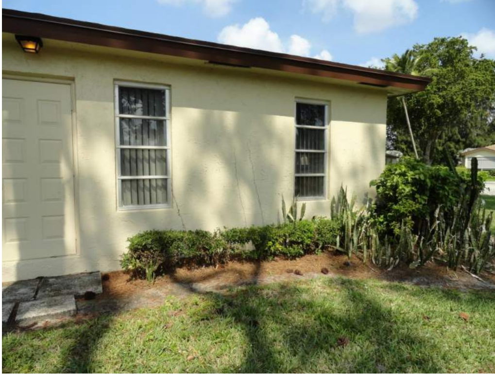
7. Opening Protection – Unrated Unprotected Windows