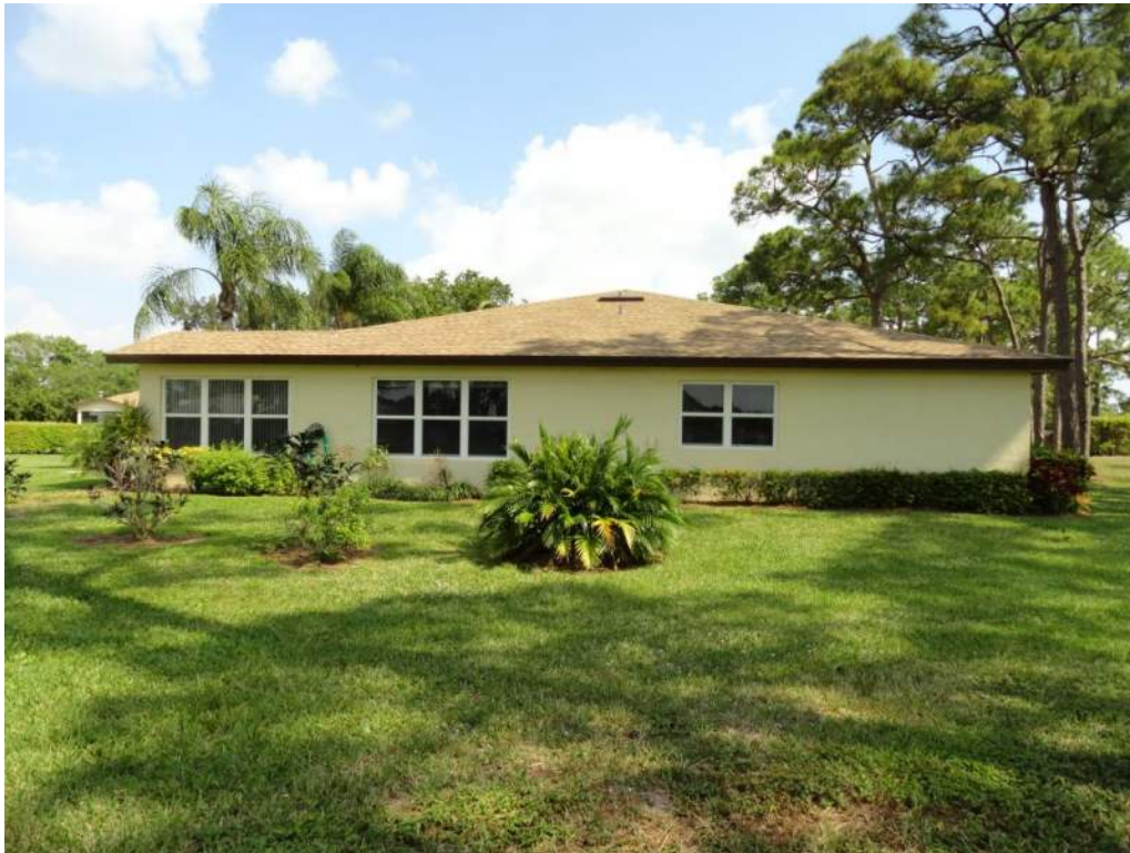
5. Roof Geometry – Right Elevation – Hip