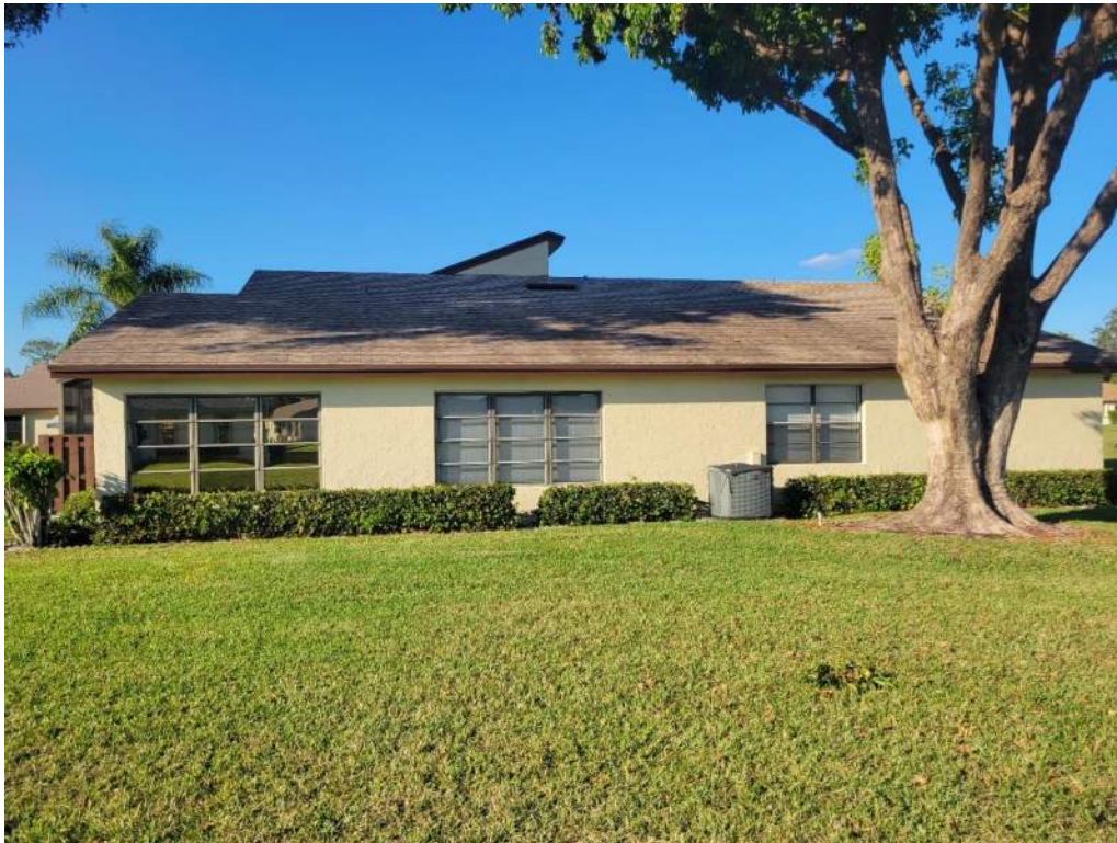
5. Roof Geometry – Right Elevation – Non-Hip