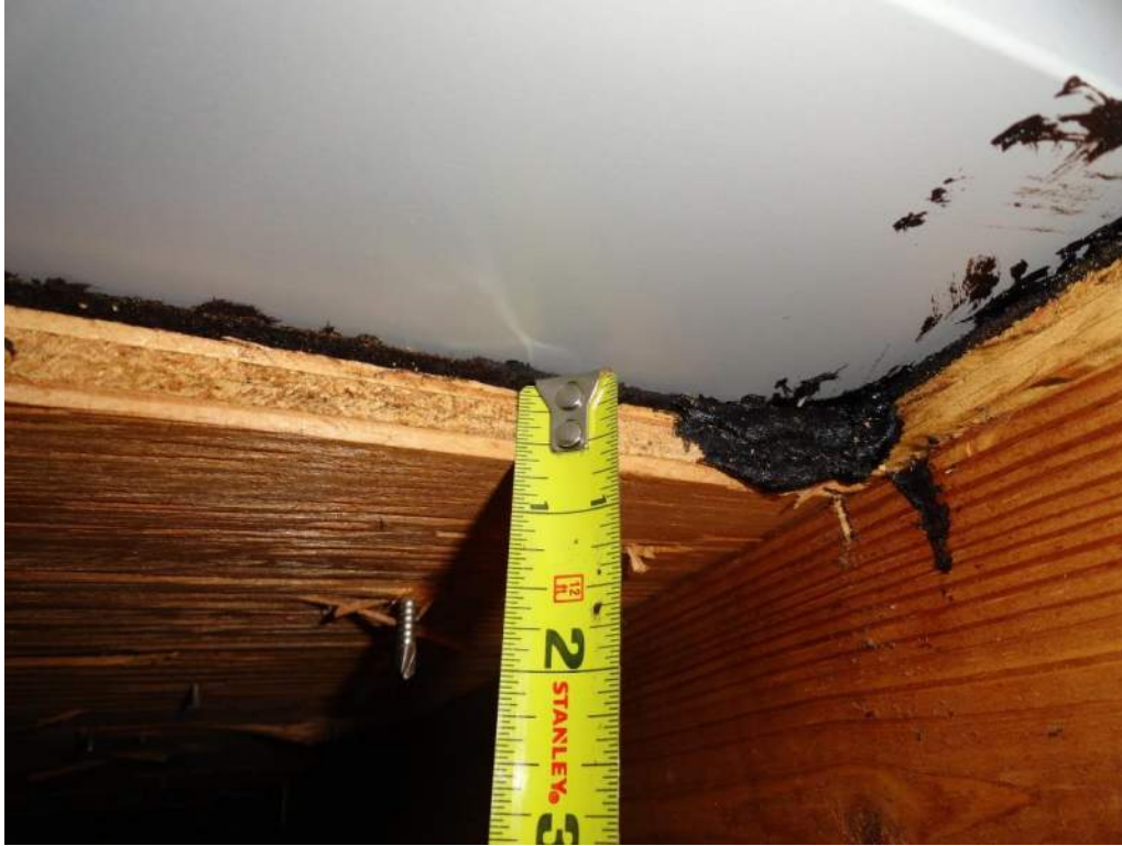
3. Roof Deck Attachment – 5/8" Plywood