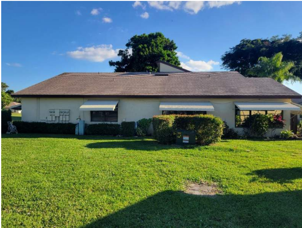
5. Roof Geometry – Left Elevation – Non-Hip