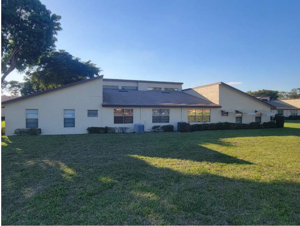
5. Roof Geometry – Rear Elevation – Non-Hip