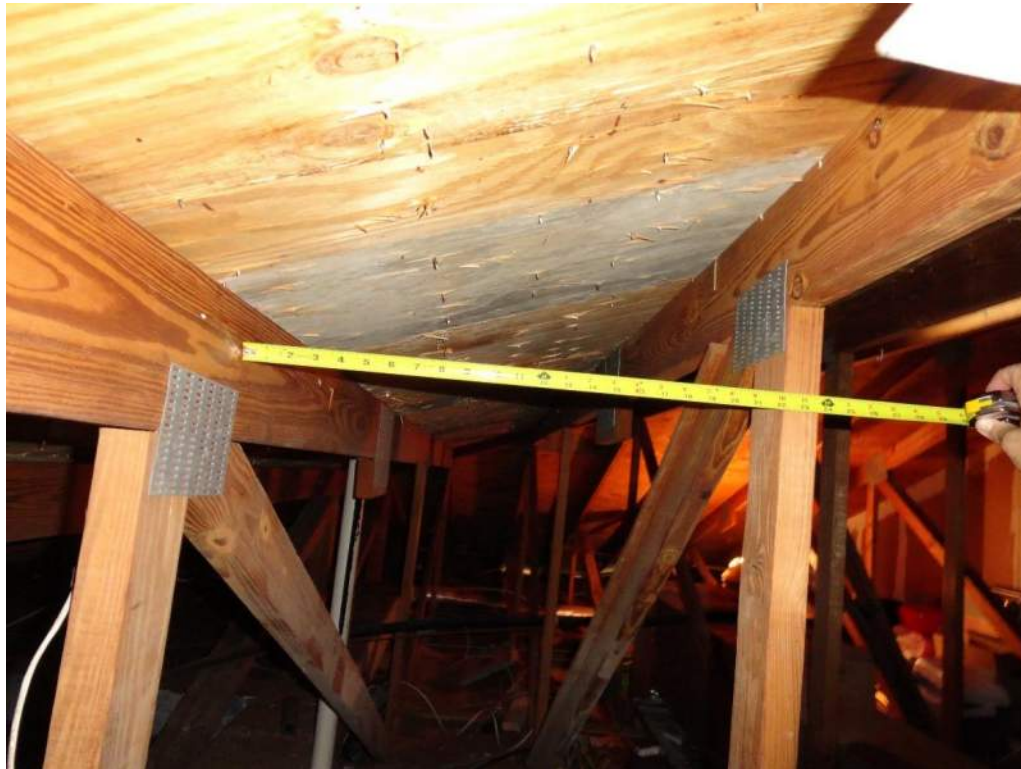
3. Roof Deck Attachment – Trusses at 24” O. C. Max.