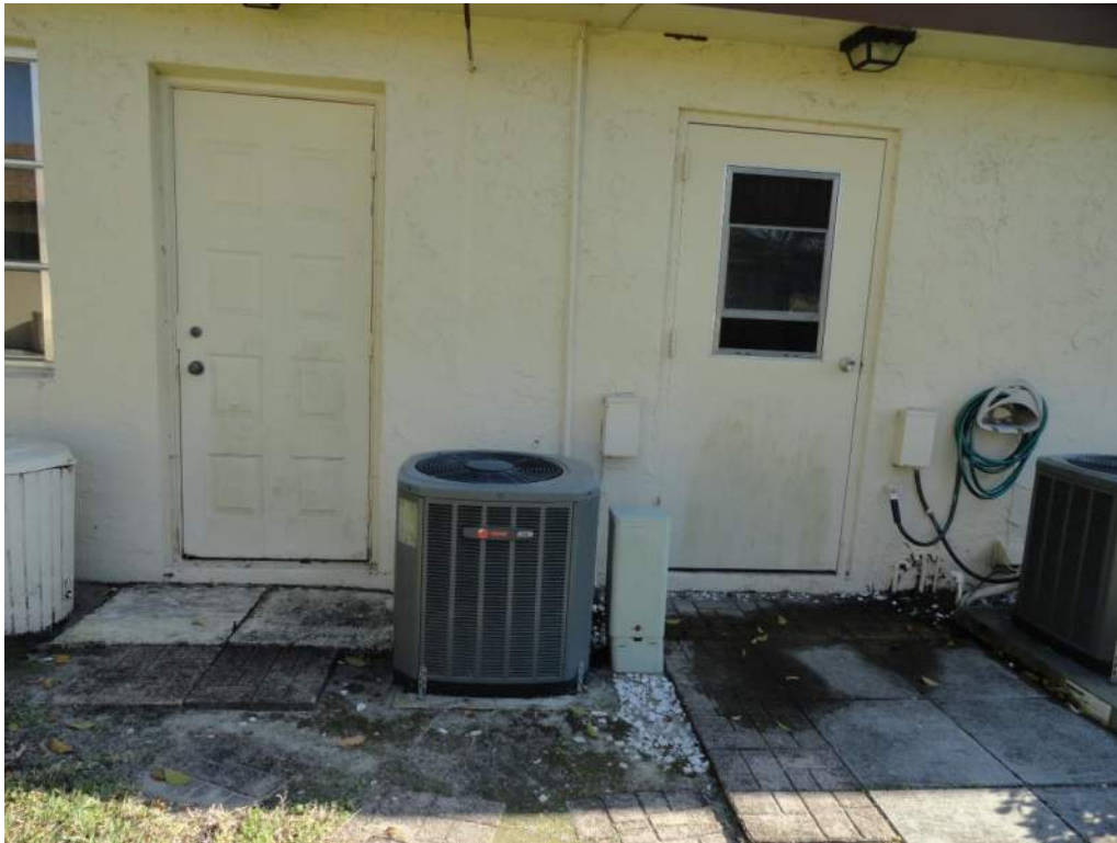
7. Opening Protection – Unprotected Unrated Unglazed Entry Door