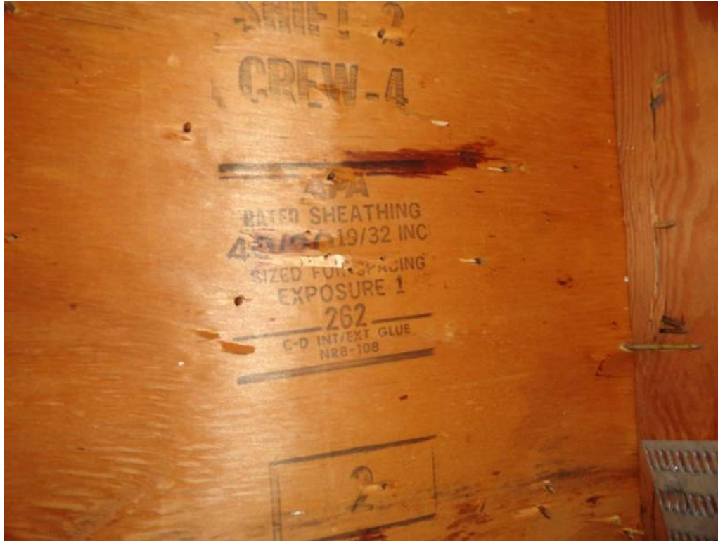
3. Roof Deck Attachment – 19/32” Plywood