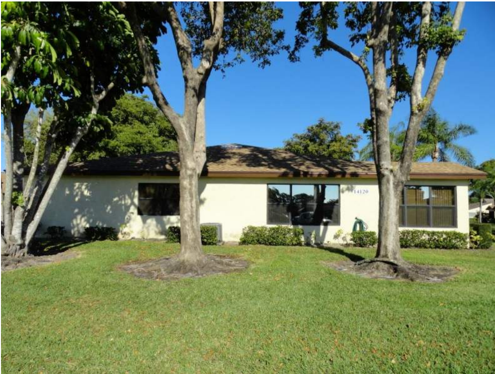
5. Roof Geometry – Left Elevation – Hip