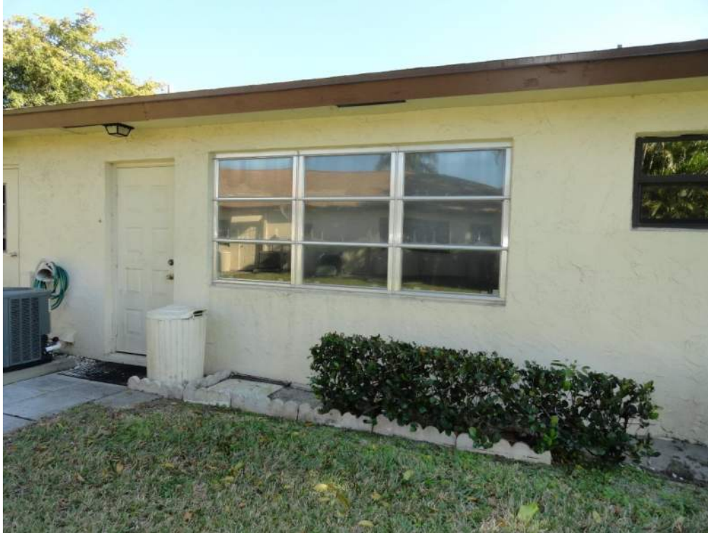
7. Opening Protection – Unprotected Unrated Windows