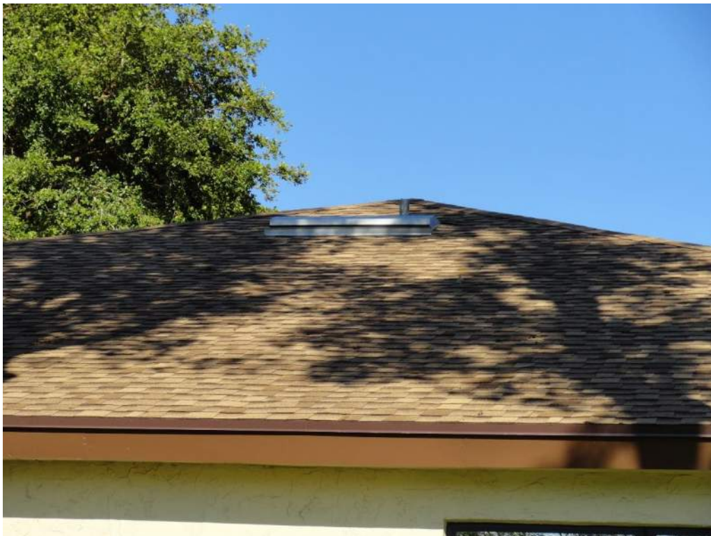
2. Roof Covering – Asphalt Shingles