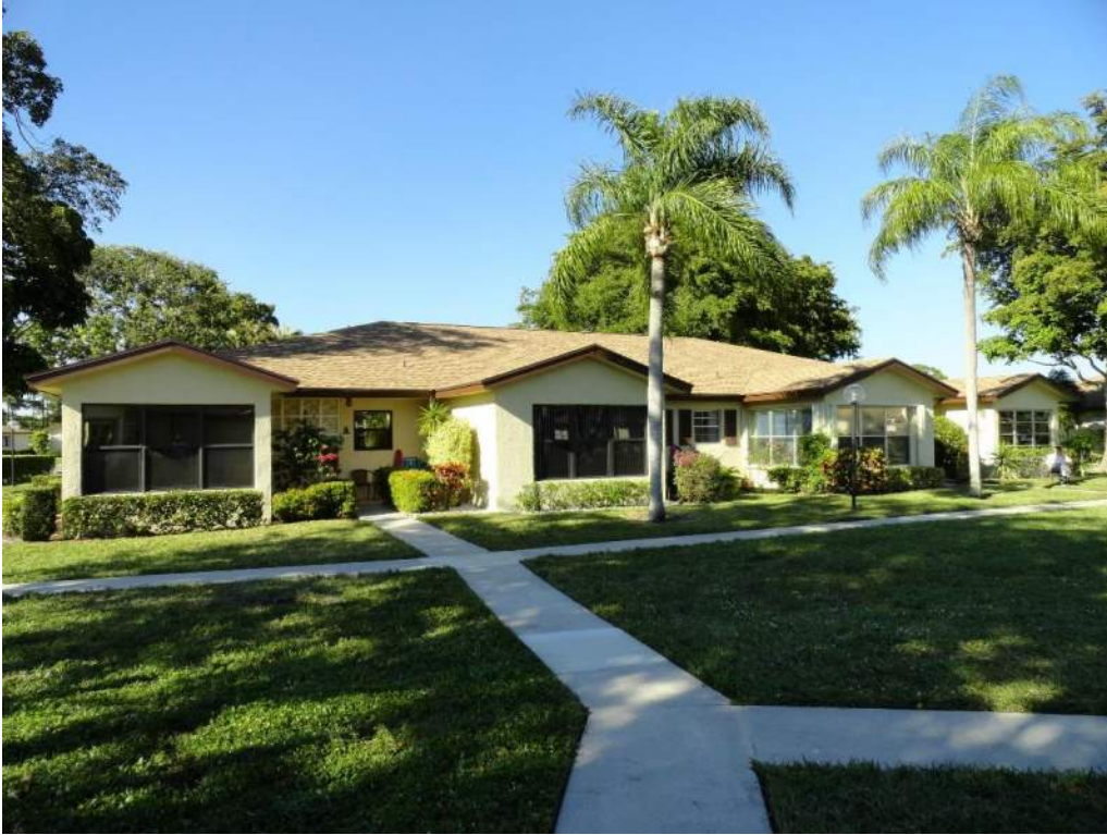
5. Roof Geometry – Front Elevation – Non-Hip