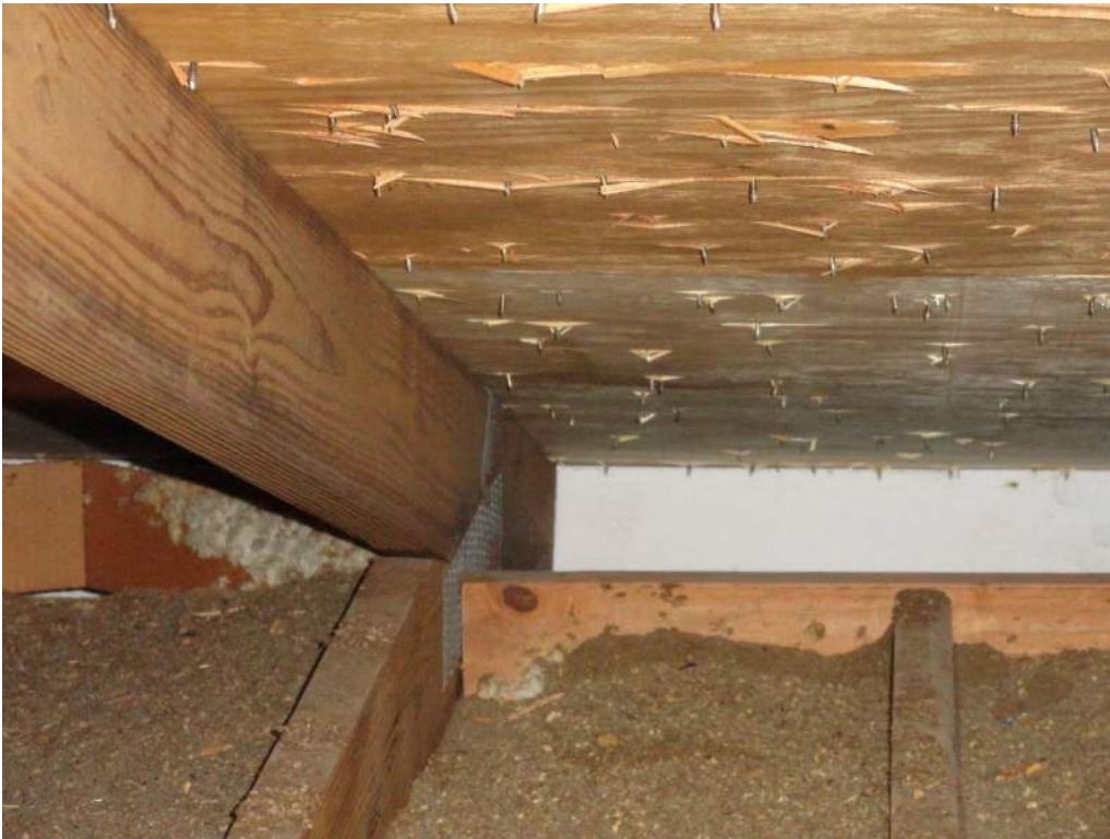
4. Roof to Wall Attachment – Single Wraps – Steel Straps w/ 1 Nail Min. at Back