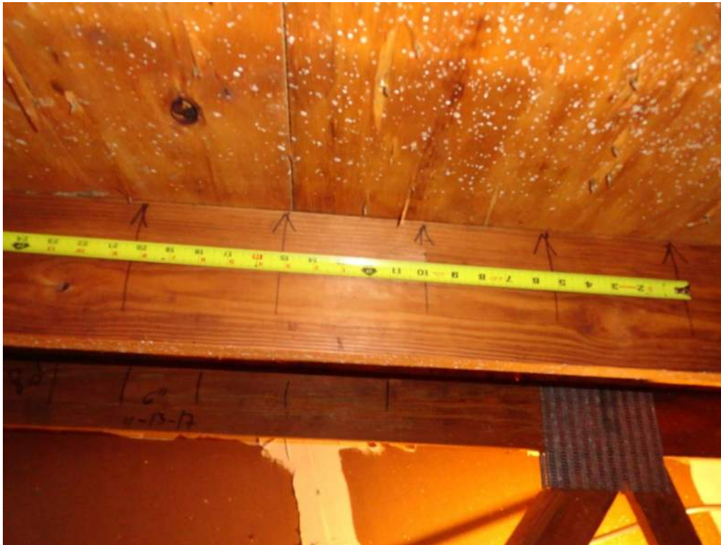
3. Roof Deck Attachment – Fasteners at 6" O. C. Max. In the Field