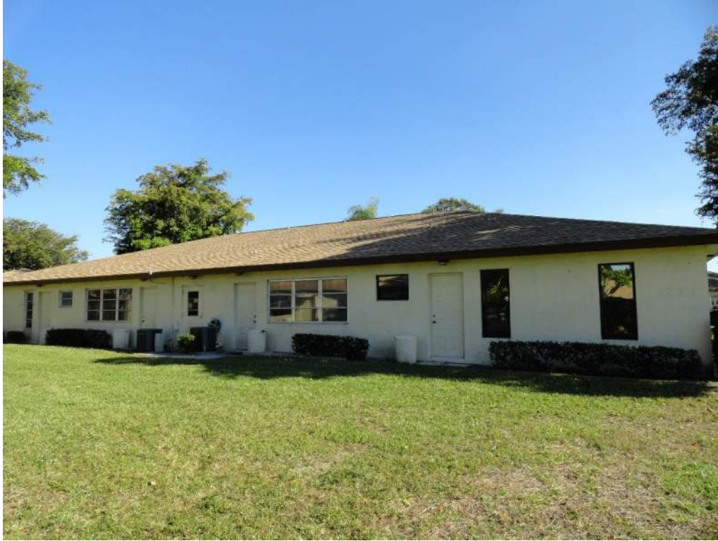
5. Roof Geometry – Rear Elevation – Hip