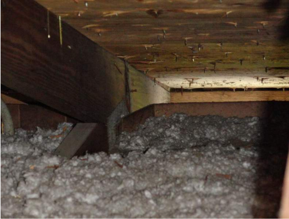
4. Roof to Wall Attachment – Single Wraps – Steel Straps w/ 2 Nails Min. at Face