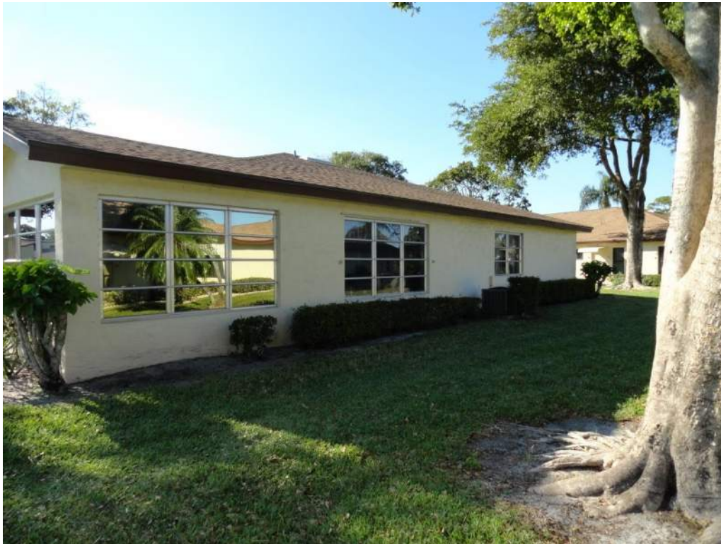
5. Roof Geometry – Right Elevation – Hip