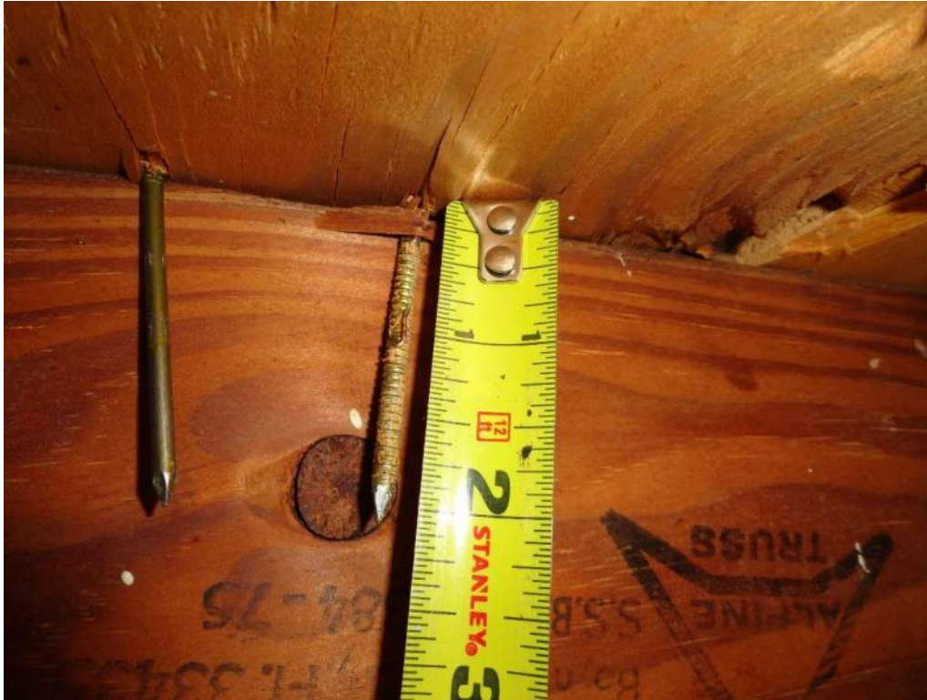
3. Roof Deck Attachment – 8d Nails