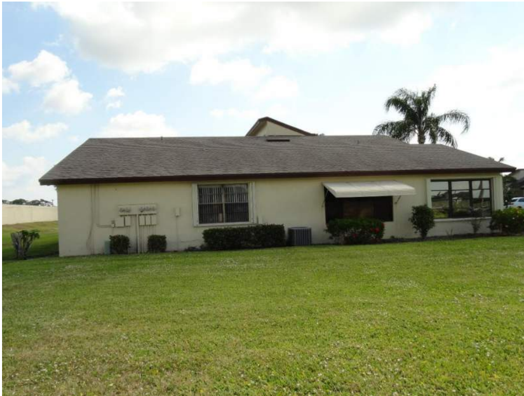
5. Roof Geometry – Left Elevation – Non-Hip