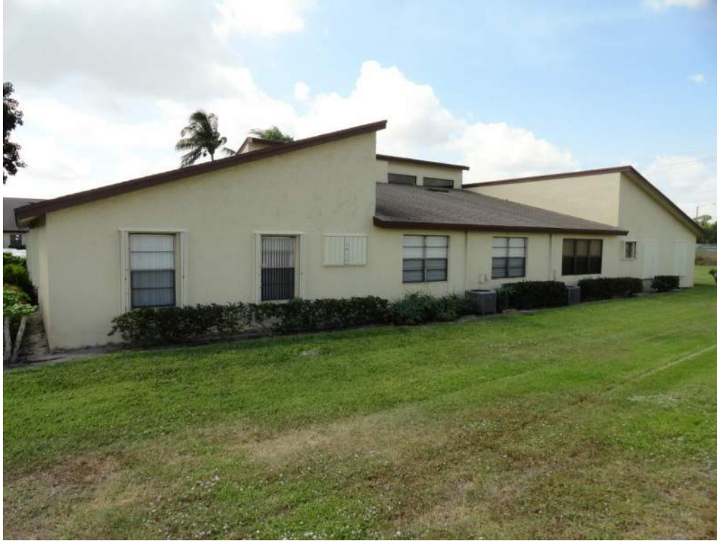
5. Roof Geometry – Rear Elevation – Non-Hip