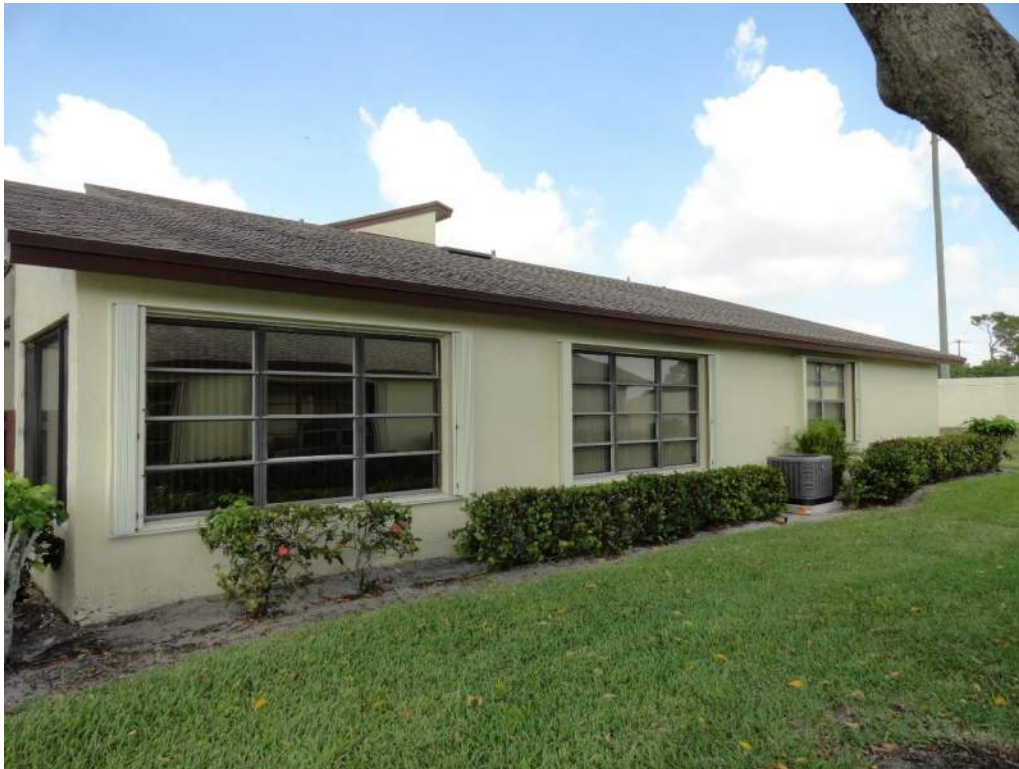
5. Roof Geometry – Right Elevation – Non-Hip