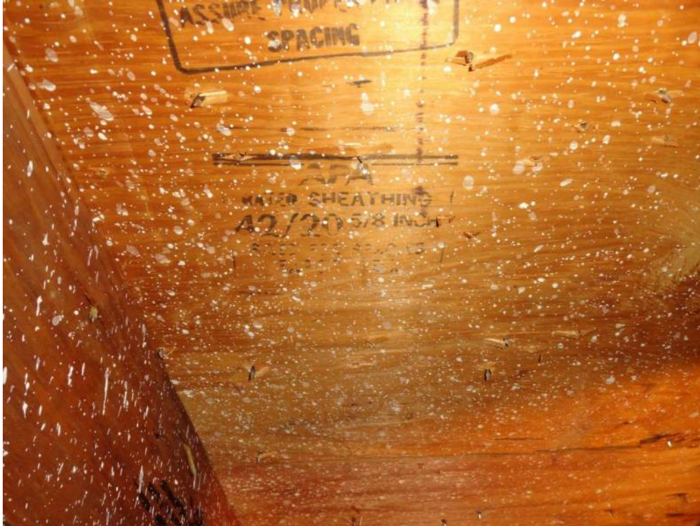
3. Roof Deck Attachment – 19/32" Plywood