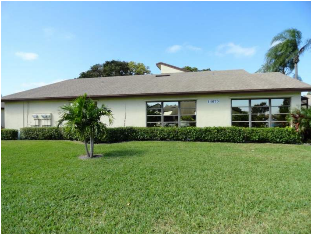
5. Roof Geometry – Left Elevation – Non-Hip