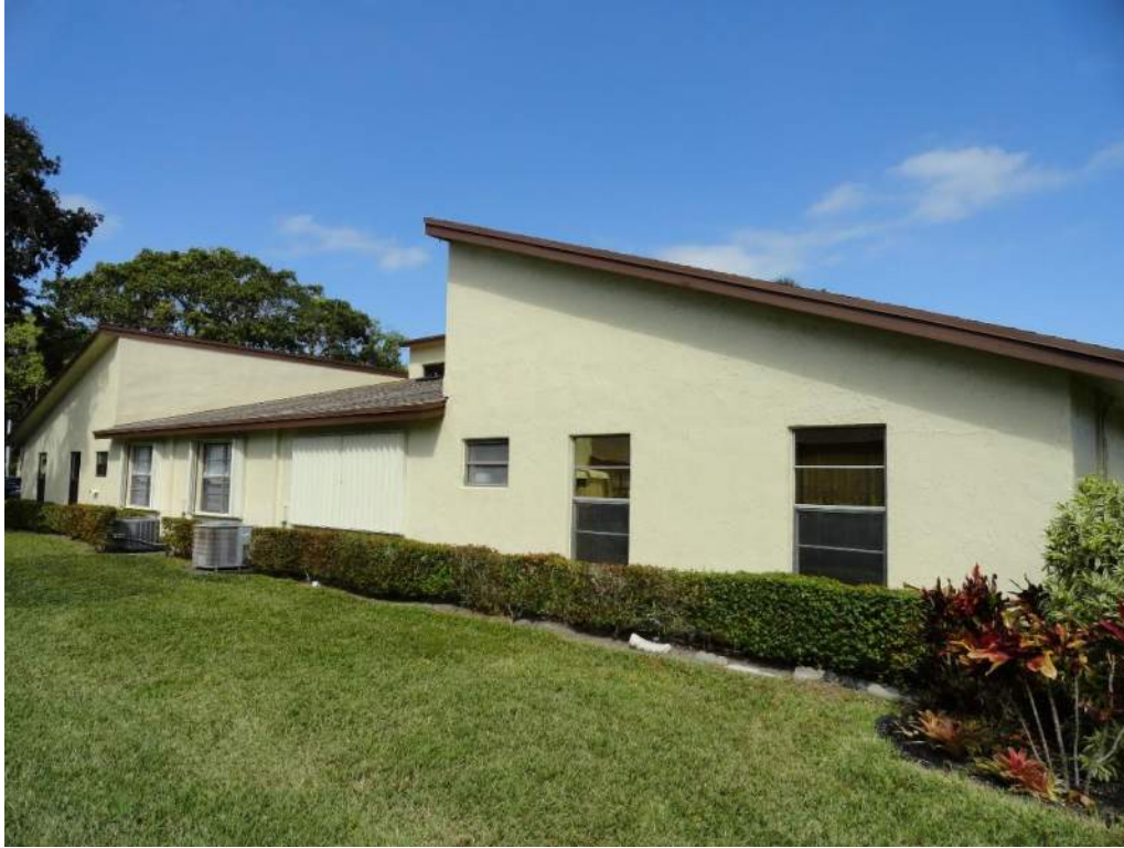
5. Roof Geometry – Rear Elevation – Non-Hip