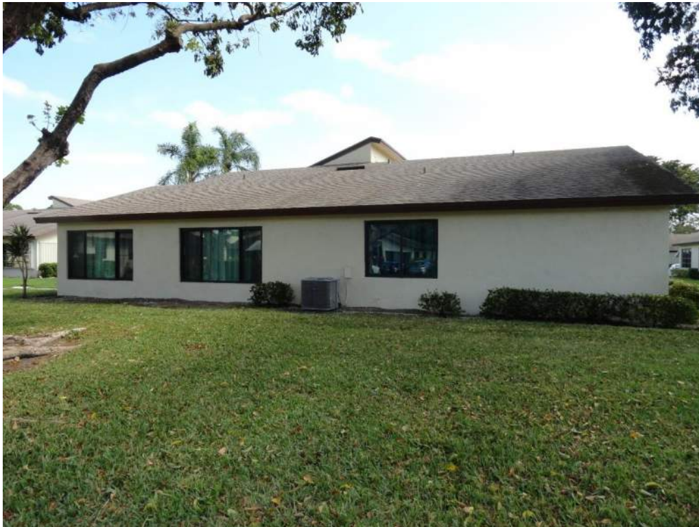
5. Roof Geometry – Right Elevation – Non-Hip