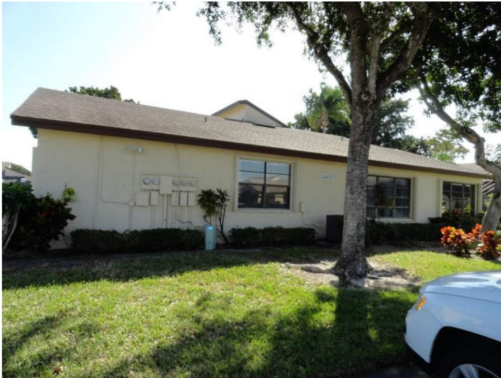
5. Roof Geometry – Left Elevation – Hip