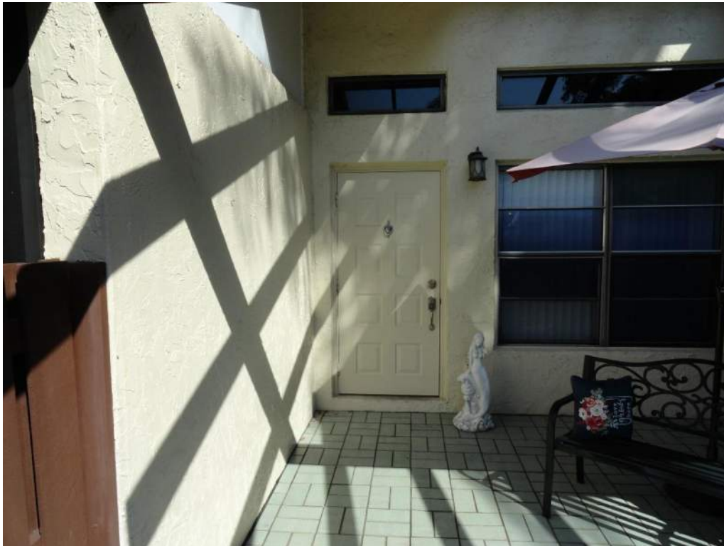
7. Opening Protection – Unprotected Unrated Unglazed Entry Door