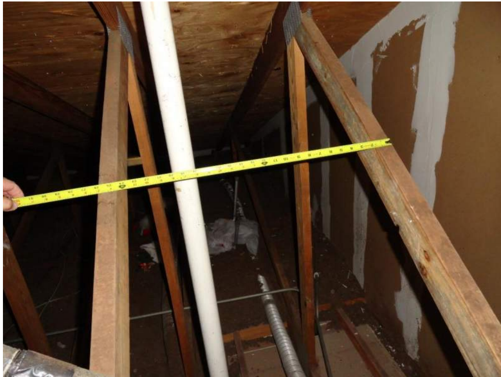
3. Roof Deck Attachment – Trusses at 24" O. C. Max.