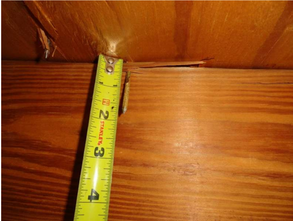
3. Roof Deck Attachment – 8d Nails