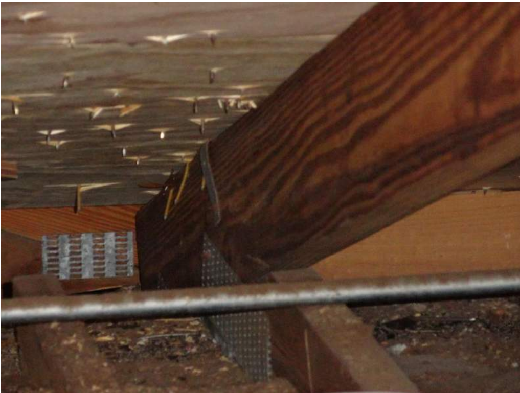
4. Roof to Wall Attachment – Single Wraps – Steel Straps w/ 1 Nail Min. at Back