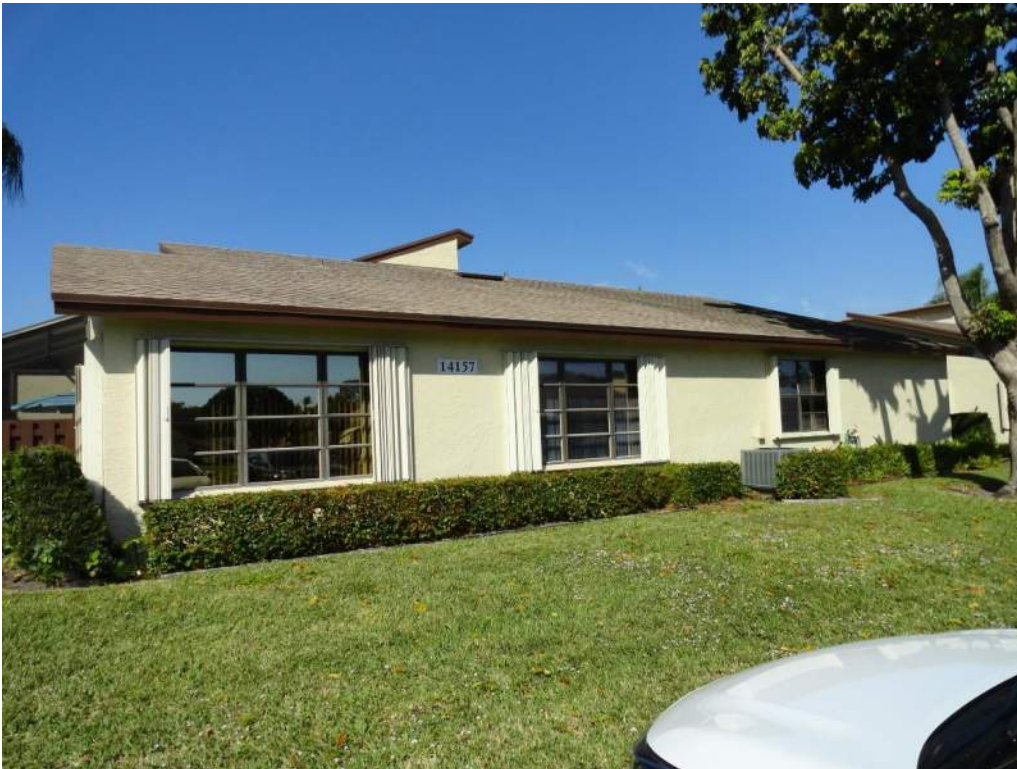
5. Roof Geometry – Right Elevation – Hip