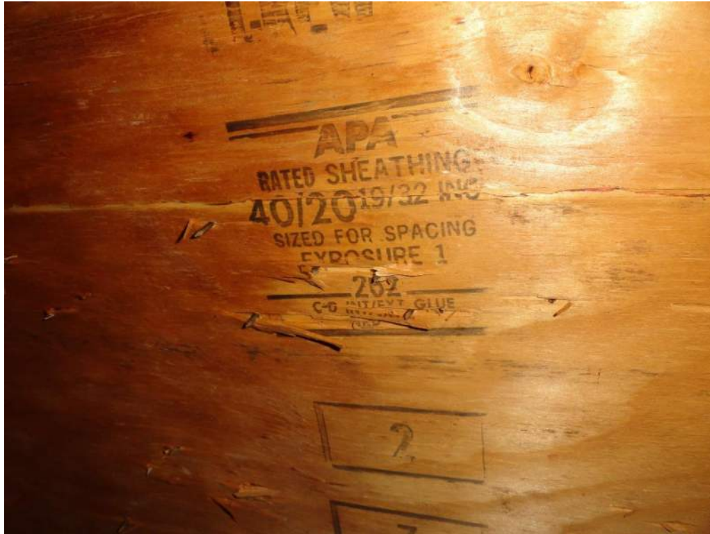
3. Roof Deck Attachment – 19/32" Plywood