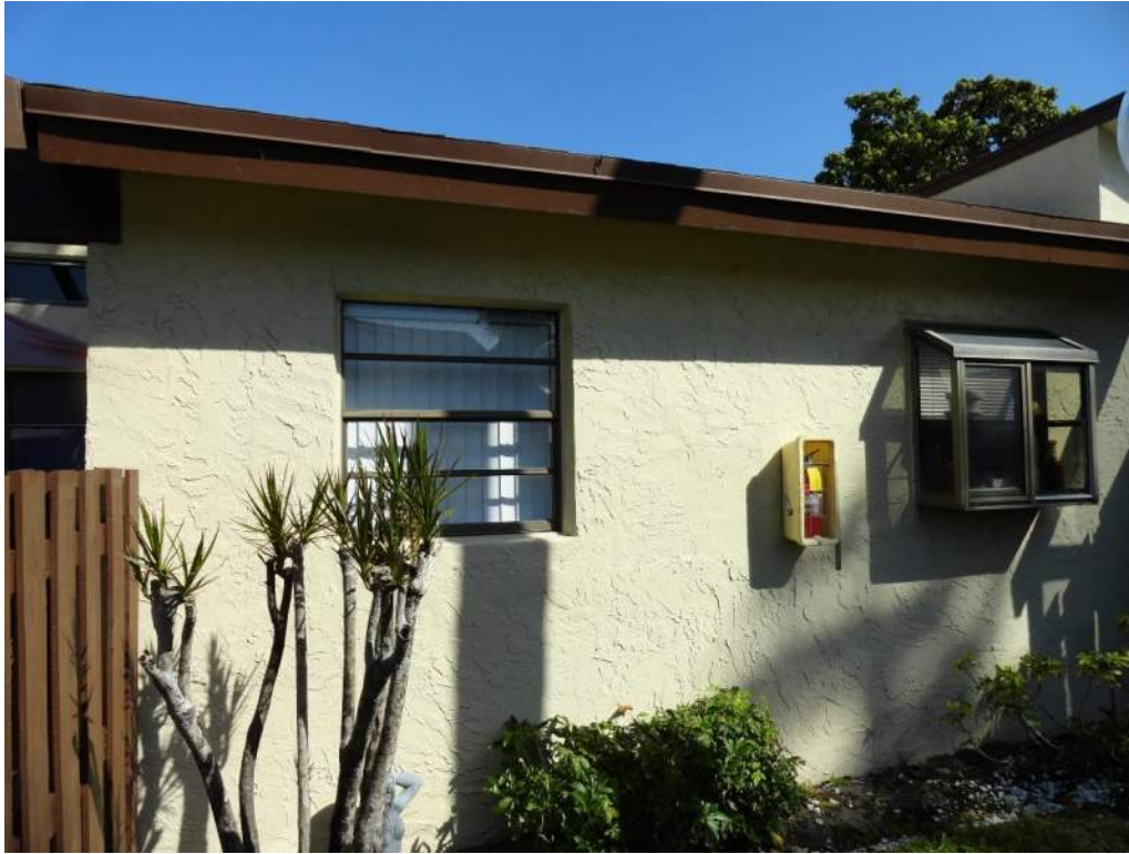
7. Opening Protection – Unprotected Unrated Windows