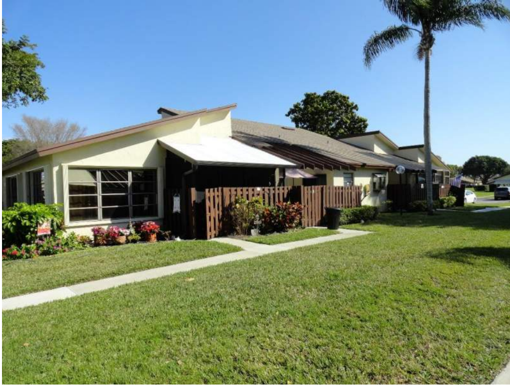
5. Roof Geometry – Front Elevation – Non-Hip