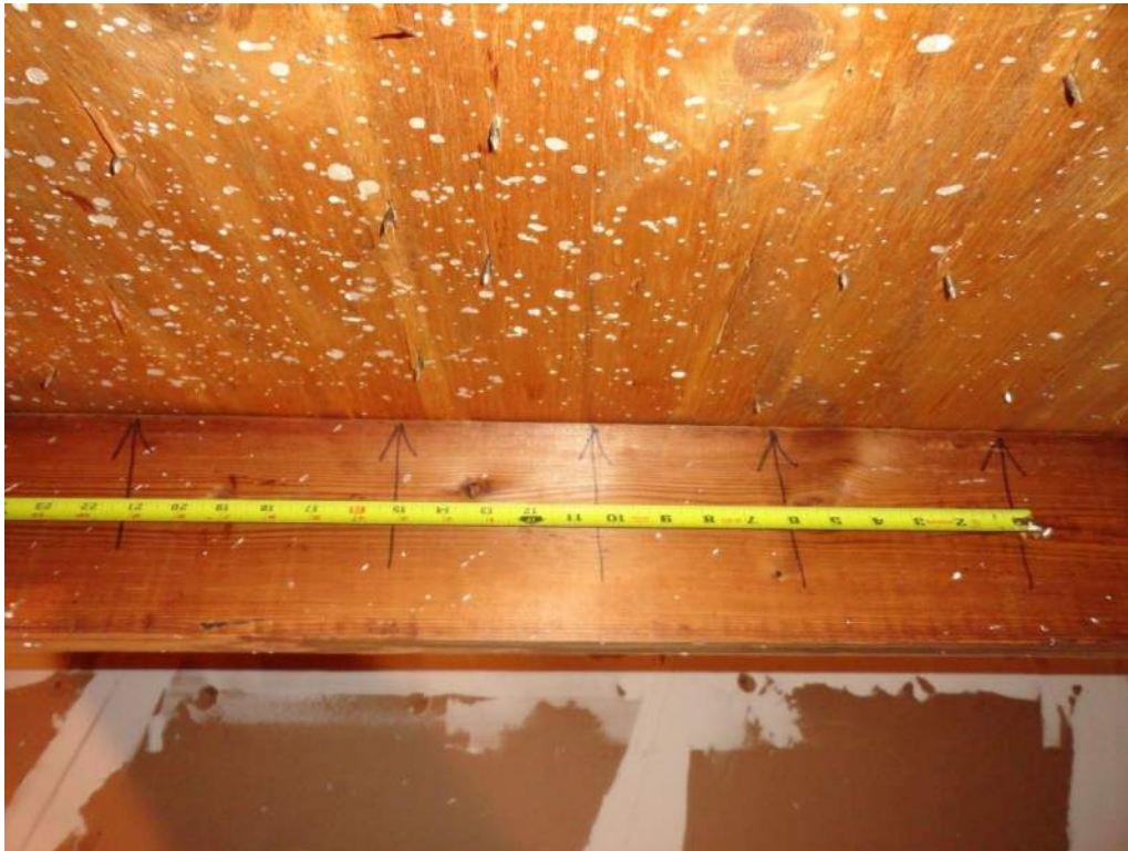
3. Roof Deck Attachment – Fasteners at 6" O. C. Max. In the Field