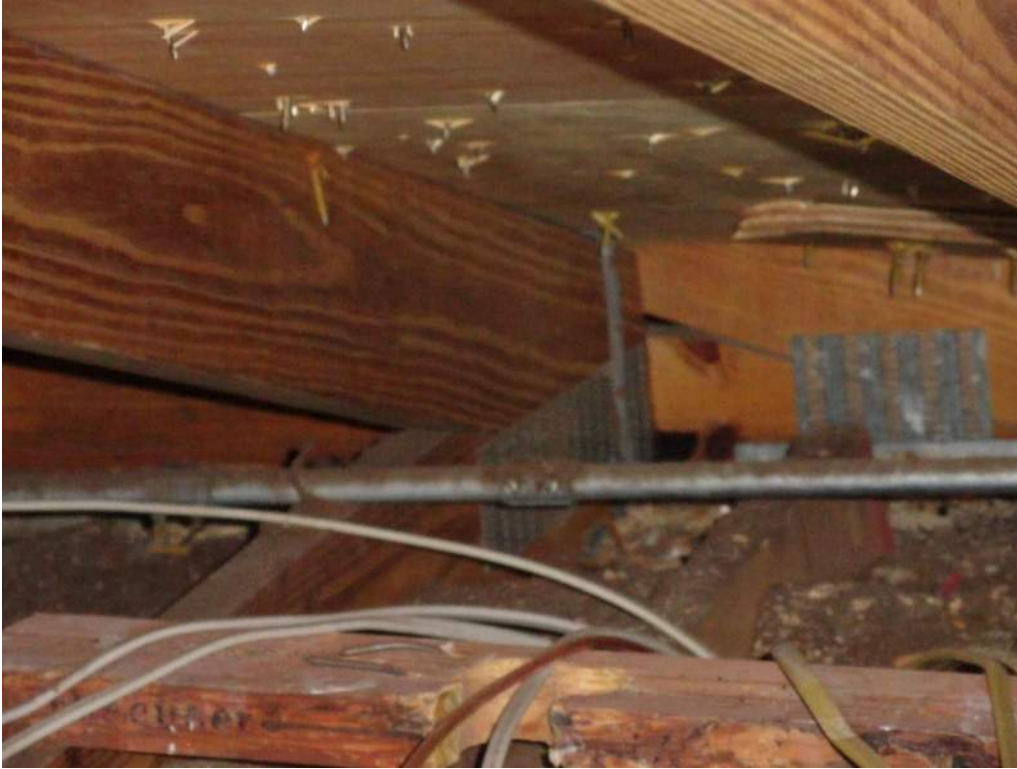
4. Roof to Wall Attachment – Single Wraps – Steel Straps w/ 2 Nails Min. at Face