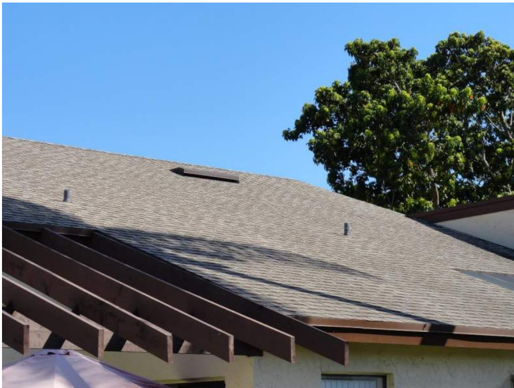
2. Roof Covering – Asphalt Shingles