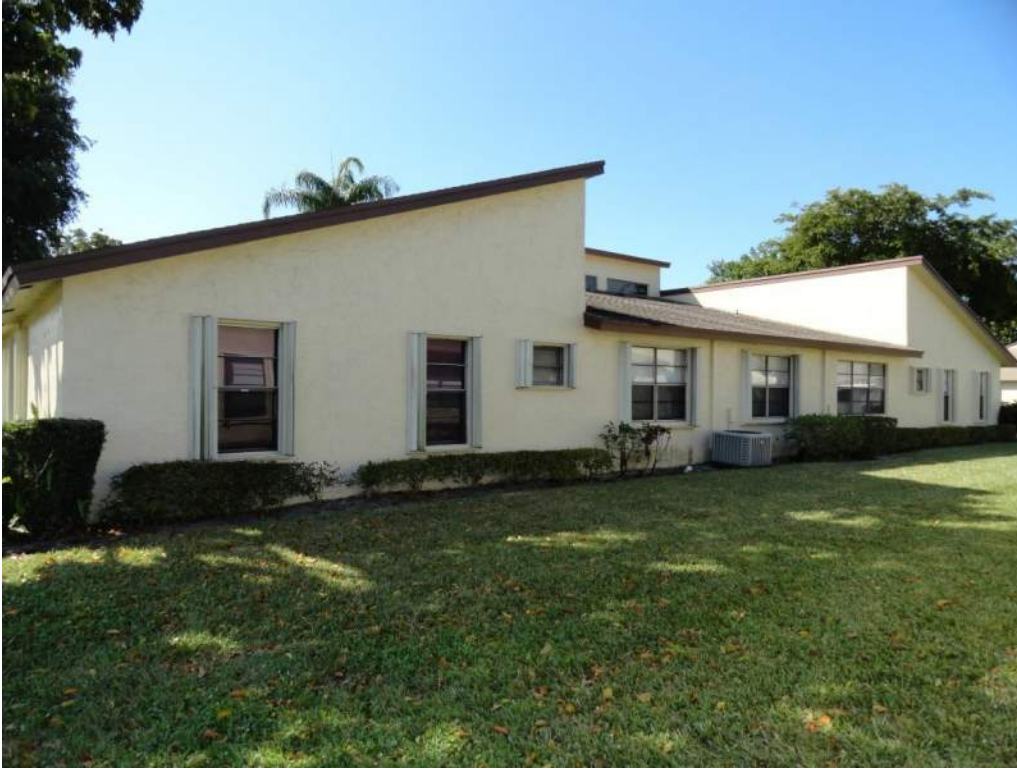
5. Roof Geometry – Rear Elevation – Hip