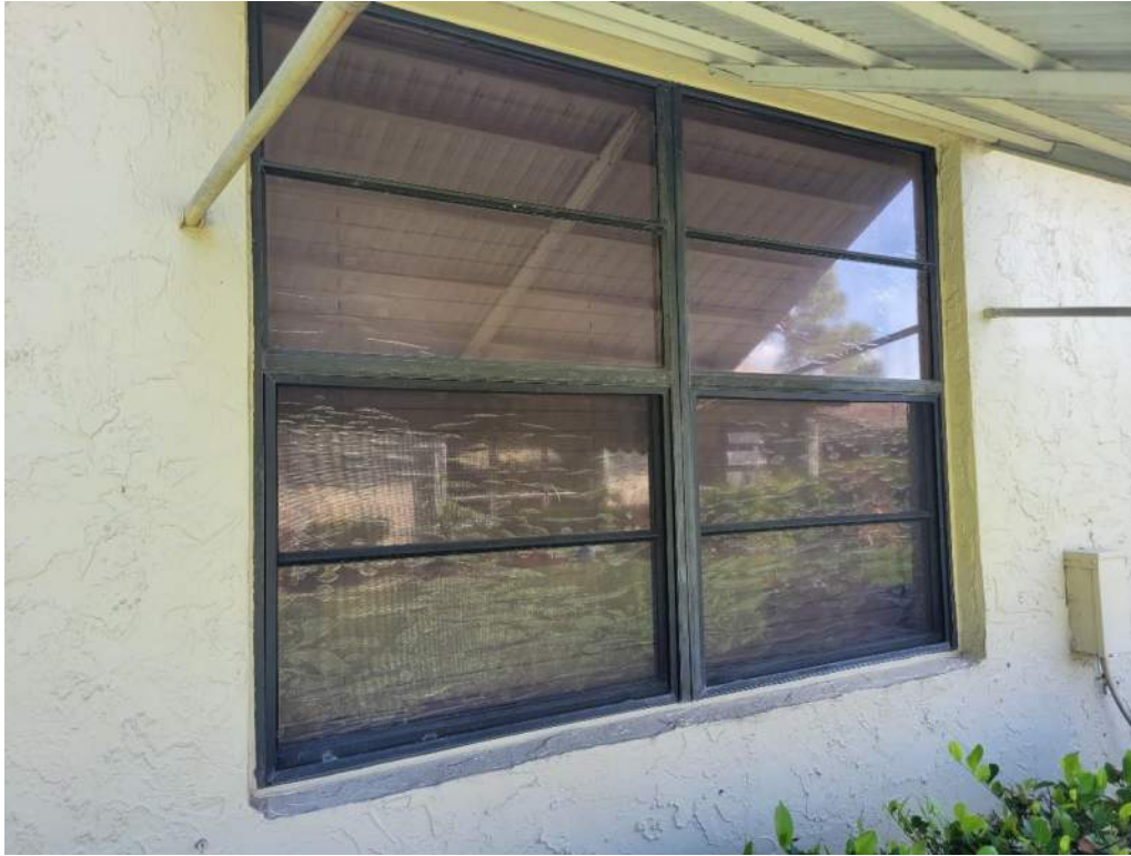
7. Opening Protection – Unrated Windows Protected w/ Untested Shutters