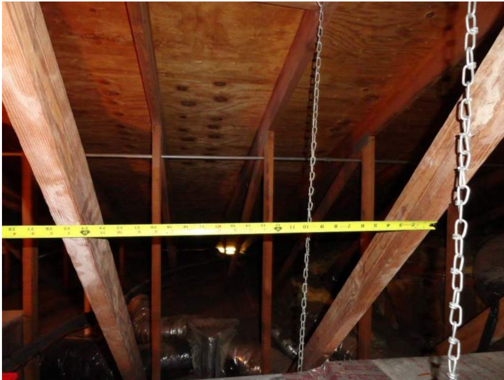
3. Roof Deck Attachment – Trusses at 24" O. C. Max.