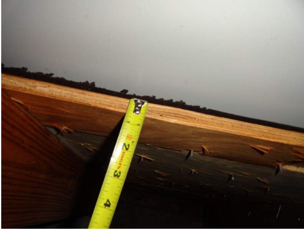
3. Roof Deck Attachment – 5/8" Plywood