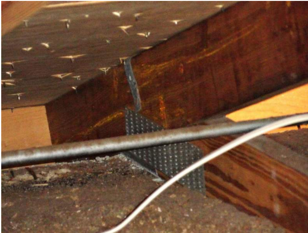
4. Roof to Wall Attachment – Single Wraps – Steel Straps w/ 1 Nail Min. at Back