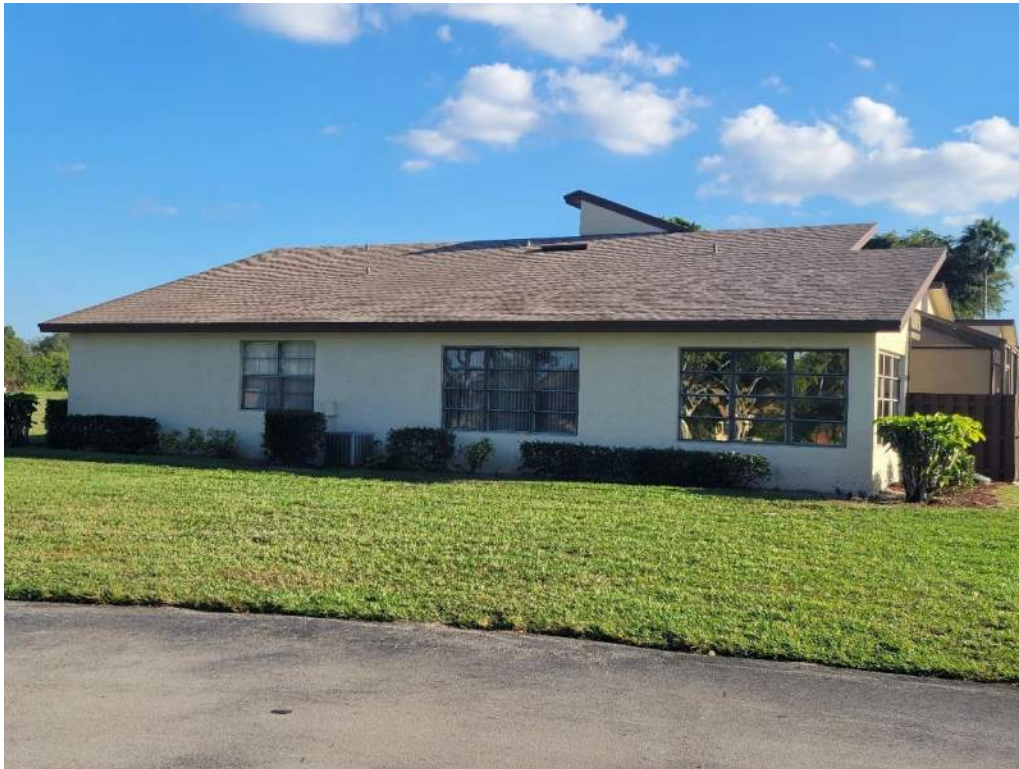
5. Roof Geometry – Right Elevation – Non-Hip