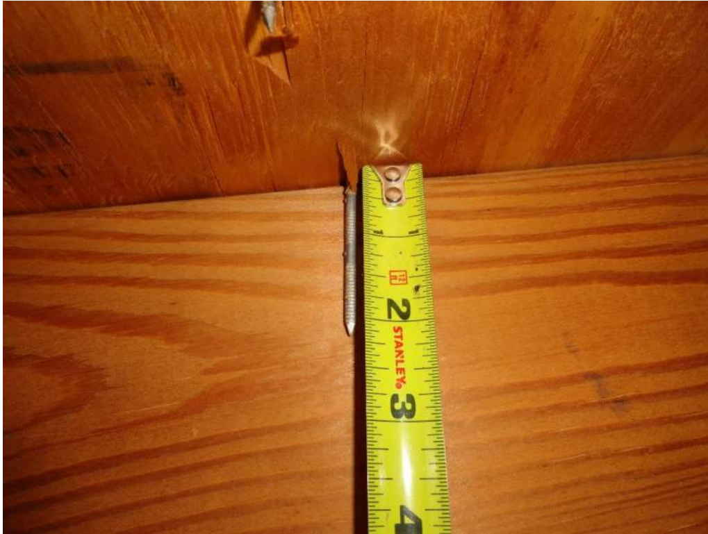
3. Roof Deck Attachment – 8d Nails