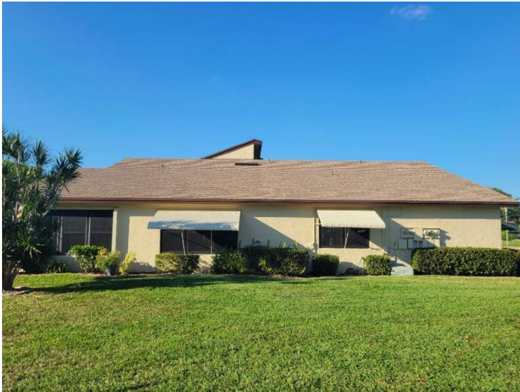
5. Roof Geometry – Left Elevation – Non-Hip