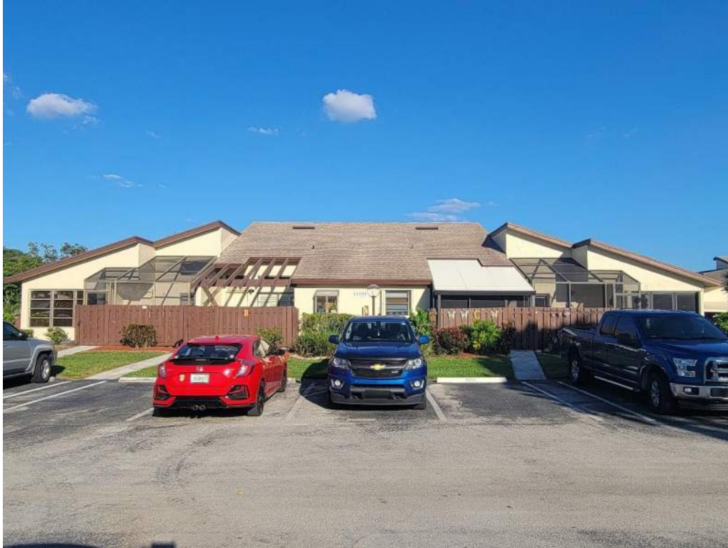
5. Roof Geometry – Front Elevation – Non-Hip