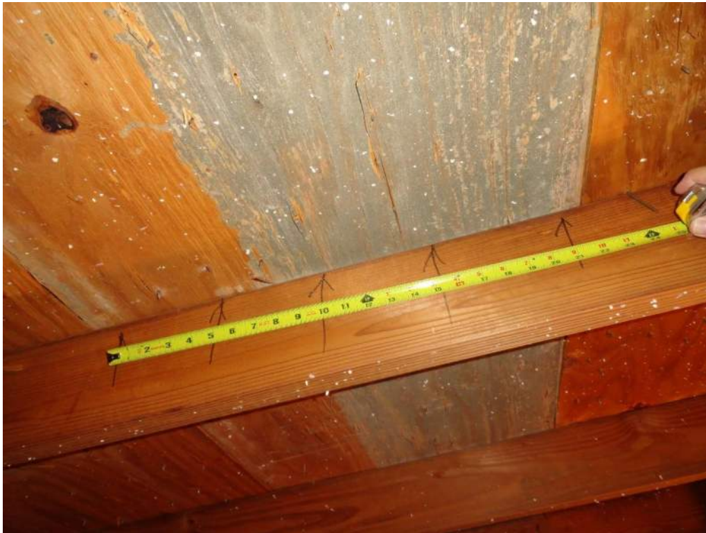
3. Roof Deck Attachment – Fasteners at 6" O. C. Max. In the Field