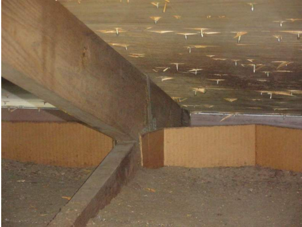
4. Roof to Wall Attachment – Single Wraps – Steel Straps w/ 2 Nails Min. at Face