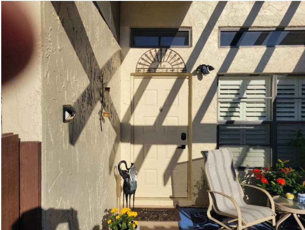
7. Opening Protection – Unprotected Unrated Unglazed Entry Door