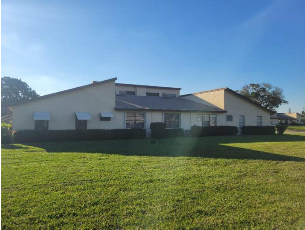
5. Roof Geometry – Rear Elevation – Non-Hip