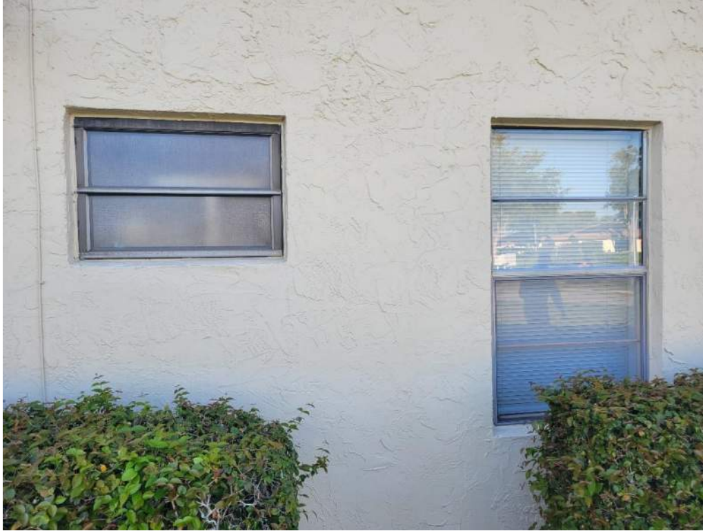
7. Opening Protection – Unrated Unprotected Windows