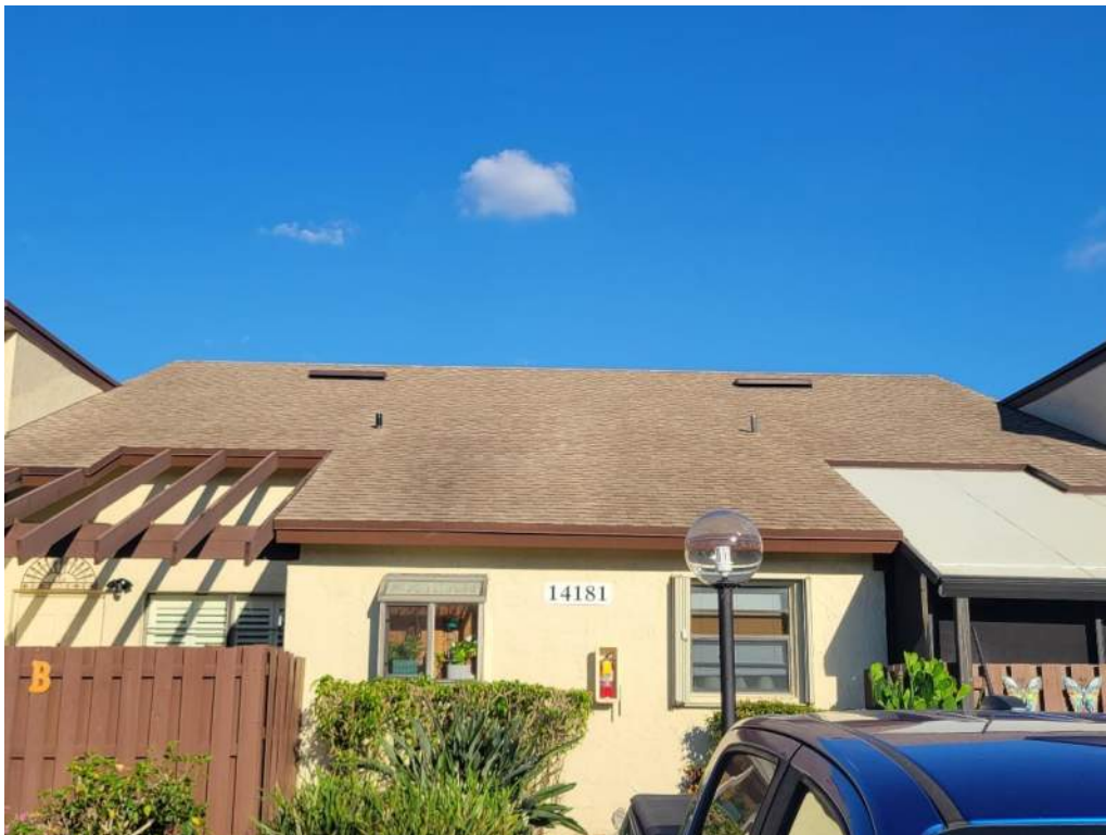
2. Roof Covering – Asphalt Shingles