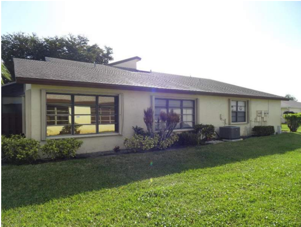
5. Roof Geometry – Right Elevation – Hip