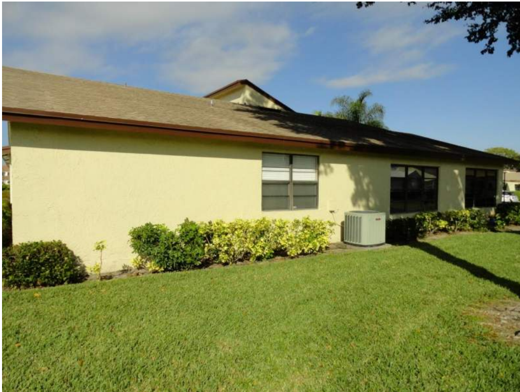
5. Roof Geometry – Left Elevation – Hip