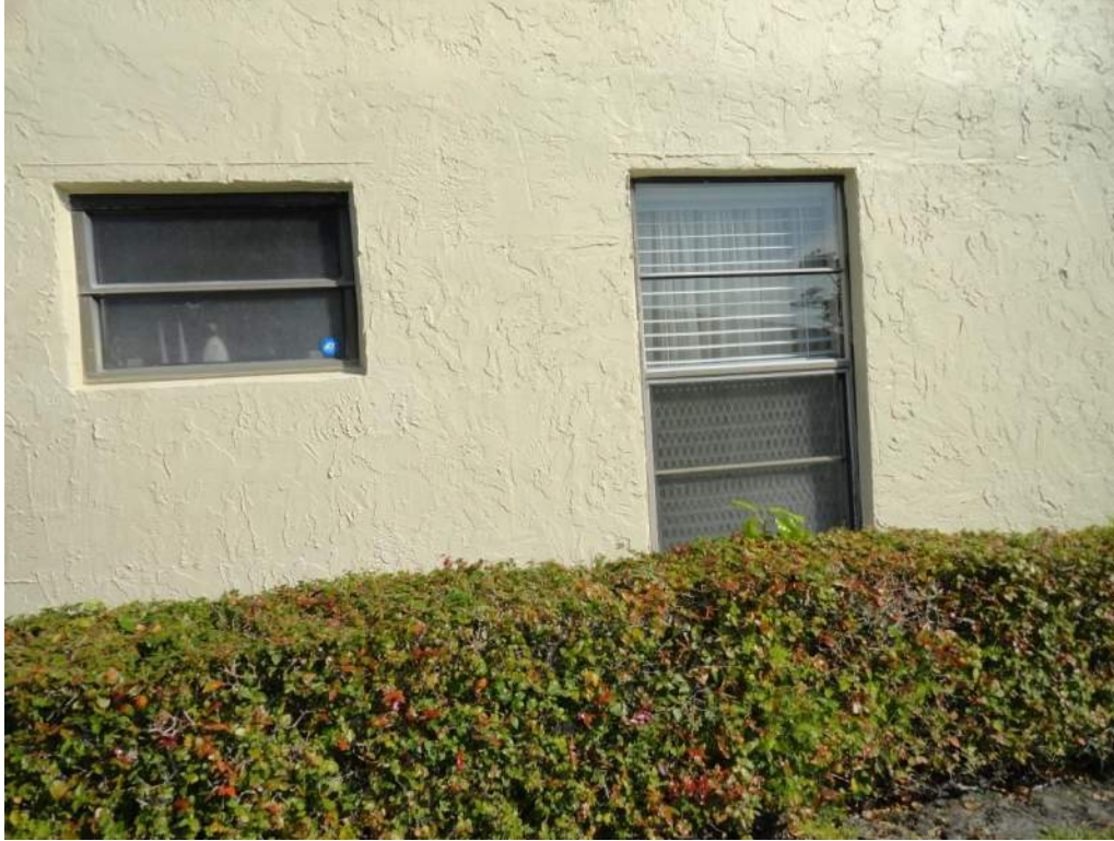
7. Opening Protection – Unprotected Unrated Windows