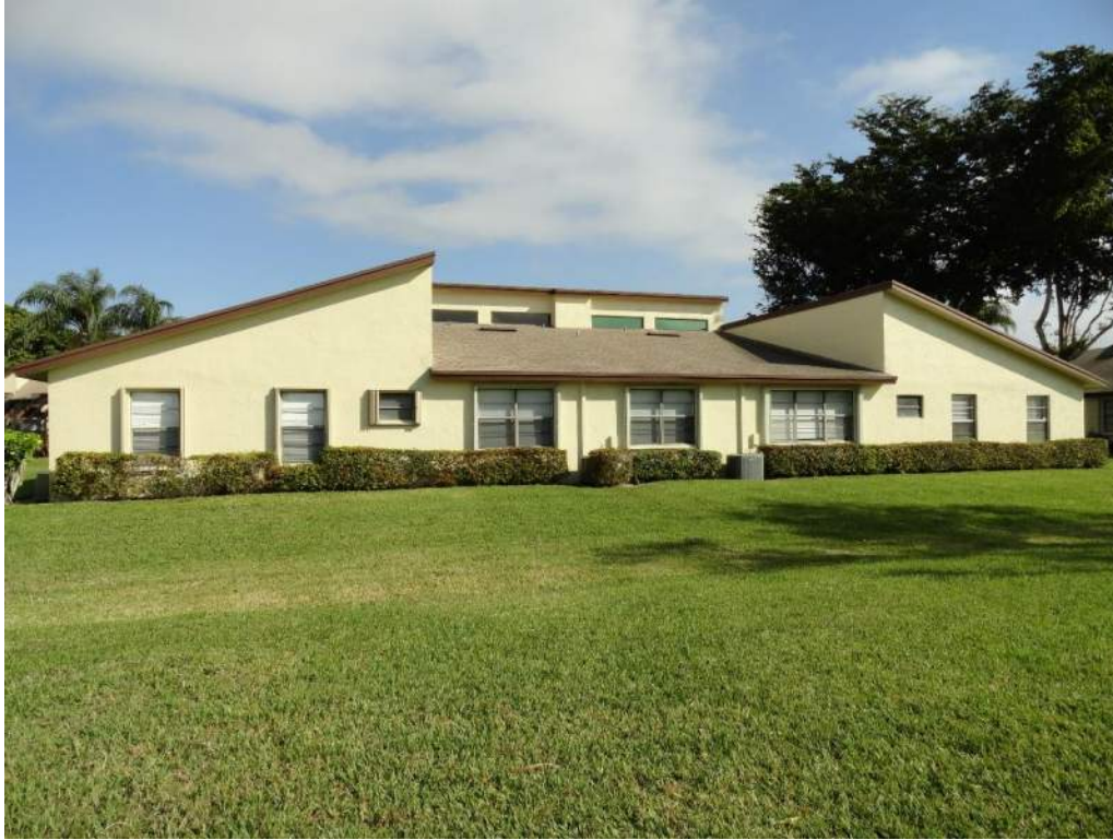
5. Roof Geometry – Rear Elevation – Hip