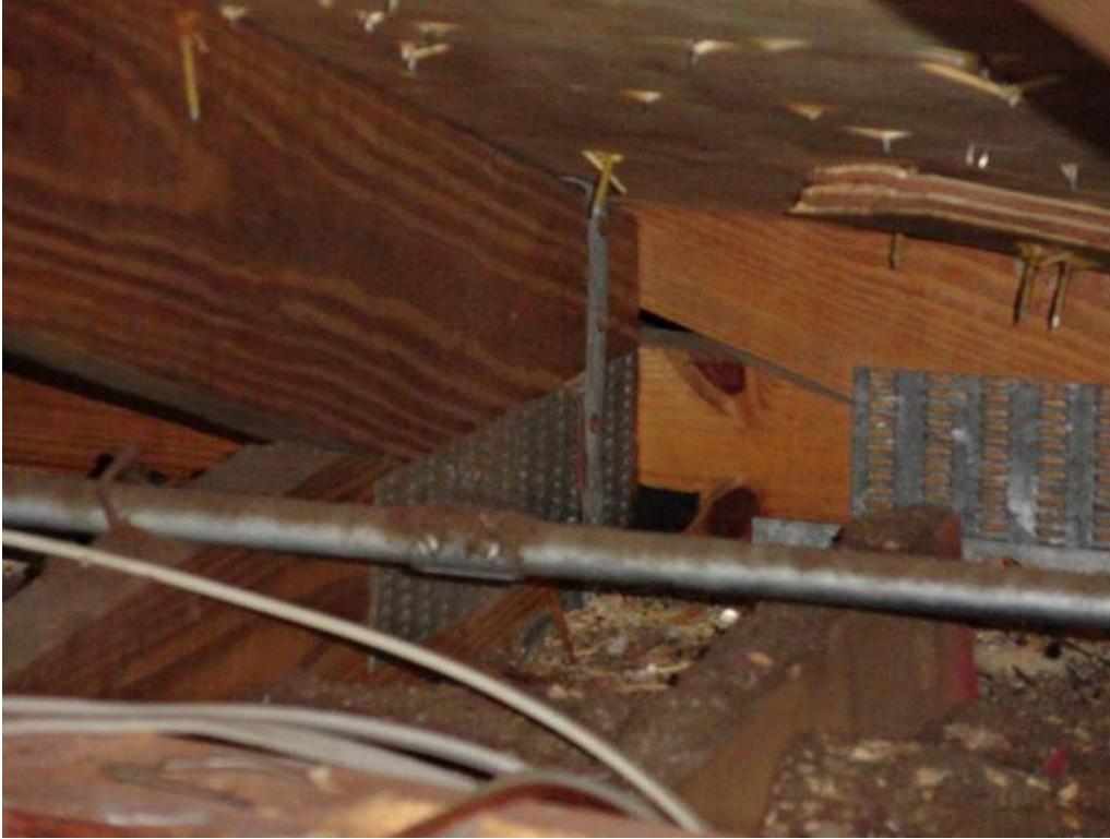
4. Roof to Wall Attachment – Single Wraps – Steel Straps w/ 2 Nails Min. at Face