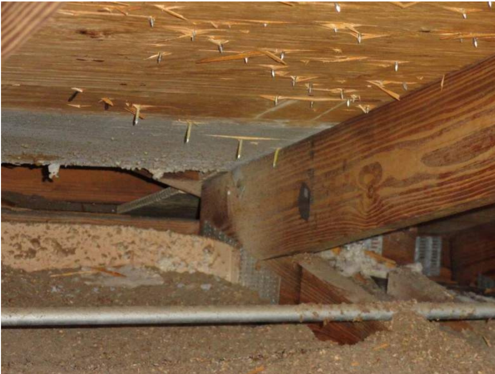
4. Roof to Wall Attachment – Single Wraps – Steel Straps w/ 1 Nail Min. at Back