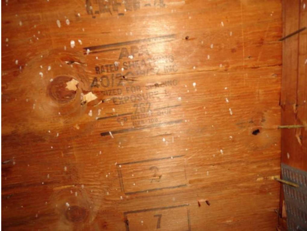
3. Roof Deck Attachment – 19/32" Plywood