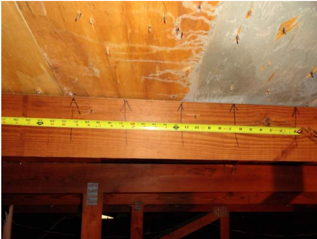
3. Roof Deck Attachment – Fasteners at 6" O. C. Max. In the Field