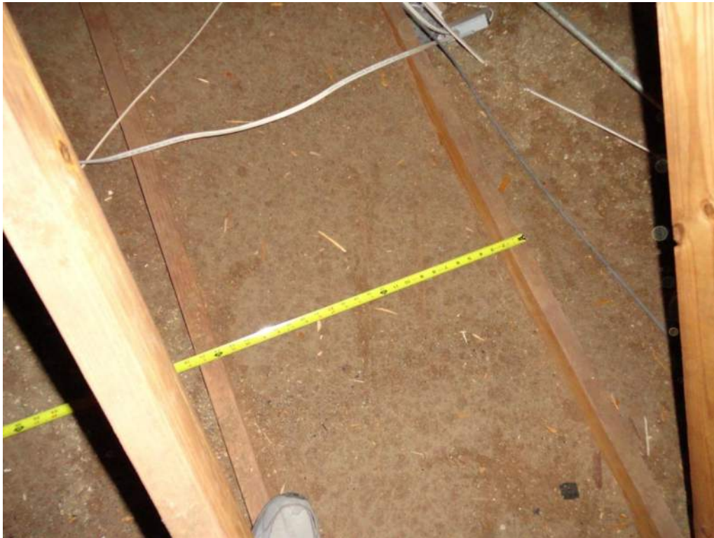
3. Roof Deck Attachment – Trusses at 24" O. C. Max.