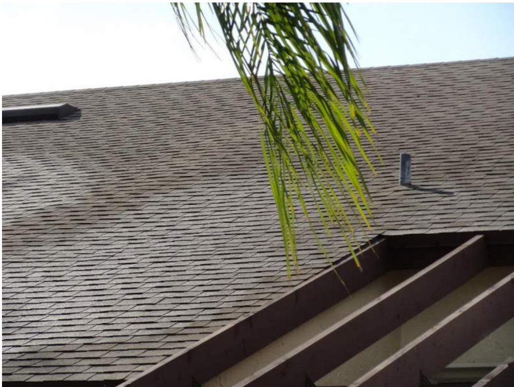
2. Roof Covering – Asphalt Shingles