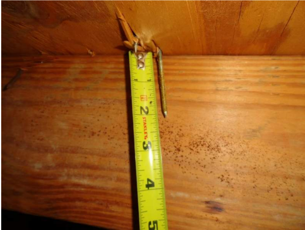
3. Roof Deck Attachment – 8d Nails