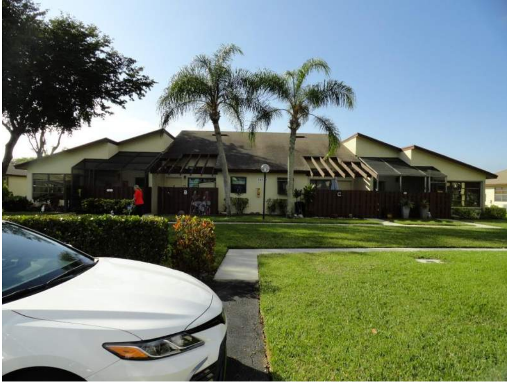
5. Roof Geometry – Front Elevation – Non-Hip