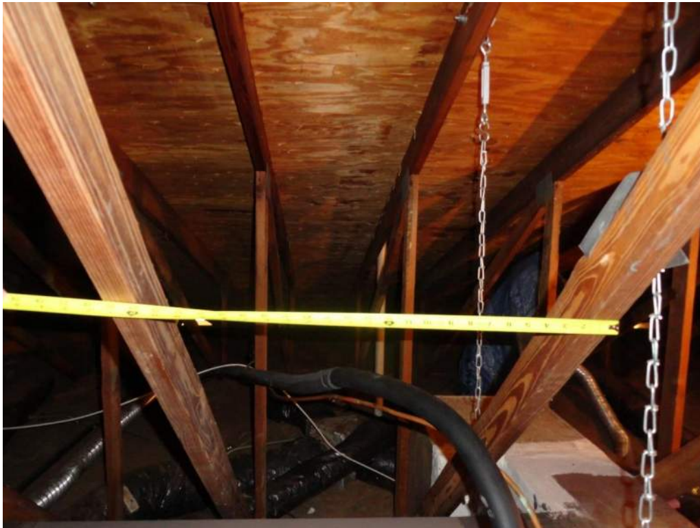
3. Roof Deck Attachment – Trusses at 24" O. C. Max.