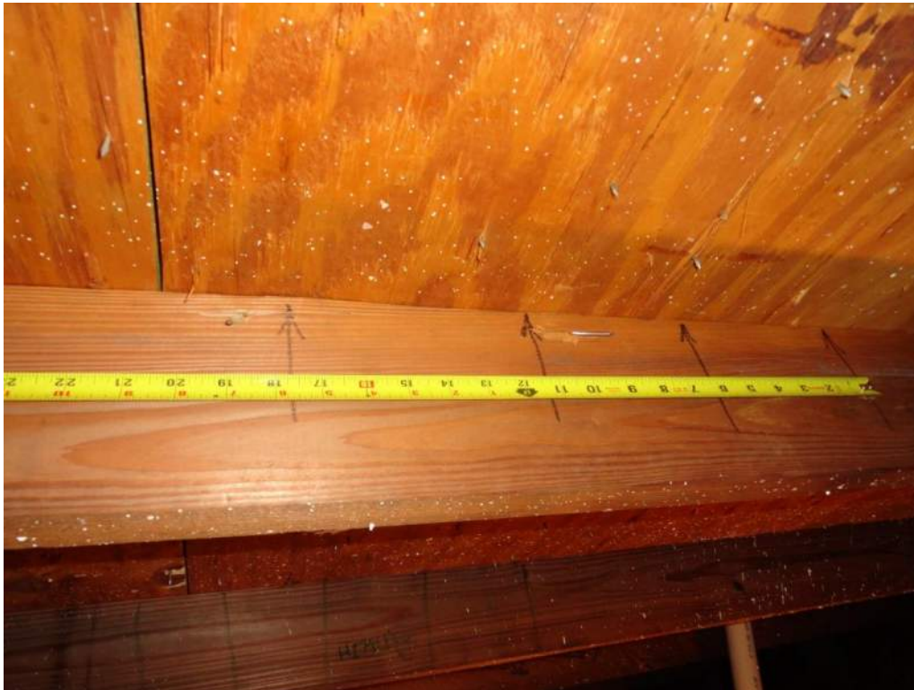
3. Roof Deck Attachment – Fasteners at 6" O. C. Max. In the Field