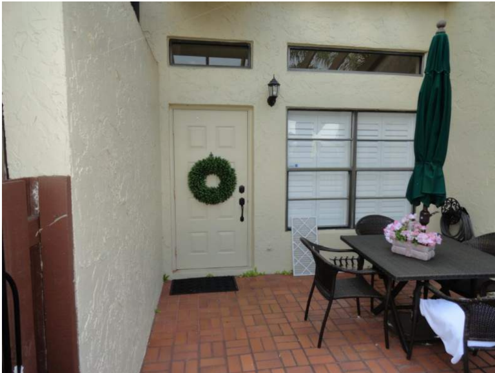
7. Opening Protection – Unprotected Unrated Unglazed Entry Door