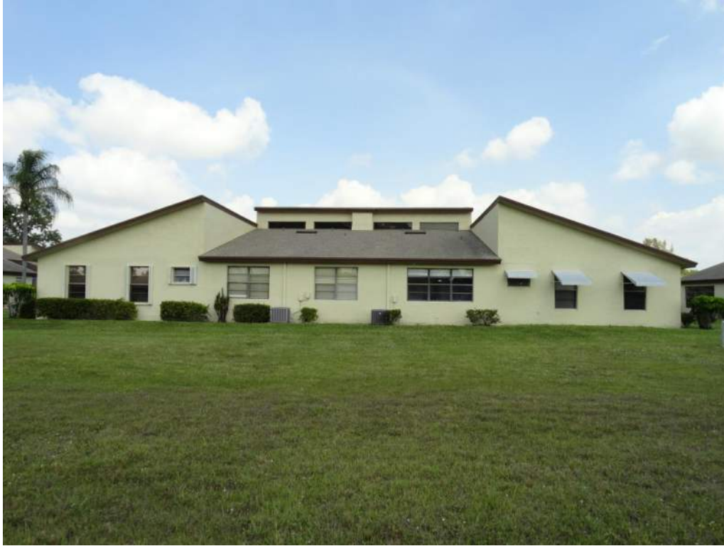
5. Roof Geometry – Rear Elevation – Non-Hip