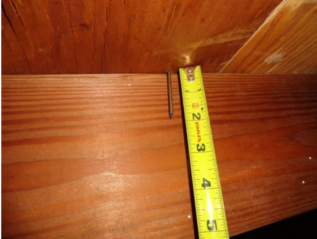
3. Roof Deck Attachment – 8d Nails