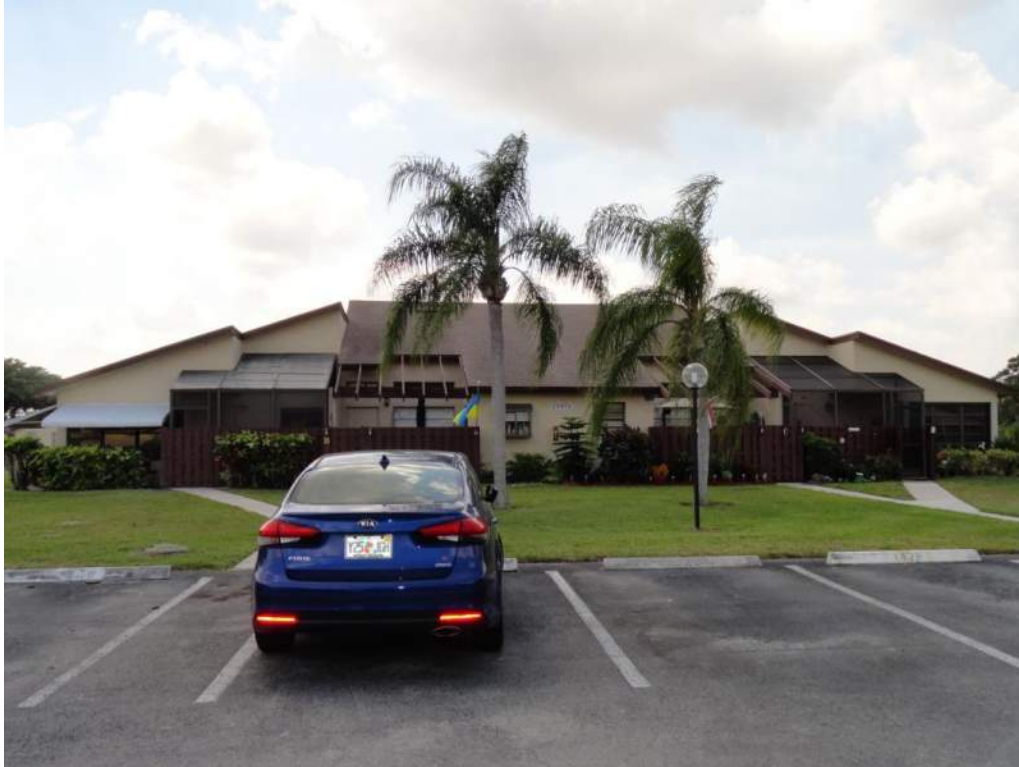
5. Roof Geometry – Front Elevation – Non-Hip