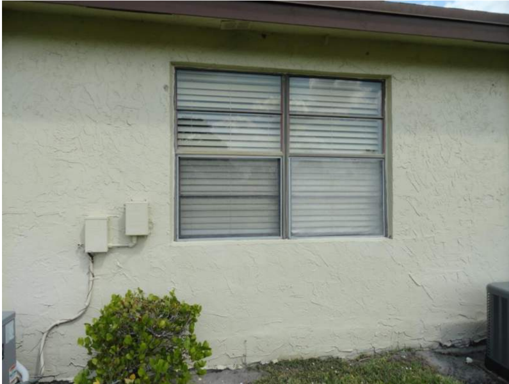
7. Opening Protection – Unrated Unprotected Windows