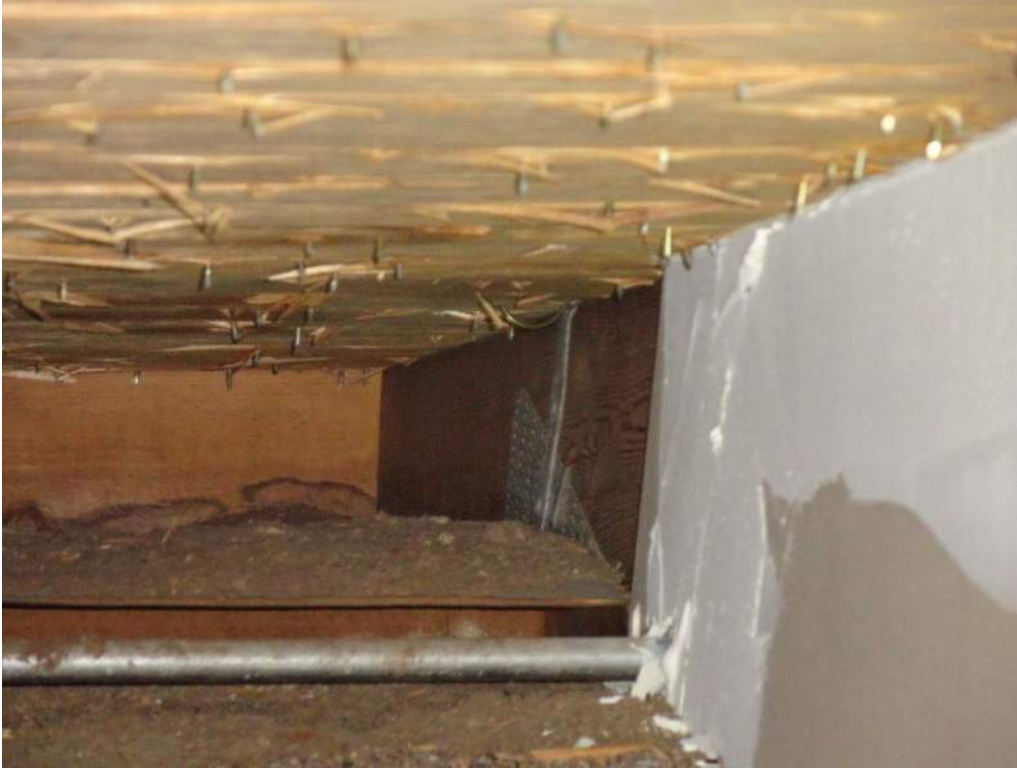
4. Roof to Wall Attachment – Single Wraps – Steel Straps w/ 2 Nails Min. at Face