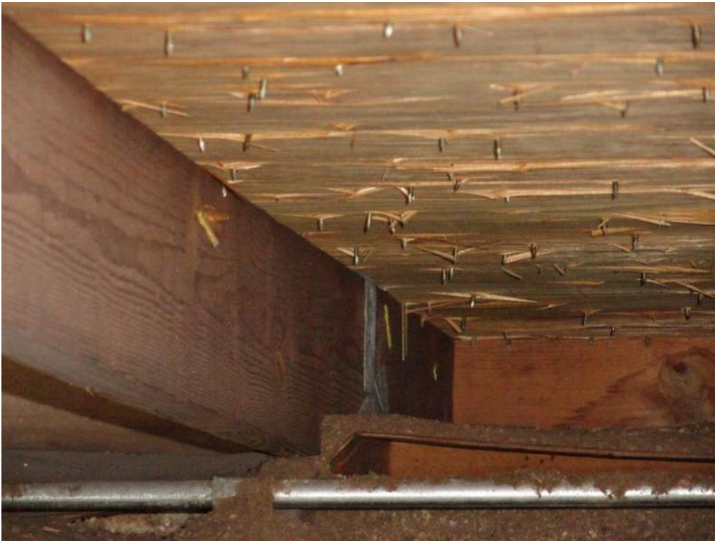
4. Roof to Wall Attachment – Single Wraps – Steel Straps w/ 1 Nail Min. at Back