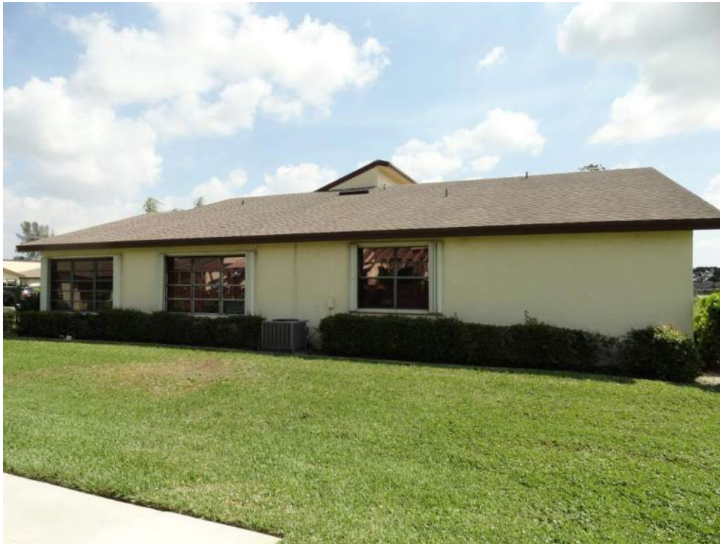
5. Roof Geometry – Right Elevation – Non-Hip