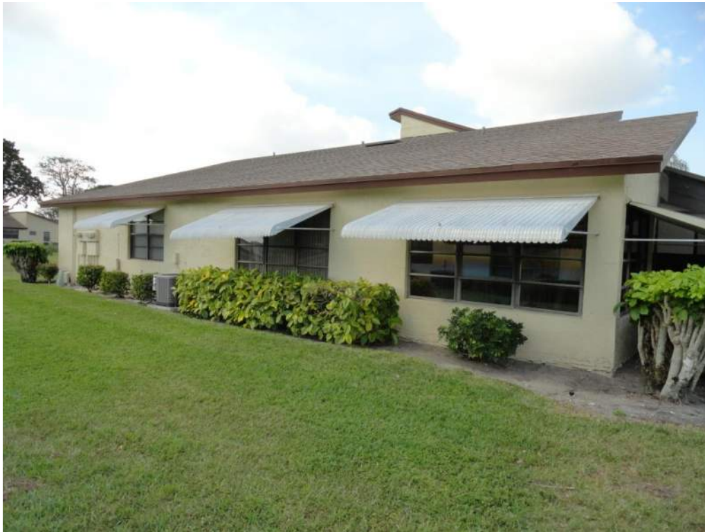
5. Roof Geometry – Left Elevation – Non-Hip