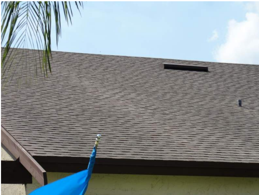
2. Roof Covering – Asphalt Shingles