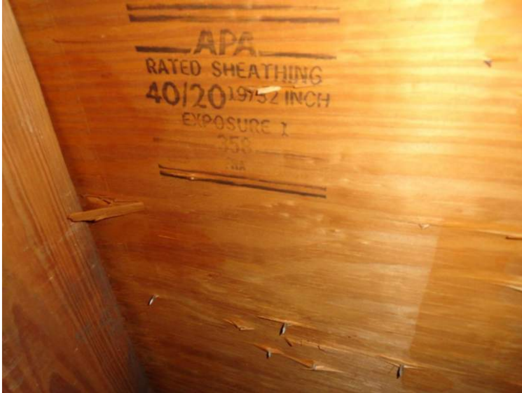
3. Roof Deck Attachment – 19/32" Plywood