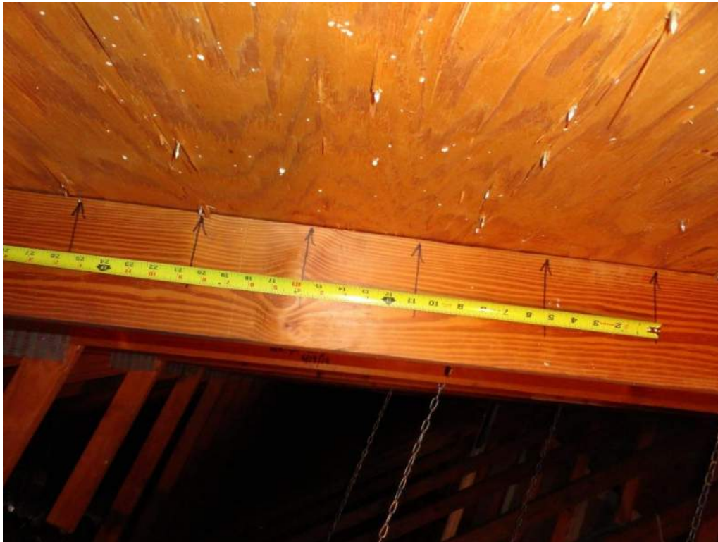
3. Roof Deck Attachment – Fasteners at 6" O. C. Max. In the Field