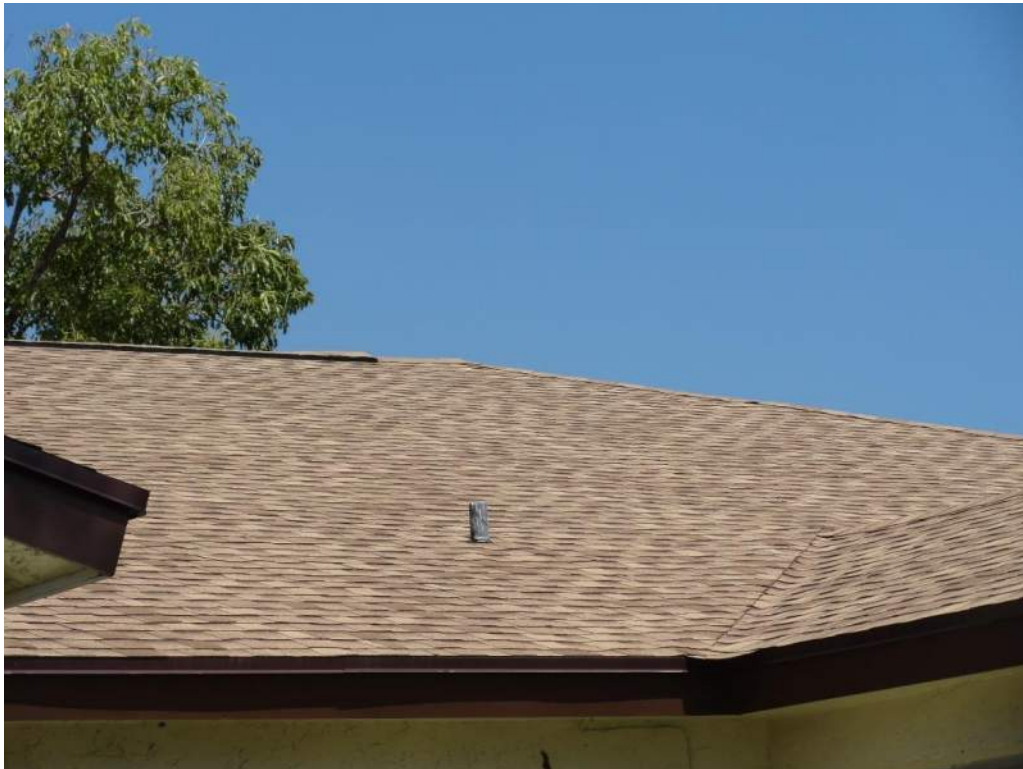
2. Roof Covering – Asphalt Shingles