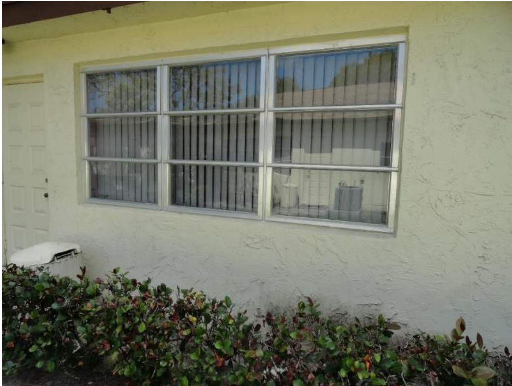
7. Opening Protection – Unrated Unprotected Windows