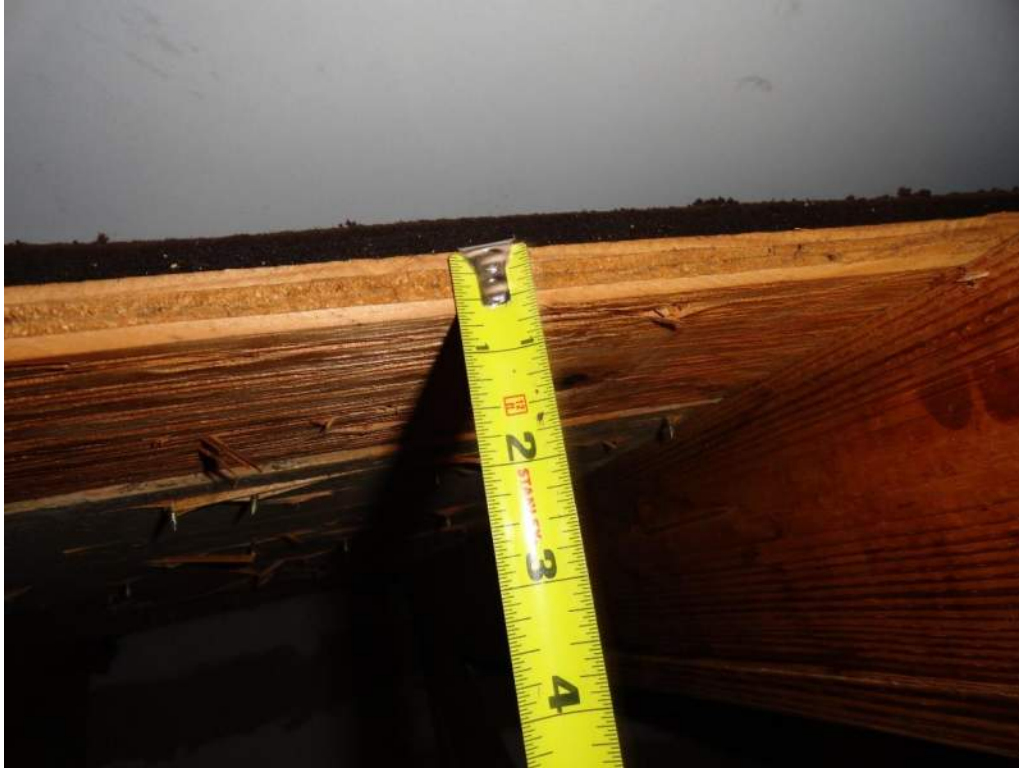
3. Roof Deck Attachment – 5/8" Plywood