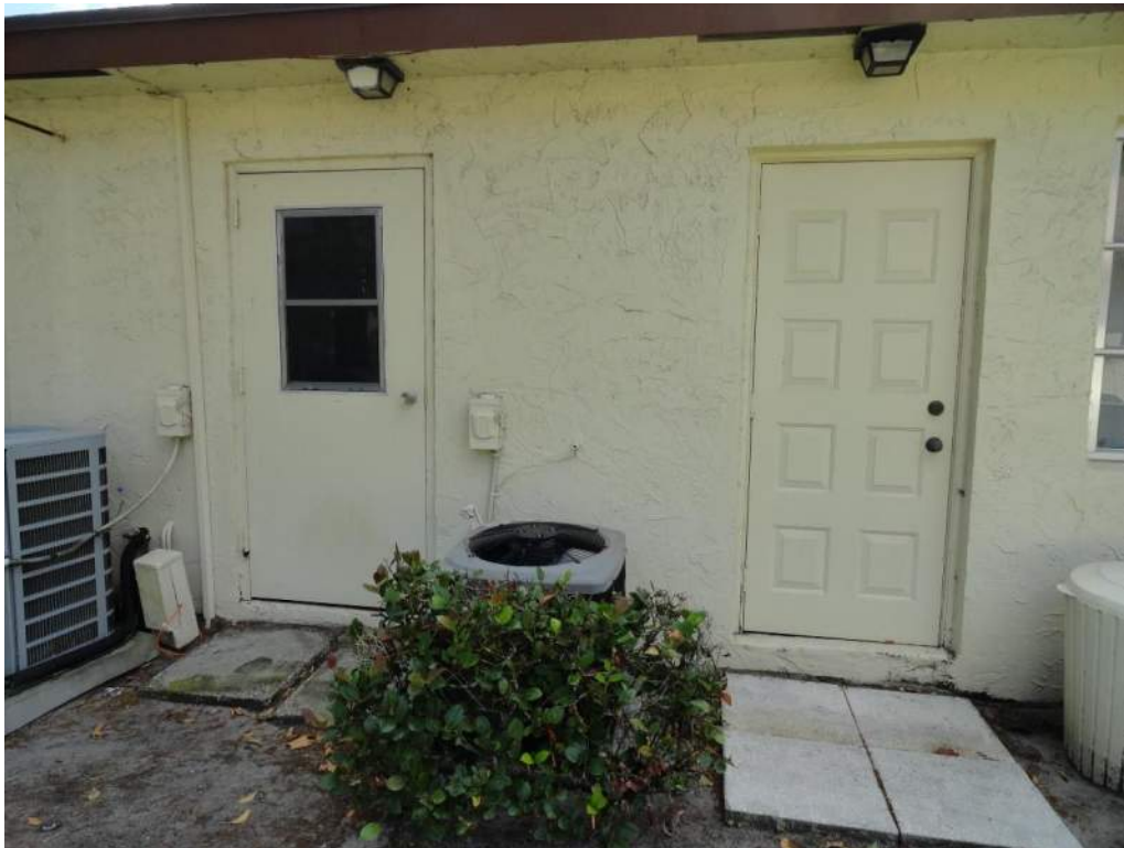
7. Opening Protection – Unprotected Unrated Unglazed Entry Door