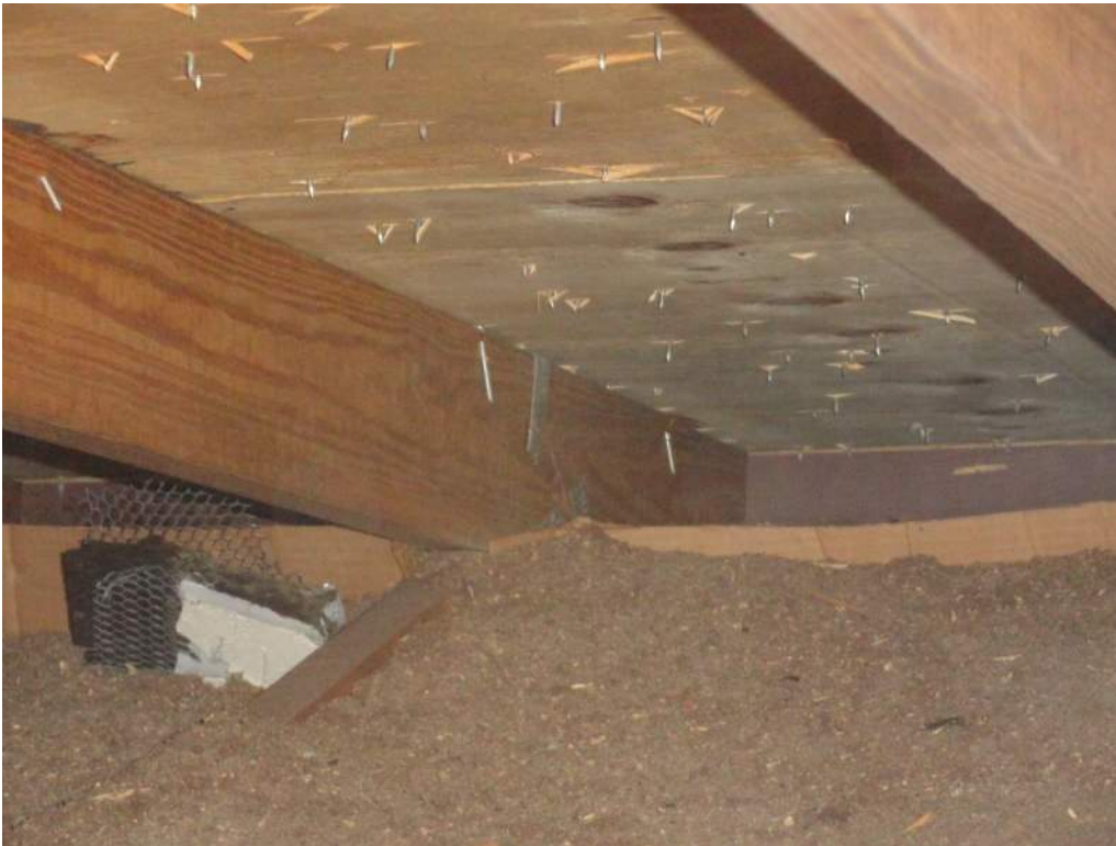
4. Roof to Wall Attachment – Single Wraps – Steel Straps w/ 1 Nail Min. at Back