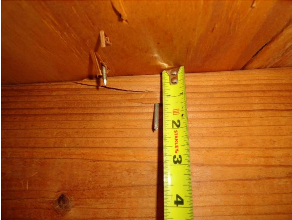
3. Roof Deck Attachment – 8d Nails