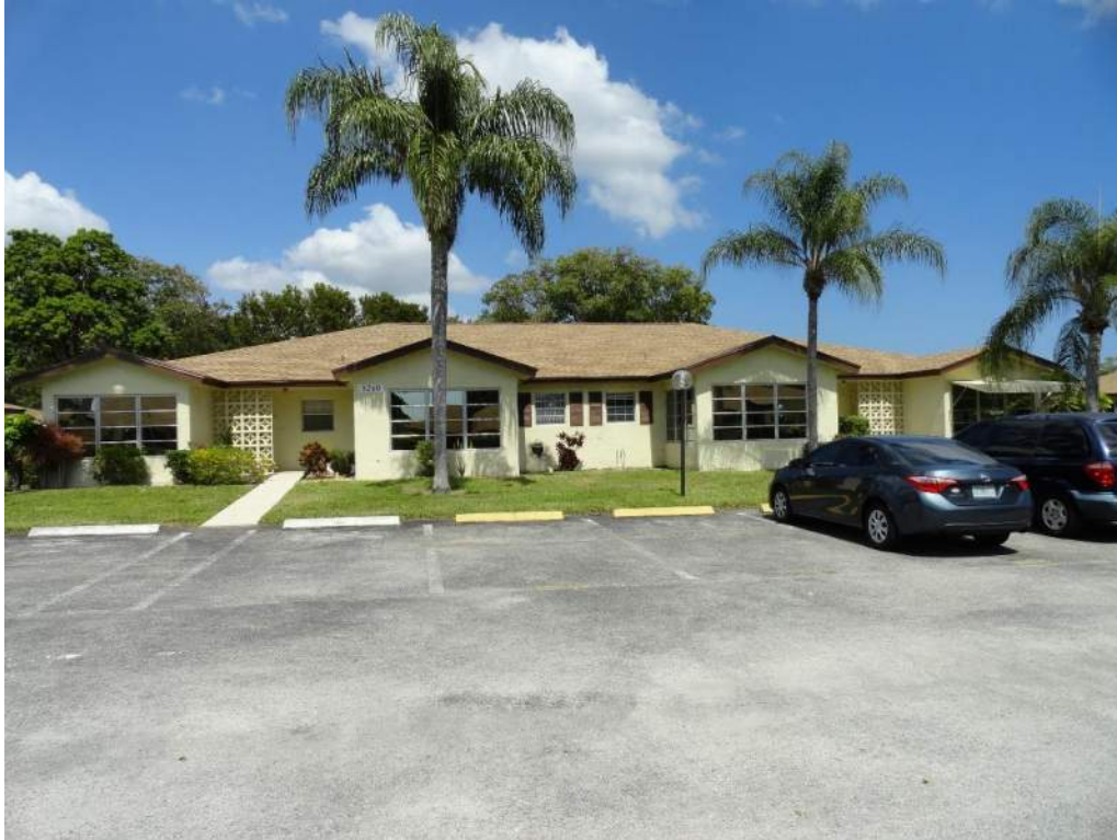
5. Roof Geometry – Front Elevation – Non-Hip