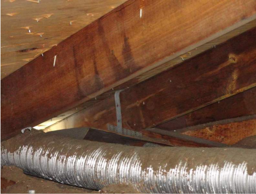
4. Roof to Wall Attachment – Single Wraps – Steel Straps w/ 2 Nails Min. at Face