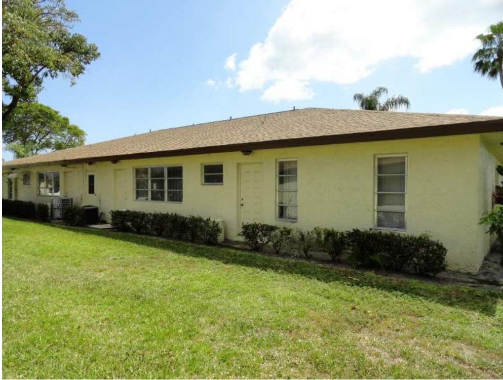
5. Roof Geometry – Rear Elevation – Hip