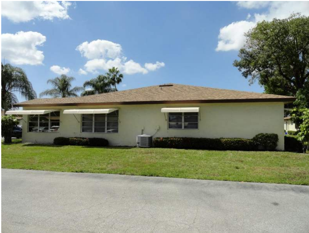
5. Roof Geometry – Right Elevation – Hip