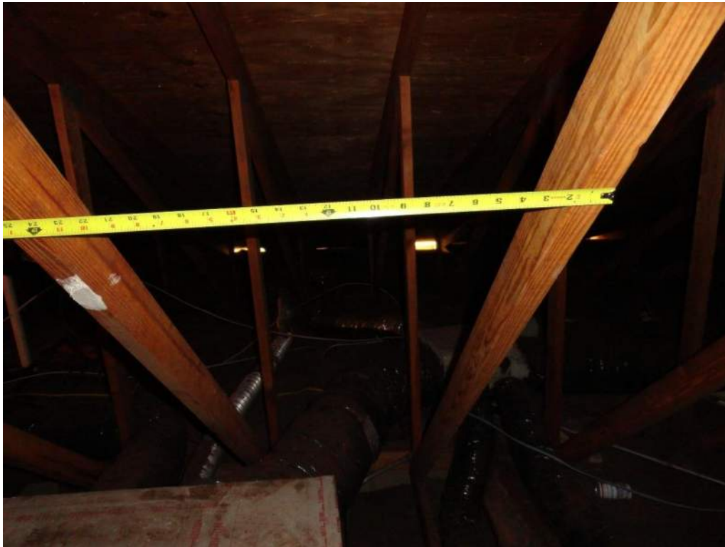
3. Roof Deck Attachment – Trusses at 24" O. C. Max.