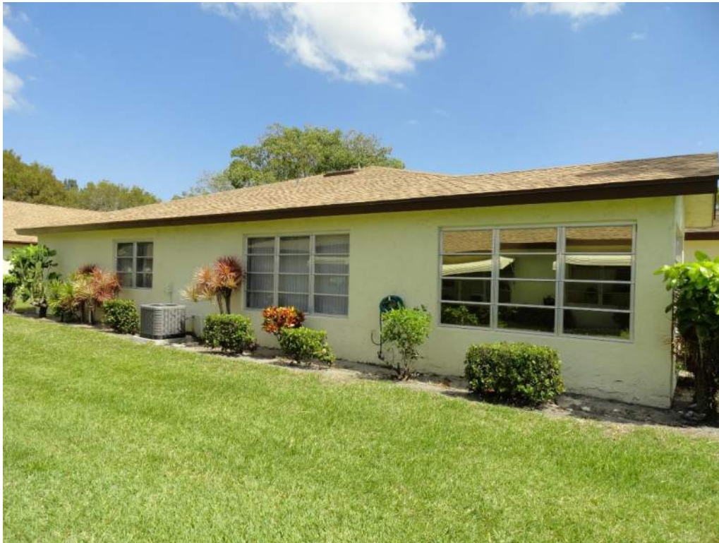
5. Roof Geometry – Left Elevation – Hip