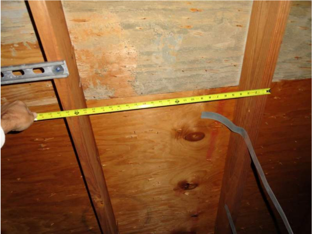
3. Roof Deck Attachment – Trusses at 24” O. C. Max.