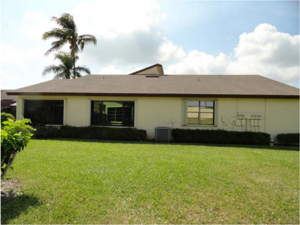
5. Roof Geometry – Right Elevation – Non-Hip