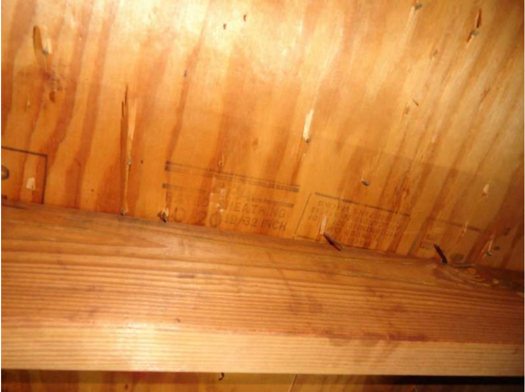
3. Roof Deck Attachment – 19/32” Plywood