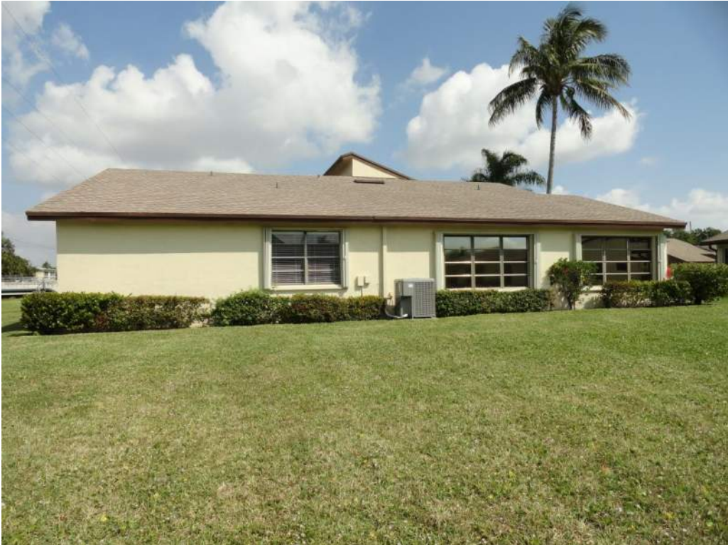
5. Roof Geometry – Left Elevation – Non-Hip