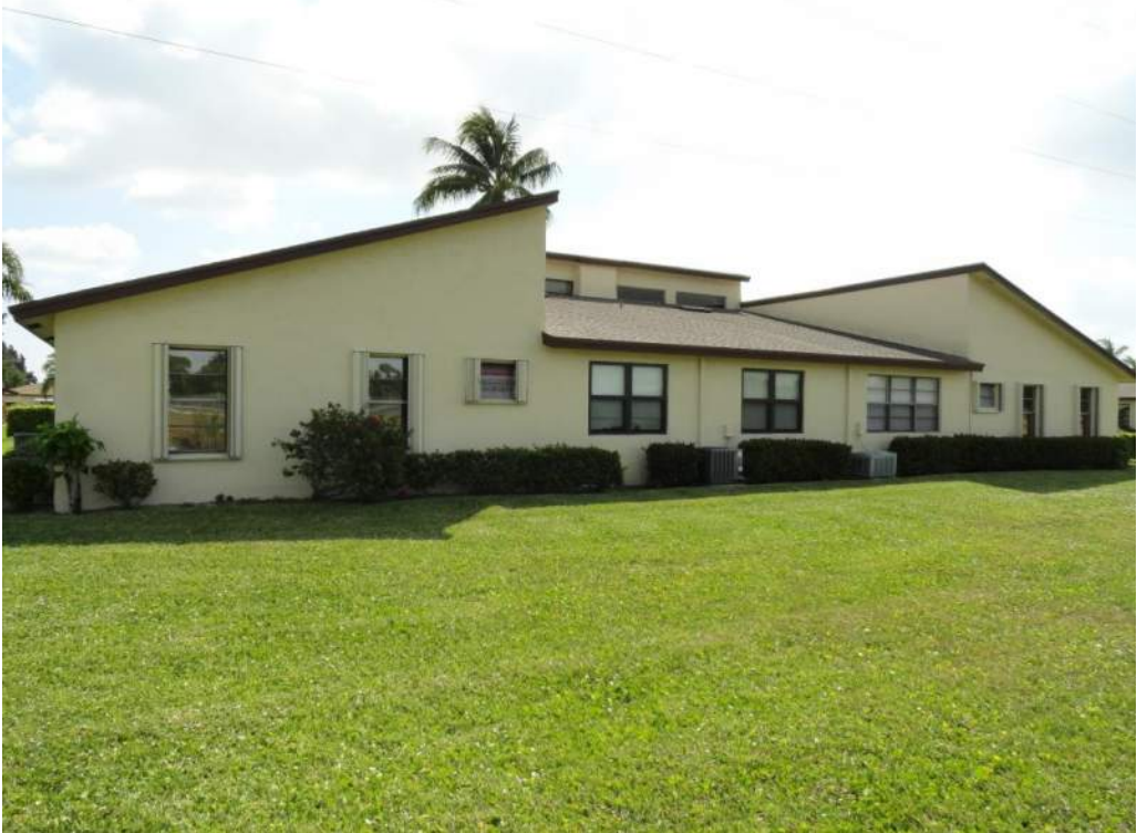
5. Roof Geometry – Rear Elevation – Non-Hip