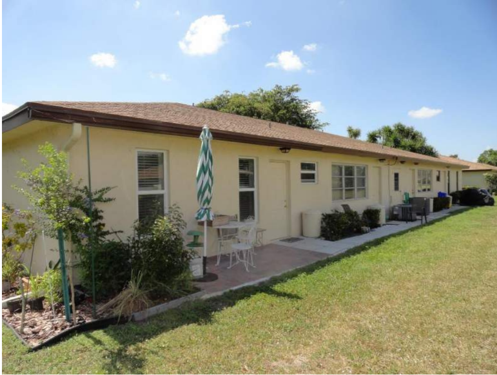
5. Roof Geometry – Rear Elevation – Hip