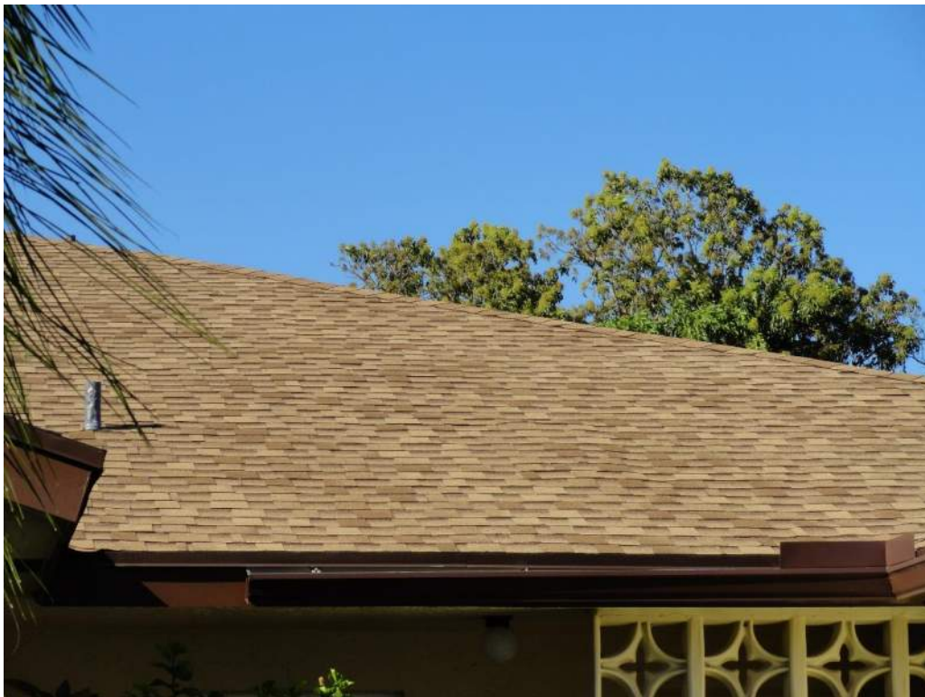
2. Roof Covering – Asphalt Shingles