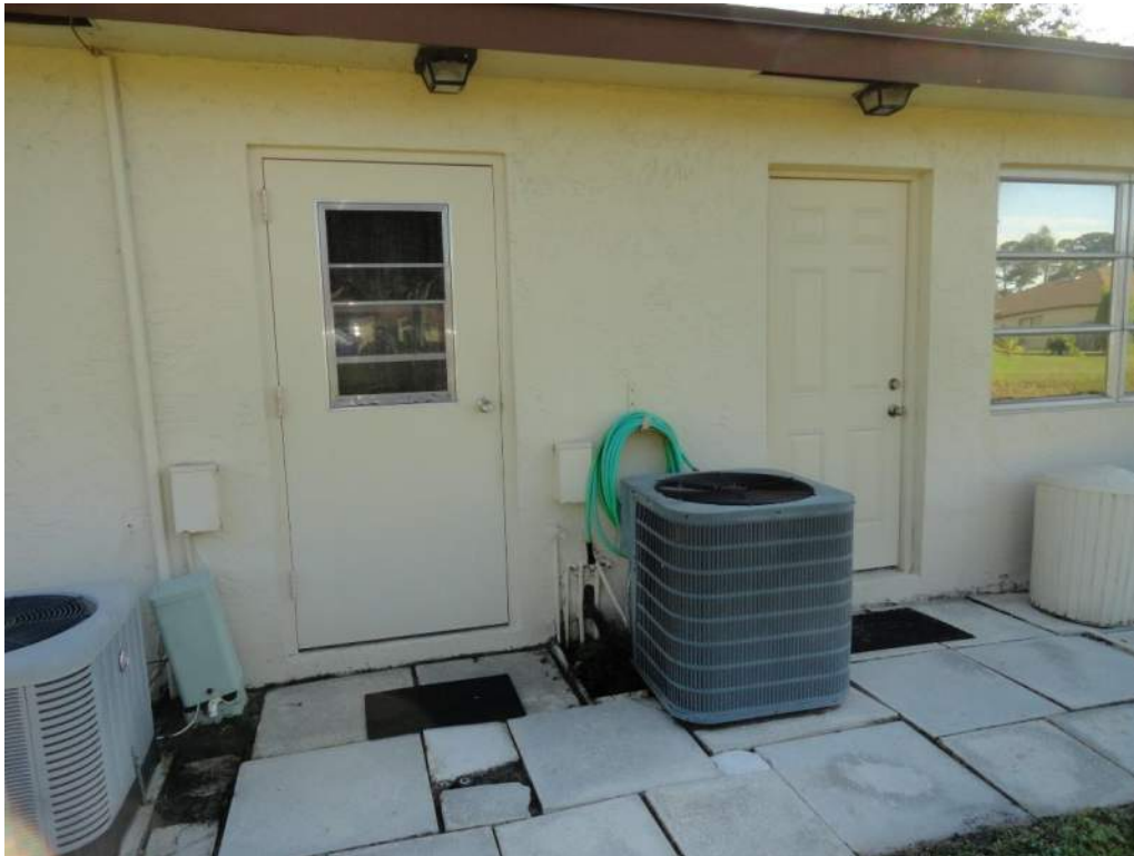
7. Opening Protection – Unprotected Unrated Unglazed Entry Door