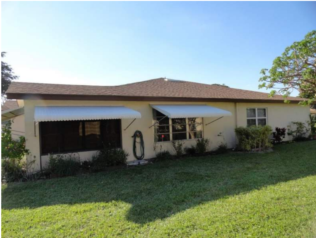
5. Roof Geometry – Right Elevation – Hip