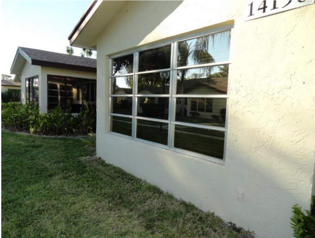
7. Opening Protection – Unprotected Unrated Windows