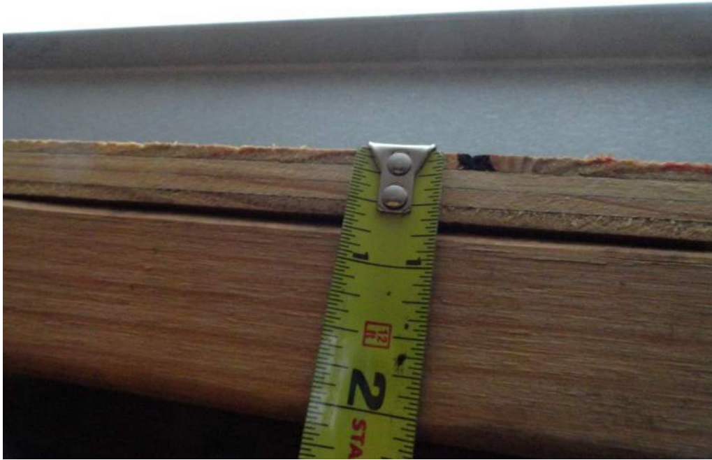
3. Roof Deck Attachment – 5/8" Plywood