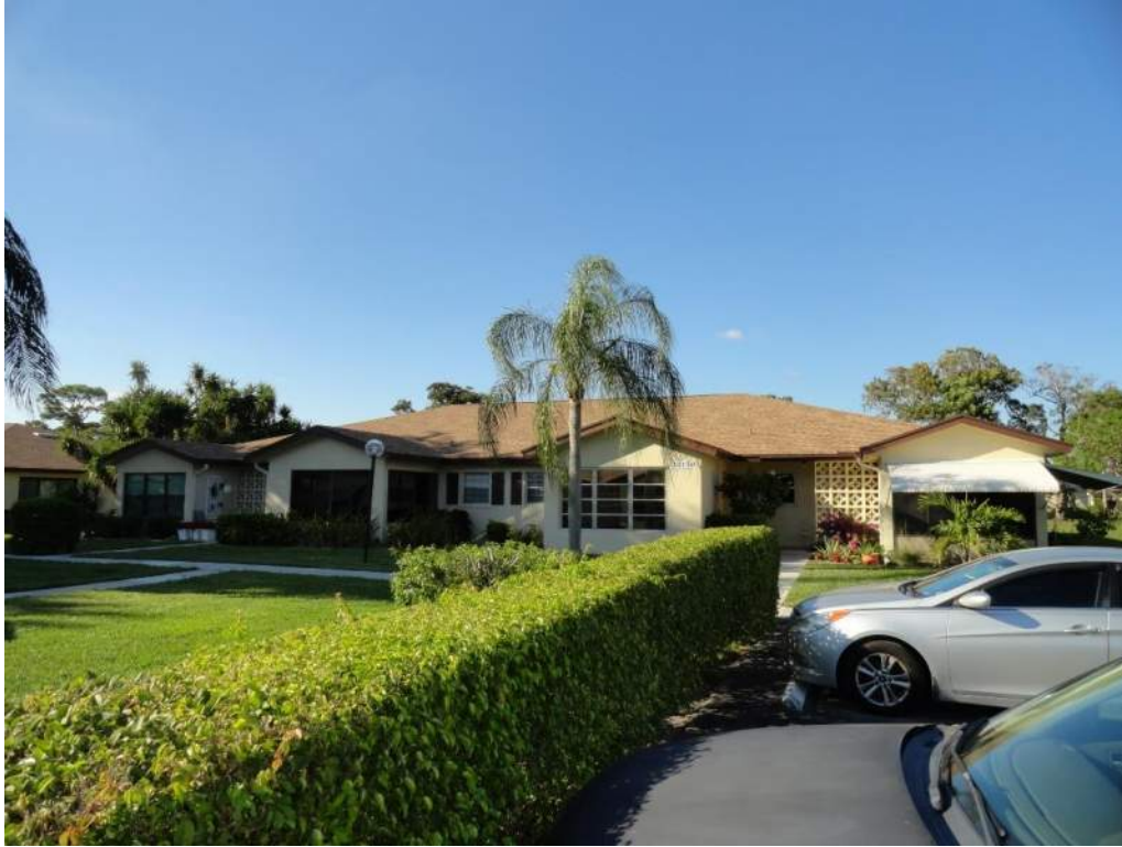
5. Roof Geometry – Front Elevation – Non-Hip