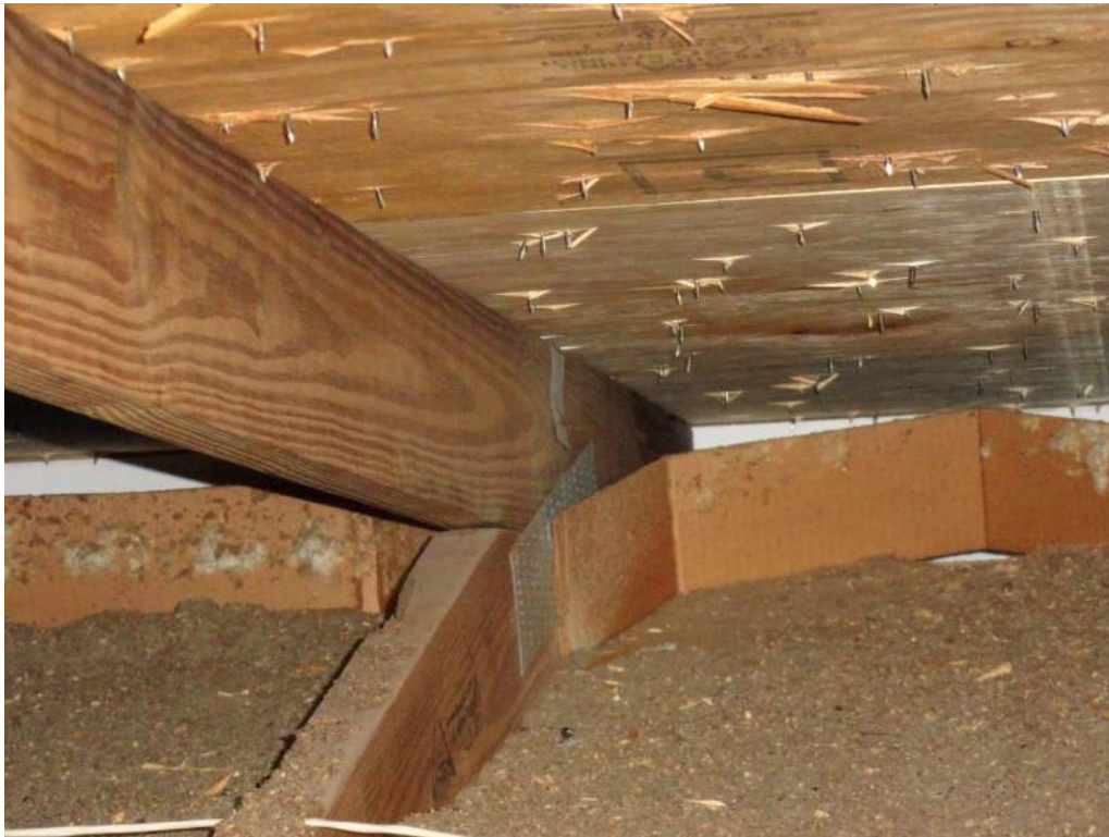
4. Roof to Wall Attachment – Single Wraps – Steel Straps w/ 1 Nail Min. at Back