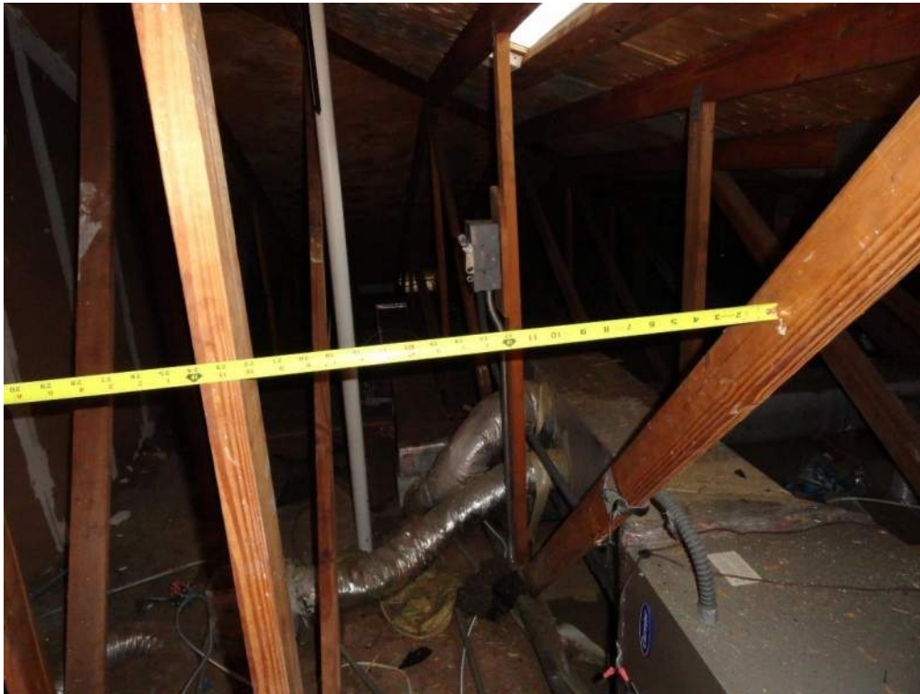
3. Roof Deck Attachment – Trusses at 24" O. C. Max.