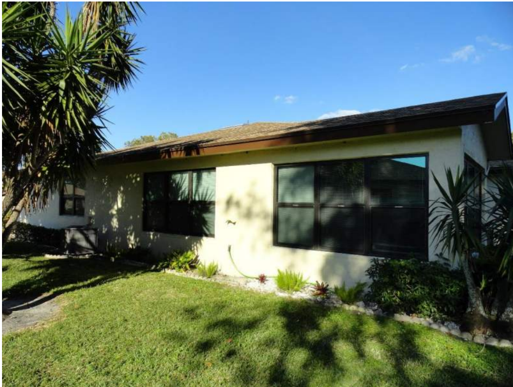
5. Roof Geometry – Left Elevation – Hip