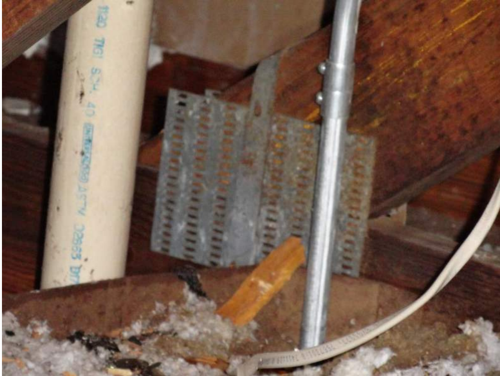
4. Roof to Wall Attachment – Single Wraps – Steel Straps w/ 2 Nails Min. at Face