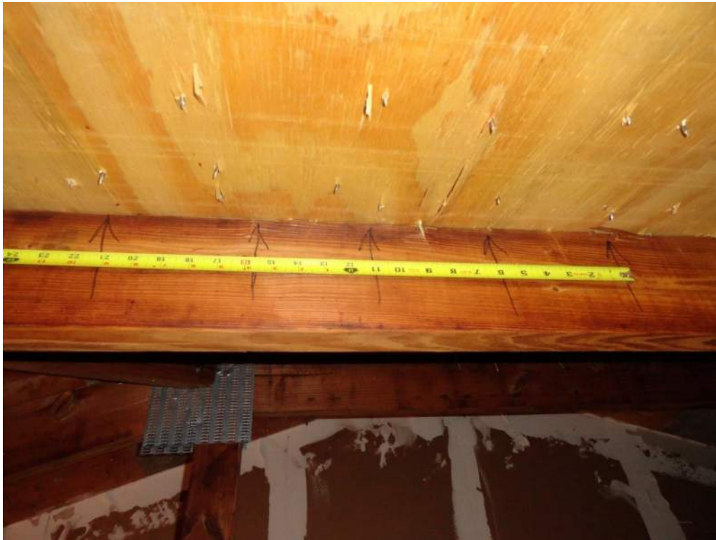
3. Roof Deck Attachment – Fasteners at 6" O. C. Max. In the Field