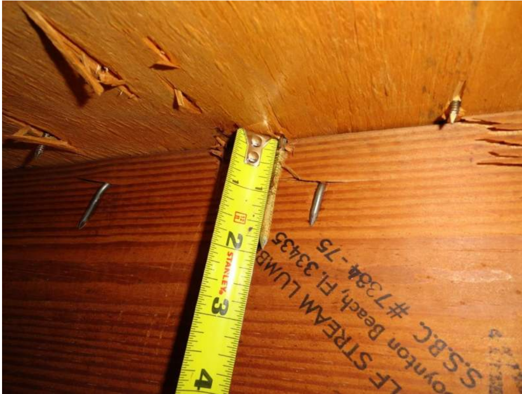
3. Roof Deck Attachment – 8d Nails