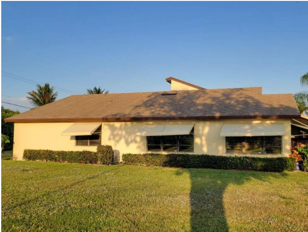
5. Roof Geometry – Left Elevation – Non-Hip