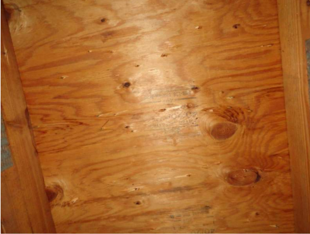
3. Roof Deck Attachment – 19/32" Plywood