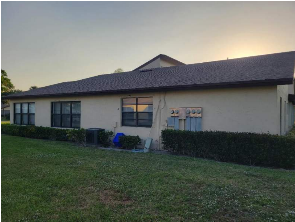
5. Roof Geometry – Right Elevation – Non-Hip