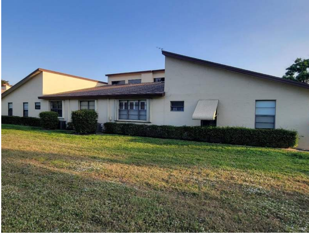
5. Roof Geometry – Rear Elevation – Non-Hip