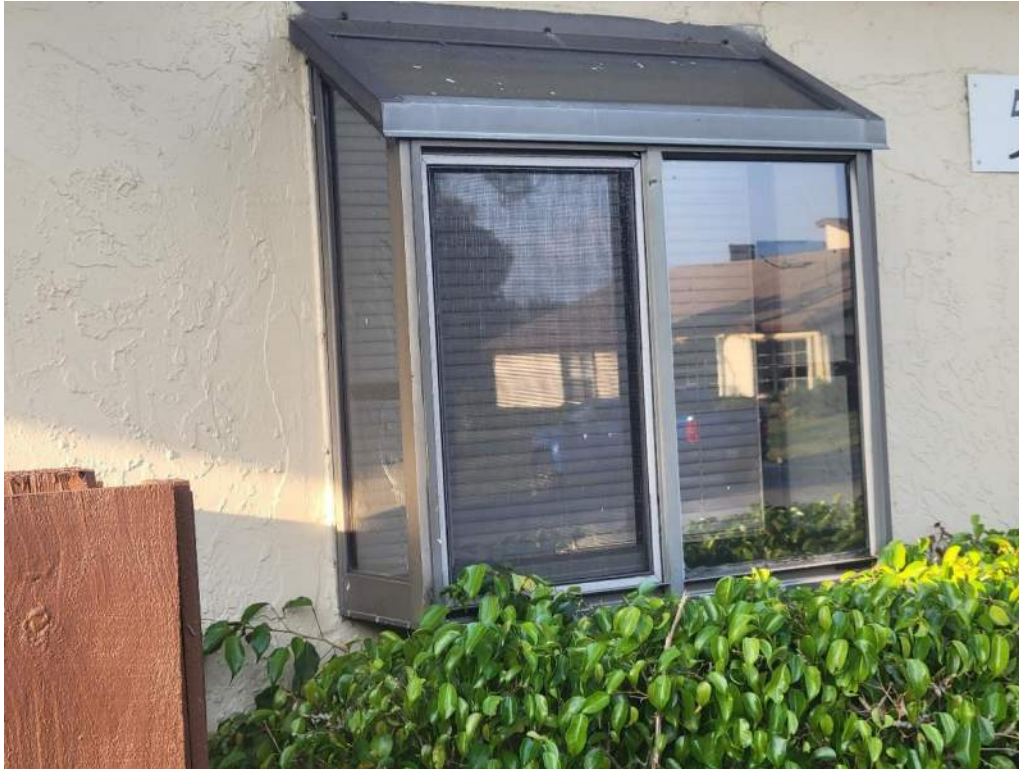
7. Opening Protection – Unrated Unprotected Windows