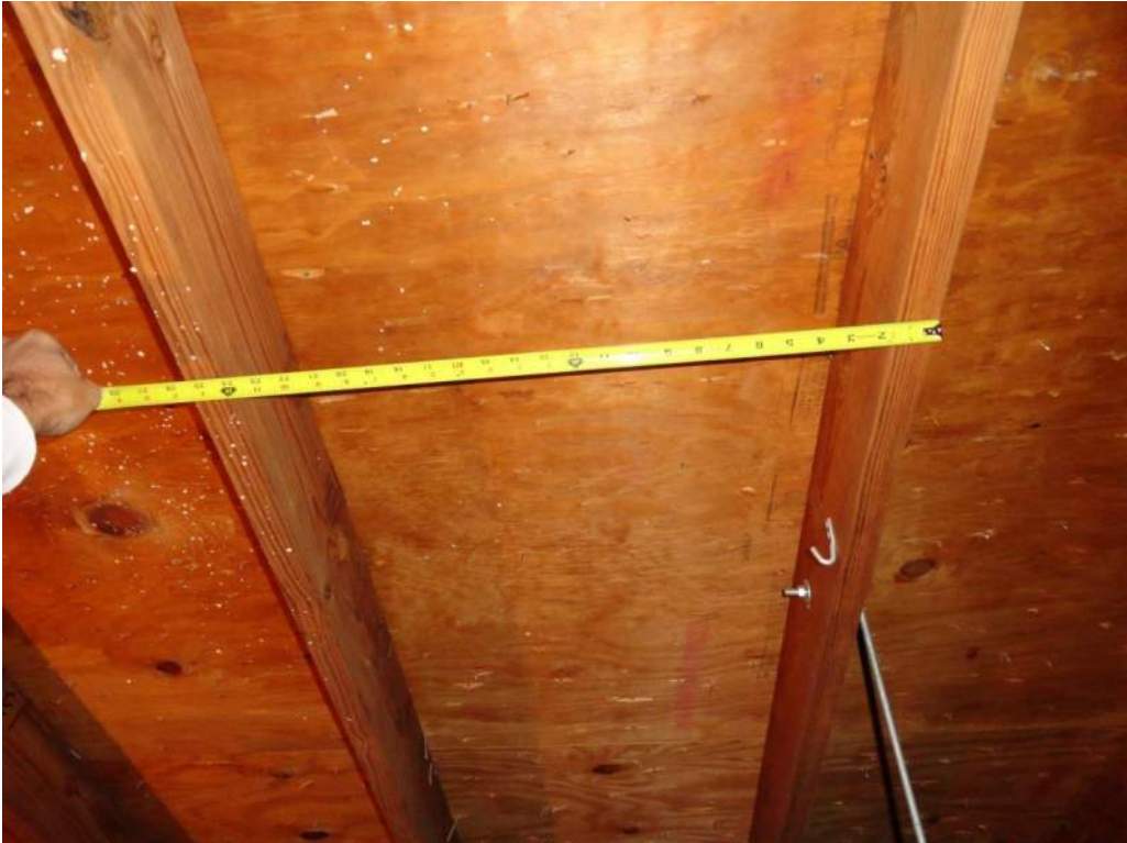
3. Roof Deck Attachment – Trusses at 24” O. C. Max.