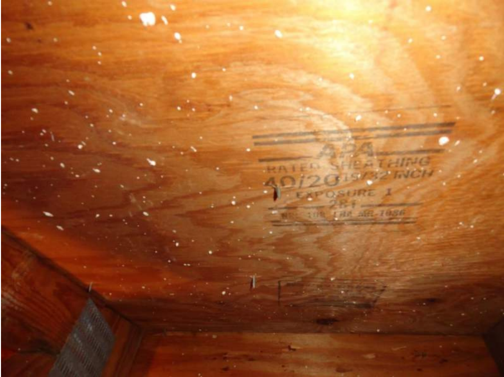
3. Roof Deck Attachment – 19/32” Plywood