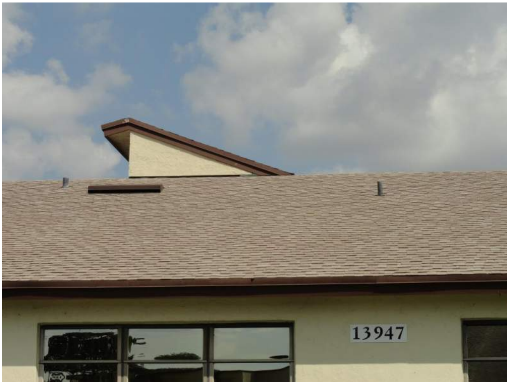
2. Roof Covering – Asphalt Shingles