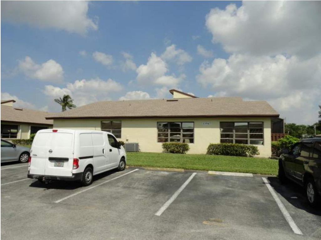
5. Roof Geometry – Left Elevation – Non-Hip