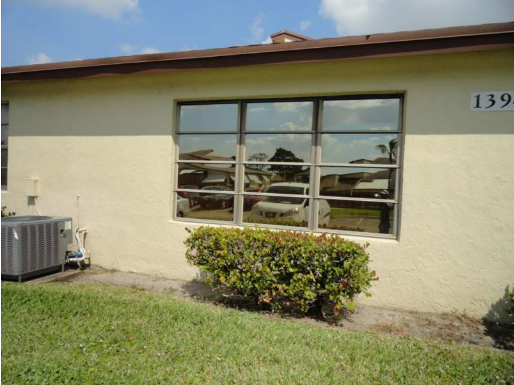
7. Opening Protection – Unrated Unprotected Windows