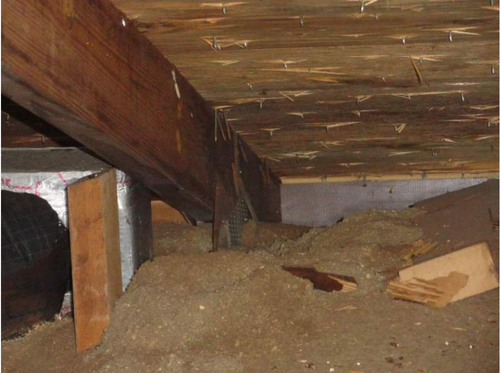
4. Roof to Wall Attachment – Single Wraps – Steel Straps w/ 2 Nails Min. at Face