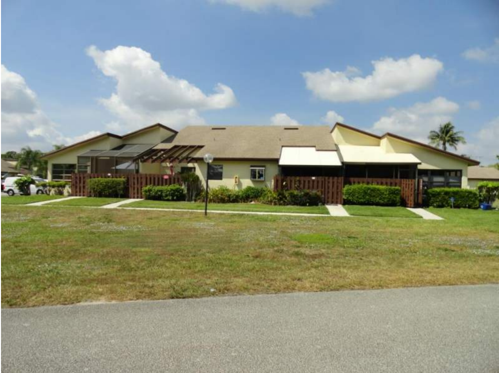
5. Roof Geometry – Rear Elevation – Non-Hip