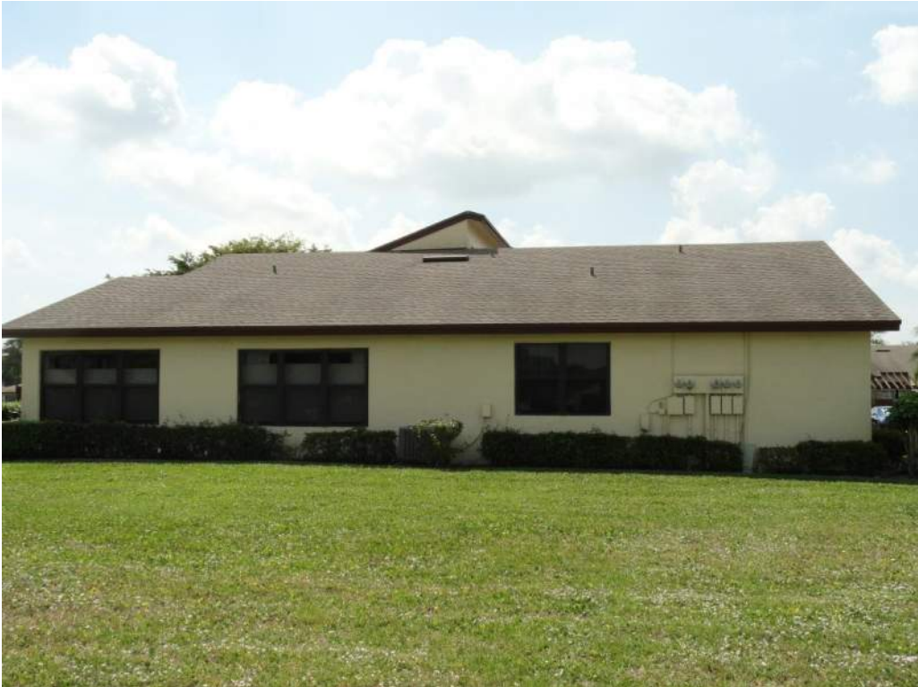
5. Roof Geometry – Right Elevation – Non-Hip