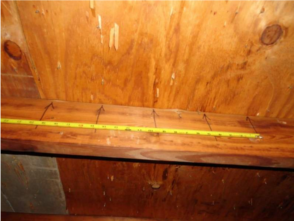
3. Roof Deck Attachment – Fasteners at 6" O. C. Max. In the Field