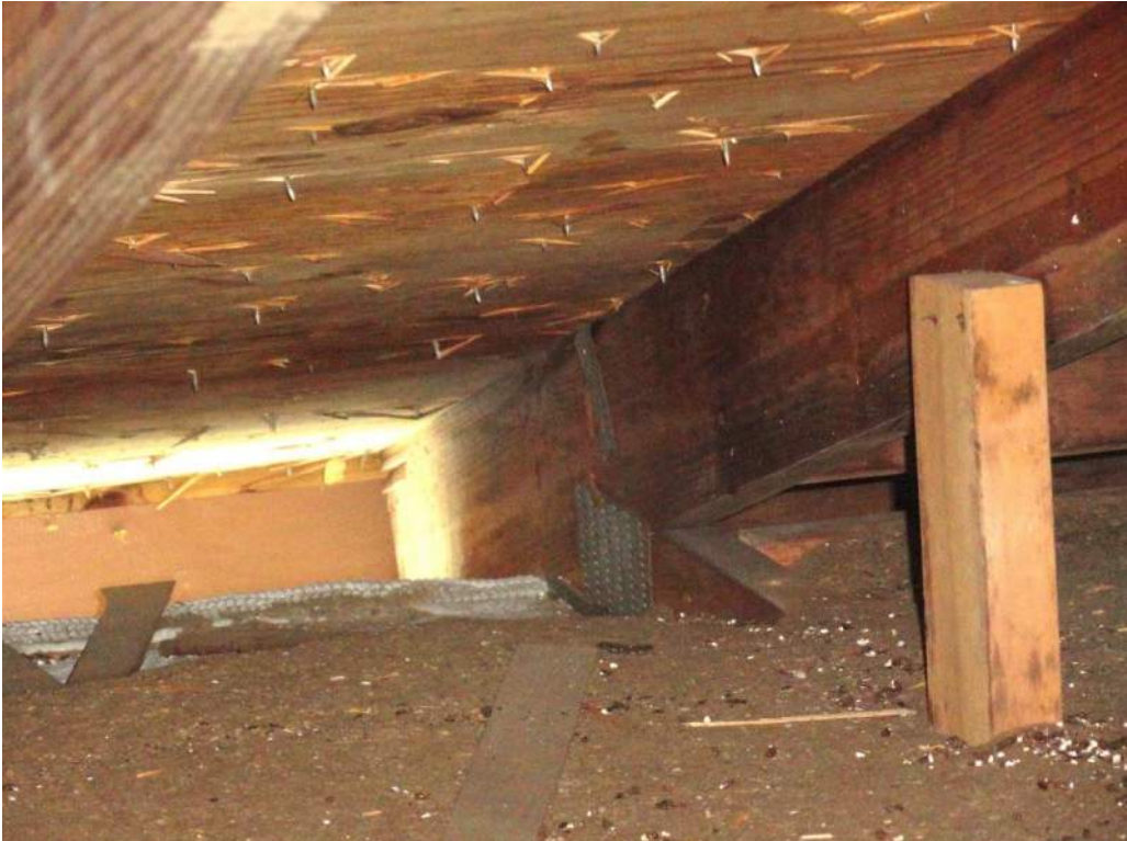
4. Roof to Wall Attachment – Single Wraps – Steel Straps w/ 1 Nail Min. at Back