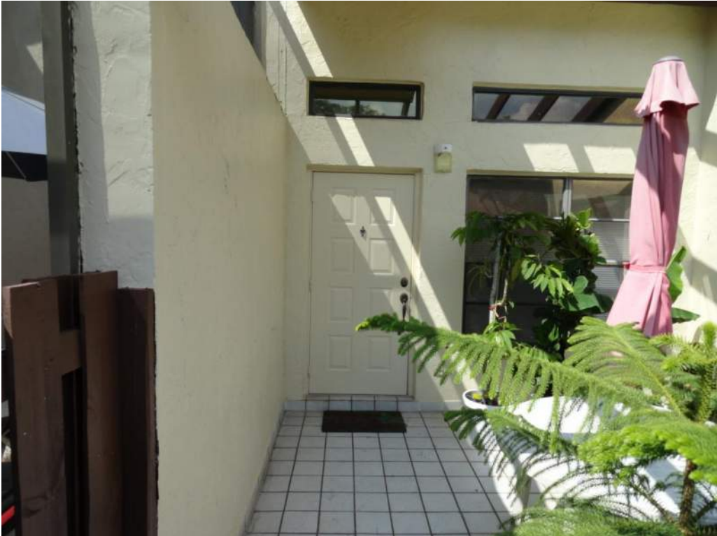
7. Opening Protection – Unprotected Unrated Unglazed Entry Door