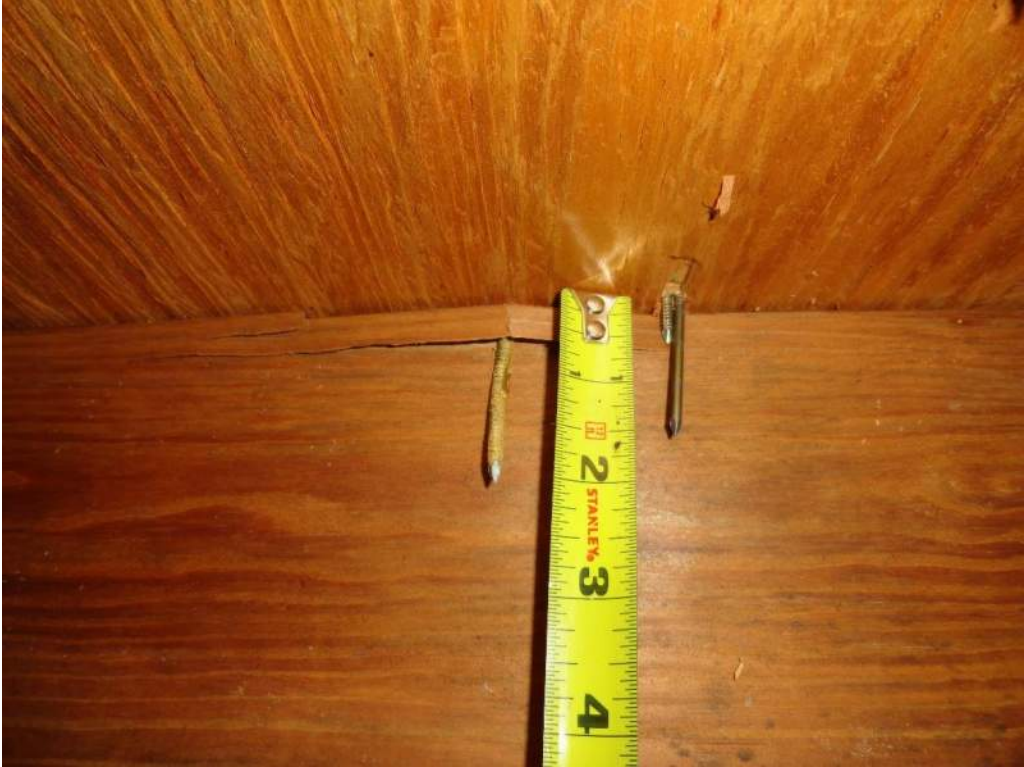
3. Roof Deck Attachment – 8d Nails