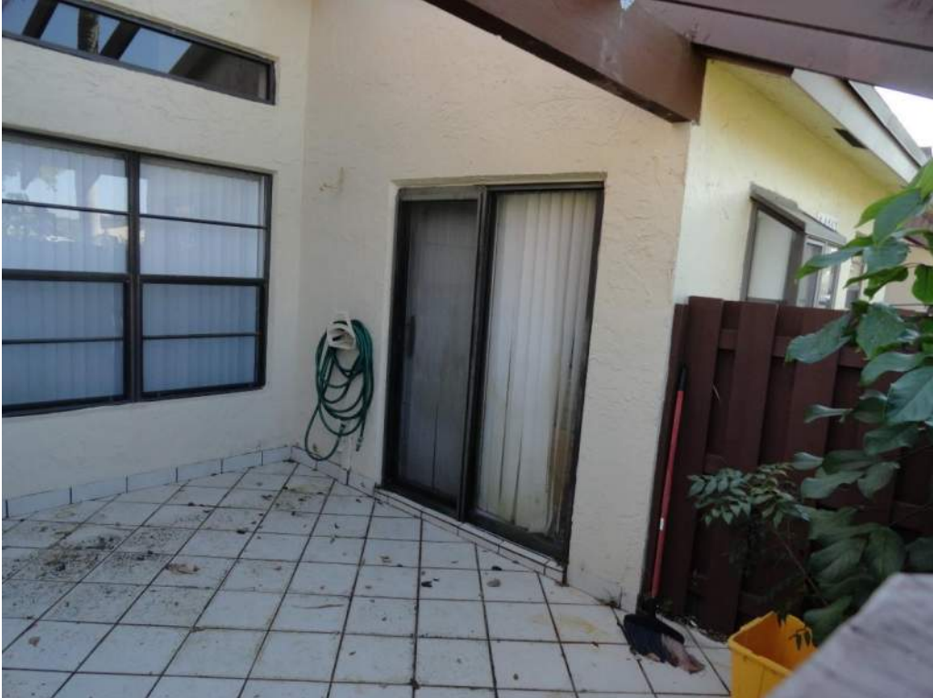
7. Opening Protection – Unprotected Unrated Windows