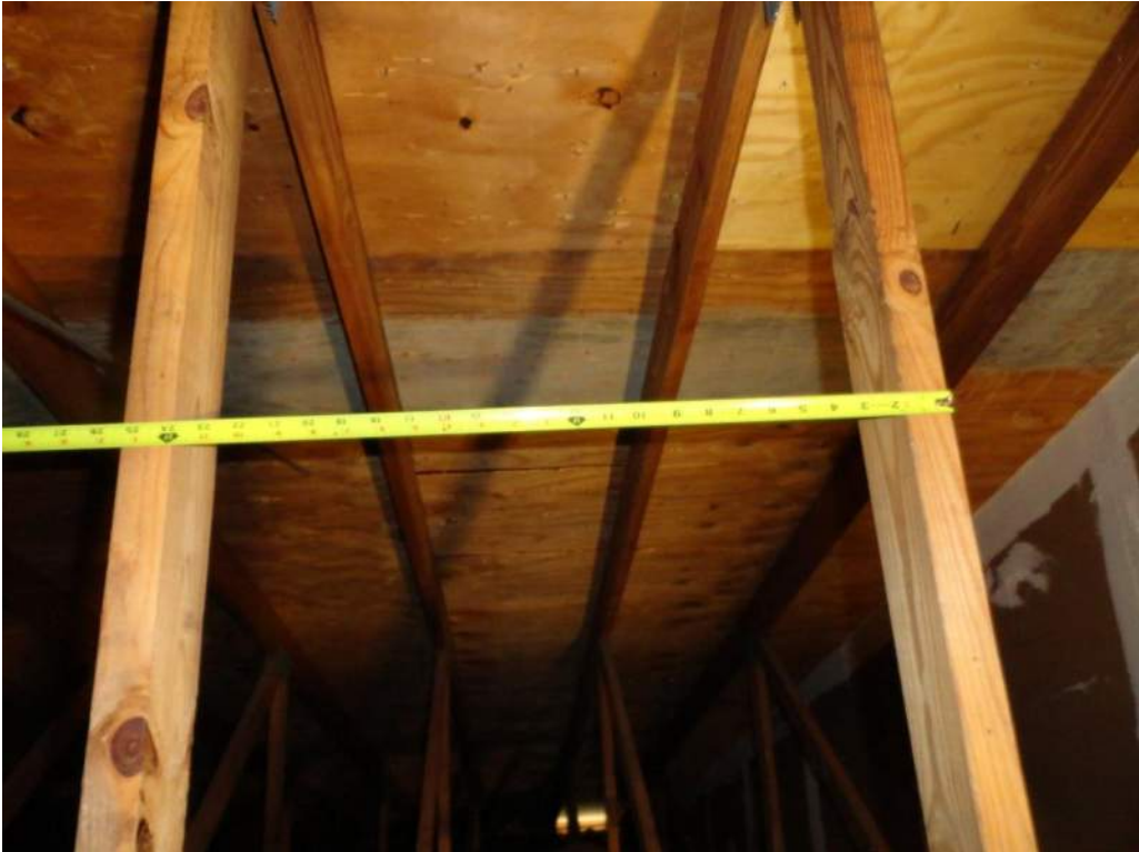
3. Roof Deck Attachment – Trusses at 24” O. C. Max.