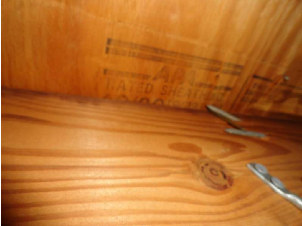
3. Roof Deck Attachment – 19/32” Plywood