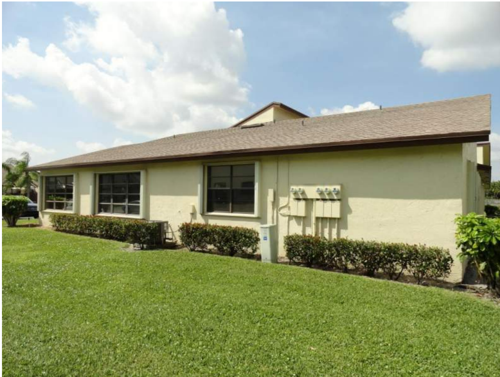
5. Roof Geometry – Right Elevation – Non-Hip