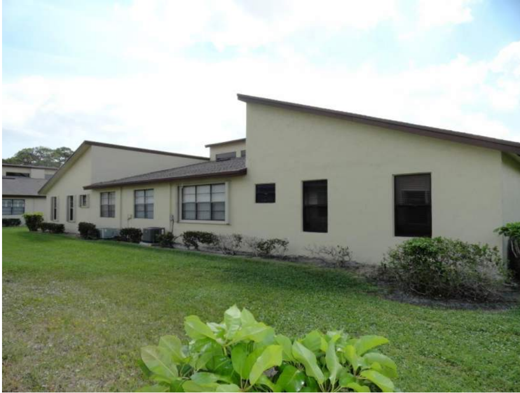
5. Roof Geometry – Rear Elevation – Non-Hip