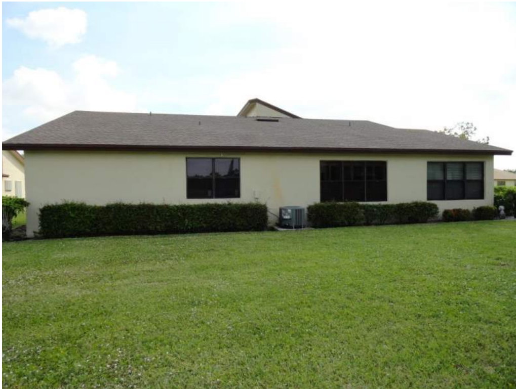
5. Roof Geometry – Left Elevation – Non-Hip