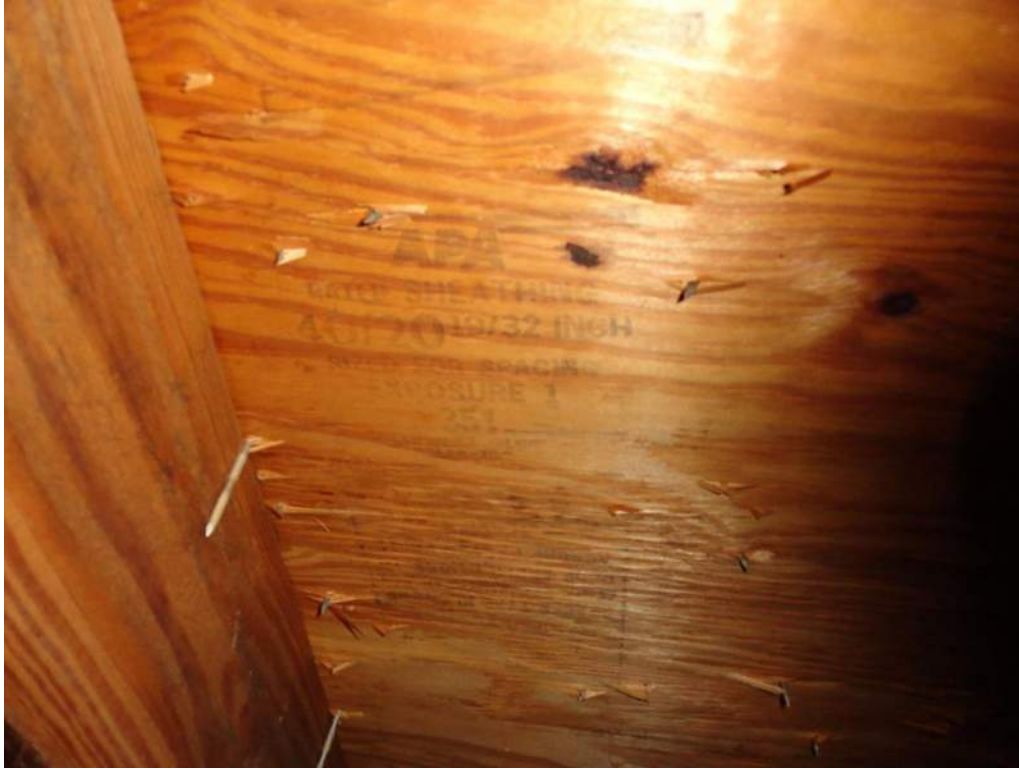
3. Roof Deck Attachment – 19/32" Plywood