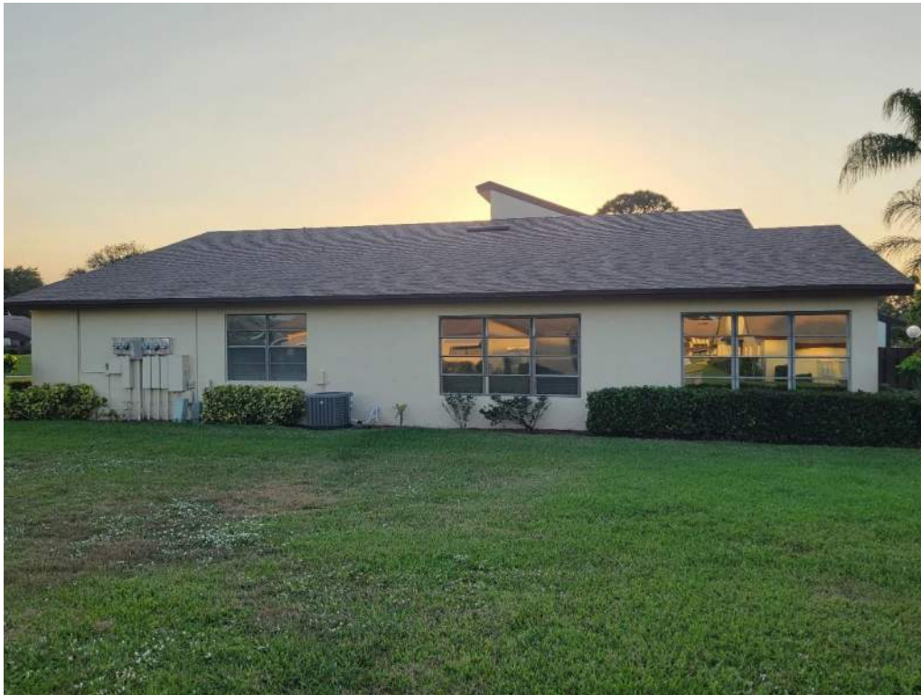
5. Roof Geometry – Left Elevation – Non-Hip