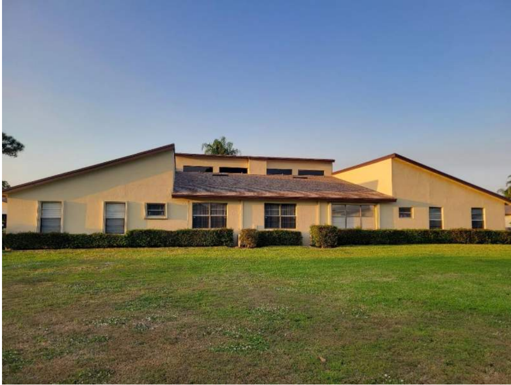
5. Roof Geometry – Rear Elevation – Non-Hip