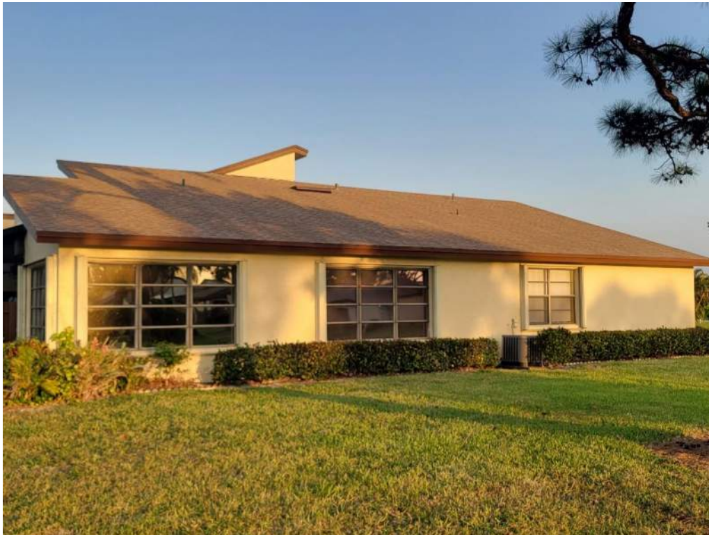
5. Roof Geometry – Right Elevation – Non-Hip