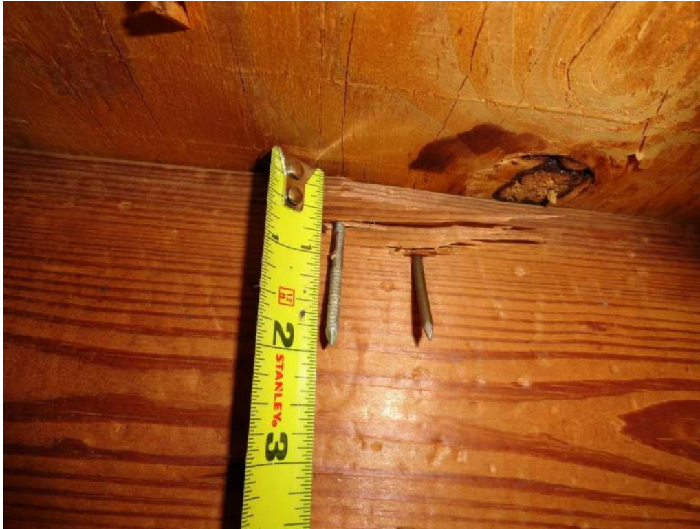
3. Roof Deck Attachment – 8d Nails