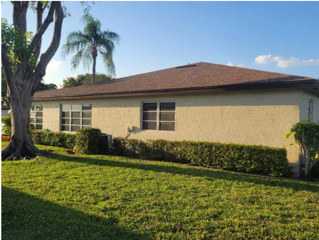
5. Roof Geometry – Right Elevation – Hip