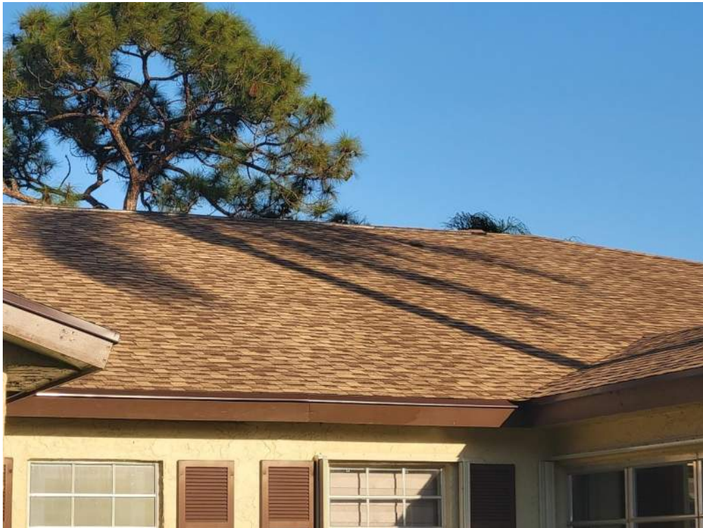
2. Roof Covering – Asphalt Shingles