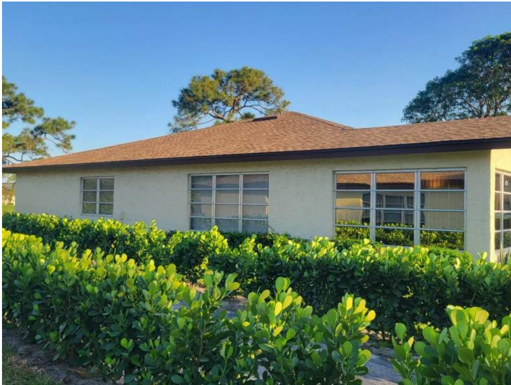
5. Roof Geometry – Left Elevation – Hip