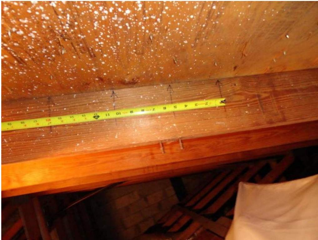
3. Roof Deck Attachment – Fasteners at 6" O. C. Max. In the Field