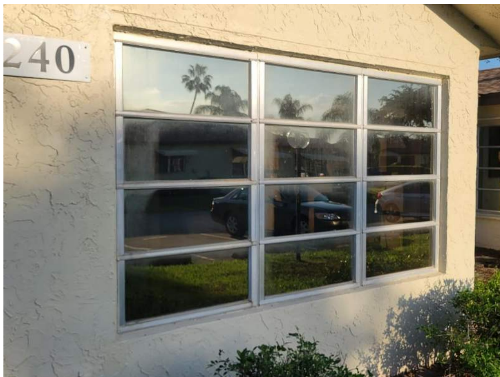
7. Opening Protection – Unrated Unprotected Windows