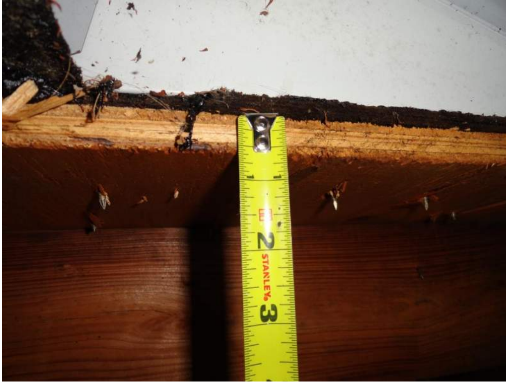
3. Roof Deck Attachment – 5/8" Plywood