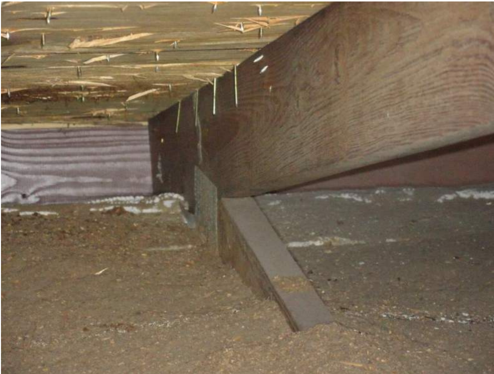
4. Roof to Wall Attachment – Single Wraps – Steel Straps w/ 1 Nail Min. at Back