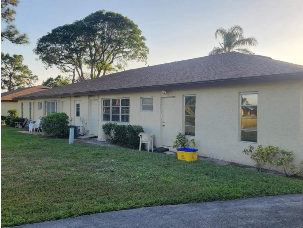
5. Roof Geometry – Rear Elevation – Hip