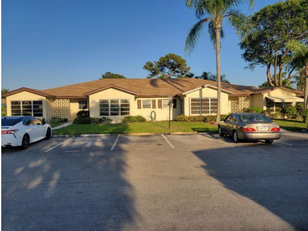
5. Roof Geometry – Front Elevation – Non-Hip