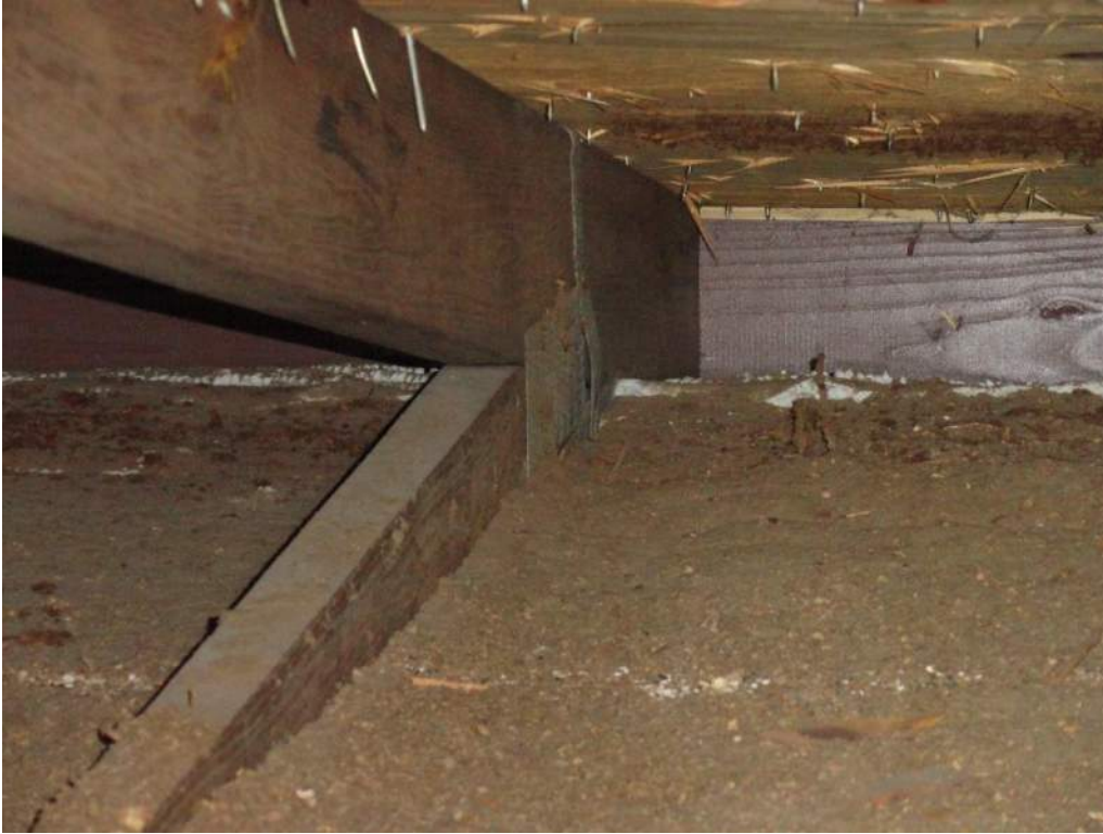
4. Roof to Wall Attachment – Single Wraps – Steel Straps w/ 2 Nails Min. at Face