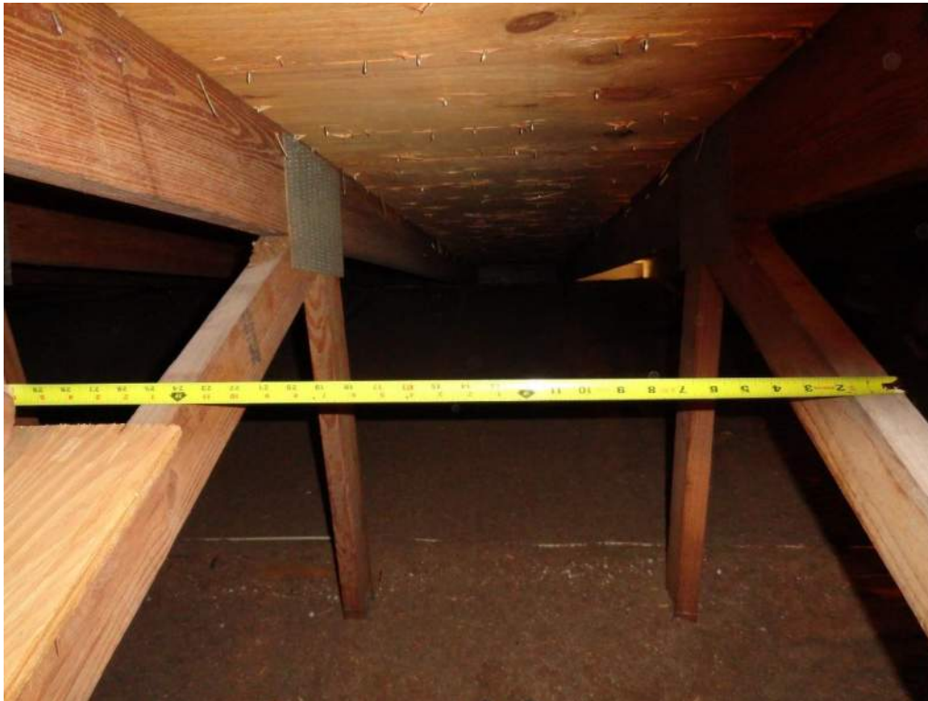
3. Roof Deck Attachment – Trusses at 24" O. C. Max.