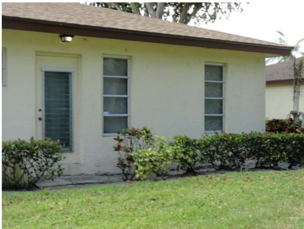
7. Opening Protection – Unrated Unprotected Windows