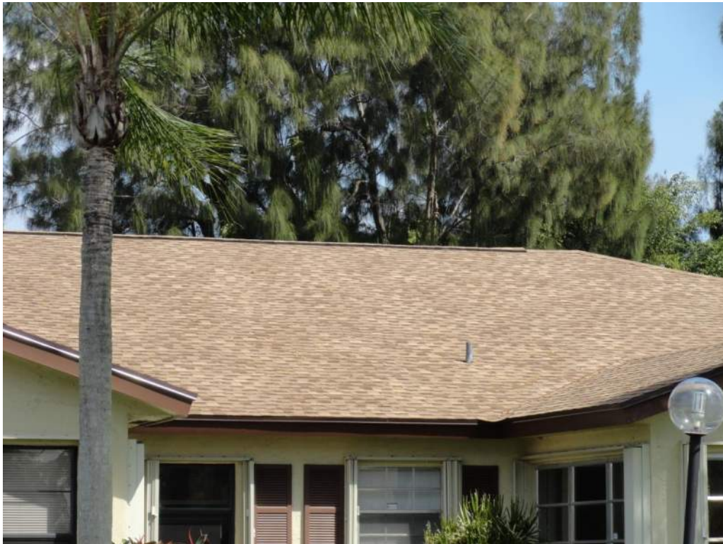
2. Roof Covering – Asphalt Shingles