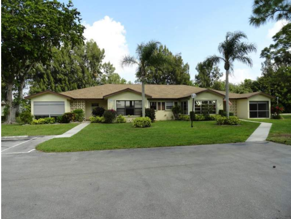
5. Roof Geometry – Front Elevation – Non-Hip