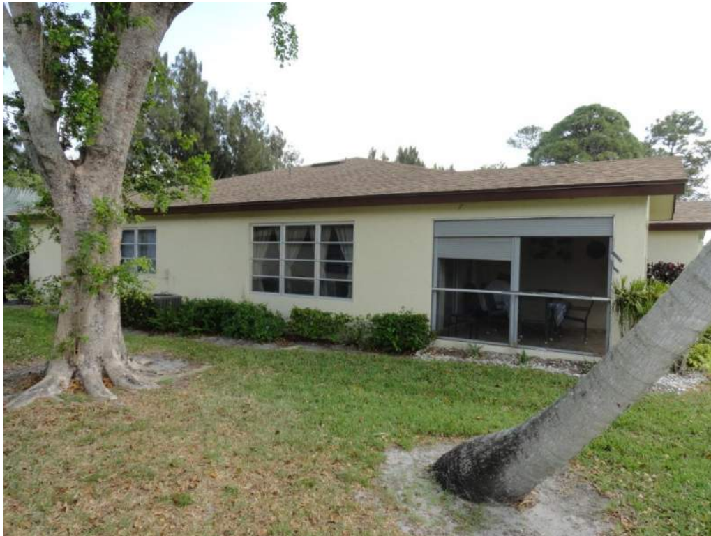
5. Roof Geometry – Left Elevation – Hip