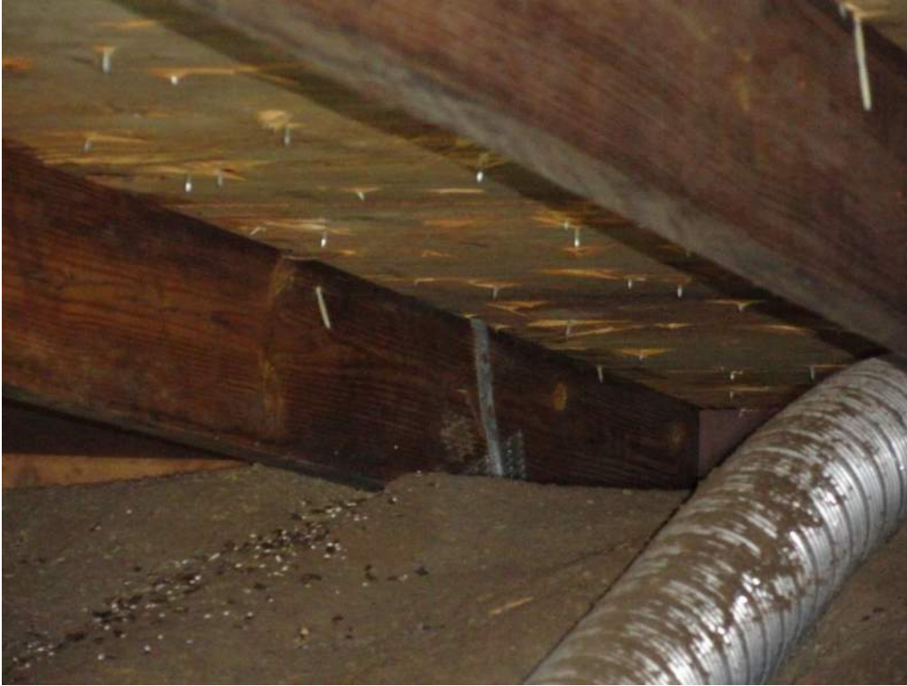
4. Roof to Wall Attachment – Single Wraps – Steel Straps w/ 2 Nails Min. at Face