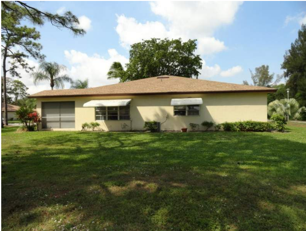
5. Roof Geometry – Right Elevation – Hip