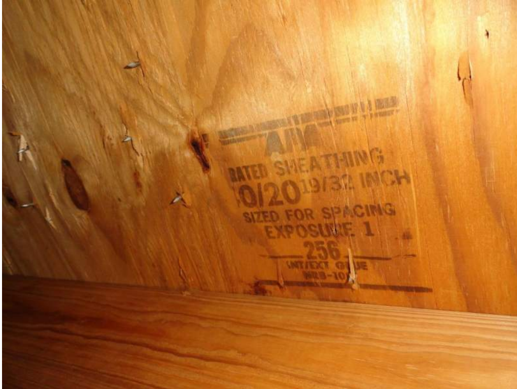
3. Roof Deck Attachment – 19/32" Plywood