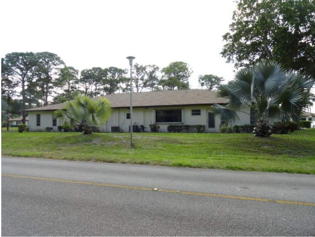
5. Roof Geometry – Rear Elevation – Hip