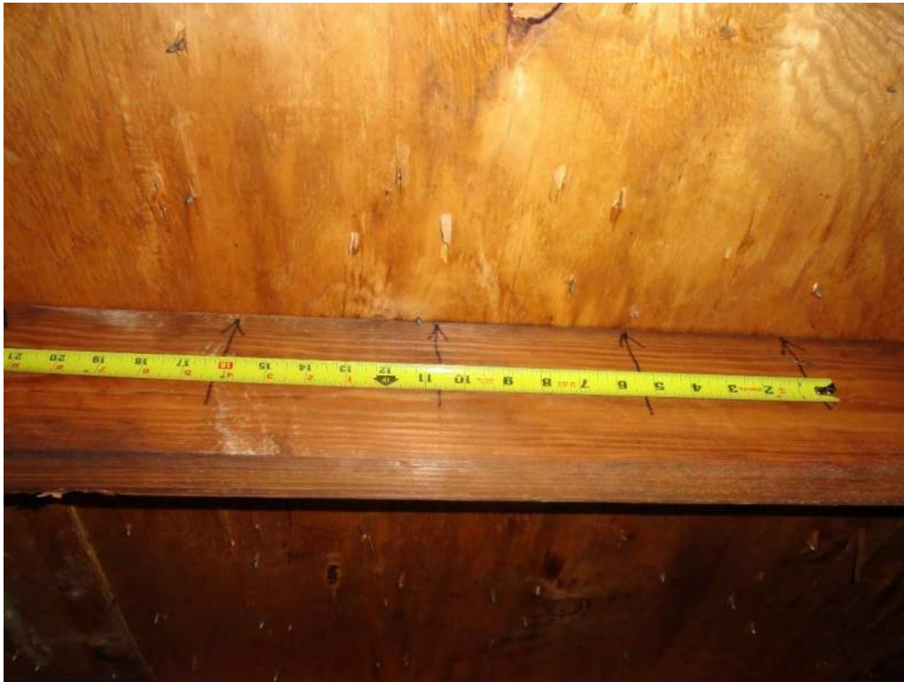
3. Roof Deck Attachment – Fasteners at 6" O. C. Max. In the Field