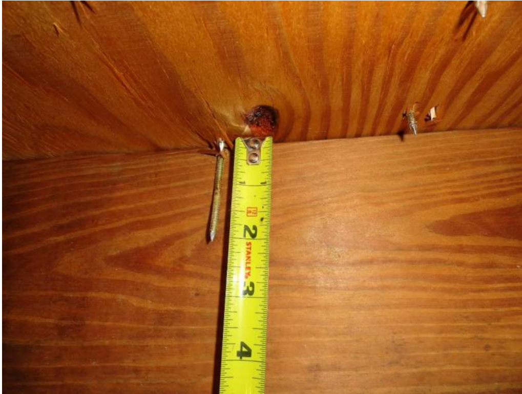
3. Roof Deck Attachment – 8d Nails