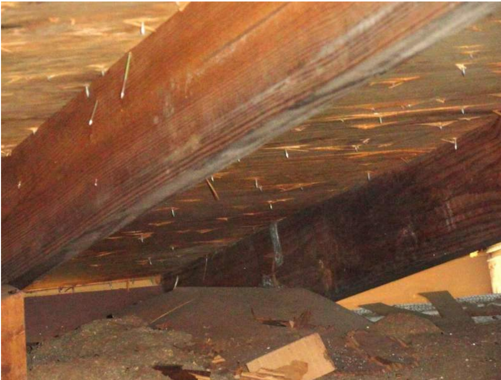
4. Roof to Wall Attachment – Single Wraps – Steel Straps w/ 1 Nail Min. at Back