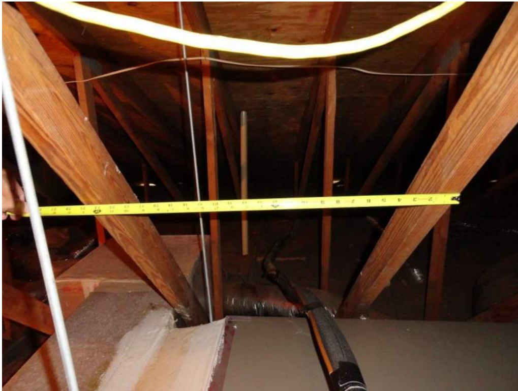
3. Roof Deck Attachment – Trusses at 24" O. C. Max.