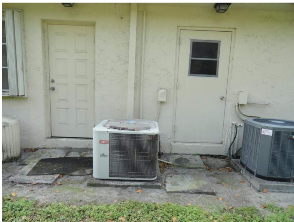
7. Opening Protection – Unprotected Unrated Unglazed Entry Door