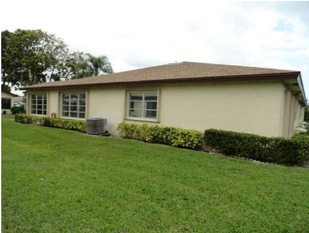
5. Roof Geometry – Right Elevation – Hip