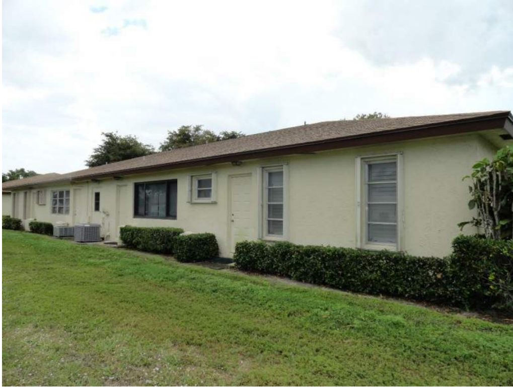
5. Roof Geometry – Rear Elevation – Hip