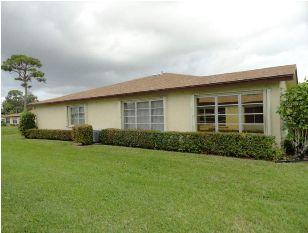
5. Roof Geometry – Left Elevation – Hip