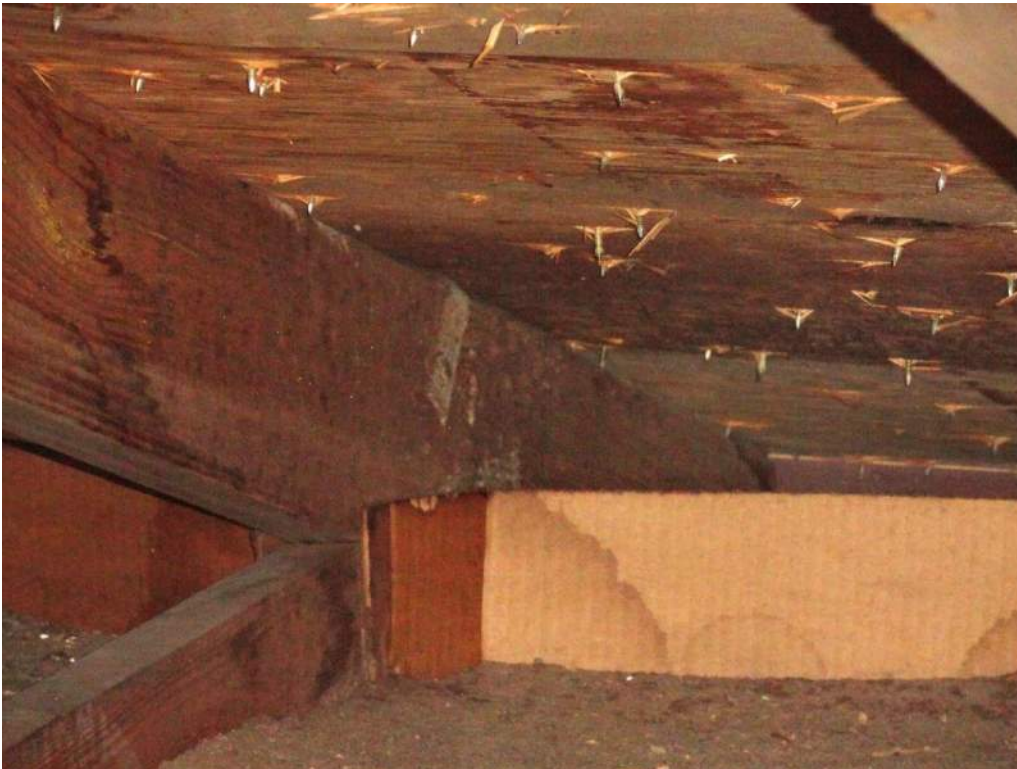
4. Roof to Wall Attachment – Single Wraps – Steel Straps w/ 1 Nail Min. at Back