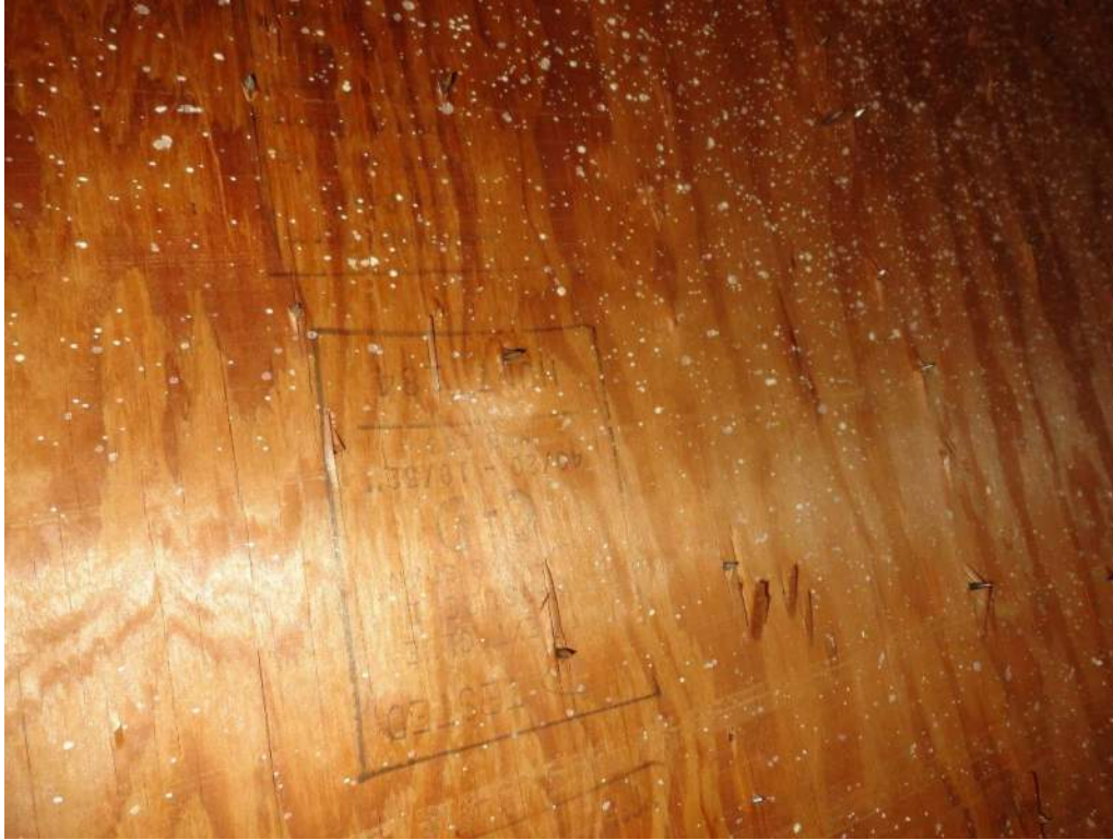
3. Roof Deck Attachment – 19/32" Plywood