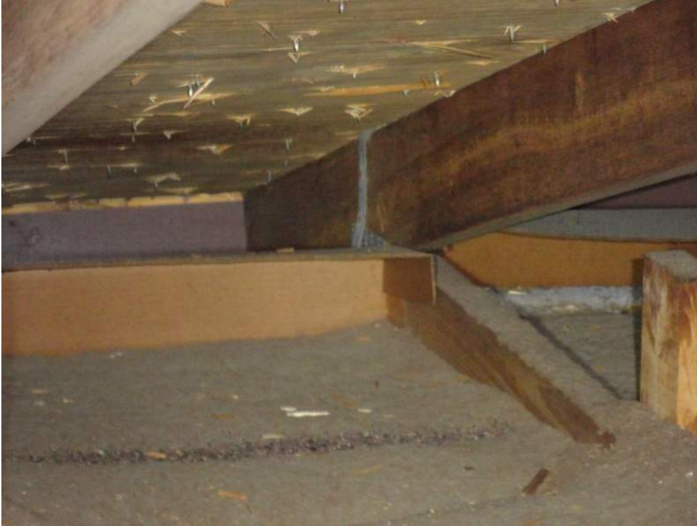
4. Roof to Wall Attachment – Single Wraps – Steel Straps w/ 2 Nails Min. at Face