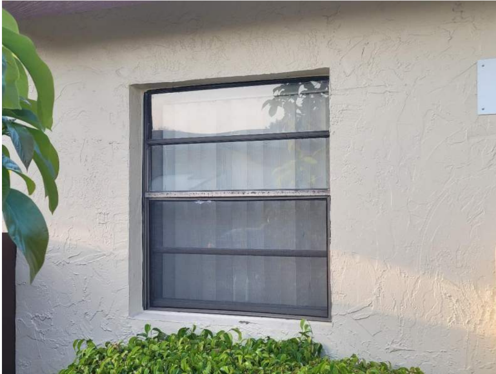
7. Opening Protection – Unrated Unprotected Windows