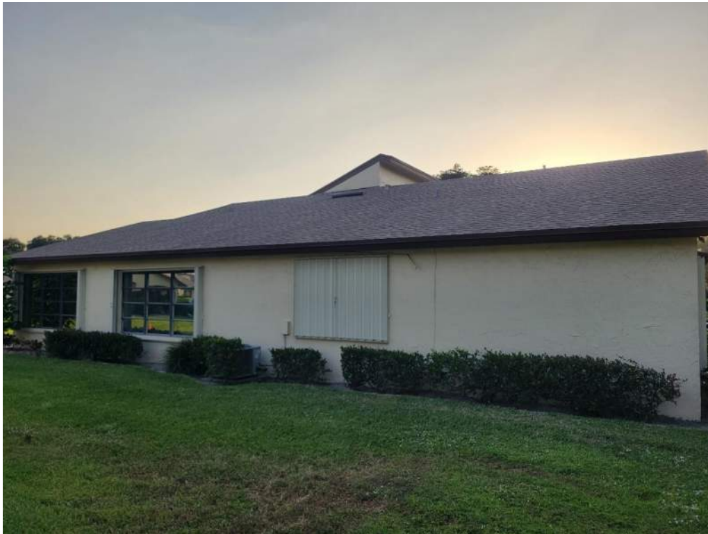
5. Roof Geometry – Right Elevation – Non-Hip