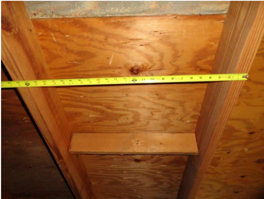
3. Roof Deck Attachment – Trusses at 24" O. C. Max.