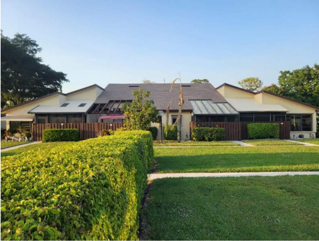
5. Roof Geometry – Front Elevation – Non-Hip