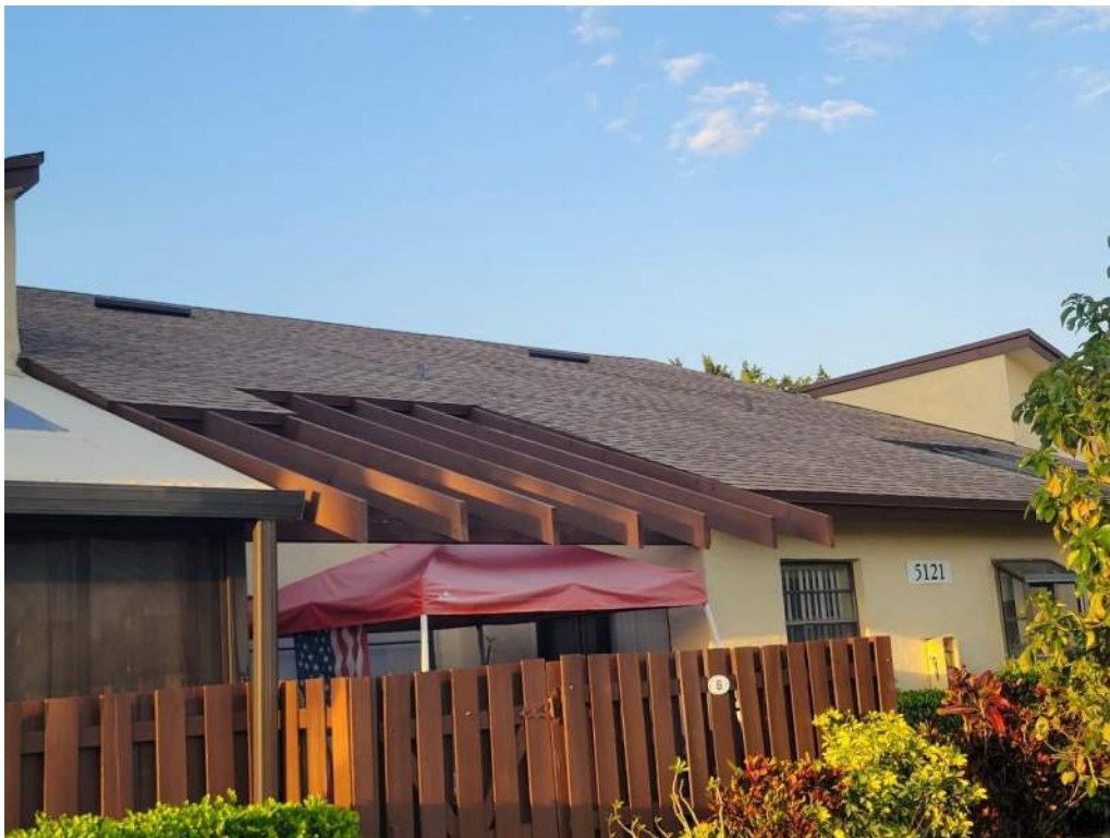
2. Roof Covering – Asphalt Shingles