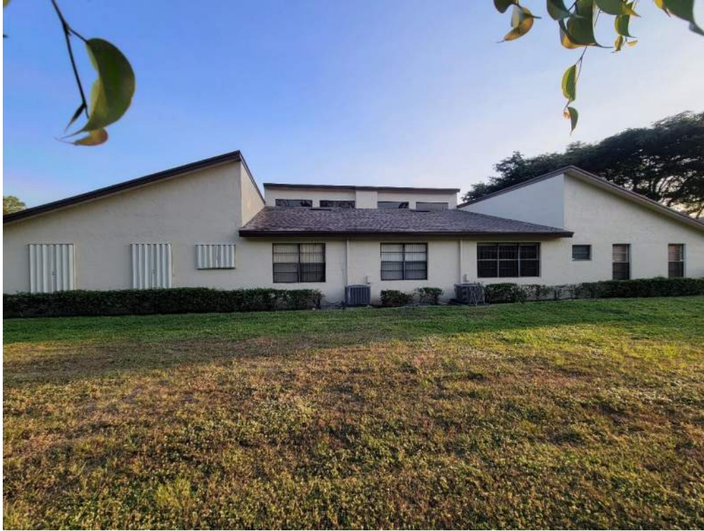
5. Roof Geometry – Rear Elevation – Non-Hip