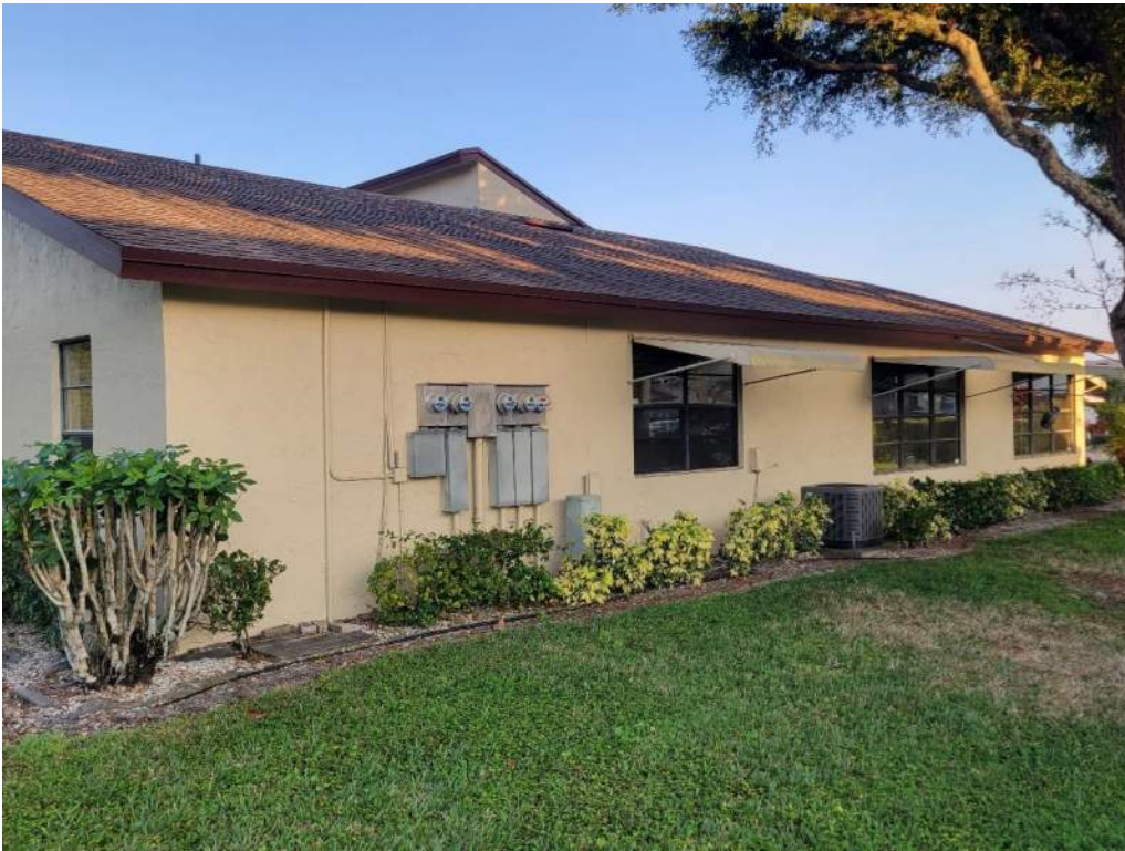
5. Roof Geometry – Left Elevation – Non-Hip