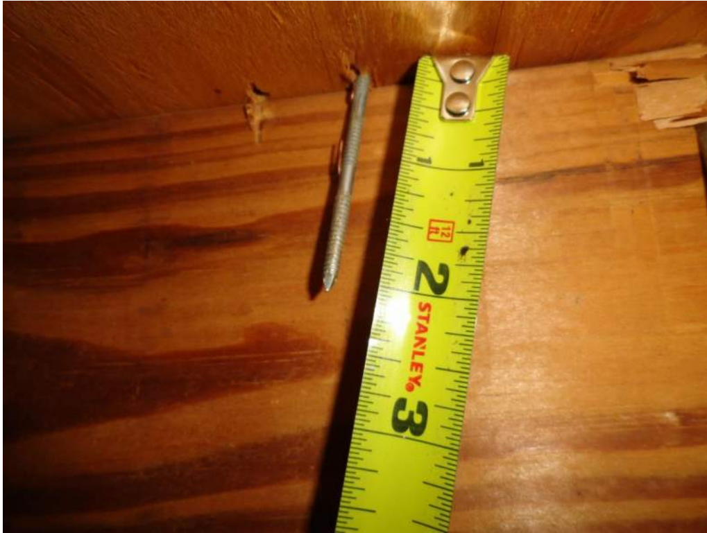
3. Roof Deck Attachment – 8d Nails