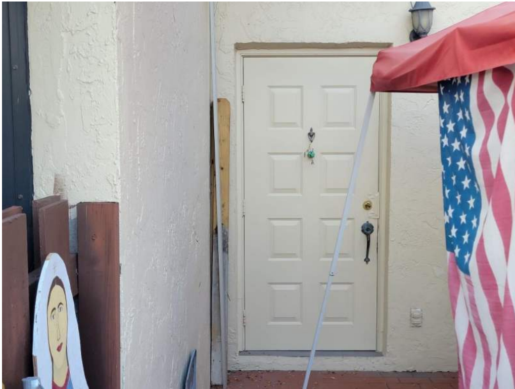
7. Opening Protection – Unprotected Unrated Unglazed Entry Door