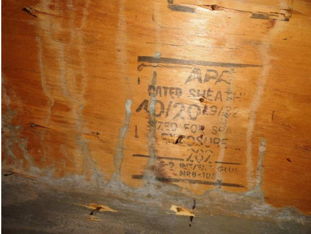
3. Roof Deck Attachment – 19/32" Plywood