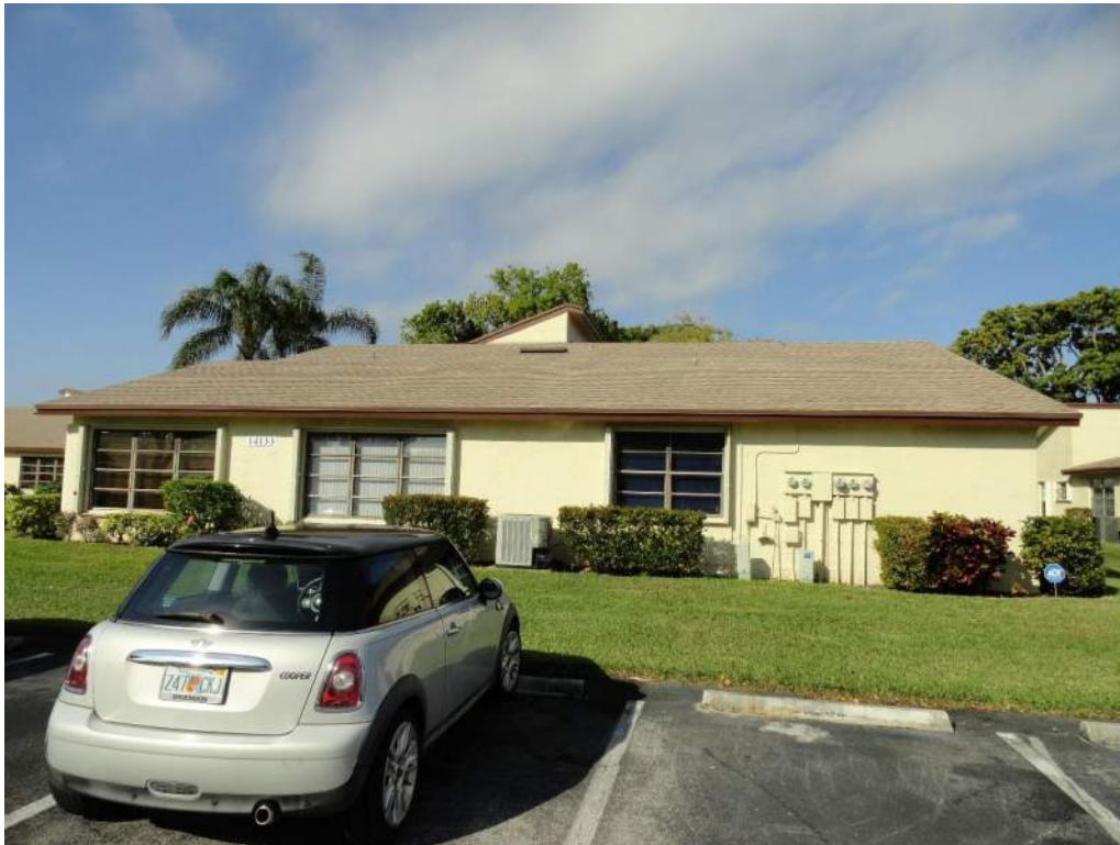
5. Roof Geometry – Right Elevation – Hip