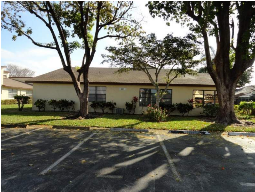
5. Roof Geometry – Left Elevation – Hip