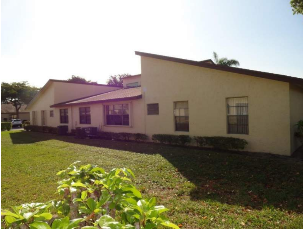
5. Roof Geometry – Rear Elevation – Hip