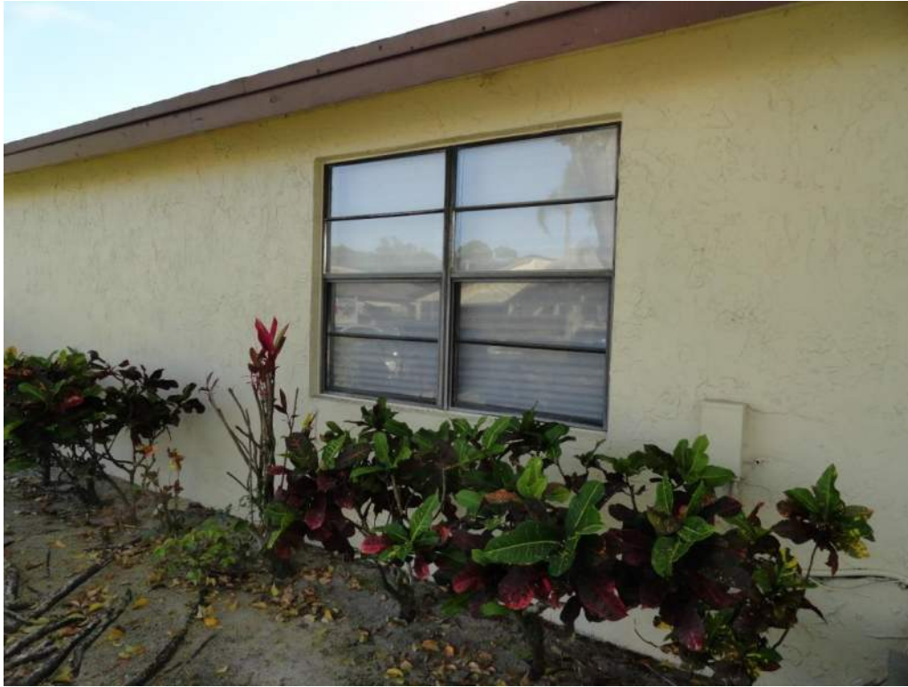
7. Opening Protection – Unprotected Unrated Windows