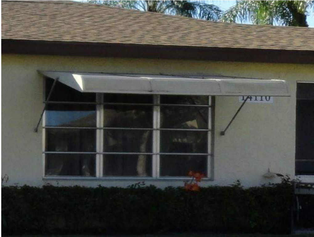
7. Opening Protection – Unrated Windows Protected w/ Approved Shutters