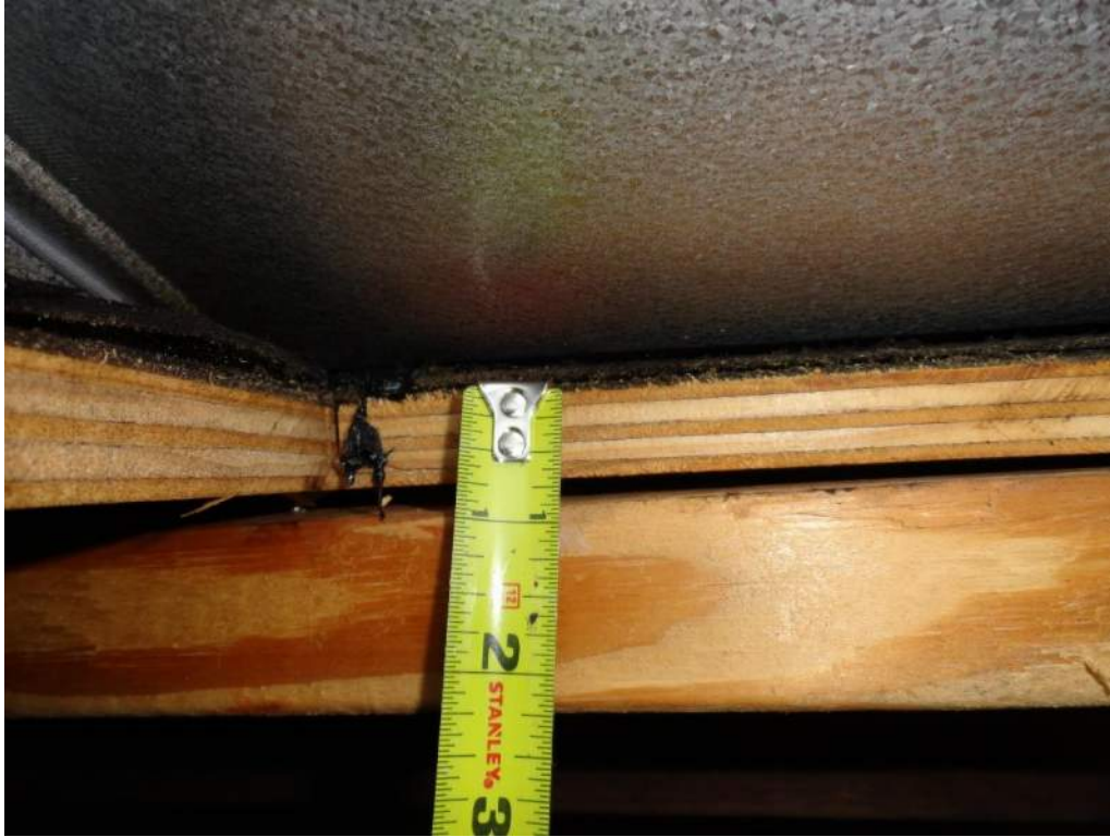
3. Roof Deck Attachment – 5/8" Plywood