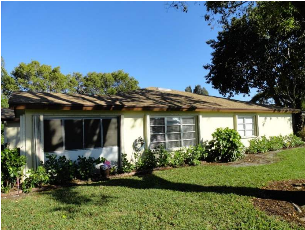
5. Roof Geometry – Right Elevation – Hip