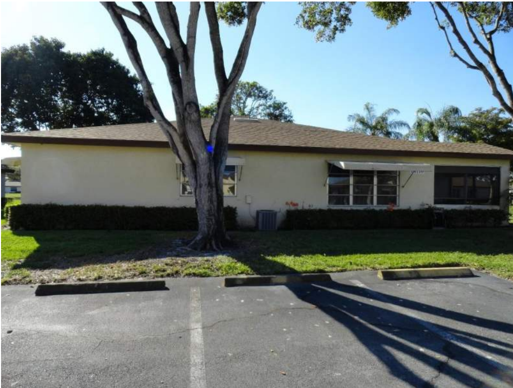
5. Roof Geometry – Left Elevation – Hip