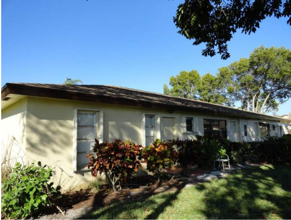
5. Roof Geometry – Rear Elevation – Hip