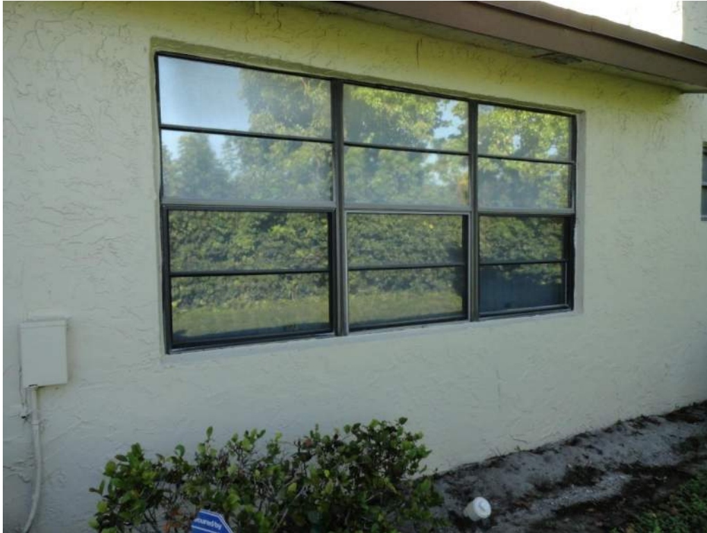
7. Opening Protection – Unrated Unprotected Windows