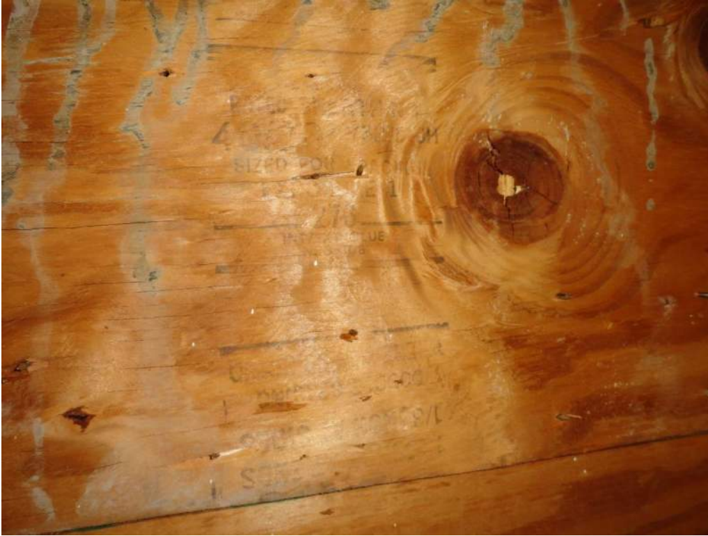
3. Roof Deck Attachment – 19/32" Plywood