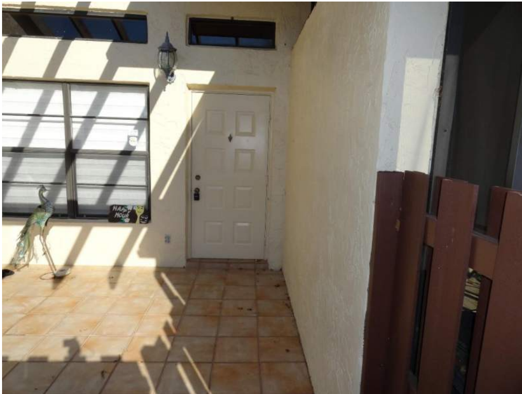
7. Opening Protection – Unprotected Unrated Unglazed Entry Door