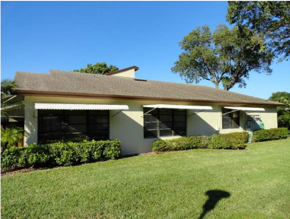
5. Roof Geometry – Right Elevation – Non-Hip