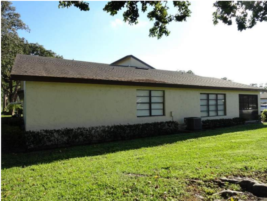
5. Roof Geometry – Left Elevation – Non-Hip