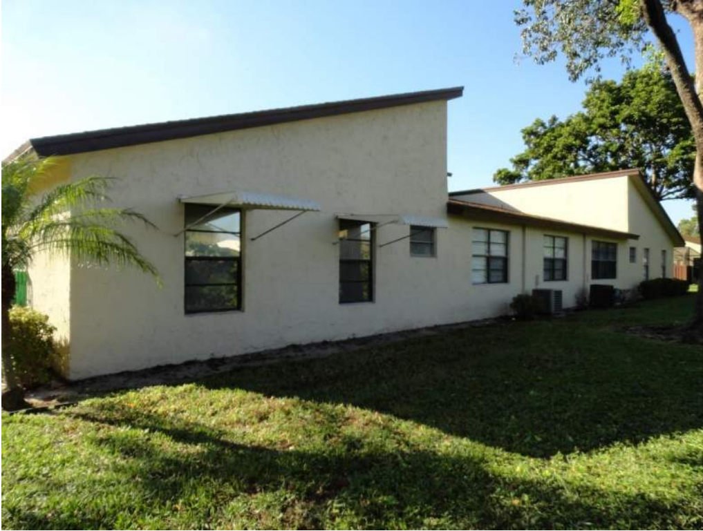
5. Roof Geometry – Rear Elevation – Non-Hip