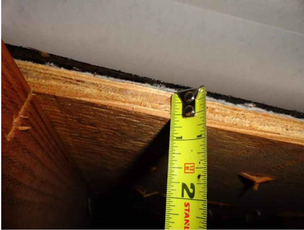
3. Roof Deck Attachment – 5/8" Plywood