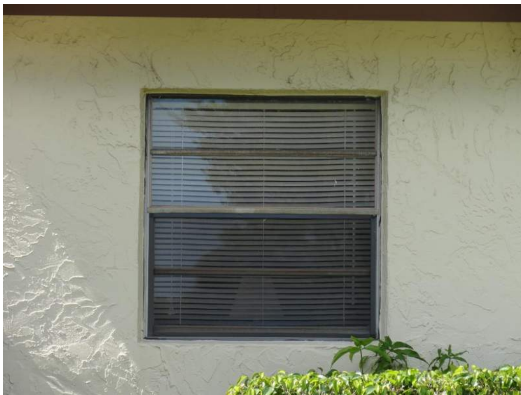
7. Opening Protection – Unprotected Unrated Windows