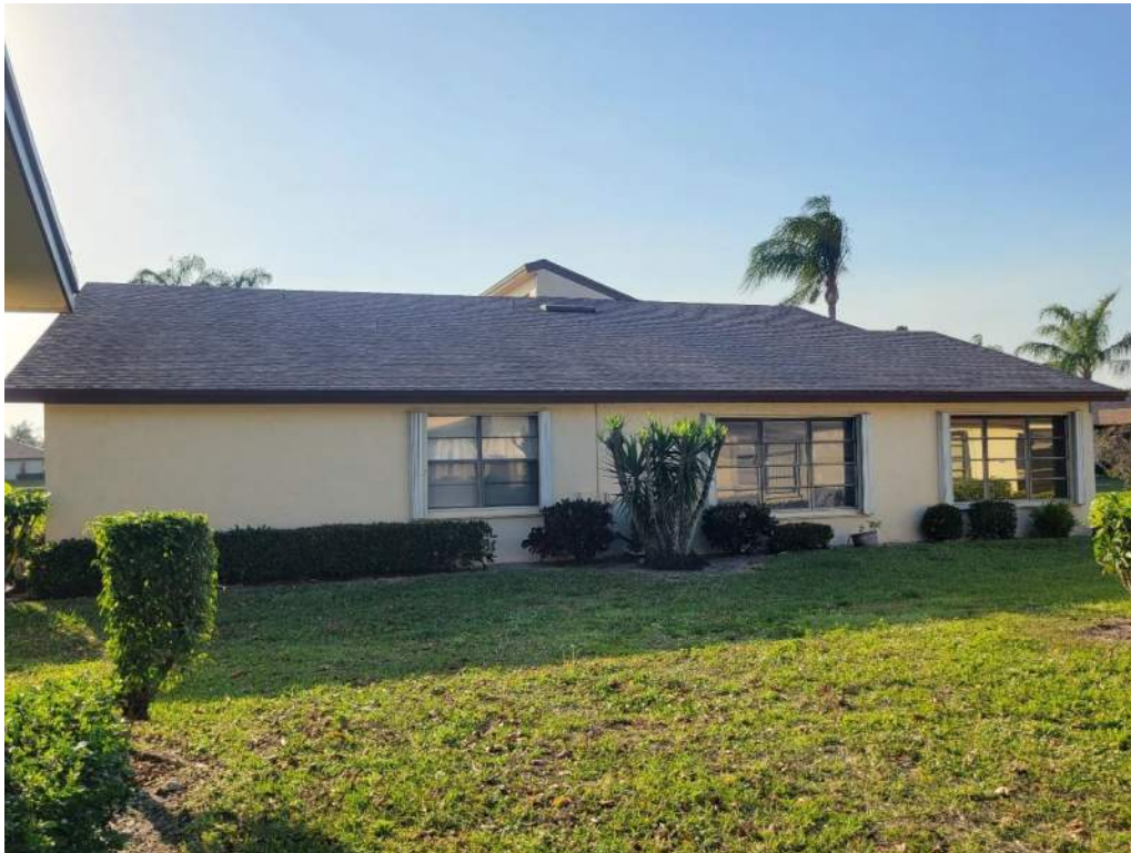
5. Roof Geometry – Left Elevation – Non-Hip