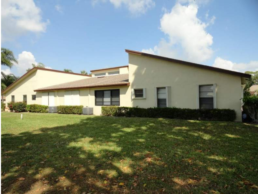
5. Roof Geometry – Rear Elevation – Non-Hip