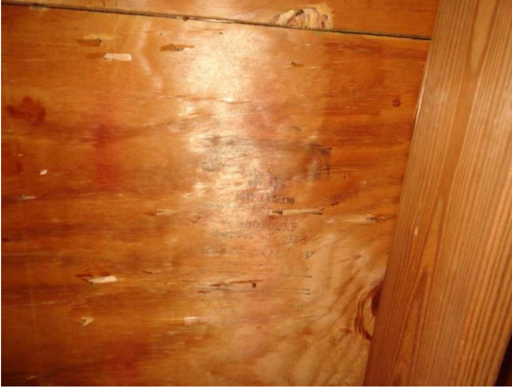
3. Roof Deck Attachment – 19/32" Plywood