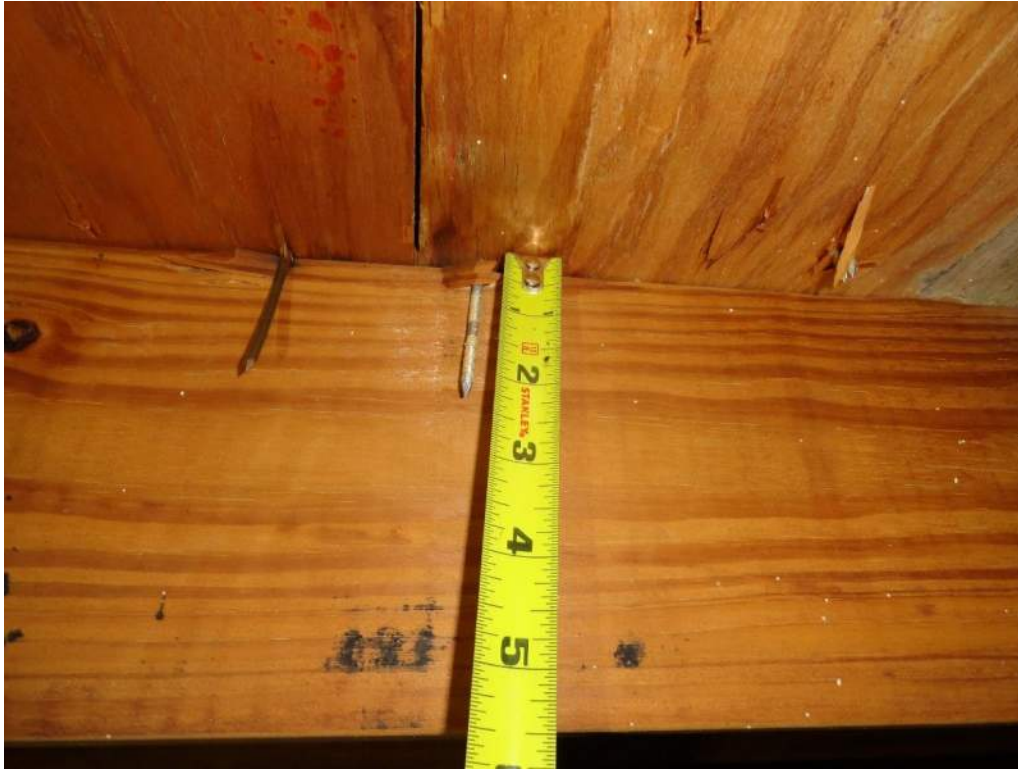
3. Roof Deck Attachment – 8d Nails