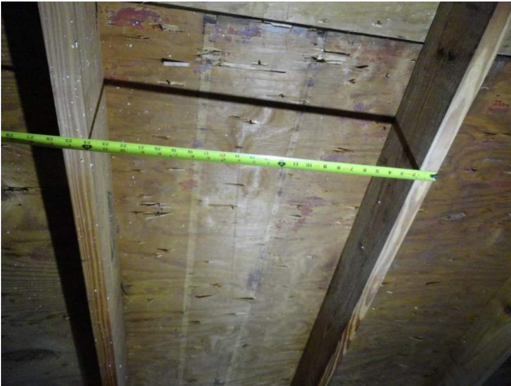
3. Roof Deck Attachment – Trusses at 24" O. C. Max.