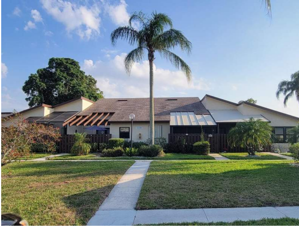
5. Roof Geometry – Front Elevation – Non-Hip