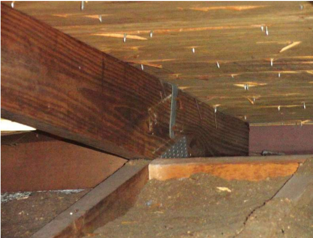
4. Roof to Wall Attachment – Single Wraps – Steel Straps w/ 1 Nail Min. at Back