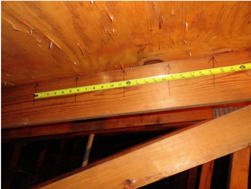
3. Roof Deck Attachment – Fasteners at 6" O. C. Max. In the Field