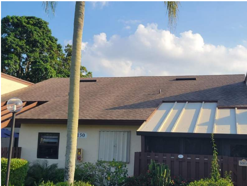
2. Roof Covering – Asphalt Shingles