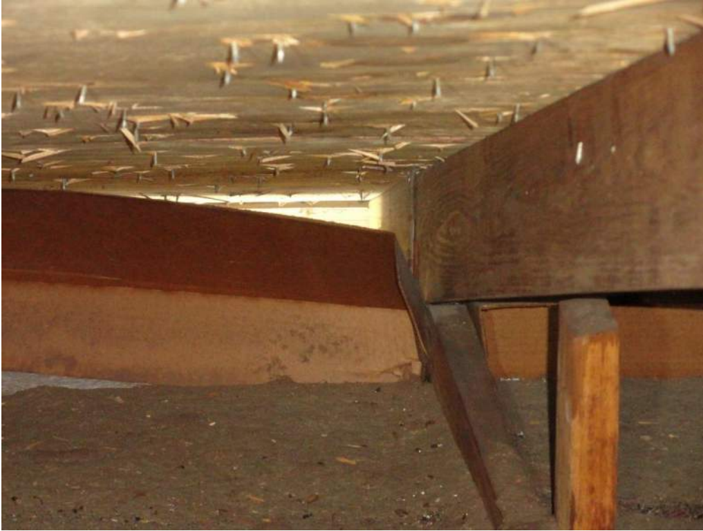
4. Roof to Wall Attachment – Single Wraps – Steel Straps w/ 2 Nails Min. at Face