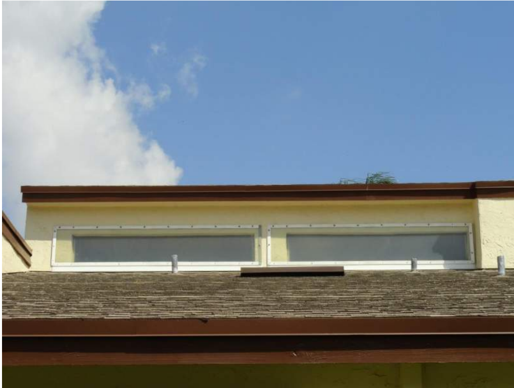
7. Opening Protection – Unrated Unprotected Windows