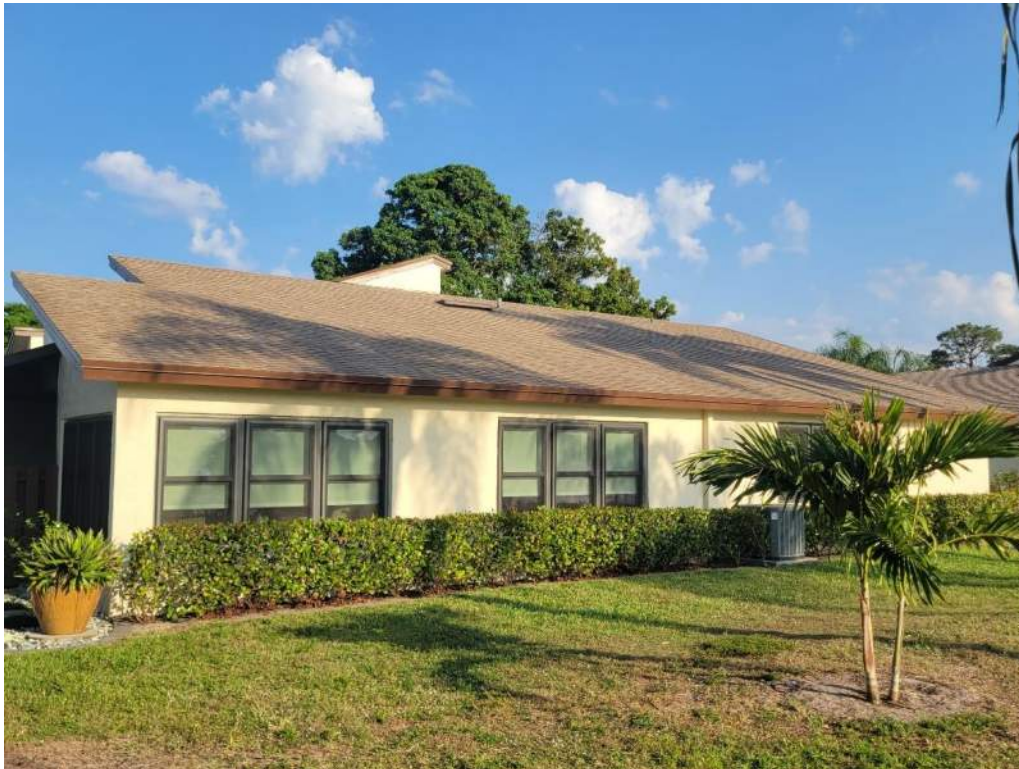
5. Roof Geometry – Right Elevation – Non-Hip