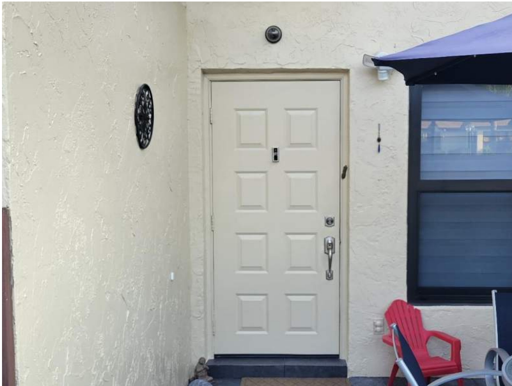
7. Opening Protection – Unprotected Unrated Unglazed Entry Door