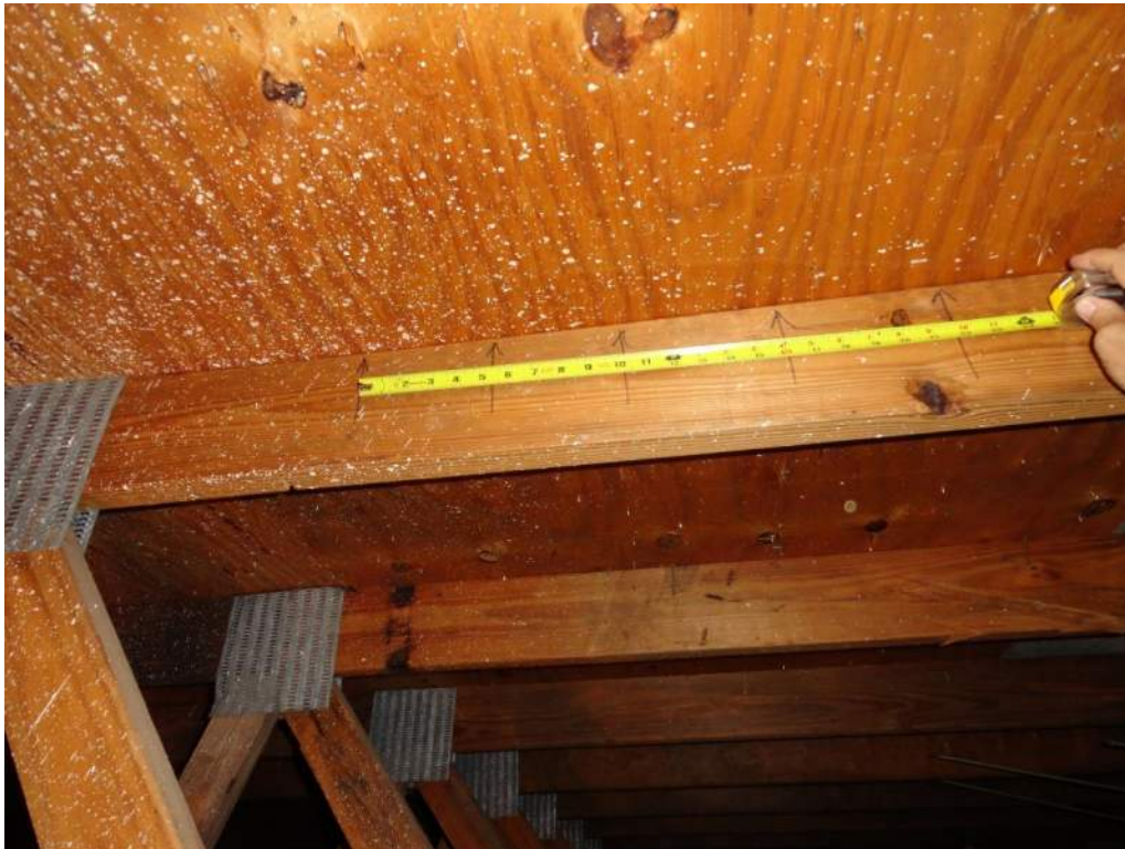
3. Roof Deck Attachment – Fasteners at 6" O. C. Max. In the Field