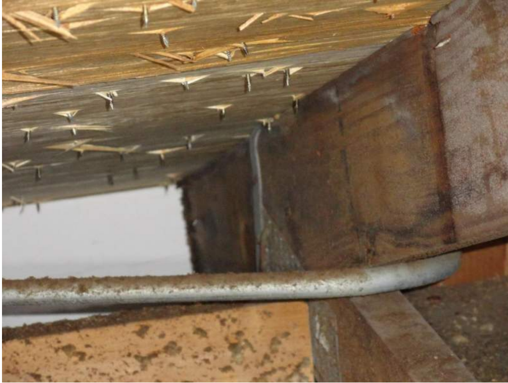
4. Roof to Wall Attachment – Single Wraps – Steel Straps w/ 2 Nails Min. at Face