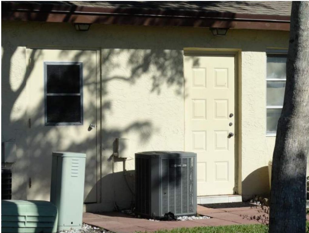
7. Opening Protection – Unprotected Unrated Unglazed Entry Door