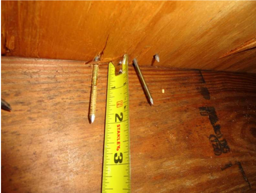
3. Roof Deck Attachment – 8d Nails