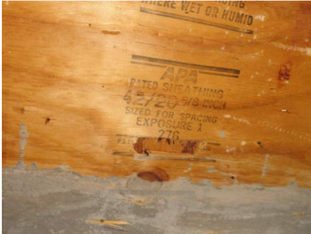
3. Roof Deck Attachment – 5/8" Plywood