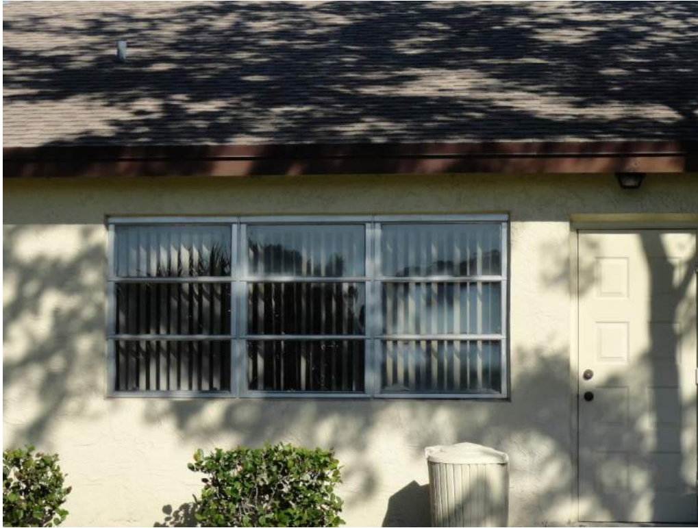
7. Opening Protection – Unrated Unprotected Windows