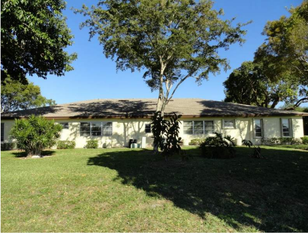
5. Roof Geometry – Rear Elevation – Hip