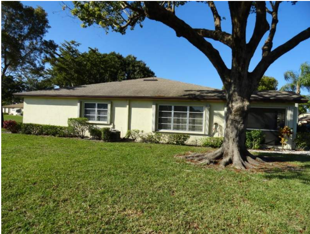
5. Roof Geometry – Left Elevation – Hip