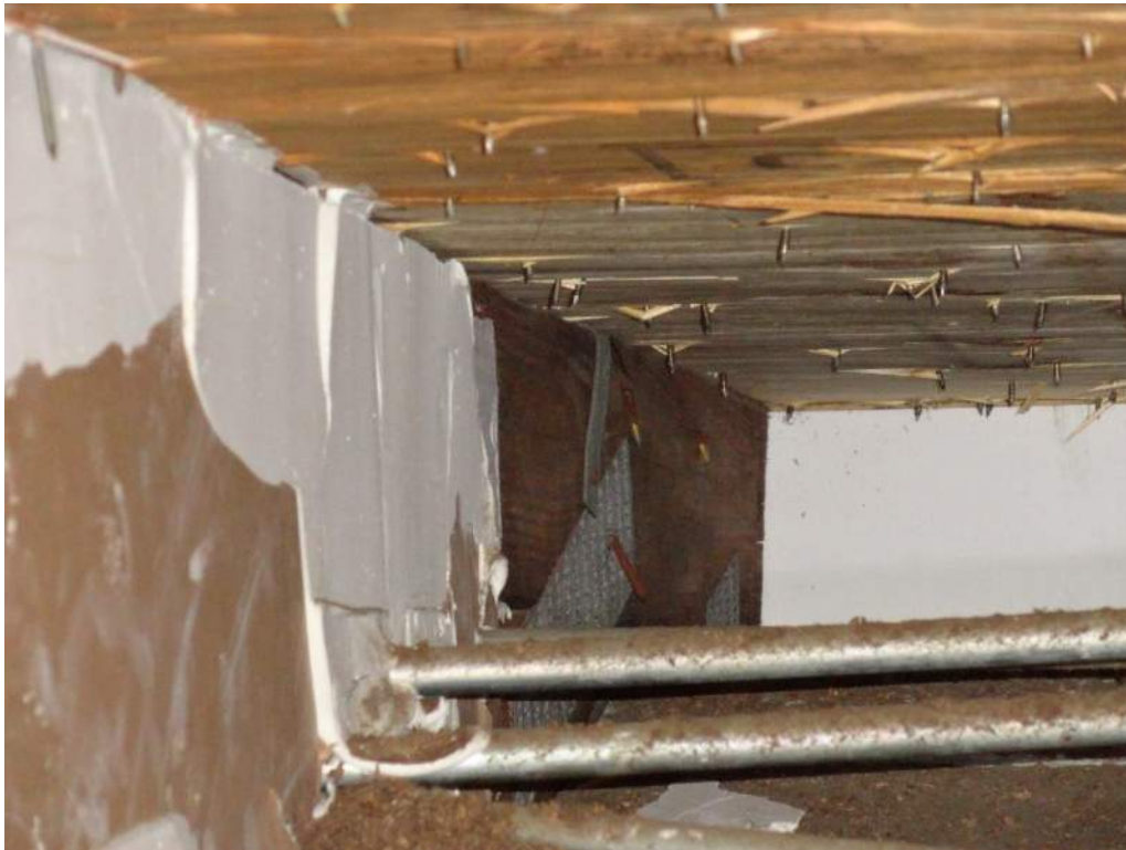
4. Roof to Wall Attachment – Single Wraps – Steel Straps w/ 1 Nail Min. at Back