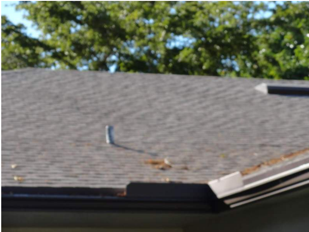
2. Roof Covering – Asphalt Shingles