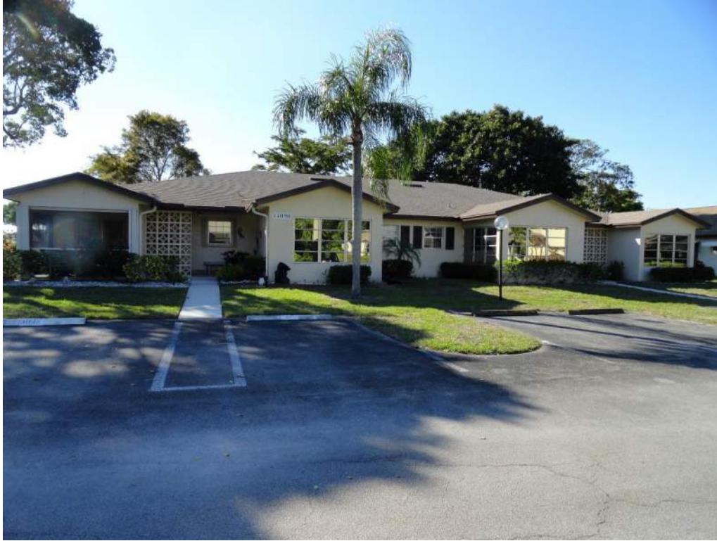
5. Roof Geometry – Front Elevation – Non-Hip