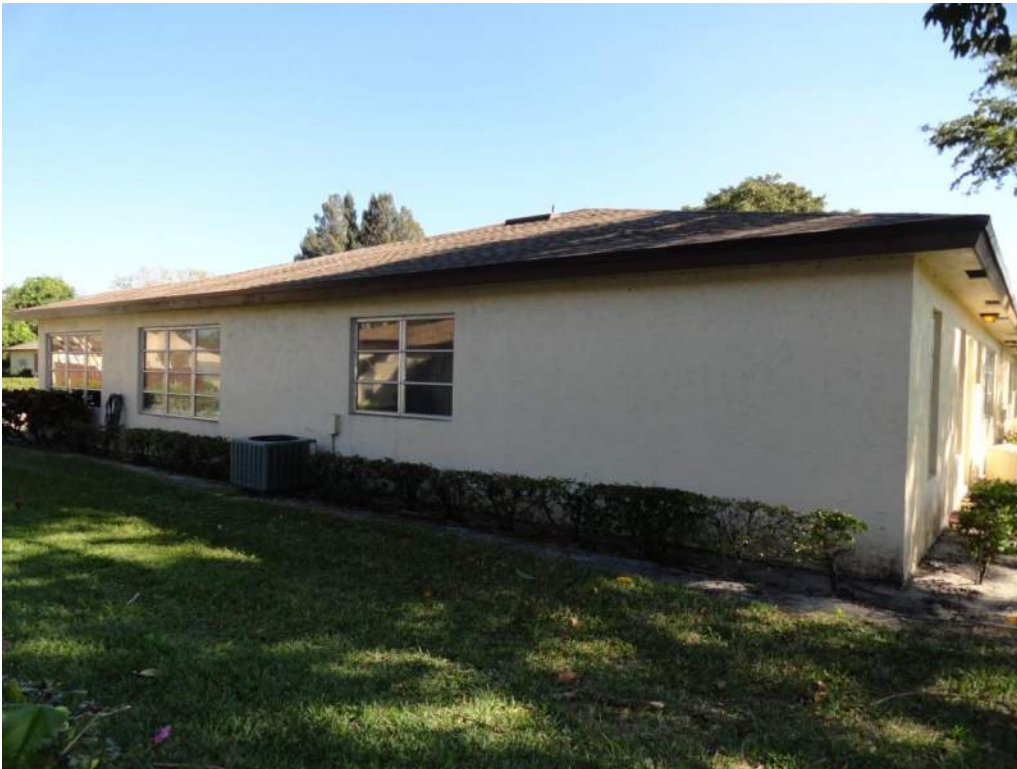
5. Roof Geometry – Right Elevation – Hip