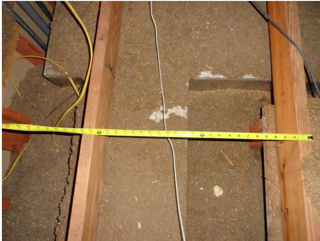
3. Roof Deck Attachment – Trusses at 24" O. C. Max.