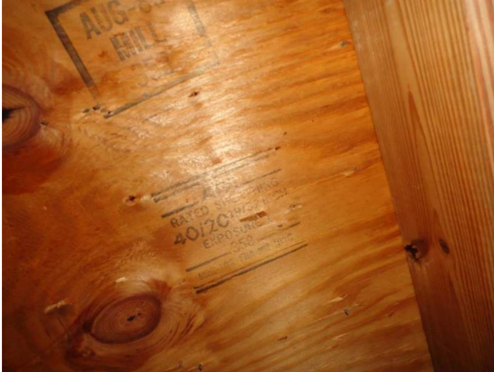
3. Roof Deck Attachment – 19/32" Plywood