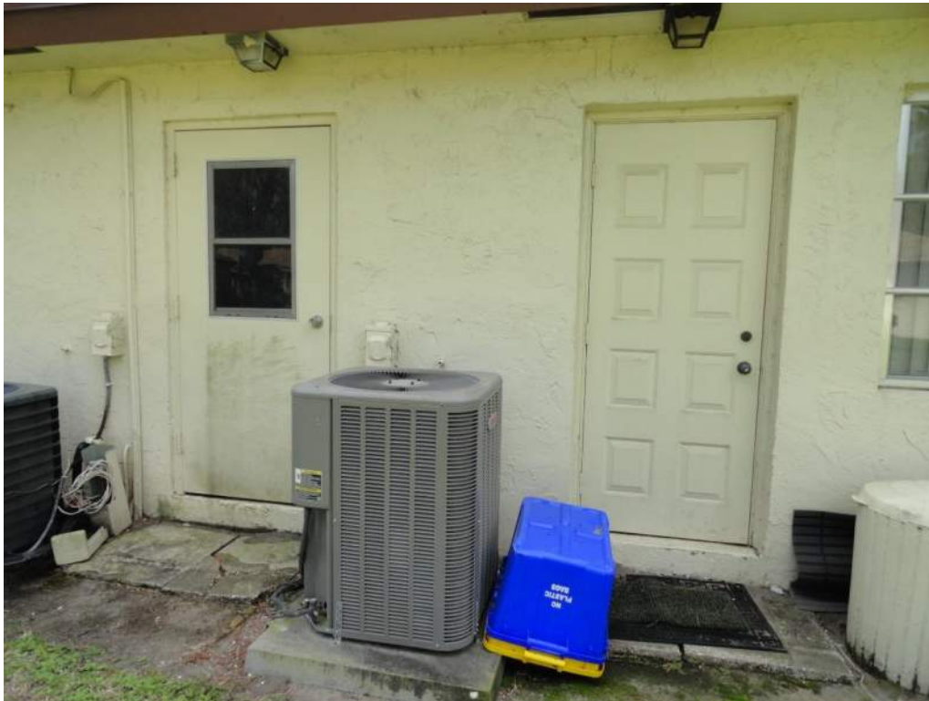
7. Opening Protection – Unprotected Unrated Unglazed Entry Door