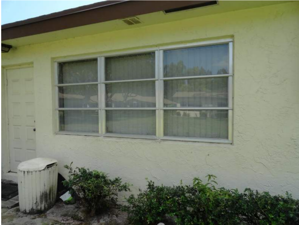
7. Opening Protection – Unrated Unprotected Windows