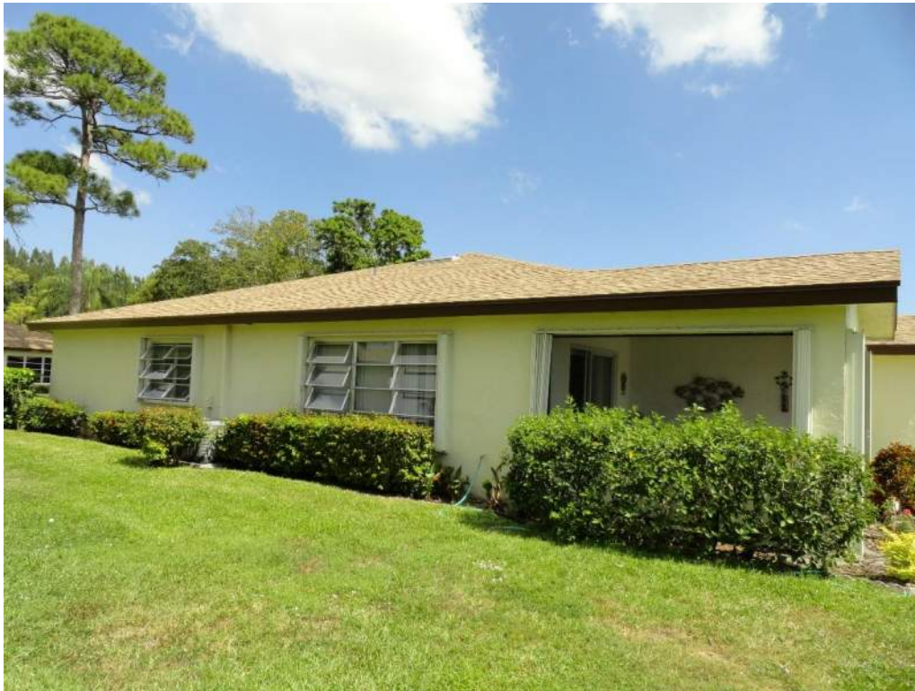
5. Roof Geometry – Left Elevation – Hip