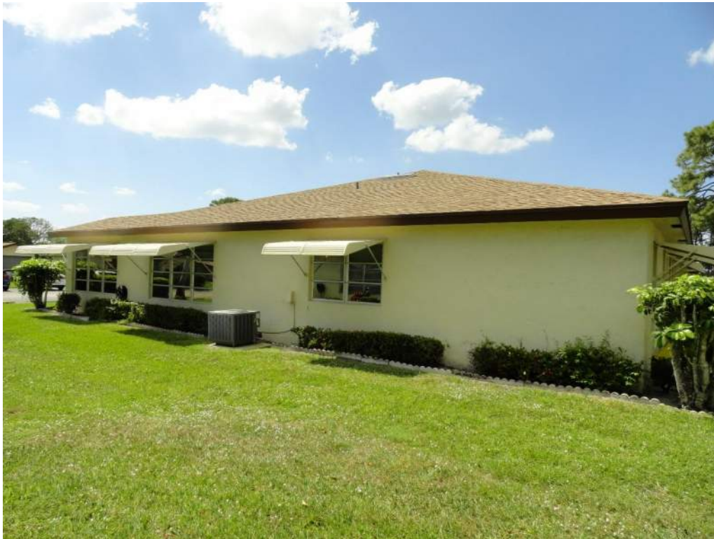
5. Roof Geometry – Right Elevation – Hip