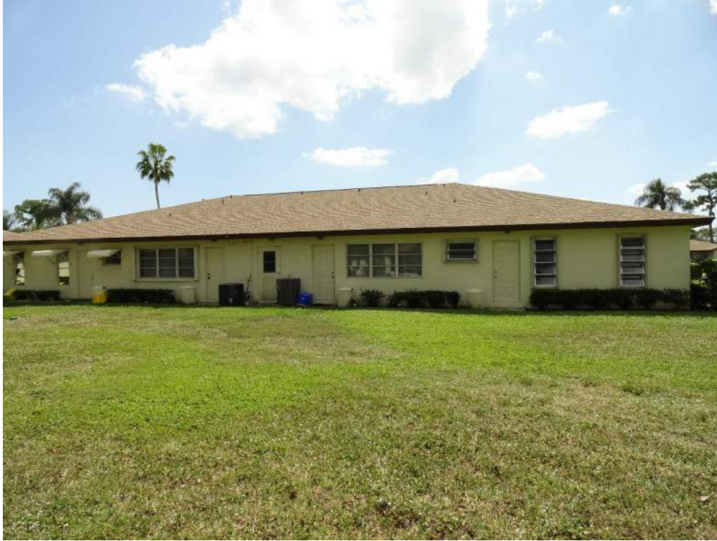
5. Roof Geometry – Rear Elevation – Hip