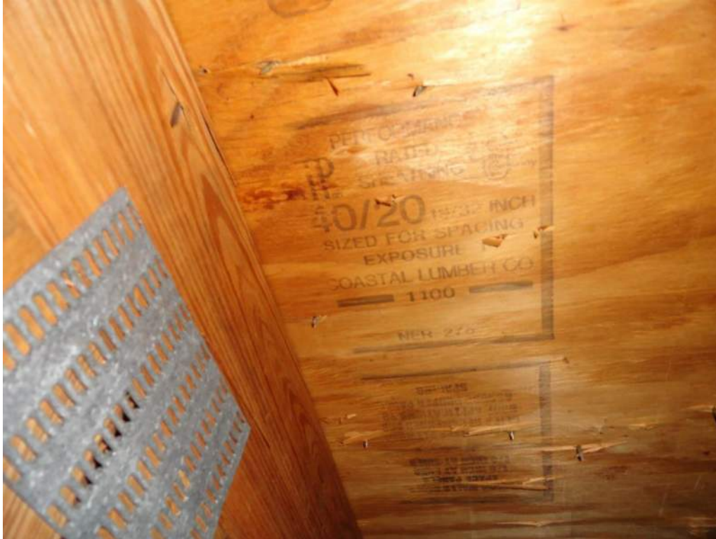
3. Roof Deck Attachment – 19/32" Plywood