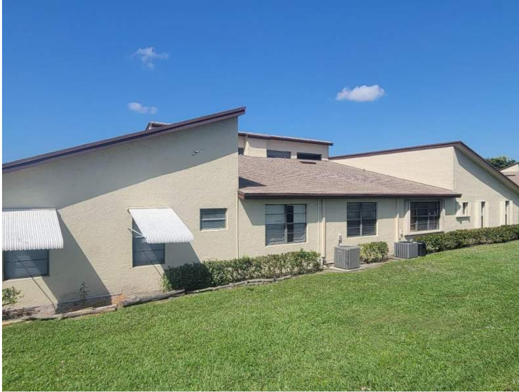
5. Roof Geometry – Rear Elevation – Non-Hip