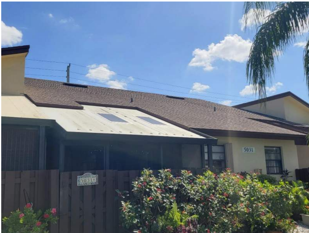
2. Roof Covering – Asphalt Shingles