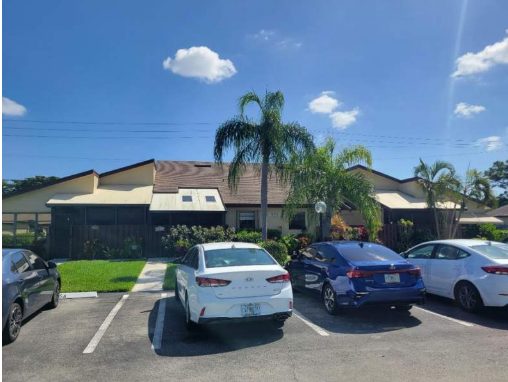
5. Roof Geometry – Front Elevation – Non-Hip