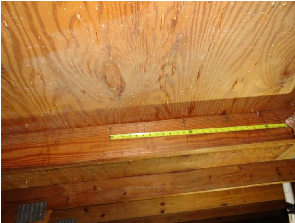
3. Roof Deck Attachment – Fasteners at 6" O. C. Max. In the Field