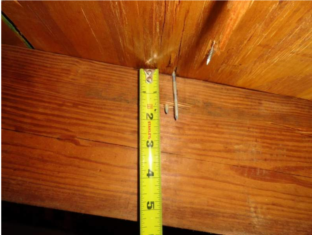
3. Roof Deck Attachment – 8d Nails