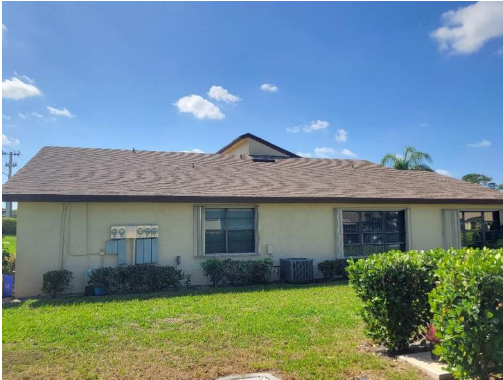
5. Roof Geometry – Left Elevation – Non-Hip