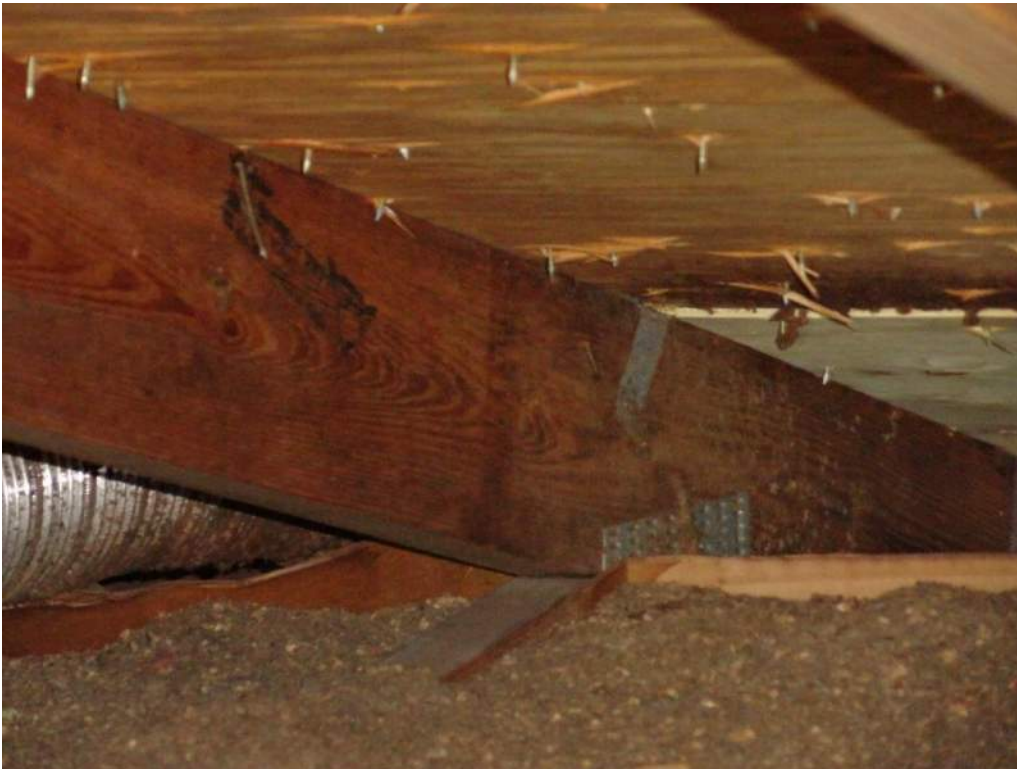
4. Roof to Wall Attachment – Single Wraps – Steel Straps w/ 1 Nail Min. at Back