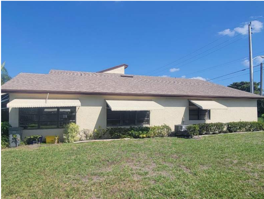
5. Roof Geometry – Right Elevation – Non-Hip