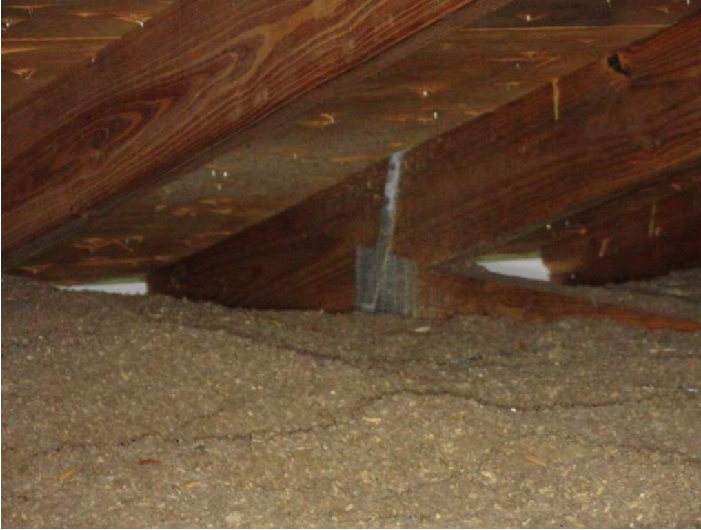
4. Roof to Wall Attachment – Single Wraps – Steel Straps w/ 2 Nails Min. at Face