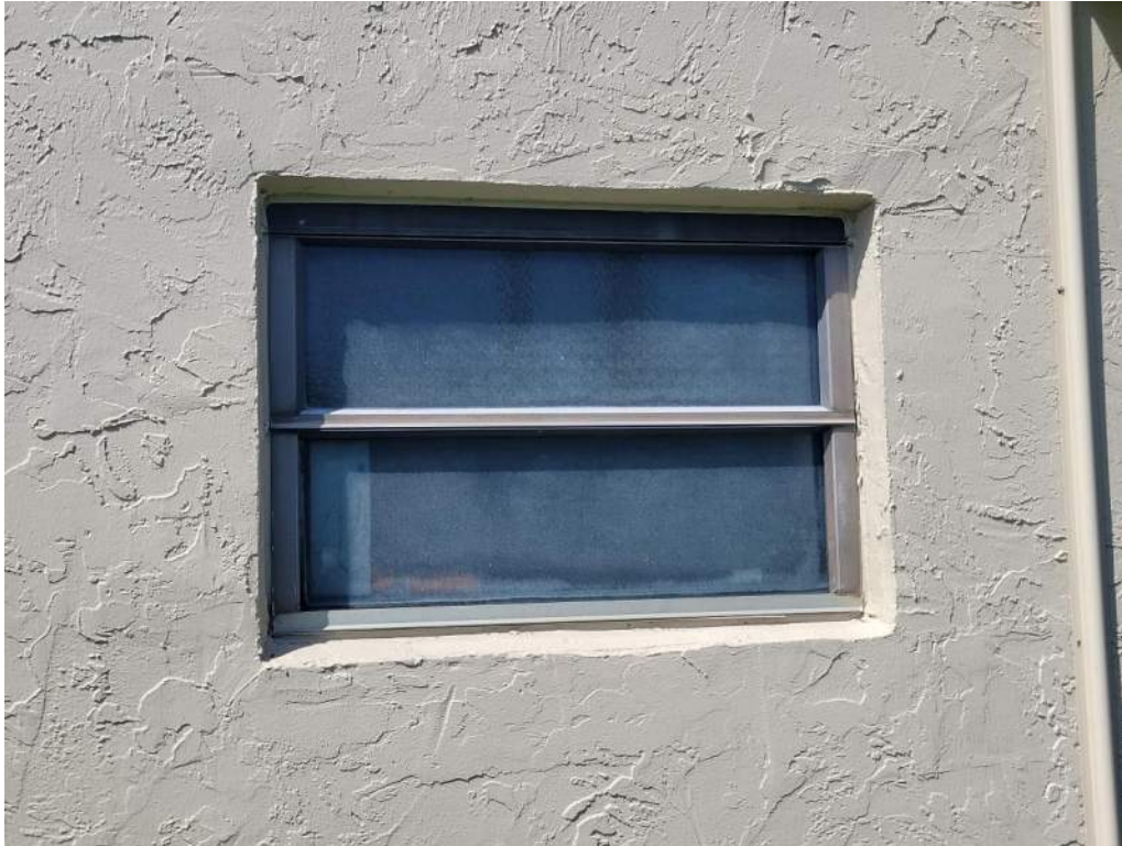
7. Opening Protection – Unrated Unprotected Windows