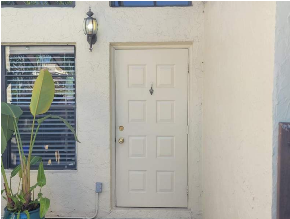
7. Opening Protection – Unprotected Unrated Unglazed Entry Door