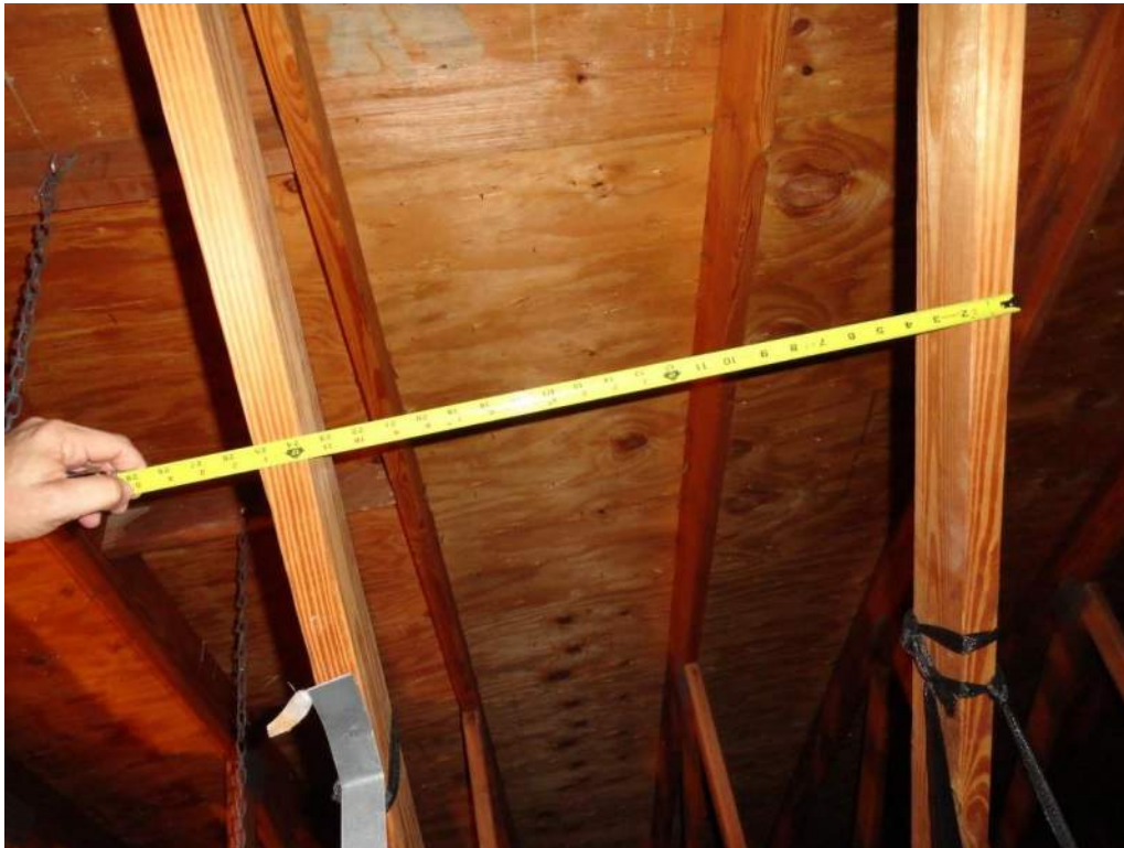
3. Roof Deck Attachment – Trusses at 24" O. C. Max.