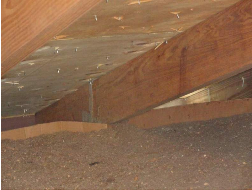
4. Roof to Wall Attachment – Single Wraps – Steel Straps w/ 2 Nails Min. at Face