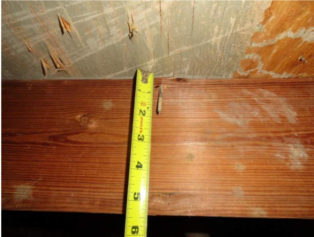
3. Roof Deck Attachment – 8d Nails