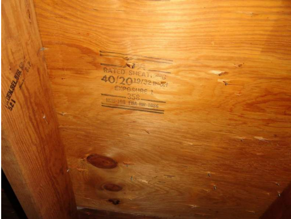
3. Roof Deck Attachment – 19/32" Plywood