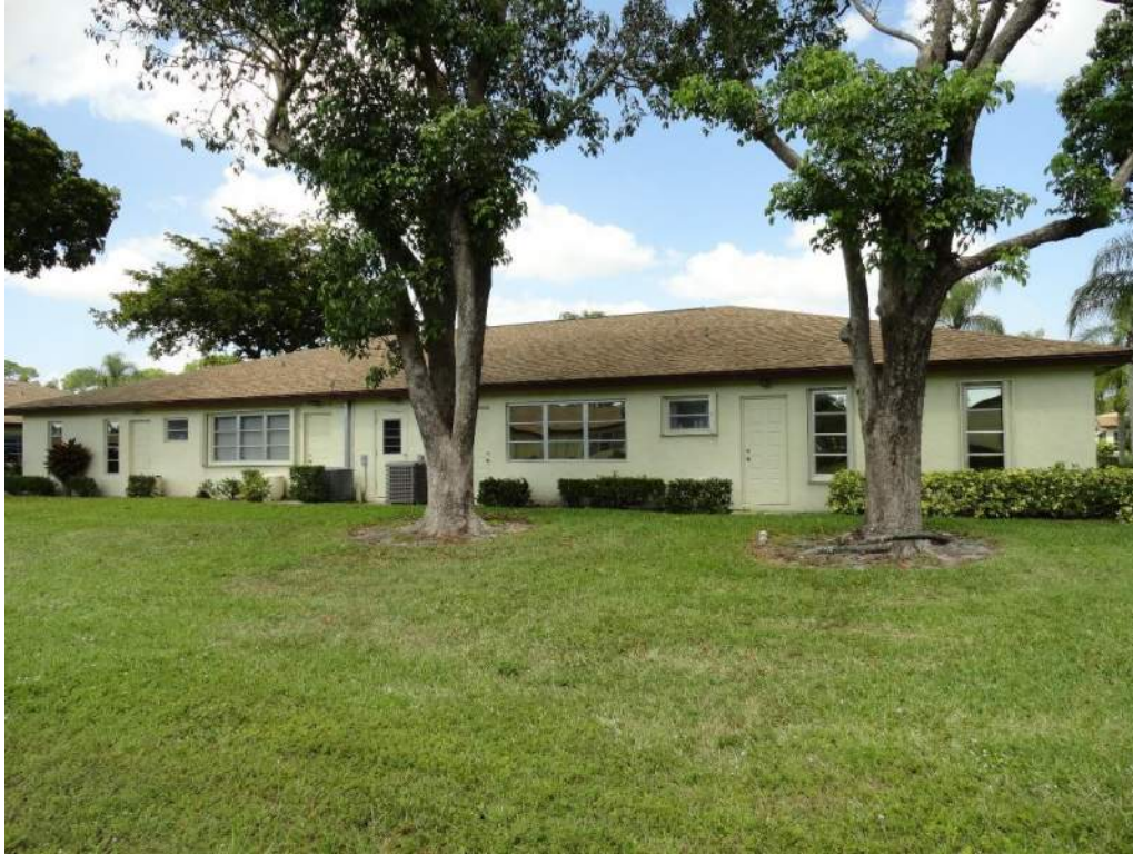
5. Roof Geometry – Rear Elevation – Hip