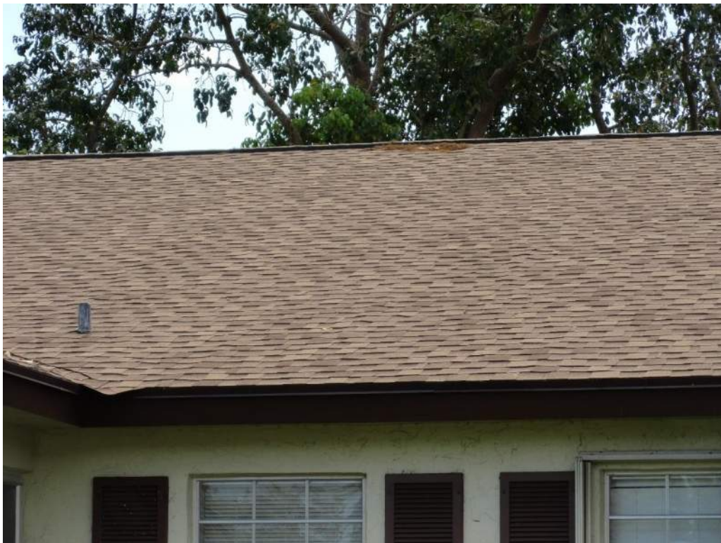
2. Roof Covering – Asphalt Shingles