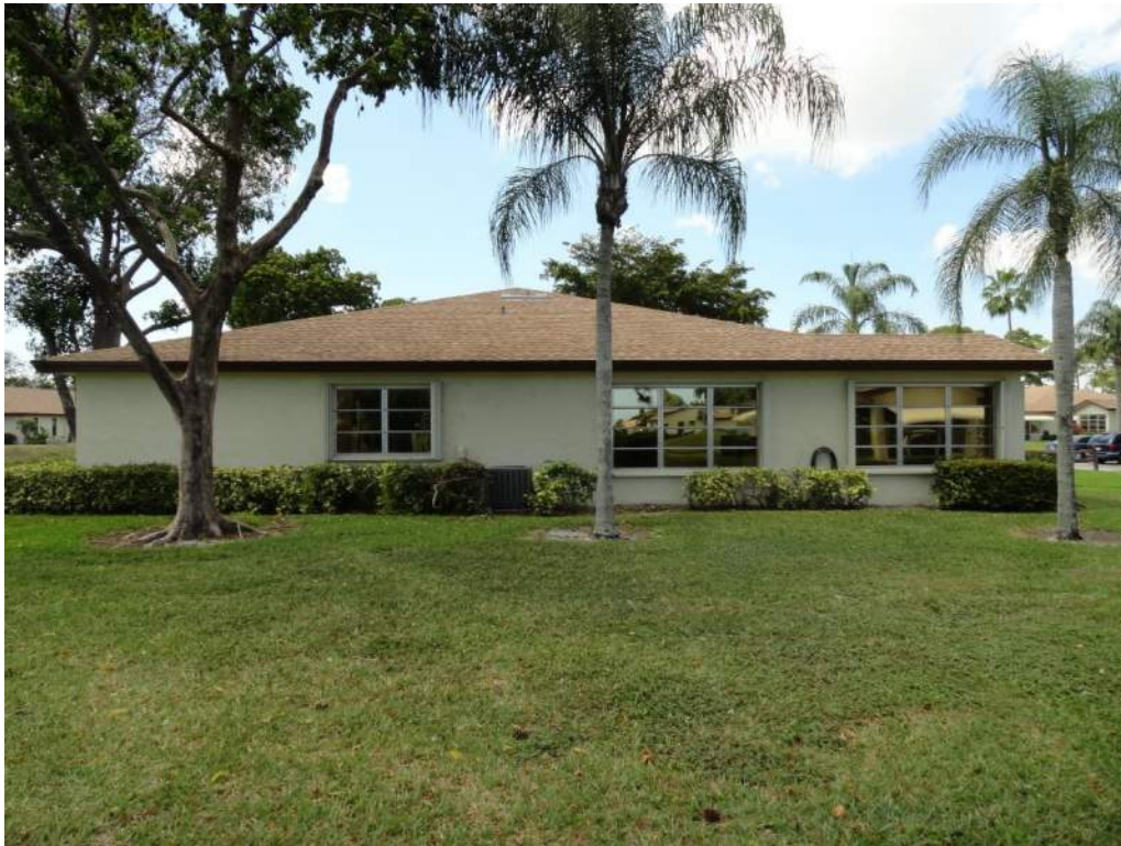
5. Roof Geometry – Left Elevation – Hip