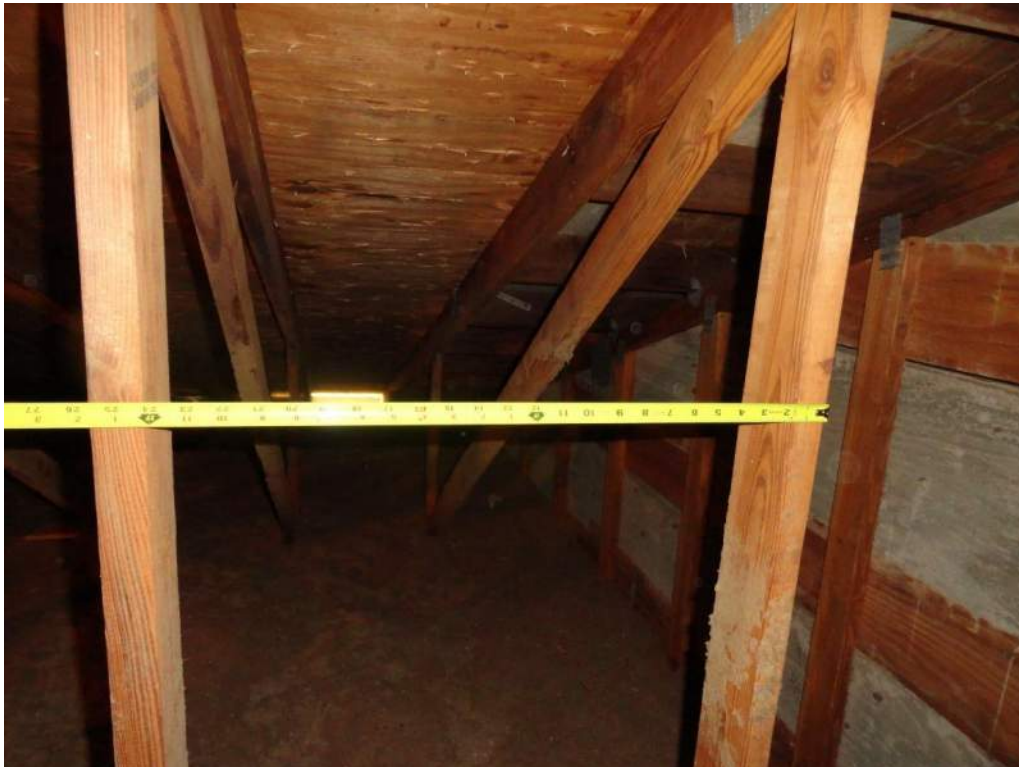
3. Roof Deck Attachment – Trusses at 24" O. C. Max.