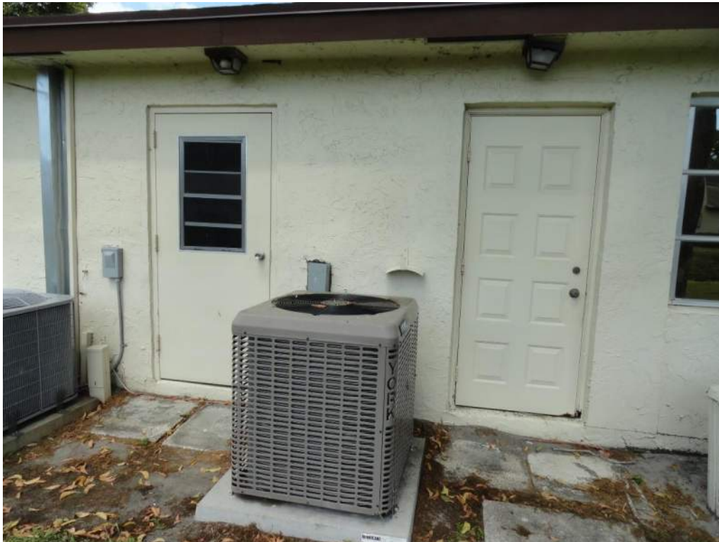
7. Opening Protection – Unprotected Unrated Unglazed Entry Door