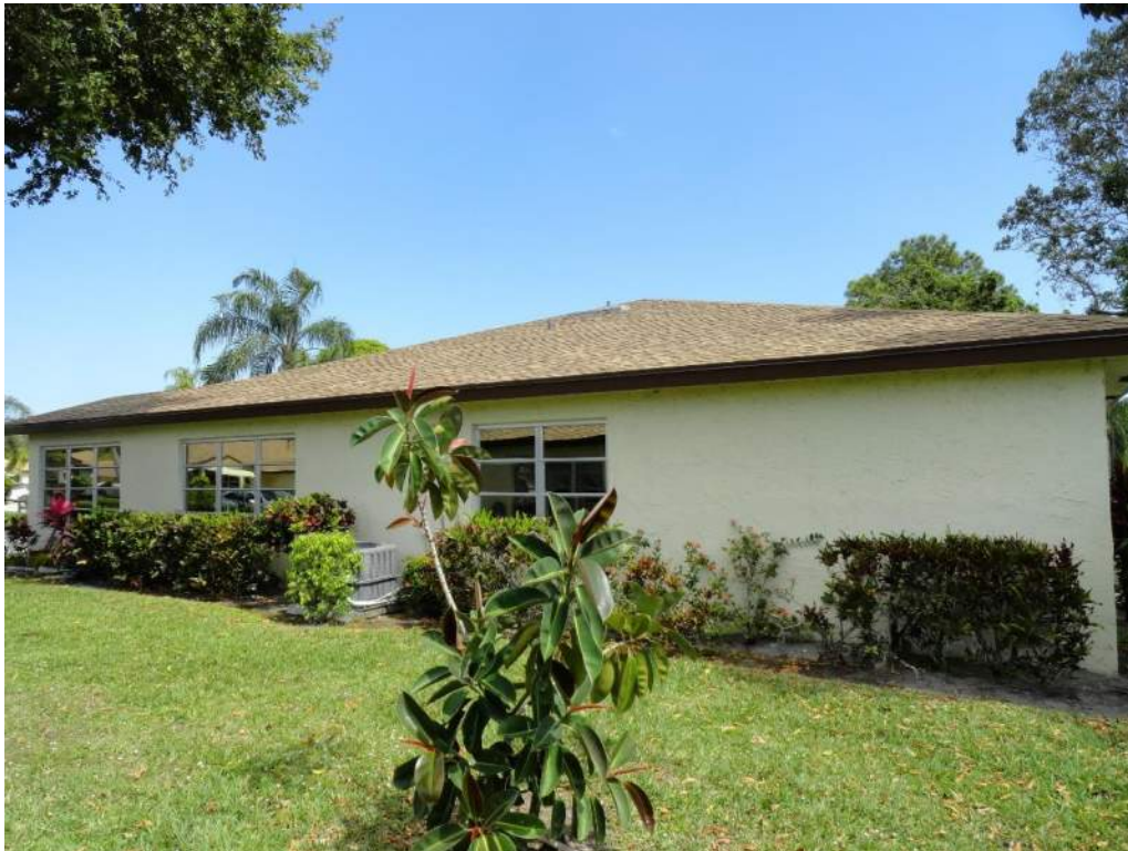
5. Roof Geometry – Right Elevation – Hip