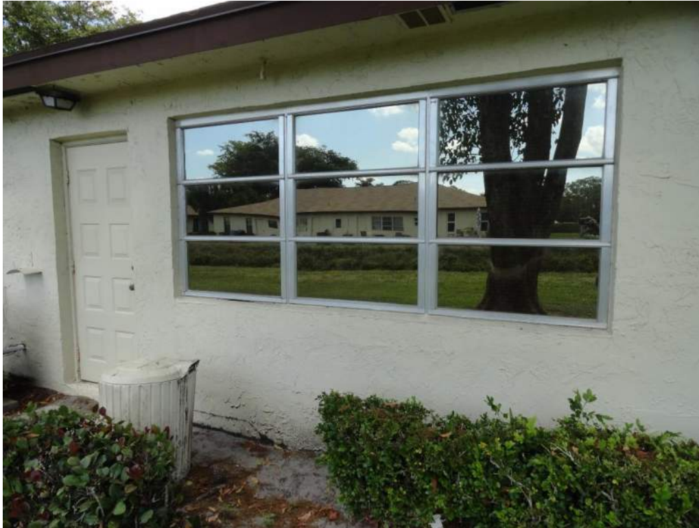
7. Opening Protection – Unrated Unprotected Windows