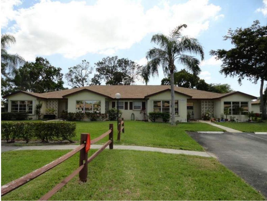
5. Roof Geometry – Front Elevation – Non-Hip