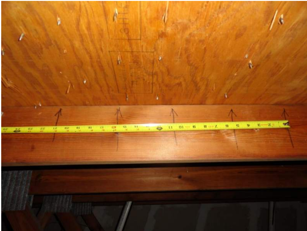
3. Roof Deck Attachment – Fasteners at 6" O. C. Max. In the Field